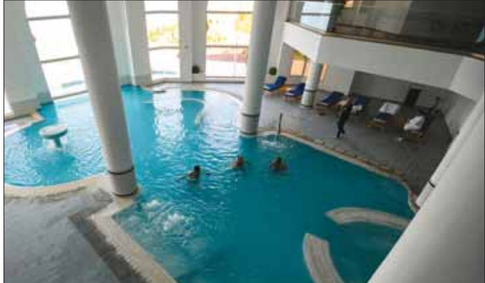
Guests bathe in a thermal pool at a spa in Korbous, in Tunisia's northeastern region of Nabl.

Today, Tunisia boasts 60 thalassotherapy centres and 390 spas, 84% of which are located in