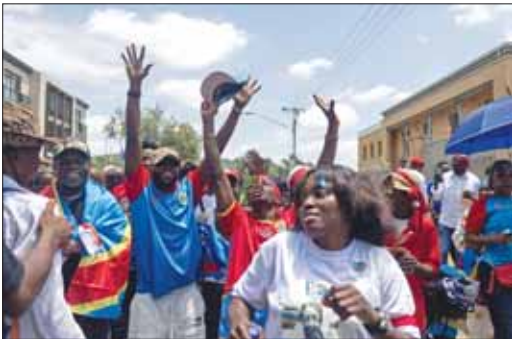
Protesters from the Congolese community living in South Africa march to the European Union Delegation to voice concern about issues regarding the recent conflict in Eastern Democratic Republic of Congo (DRC) in Pretoria, South Africa, yesterday.

With fears of a regional conflagration spiralling, the Kenyan presidency announced on Monday that Congolese President Felix Tshisekedi and Rwandan President Paul Kagame would attend a joint sum-