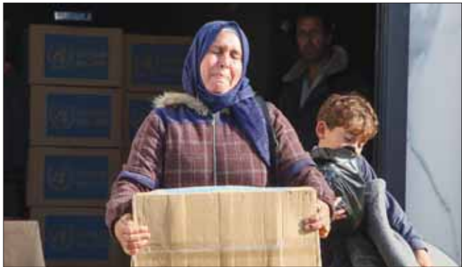
A Palestinian woman carries an aid box she received from an UNRWA distribution point, amid a ceasefire between Israel and Hamas, in Khan Younis in the southern Gaza Strip, yesterday.

"Large parts of the camp were completely destroyed in a series of detonations by the Israeli forces. It is estimated that 100 houses were destroyed or heav-