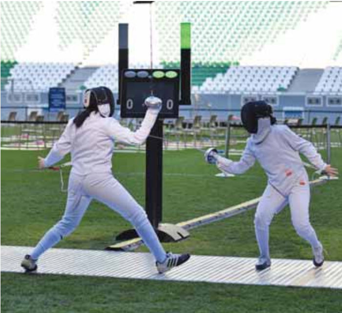
Aspiring Qatari fencers in action at the event yesterday.

versation on equality and the significance of sport.