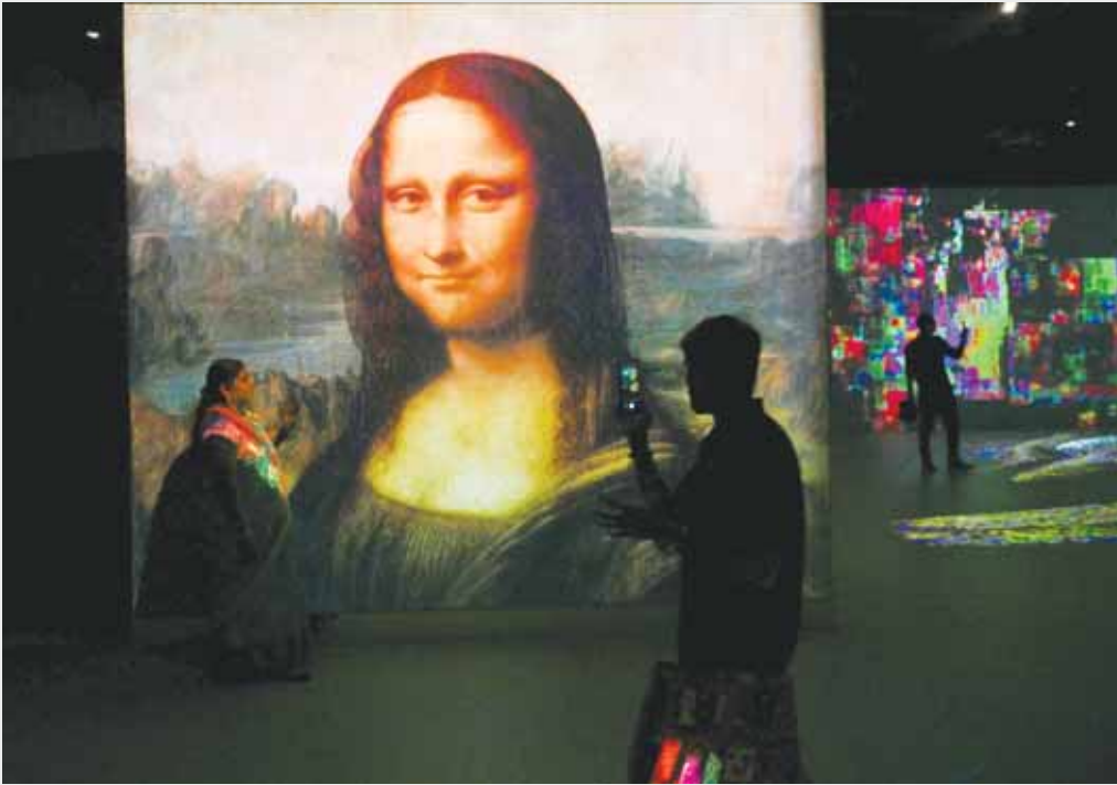
A visitor looks at an image of the famous painting Mona Lisa, while enjoying the interactive immersive experience art show Da Vinci Genius, delving into the life and work of Italian polymath Leonardo da Vinci in Mumbai.