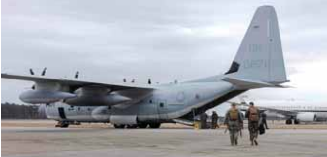
This image obtained from the US Department of Defence shows US Marines boarding a KC-130J Super Hercules at Marine Corps Air Station Cherry Point, North Carolina, as they deploy to Naval Station Guantanamo Bay in Cuba to support Migrant Holding Operations.

The Guantanamo prison was opened in the wake of the 9/11 attacks and has been used to indefinitely hold detainees seized