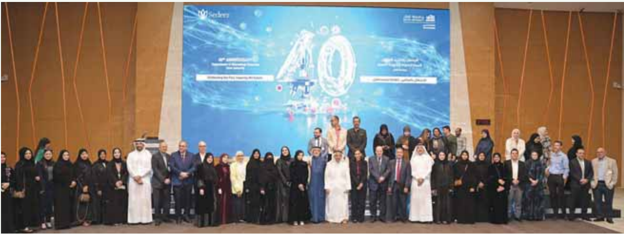
Guests and officials at the anniversary celebration.

“This achievement is a testament to the tremendous efforts invested in establishing and developing this programme over the years, as well as the dedication of faculty members, students, and graduates who have contributed to groundbreaking