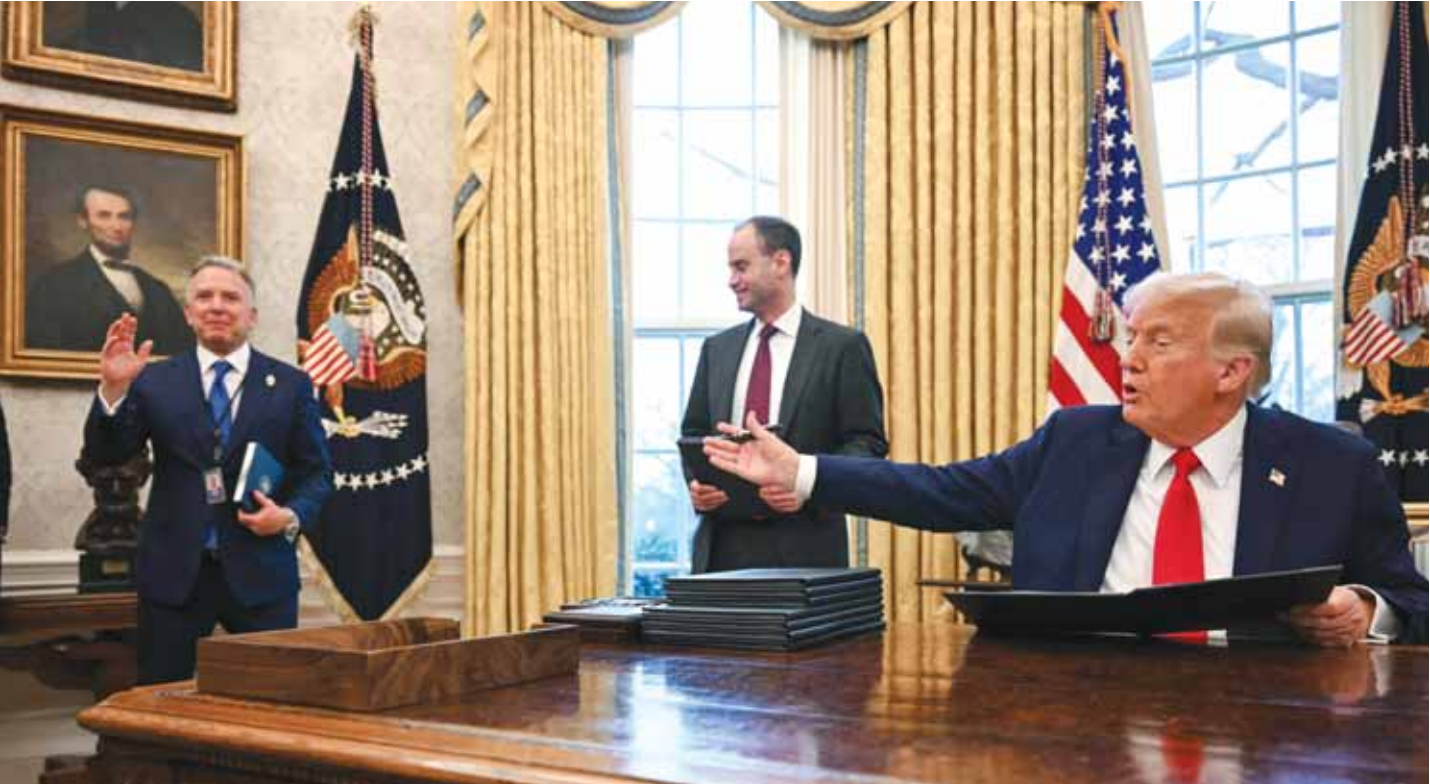
US President Donald Trump gestures to US Special Envoy to the Middle East Steve Witkoff (left) as he signs an executive order to create a US sovereign wealth fund, in the Oval Office of the White House, on Monday.

“It may take a little bit longer,” he said, but doing it in this way “will most likely lead to success at the Supreme Court.”