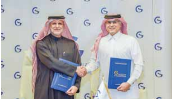
Dr Yousef bin Mohammed Alhorr and Nawaf bin Ibrahim al-Hamad al-Mana at the signing ceremony.

The Sustainable Construction Code serves as a vital intergovernmental tool, aiming to promote sustainable practices across a broad spectrum. It establishes a baseline set of green building criteria