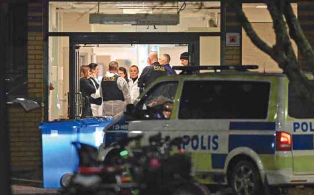
Police officers work at the scene of the Risbergska School in Orebro yesterday following reports of a serious violent crime.

open the door to her classroom just after lunch break and shouted to everyone to get out. “I took all my 15 students out into the hallway and we started running,” she told Reuters by phone. “Then I heard two shots but we made it out. We were close to the school entrance.” “I saw people dragging injured out, first one, then another. I realised it was very serious,” she said. A hospital spokesperson told Reuters that out of five patients admitted at the Orebro University Hospital, one had light injuries while four were operated on. Two of the latter were out of surgery and stable while one had serious injuries. Police said students had been kept indoors at the school that was targeted and at other schools nearby for their safety. Police later began evacuating those who had taken shelter. Sweden has been struggling with a wave of shootings and bombings caused by an endemic gang crime problem but fatal attacks at schools are rare. Ten people were killed in seven incidents of deadly violence at