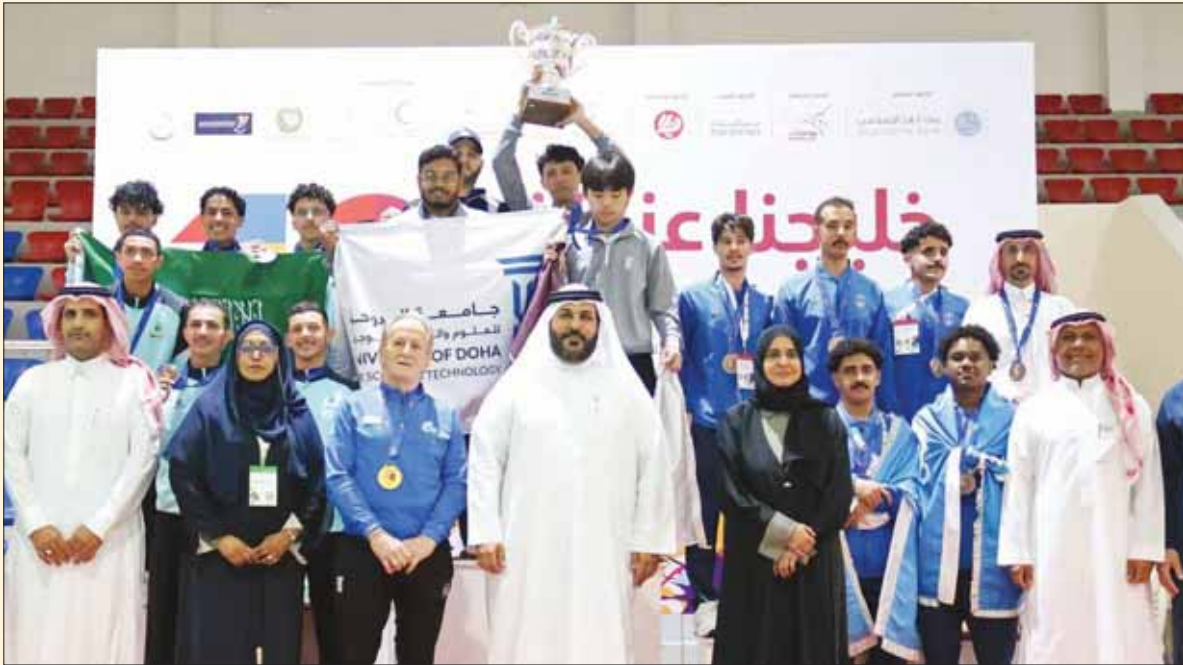
UDST earned third place overall in the tournament.

Teams from University of Doha for Science and Technology (UDST) have displayed outstanding performance at the 10th GCC Universities Sports Tournament held at Sultan Qaboos University, Oman.