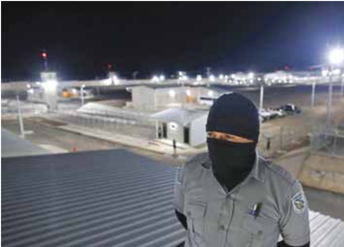
This file picture shows a prison warden at a prison sector, during a tour in the 'Terrorism Confinement Centre' prison complex, which according to El Salvador's President, Nayib Bukele, is designed to hold 40,000 inmates, in Tecoluca, El Salvador.

criminals who are US citizens or legal residents, Rubio said, although it was unclear whether the US would take up that offer.