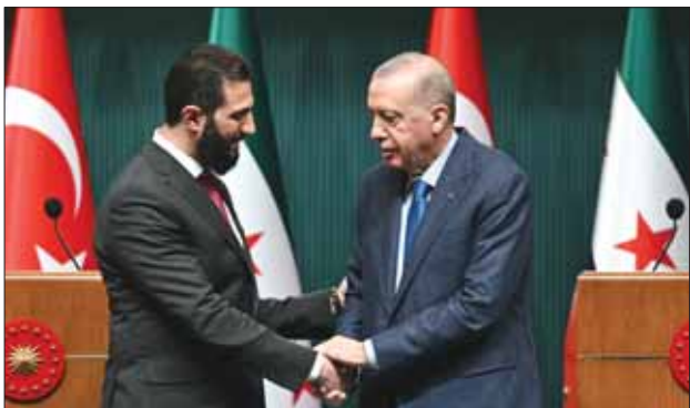
Turkish President Recep Tayyip Erdogan and Syria's interim president Ahmed al-Sharaa shake hands during a joint press conference following their meeting at the Presidential Palace in Ankara, yesterday.