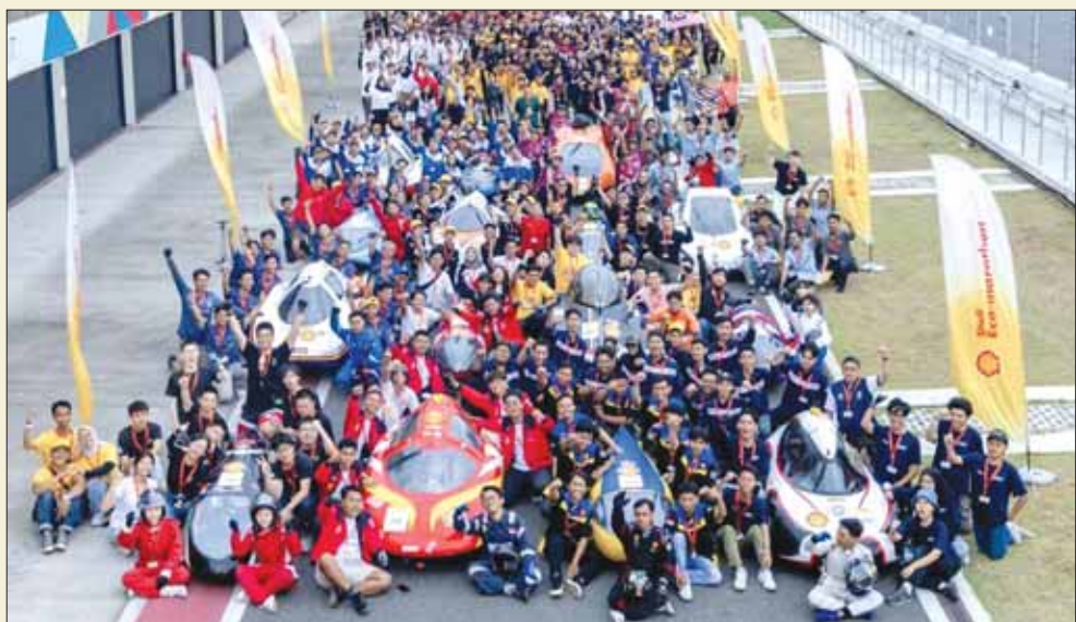
A group picture from Shell Eco-marathon Asia-Pacific and the Middle East 2024, held at Pertamina Mandalika International Street Circuit, Lombok, Indonesia.