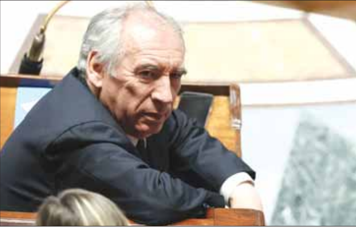
French Prime Minister Francois Bayrou attends a session of questions to the government at The National Assembly, France’s lower house parliament, in Paris yesterday.

vote adding while “it’s a bad budget... we need a budget”. “We need to avoid uncertainty because many of our fellow citizens... are extremely worried about possible long-term instability,” he said. Socialist leader Olivier Faure said his party decided against voting to topple the government over the budget, as it would only have resulted in France having “a prime minister further to the right”, or even “the resignation of a head of state”. “We chose to give France a budget,” he told the France Inter radio station. The move by the Socialists is a major boost for Bayrou that could mark the end of a broad left-wing alliance including the Socialists and LFI party that had endured since the election campaign. But in a symbolic move, the party leadership decided Monday to propose a separate no-confidence motion after Bayrou referred to migrants “flooding” France, using terminology previously used by the far right. However, this has little chance of passing as it is expected to be rejected by all right-wing parties. Bayrou’s predecessor Michel