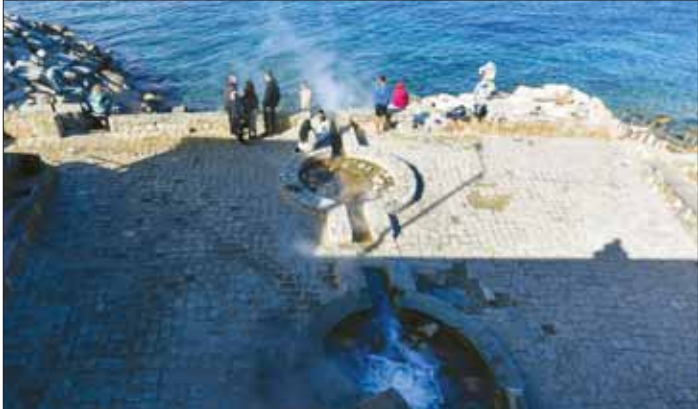
People visit Ain Atrous, a natural hot spring that flows into the sea in the thermal region of Korbous, in Tunisia's northeastern region of Nabl.

Thalassotherapy is an "ancestral heritage" for Tunisians, "since