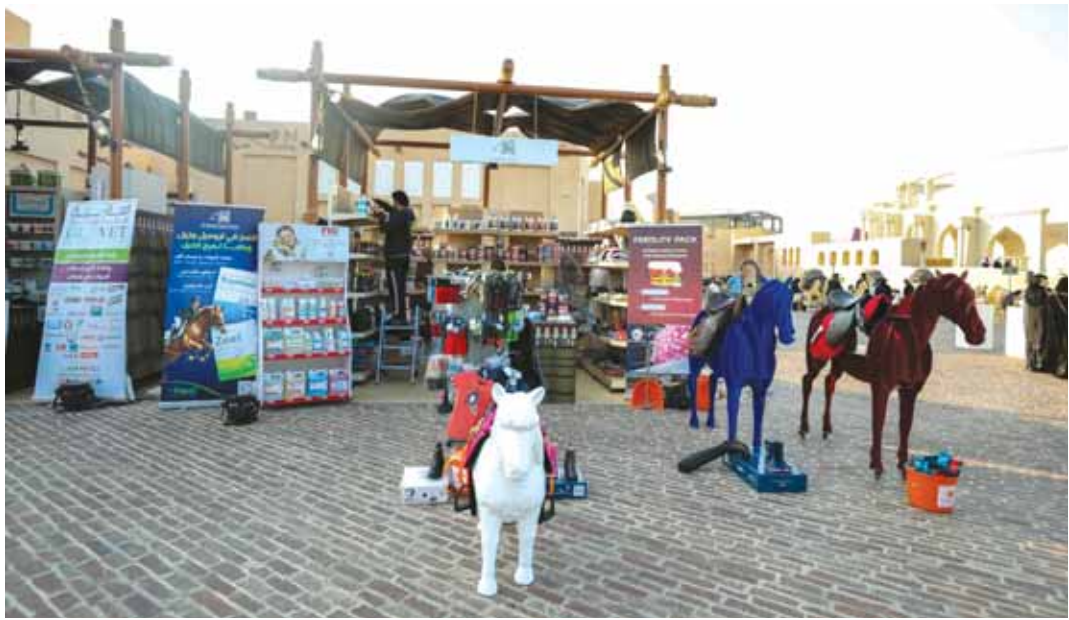
Snapshots from the festival.