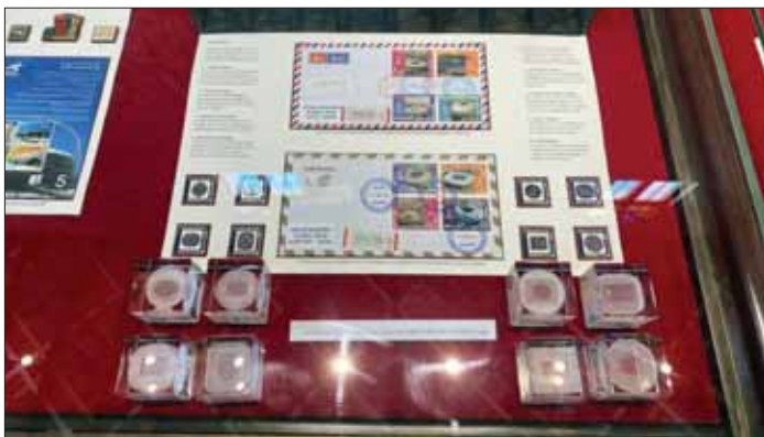
A view from the exhibition.

The Qatar Philatelic and Numismatic Center aims to sponsor and spread the hobby of stamp and numismatic collecting. The centre also aspires to advance it, provide conditions for its members to practice this hobby and to develop it by all means and methods, and to encourage amateurs to participate in exhibitions.