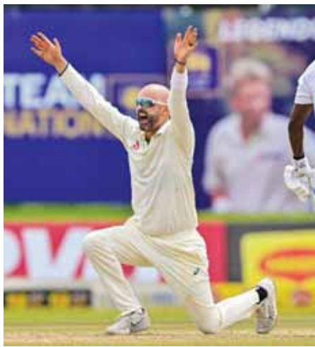
great team, to make sure we go 2-0 up," he told reporters.

"It's about us on our journey to becoming a