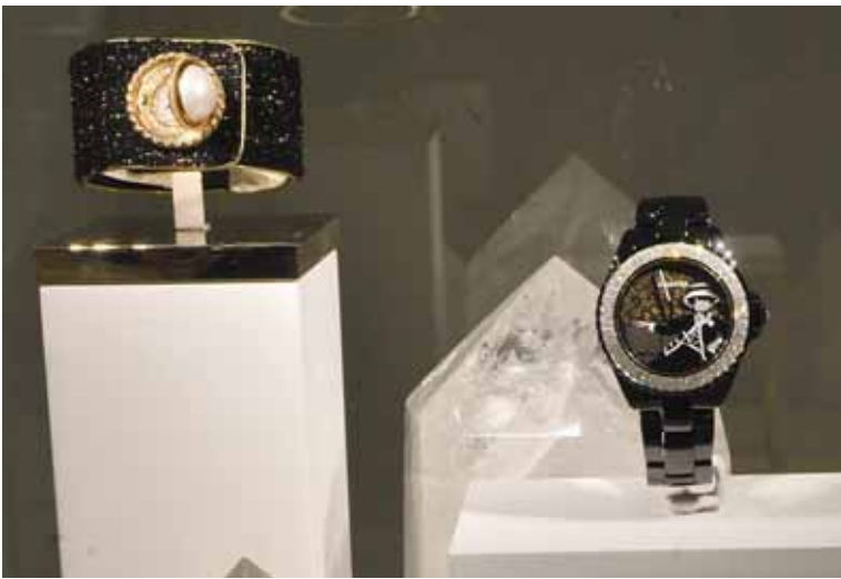
Iconic CHANEL collections on display.