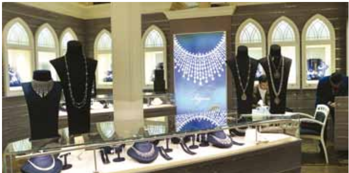
Almuftah Jewellery is featuring luxurious watches and jewellery brands at the ongoing DJWE 2025.

Among the highlights is Sarcar which offers limitless personalisa-