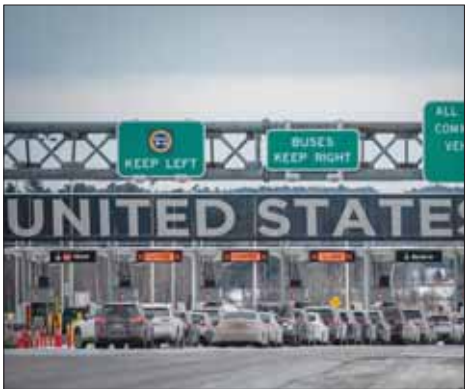
Cars wait in line to enter the United States at a border crossing at the Canada-US border in Blackpool, Quebec, Canada, yesterday.

Critics said that the moves against the three largest US trading partners will hurt Americans by driving prices higher and slowing global growth. Trump defended his decision on social media. "The USA has major deficits with Canada, Mexico, and China (and almost all countries!), owes 36