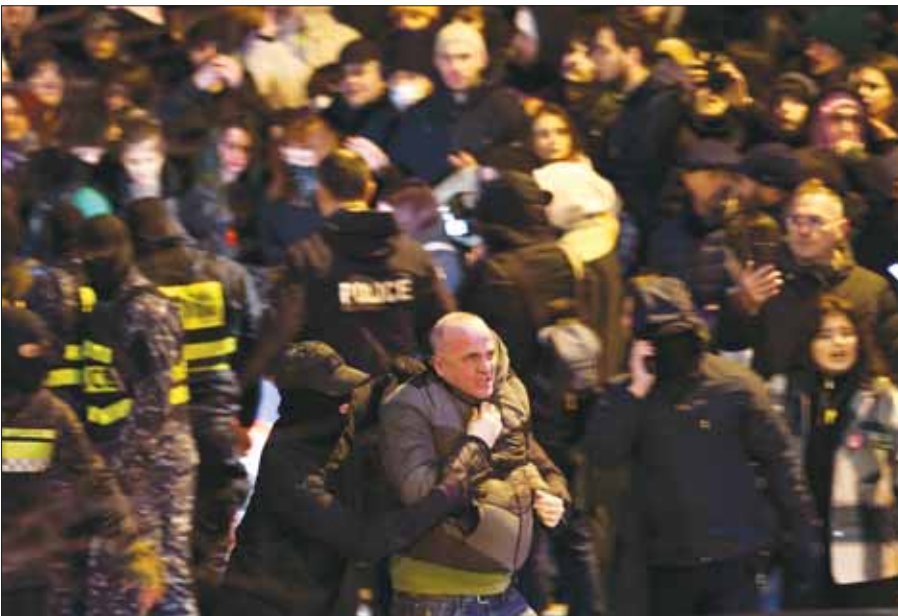
Georgian police detain a protester as anti-government demonstrators attempt to block a highway entrance to the capital Tbilisi yesterday. (AFP)

in a trade war. Chinese officials have also been encouraged by signs Trump could be seeking a more nuanced relationship with China since a conversation he had with Chinese leader Xi Jinping last month. Both Republicans and Democrats have come to view China as the biggest foreign policy and economic challenge to the United States. China's massive trade surplus — almost $1tn last year — is a vulnerability for Beijing. China's exports in key industries, including autos, have been growing faster in volume than value, suggesting manufacturers are discounting to try to win overseas sales when demand at home has been sputtering.