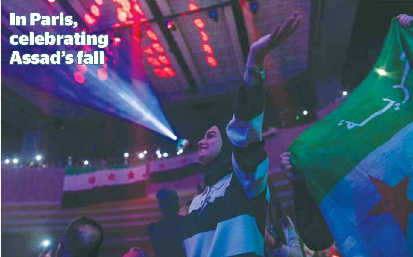
A Syrian girl reacts as she attends an evening party to celebrate the fall of Assad’s regime in Syria at the Maison de la Mutualite in Paris.

To Advertise gtadv@gulf-times.com Display 44466621 44418811 Classified 44466609 44418811 gtcad@gulf-times.com Subscription circulation@gulf-times.com