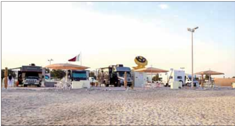
Seaside of the 'Motor Home' beach.

He pointed out that requests are received on the hotline 16066, where those wishing to visit the beach are referred to the person authorised to carry out that task, and then the date of arrival at the beach and the date of departure are determined so that the place is prepared for them, noting that the beach is open to the citizens of the Gulf Co-operation Council countries.