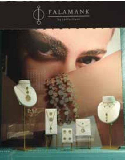
Left: Some pieces from the Falamank collection.