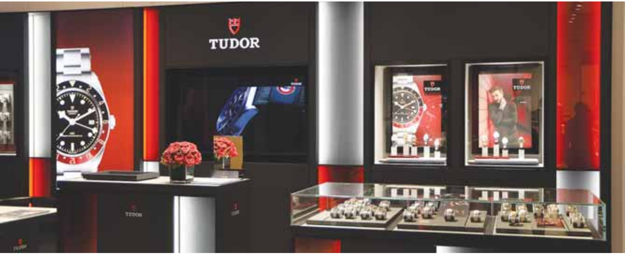
A TUDOR showcase at the Fifty One East pavilion at the DJWE 2025.

Genesis spotlights their latest Baroque and Trill collections, redefining pearl jewellery with innovative designs.