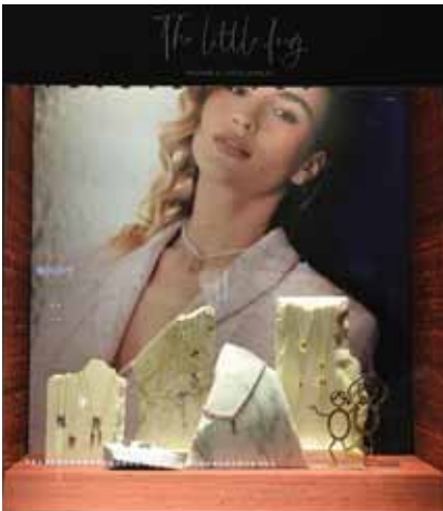
The Little Frog

Fifty One East pavilion is hosting some of the leading global luxury brands at the ongoing Doha Jewellery and Watches Exhibition (DJWE) 2025 at the Doha Exhibition and Convention Centre.