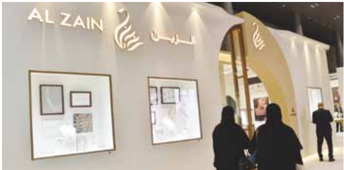
Al Zain Jewellery is known for its unique collections that include classic Arabic pieces embodying gold, diamonds and pearls with elements of Arab architecture.