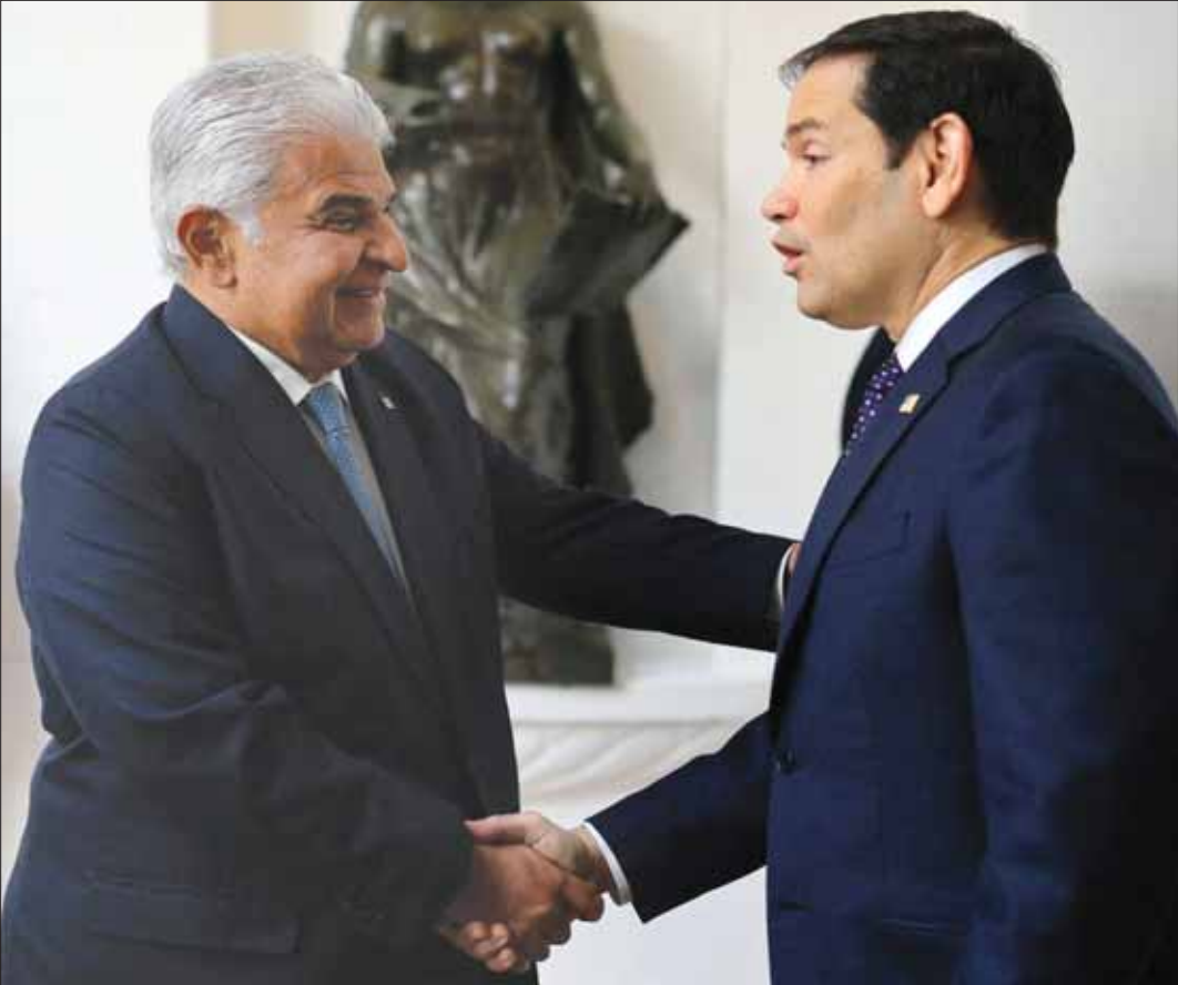
Panama's President Jose Raul Mulino (left) greeting US Secretary of State Marco Rubio on arrival at the presidential palace in Panama City yesterday.

built by the United States at the cost of thousands of lives of labourers, mostly people of African descent from Barbados, Jamaica and elsewhere in the Caribbean. The United States maintained control of the canal when it opened in 1914 but began to negotiate following deadly riots in 1964 by Panamanians angered over foreign control. Jimmy Carter sealed the agreement that gave the canal to Panama at the end of 1999, with the late president seeing a moral imperative for the United States to respect a smaller but still sovereign country. Trump takes a vastly different view and has returned to the "big stick" approach of the early 20th century, in which the United States threatened force to have its way, especially in Latin America. In his first week in office, Trump prepared massive tariffs on Colombia to force the US ally to take back deported citizens on military planes, after the country's leftist president complained that they were not being treated in a dignified way. Just as Rubio started his trip, Trump signed off on sanctions on the top three US trading partners — Canada, Mexico and China — and told Canada it should be the 51st US state. Rubio, the first Hispanic secretary of state and a devout Catholic, started yesterday in Panama City attending Mass at a church