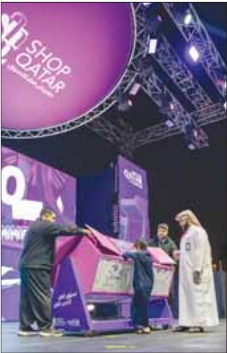
The lucky draw in progress at Shop Qatar 2025 closing ceremony.

The celebrations also included a unique competition sponsored by Al Ahli Bank, where 10 winners received QR1,000 each. To Page 2