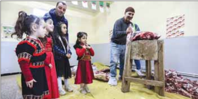
Children dressed in traditional outfits watch as men prepare portions of meat as part of Algeria's Tamechrit, based on the Amazigh New Year's traditions, in Bajaia.

In a village nestled in the mountains of northeastern Algeria, locals and visitors gathered under a cold winter sky to celebrate Tamechrit, a centuries-old Berber tradition rooted in sharing. Seeking to preserve a practice that faded during the Algerian civil war of the 1990s, villagers marked Tamechrit with Berber music and food on the occasion coinciding in January with the Amazigh new year. The minority community of Berbers refer to themselves as the Amazigh, meaning “free people”. They have long fought for recognition for their ancient culture and language in modern states across North Africa. Berbers are descendants of pre-Arab North Africans, whose historic homelands stretched from the Canary Isles and Morocco to the deserts of western Egypt. “We hope to perpetuate this tradition during cultural or religious festivals,” bringing together different people from the village and even those who have left, Dahmane Barbacha, a 41-year-old from Ath Atig village, told AFP. Children wore temporary Amazigh face paintings at the event that dates back to the 13th century, according to historian Saleh Ahmed Baroudi.