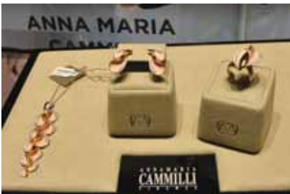
Below: Pieces from Annamaria Cammilli.