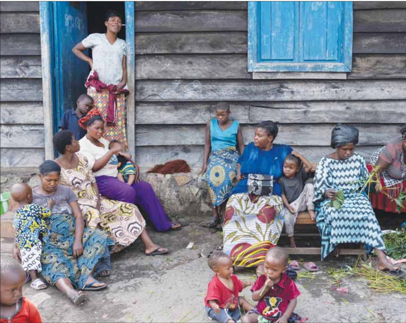
Displaced people from Sake gather in front of a room where they are taking refuge with their families, following the intensification of fighting between M23 rebels and the Congolese army, in Goma, North Kivu province, in eastern DR Congo, yesterday.