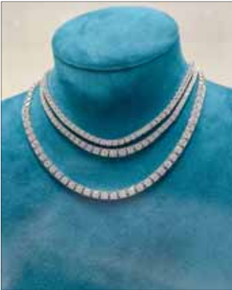
Explore the grand reveal of Solevre and witness the beginning of a new chapter in fine jewellery.