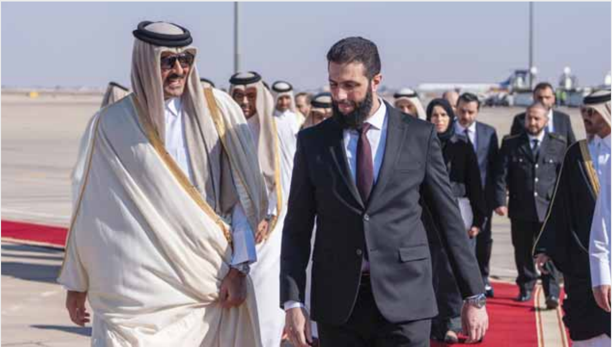
His Highness the Amir Sheikh Tamim bin Hamad al-Thani being received by Syrian President Ahmed al-Sharaa upon arrival yesterday in Damascus, on an official visit. His Highness the Amir and his accompanying delegation were seen off upon departure at Damascus International Airport by al-Sharaa later in the day.