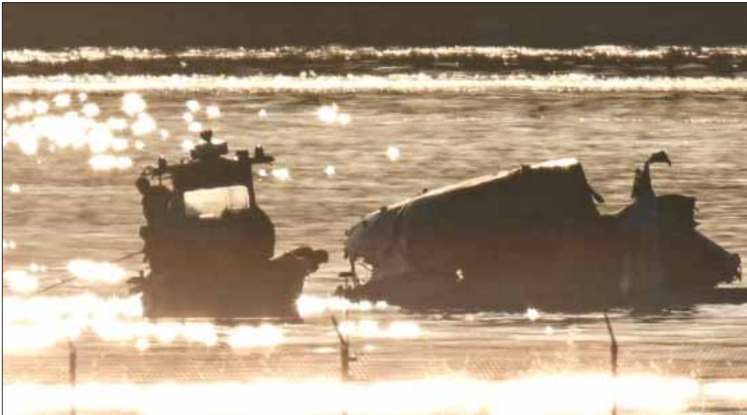
Part of the wreckage is seen as rescue crews search the waters of the Potomac River after a passenger plane on approach to Reagan National Airport crashed into the river after colliding with a US Army helicopter, near Washington, DC, yesterday.

Airspace is frequently crowded in the US capital region, home to three commercial airports and several major military facilities, and officials have raised concerns about busy runways at Reagan National Airport, just across the river from Washington. There have been several near-miss incidents