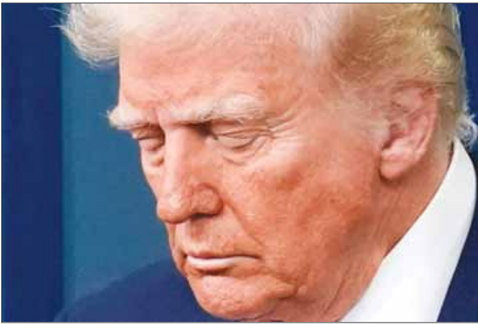
US President Donald Trump pauses for a moment of silence to recognise crash victims as he speaks to reporters about the deadly midair collision.

"PAT25, do you have a CRJ in sight? PAT25, pass behind the