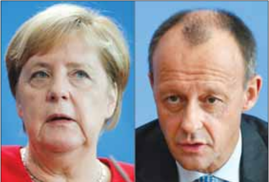
DIFFERENCE OF OPINION: Angela Merkel (left) and Friedrich Merz.

tone and on the basis of applicable European law”. CDU General Secretary Carsten Linnemann defended Merz, telling the Rheinische Post newspaper that “we value Angela Merkel and know her assessment of migration policy”. But he added that “those who carry responsibility today must react to the current security situation and the terrible events”, also mentioning a deadly car-ramming at a Christmas market in December. Veteran Merkel’s criticism of long-time party rival Merz for breaching the parliamentary taboo comes as the campaign heats up towards February 23 elections. The CDU-CSU bloc of Merz is in the lead, polling at around 30%, followed by the AfD at 20% and then Scholz’s SPD at around 15%. The AfD has gained support by voicing fears about a migrant influx and a series of attacks that also included deadly stabbings last year where a Syrian and an Afghan man were arrested. Merz has criticised Merkel’s migration policy and pledged an about-turn, vowing permanent policing on all borders and the rejection of all migrants trying to enter Germany through irregular channels. Another parliament vote looms Friday, when the CDU will present a bill to restrict asylum rights and boost border police powers, and where it will also seek backing by the AfD and the smaller FDP and BSW parties. It remains to be seen if Merz’s gamble will end up benefiting him, or the AfD. The AfD and its allies