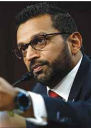
Kash Patel testifies during his confirmation hearing before the Senate Judiciary Committee in the Dirksen Senate Office Building yesterday in Washington, DC.

olence against law enforcement," Patel said. "I do not agree with the commutation of any sentence of any individual that committed violence against law enforcement."