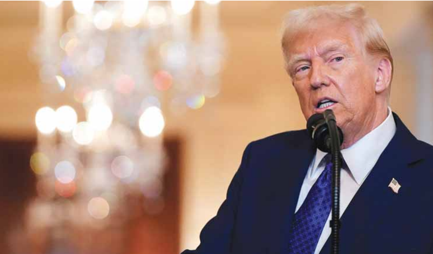
US President Donald Trump speaks at an event to sign the Laken Riley Act, legislation requiring the detention of immigrants living in the US illegally who are accused of theft, at the White House, in Washington, on Wednesday.