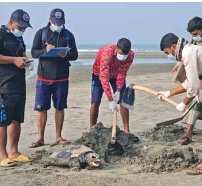
Marine rescuers prepare to bury a dead olive ridley sea turtle at a beach in Cox's Bazar.

“Turtles float on the water to breathe, but once they get entan-