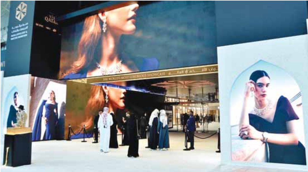
The 21st edition of the DJWE will run until February 5 at the Doha Exhibition and Convention Centre.