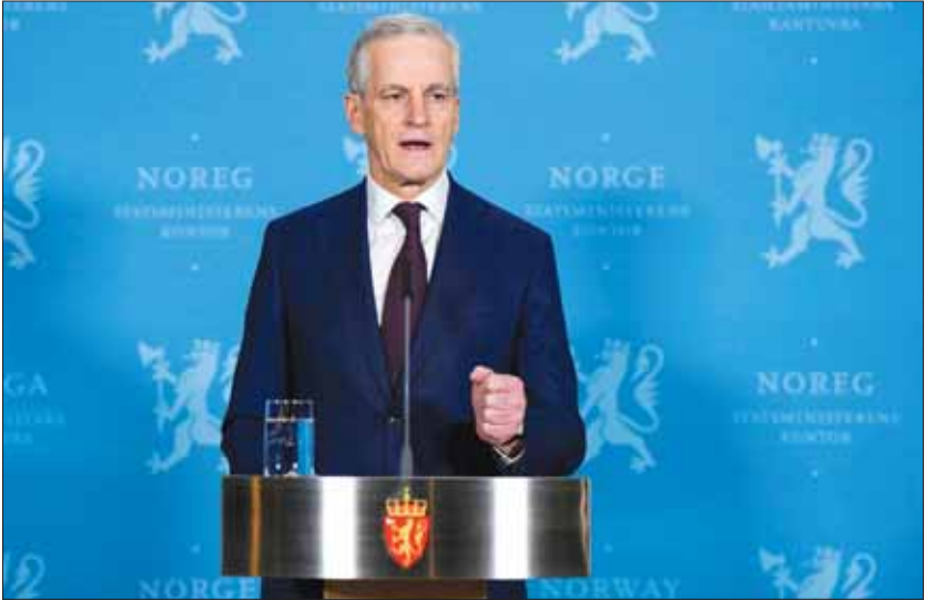
Norwegian Prime Minister Jonas Gahr Store addresses a press conference at the Prime Minister’s Office in Oslo yesterday after it became clear that the Centre Party is breaking off the government co-operation with the Labour Party.

Norway’s eurosceptic Centre Party quit the government yesterday in a dispute over the adoption of European Union energy policies, leaving the centre-left Labour Party to rule alone eight months before an election. The announcement by Finance Minister Trygve Slagsvold Vedum deprives Prime Minister Jonas Gahr Stoere of his only coalition partner and eight of the 20 members of his cabinet, including the defence, finance and justice ministers. Labour, which has held power since 2021, could now govern alone until the next election is held in September but it lacks a majority in parliament and trails right-wing parties in opinion polls. Nato member Norway is not part of the European Union but Labour wants to maintain good relations with the EU, partly because of the threat of a trade war between Europe and the United States. “It would create doubt about the credibility of the agreement (with the EU) at a time when it is more important ever, in my opinion,” Stoere told a press conference. Labour wants to adopt EU directives on renewable energy consumption, energy performance in buildings and increased overall energy efficiency, government ministers have said. The Centre Party opposes all three directives, which it says will erode Norwegian autonomy, and has long said power and gas exporter Norway should instead seek to reclaim authority over regulation from the EU. “The conclusion for us is that the Centre Party does not want to be part of this