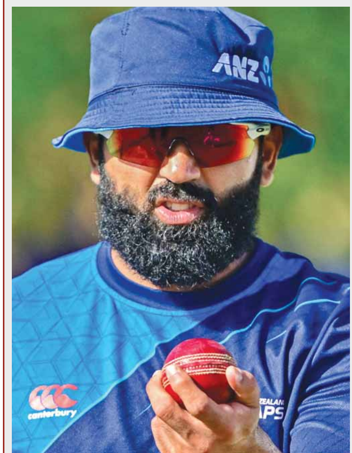
New Zealand's Ajaz Patel attends a practice session on the eve of their second Test against Sri Lanka at the Galle International Cricket Stadium in Galle yesterday. In the first Test last week at the same venue, Sri Lanka's spinners, led by Prabath Jayasuriya, dominated New Zealand's batsmen. Despite a determined century from Rachin Ravindra, New Zealand's batting lineup succumbed to Sri Lanka's disciplined bowling, resulting in a comfortable victory for the hosts. This win gave Sri Lanka a 1-0 lead in the two-Test series.