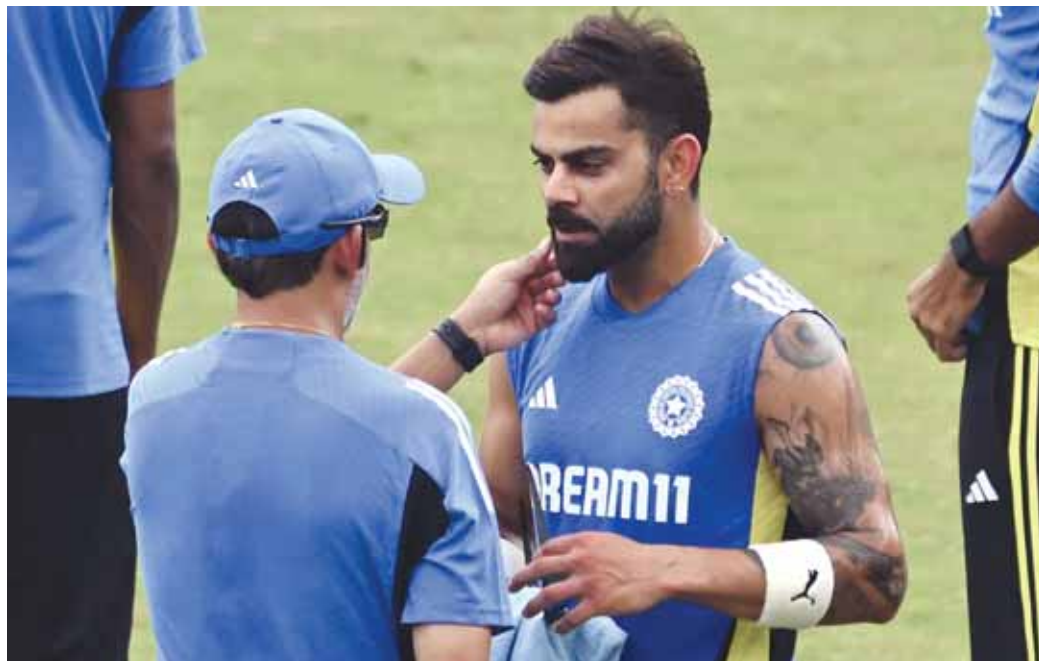
India's head coach Gautam Gambhir (left) speaks with Virat Kohli during a practice session at the Green Park Cricket Stadium in Kanpur ahead of their second Test against Bangladesh.

"I'm not upset about his performance, but our overall per-