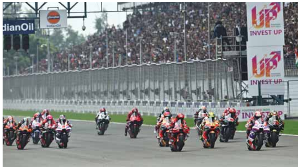
A view of the start of a Indian Grand Prix at the Buddh International Circuit in India.

2020 after an eight-year absence and has been held at the Algarve International Circuit since.