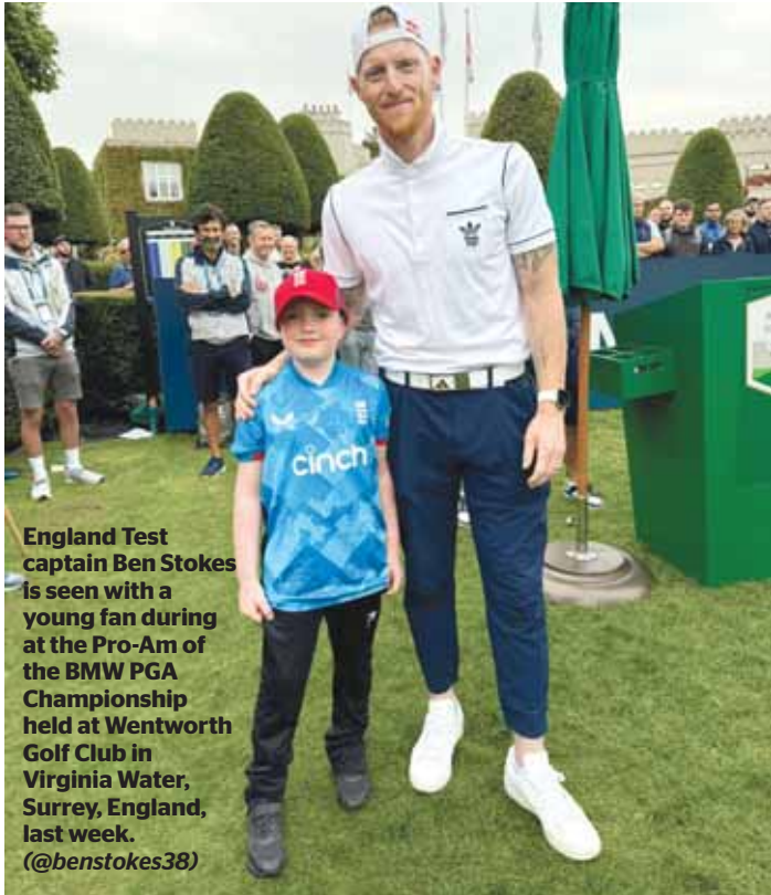
England Test captain Ben Stokes is seen with a young fan during the Pro-Am of the BMW PGA Championship held at Wentworth Golf Club in Virginia Water, Surrey, England, last week.