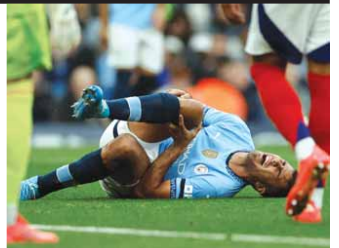
Rodri could miss the rest of the season.

Rodri had already had a frustrating start to the season, missing City's first four games, including the Community Shield, after suffering a hamstring injury.