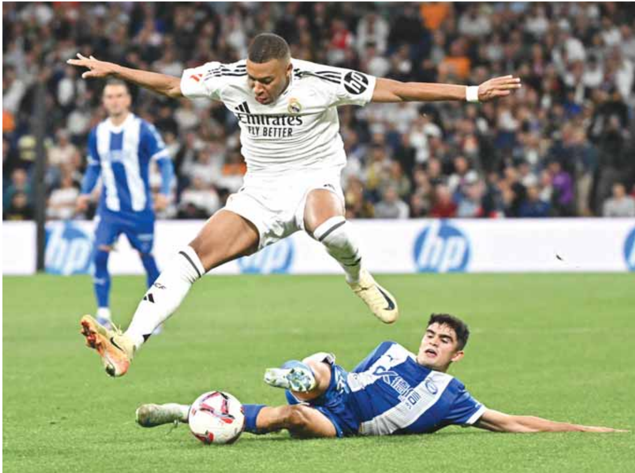
Real Madrid's French Kylian Mbappe jumps for the ball during the La Liga match against Deportivo Alaves at the Santiago Bernabeu stadium in Madrid on Tuesday night.

the start in what was a hugely uneven contest for most of the game, despite the Basque side's solid start to the season. Ancelotti brought Vinicius Junior back into the starting line-up and gave Vazquez a rare start and the pair combined inside the first minute. The Brazilian winger surged in from the left flank and cut the ball back for a simple finish from Vazquez.