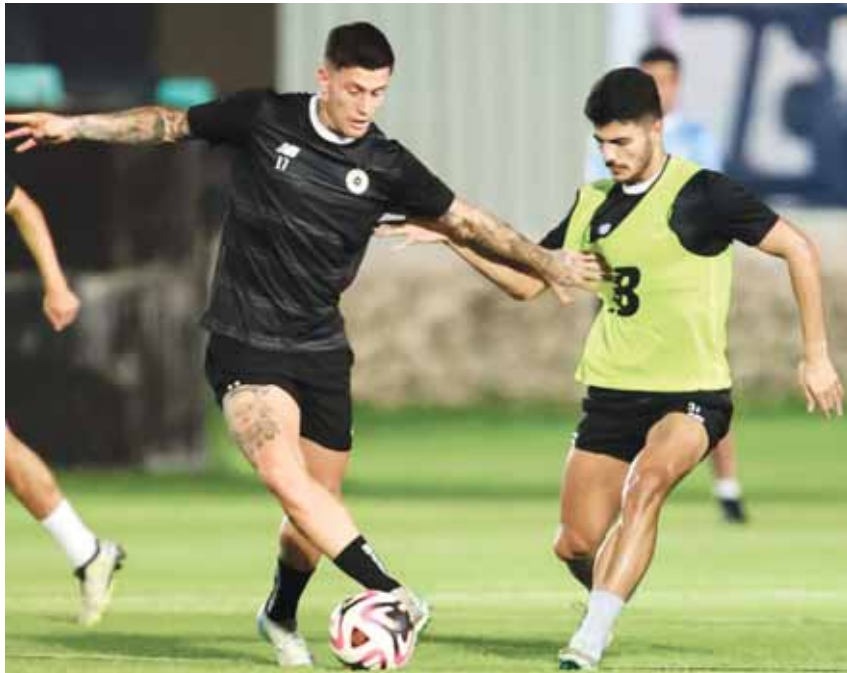
Al Sadd (left) and Al Gharafa players at a training session yesterday, on the eve of their Ooredoo Stars League match at the Jassim Bin Hamad Stadium.