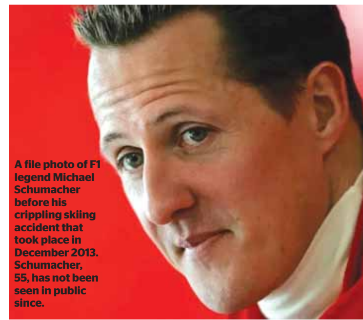
A file photo of F1 legend Michael Schumacher before his crippling skiing accident that took place in December 2013. Schumacher, 55, has not been seen in public since.

Swiss investigators traced the plot to Germany through the phone number used to call the family.