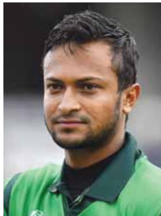
Shakib Al Hasan. I am sure he also thinks he can perform better. We all know what he is capable of," Hathurusinghe said.