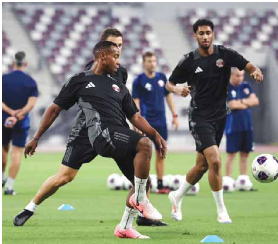
Qatar players train at the Khalifa International Stadium.