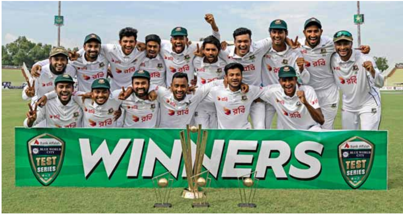
Bangladesh's players celebrate with the trophy after winning the second and last Test against Pakistan at the Rawalpindi Cricket Stadium in Rawalpindi yesterday.

Skipper Najmul described the series win as momentous moment for a country