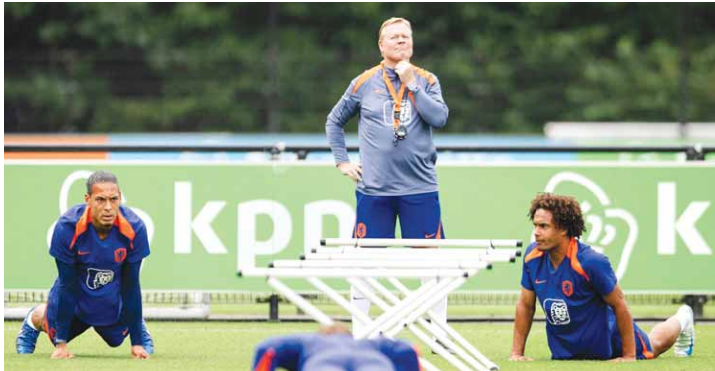
Netherlands' coach Ronald Koeman (centre) looks on as defender Virgil van Dijk (left) and forward Joshua Zirkzee train yesterday.

Coach says door is shut on Bergwijn following his move to Saudi