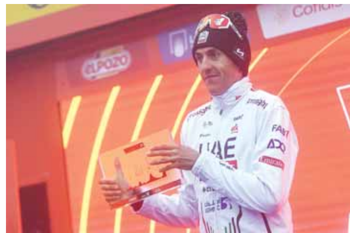
Team UAE's Marc Soler celebrates on the podium after winning stage 16 of the Vuelta a Espana, a 181.5km race between Luanco and Lagos de Covadonga, yesterday.

Despite getting back on his bike he pulled up shortly after, nursing his knee sitting on the bonnet of his Visma team car.