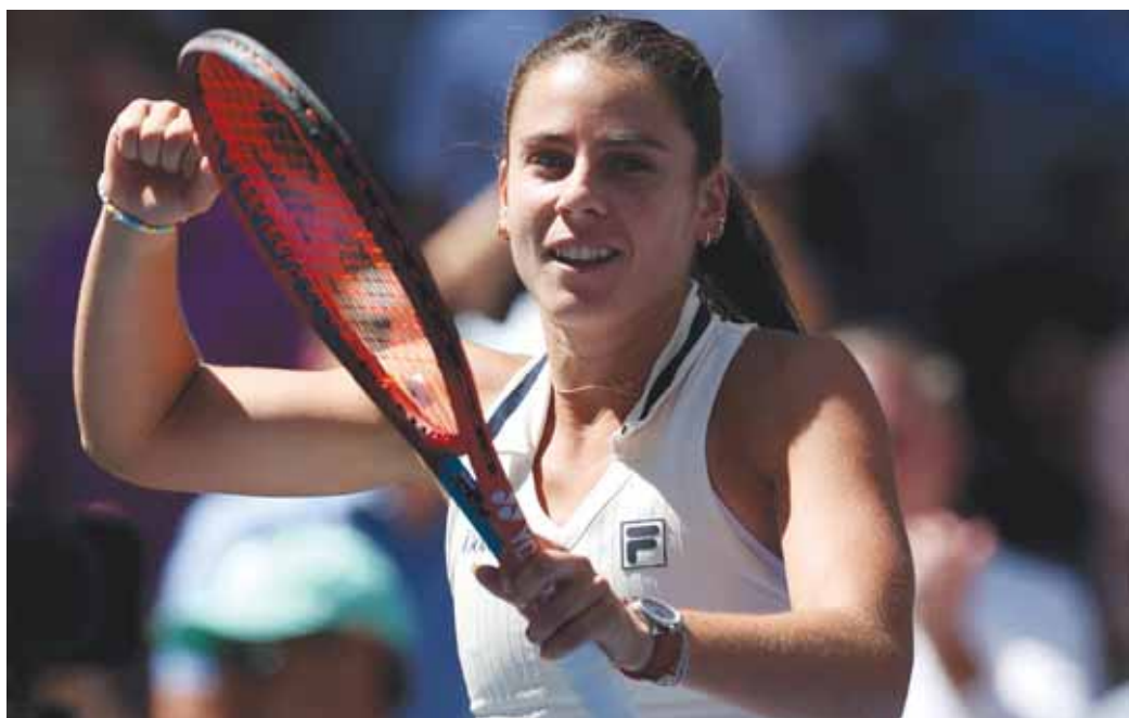
Emma Navarro of the United States celebrates after defeating Paula Badosa of Spain in the US Open quarter-final at USTA Billie Jean King National Tennis Center yesterday.

The 26th seed, whose US Open lead-up included a title in Washington and run to the semi-finals at Cincinnati, twice failed to serve out the set while Navarro twice held to love to pull ahead before closing out the match with her fifth break. "After I got it back to