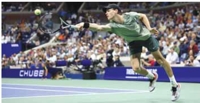
Jannik Sinner returns a shot against Tommy Paul during their fourth round match.

5-2 I kind of had a little bit of an inkling that it might be two sets and I just wanted to stay really tough and stick in there," said Navarro. "Even if I did lose the second set I wanted to kind of set the tone for the third set. So yeah, just really happy with my performance today and crazy to be moving on to the semi-finals, US Open baby!"