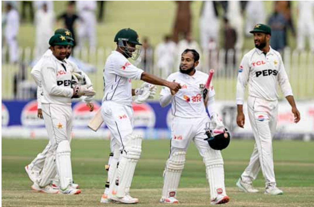
Bangladesh's Mushfiqur Rahim (second right) and Shakib Al Hasan (third right) celebrate after their team's win in the second Test against Pakistan at the Rawalpindi Cricket Stadium in Rawalpindi yesterday.

an away two-match Test series starting from September 18.