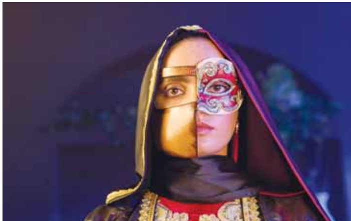
'The Bridge' symbolises the fusion of the traditional Venetian carnival mask and the Qatari 'battoulah'.