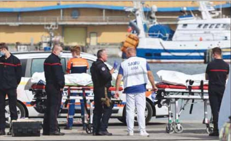
Firefighters, a police officer and a doctor of the SAMU emergency unit stand next to bags containing the bodies of migrants who died after the sinking of a migrant boat attempting to cross the English Channel to England, in Boulogne-sur-Mer, northern France, yesterday.

and France’s President Emmanuel Macron had earlier this summer pledged to strengthen “co-operation” in handling the surge in undocumented migrant numbers. But on Monday alone, 351 migrants crossed in small boats, with 21,615 making the journey this year, according to UK government statistics. The crossing often proves perilous, and in November 2021, 27 migrants died when their boat capsized in the deadliest single such disaster to date. French authorities seek to stop migrants taking to the water but do not intervene once they are afloat except for rescue purposes, citing safety concerns. Darmanin, who rushed to the site of the tragedy yesterday, told reporters that the EU and Britain needed to negotiate a new treaty on migration. The European Union should seek to “re-establish a traditional migration relationship with our British friends and neighbours”, he said, adding that British