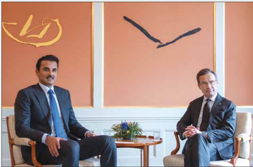
His Highness the Amir Sheikh Tamim bin Hamad al-Thani and Swedish Prime Minister Ulf Kristersson held a session of official talks at the seat of the government "Rosenbad" in Stockholm.