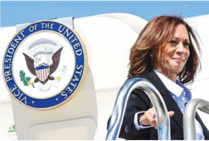
Harris boards Air Force 2 for departure at Detroit Metropolitan Wayne County Airport.

Trump held the advantage on immigration policy, with Hispanic voters preferring him over Harris 42% to 37%, narrower than