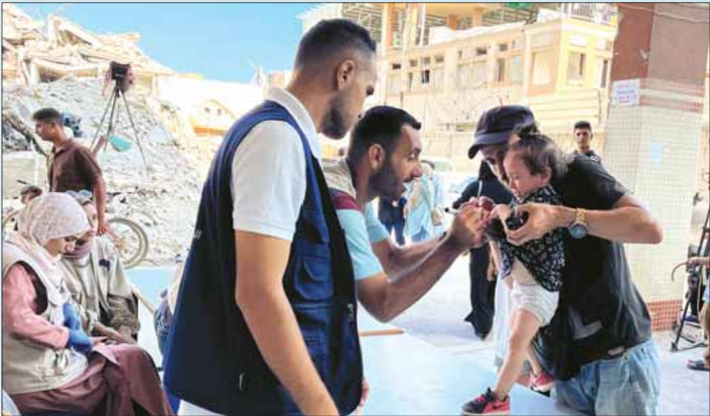
A Palestinian child cries during a polio vaccination campaign, amid the Israel-Hamas conflict, in Deir Al-Balah in the central Gaza Strip, yesterday.

“But now we open the bag and find clothes inside it, clothes for displacement that we take with us wherever we go, from place to place.”