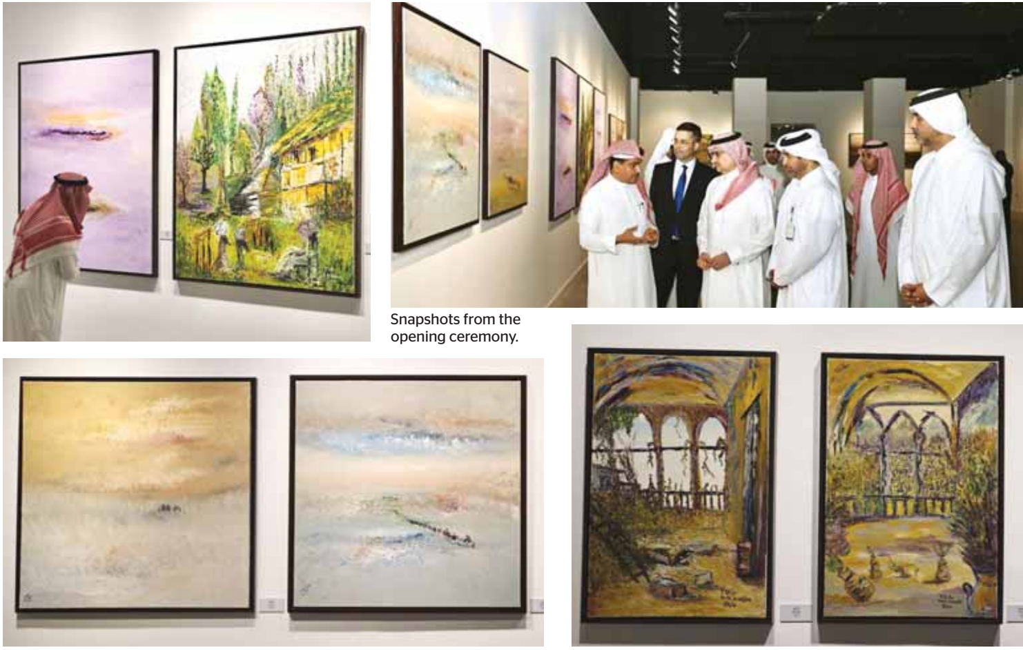
Snapshots from the opening ceremony.