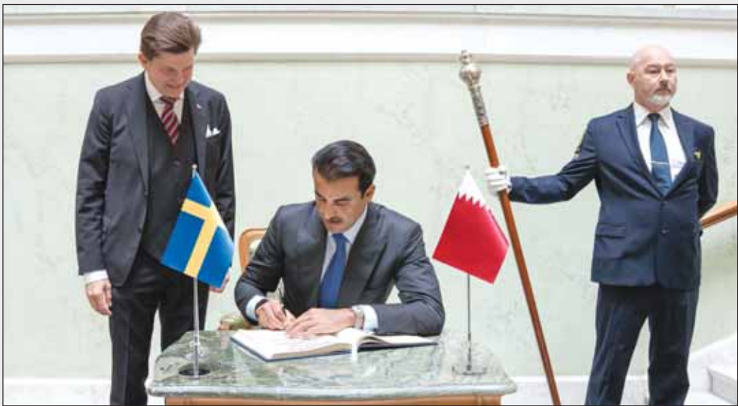
His Highness the Amir Sheikh Tamim bin Hamad al-Thani met with Speaker of the Parliament of Sweden (Riksdag) Andreas Norlen at the Riksdag headquarters in Stockholm yesterday. During the meeting, they discussed bilateral relations, ways to develop and boost them in various fields, and exchange expertise in related fields, in addition to a number of topics of mutual interest.