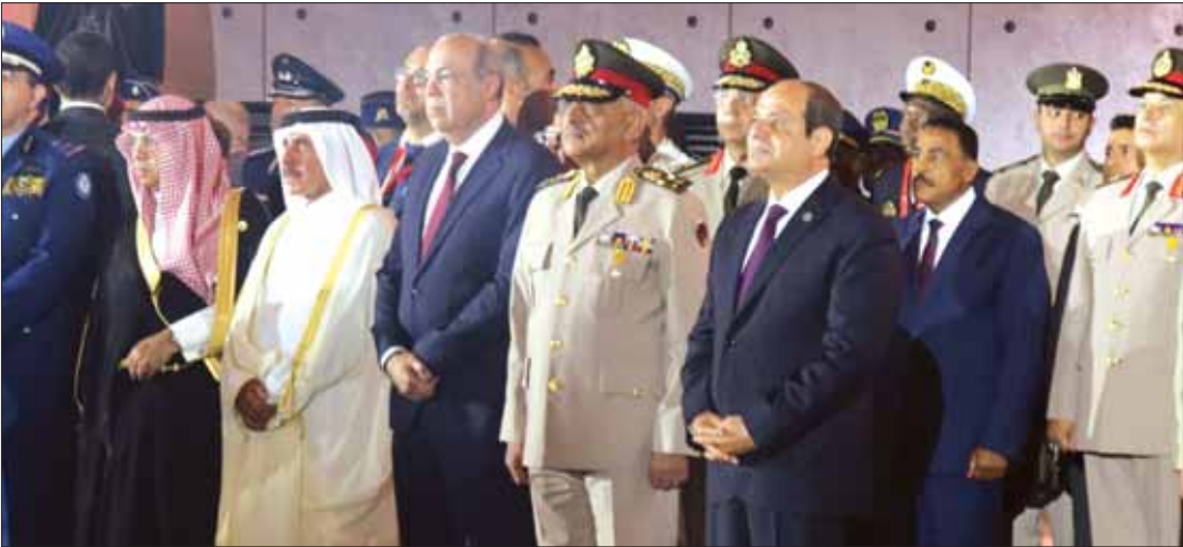
Qatar's Minister of Transport HE Jassim Saif Ahmed al-Sulaiti, Egypt President Abdel Fattah al-Sisi and other dignitaries at the opening ceremony of the inaugural edition of the Egypt International Airshow, yesterday.

HE the Minister of Transport Jassim Saif Ahmed al-Sulaiti has participated in the opening ceremony of the inaugural edition of the Egypt International Airshow (EIAS 2024), which opened at New Alamein City yesterday, under the patronage and in presence of President Abdel Fattah al-Sisi.