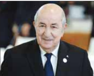
Algeria's President Abdelmadjid Tebboune.

Tebboune’s success has been aided by a “favourable international setting”, with the Ukraine-Russia war driving up natural gas prices to the benefit of Algeria, the continent’s top exporter.