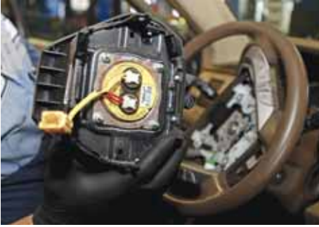
This 2015 picture shows a technician holding a recalled Takata airbag inflator.

Hundreds of injuries have also been reported in various automakers' vehicles since 2009 from Takata air bag inflators that can explode,