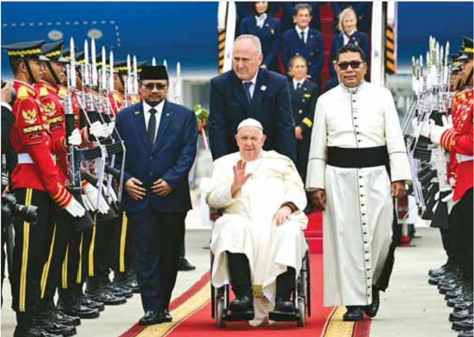
Pope Francis (centre, in wheelchair) is welcomed during his arrival at Soekarno-Hatta International Airport in Jakarta yesterday. Pope Francis arrived in Indonesia yesterday for the first stop of a four-nation tour in the Asia-Pacific that will be the longest of the 87-year-old's papacy.

The government has deployed tens of thousands of forces to battle the rebels across the insurgent-dominated region known as the "Red Corridor", which stretches across several central, southern and eastern states.