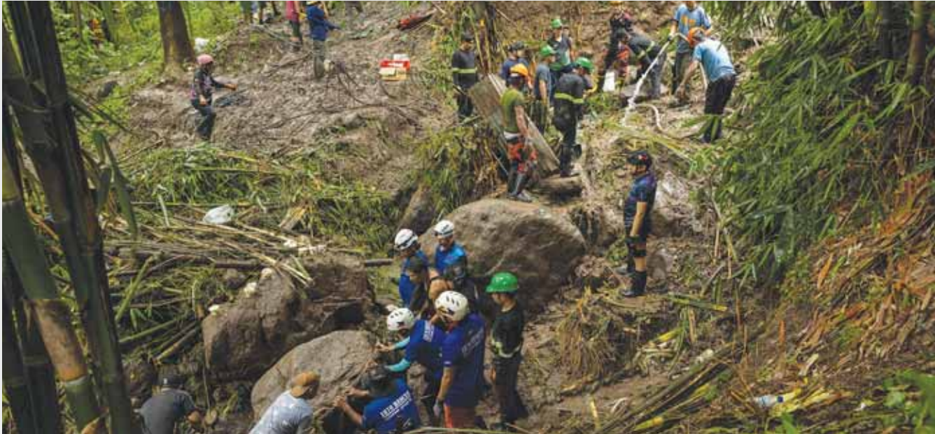
Volunteers and rescuers remove debris on a hill while searching for missing residents, whose houses were swept during a landslide caused by Tropical Storm Yagi, locally known as Enteng in San Luis, Antipolo, Rizal province, Philippines, yesterday. At least 13 people have died in the Philippines due to tropical storm Yagi, while schools and government offices were closed in Manila and nearby provinces yesterday because of expected bad weather.

Canada is among the world's top producers of canola - an oilseed crop that is used to make cooking oil, animal feed and biodiesel fuel - and China has historically been one of its largest customers.