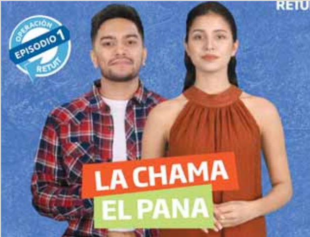
An image shows avatars generated through artificial intelligence (AI) technology by CONNECTAS with the headline reading La Chama, El Pana , Venezuelan slang for the girl and the friend.

The country's opposition and human rights groups have said recent arrests of protesters, opposition figures and journalists