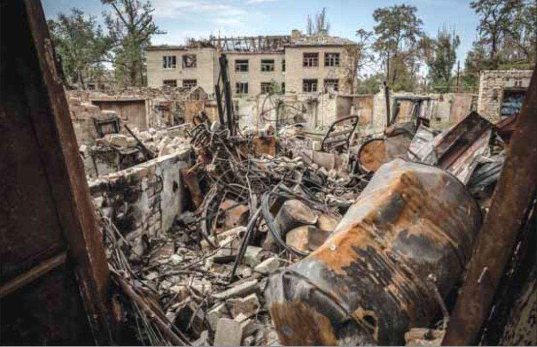
A view shows residential buildings heavily damaged during a Russian military attack in the frontline town of Chasiv Yar, in Donetsk region, Ukraine.