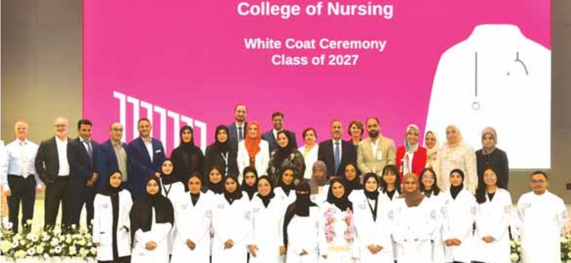
The ceremony honoured 24 students.