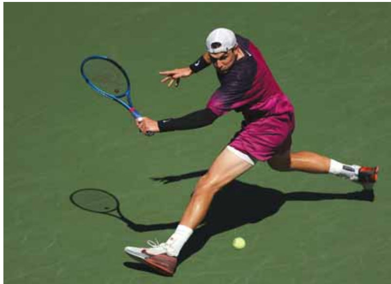
Jack Draper of Great Britain returns a shot against Tomas Machac of Czech Republic during their fourth-round match on Day 8 of the 2024 US Open at USTA Billie Jean King National Tennis Center in New York yesterday. Centre: Jessica Pegula celebrates after beating Diana Shnaider. Right: Daniil Medvedev of Russia returns a shot against Nuno Borges of Portugal.

Gauff had been looking to avenge her fourth-round loss at this year's Wimbledon but Navarro stunned the crowd at Arthur Ashe Stadium with an aggressive all-round display to reach the quarter-finals for the first time.