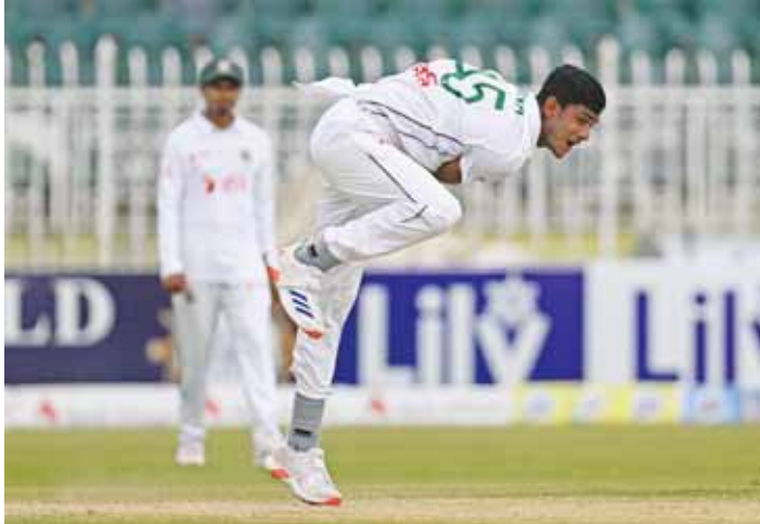
Bangladesh's Nahid Rana bowls during the fourth day of the second and last Test against Pakistan at the Rawalpindi Cricket Stadium in Rawalpindi yesterday.

"The odds are probably in favour of Bangladesh and we don't