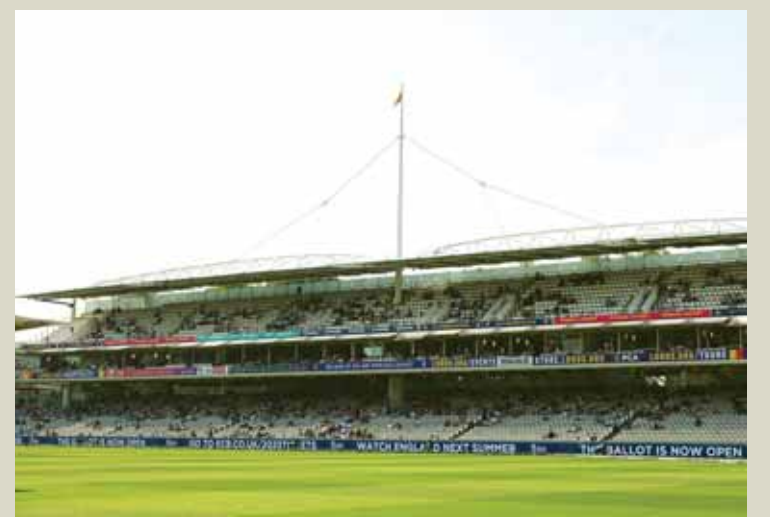
Empty seats are pictured in the stands at Lord's Cricket Ground in London on Sunday.

"We need to do well in the first innings - a minimum of 320 is a must," he said. But with England 216-6 in their first innings, Sri Lanka were in the game only for Root and Atkinson to regain the initiative for the hosts. "Once the ball had got soft, Joe Root smartly started rotating the strike and put the loose ball away to the boundary," said De Silva. "We lost the grip of the game after that."