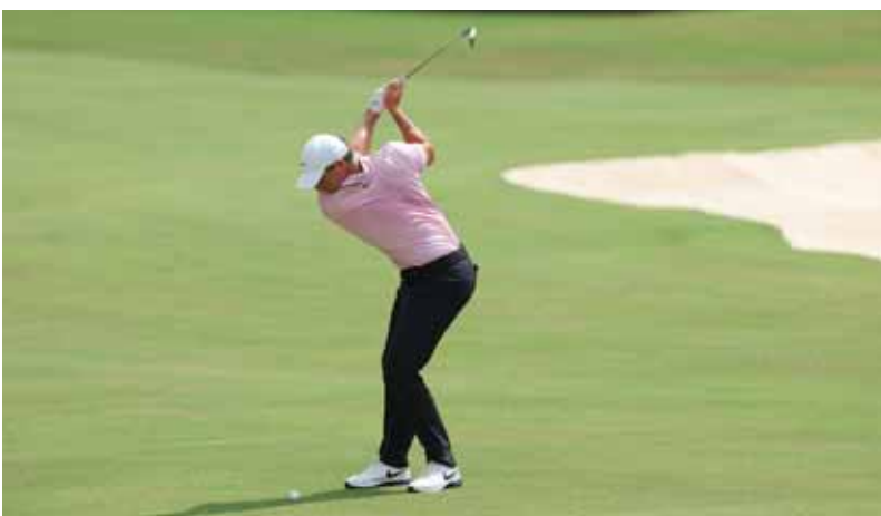
Rory McIlroy of Northern Ireland plays a shot on the seventh hole during the final round of the Tour Championship at East Lake Golf Club in Atlanta, Georgia.

McIlroy has won the Tour Championship three times, most recently in 2022 when he held off Scottie Scheffler and South Korea's Sungjae Im by a stroke. Scheffler finished off the Tour Championship victory Sunday at East Lake Golf Club, winning by four strokes over Collin Morikawa.