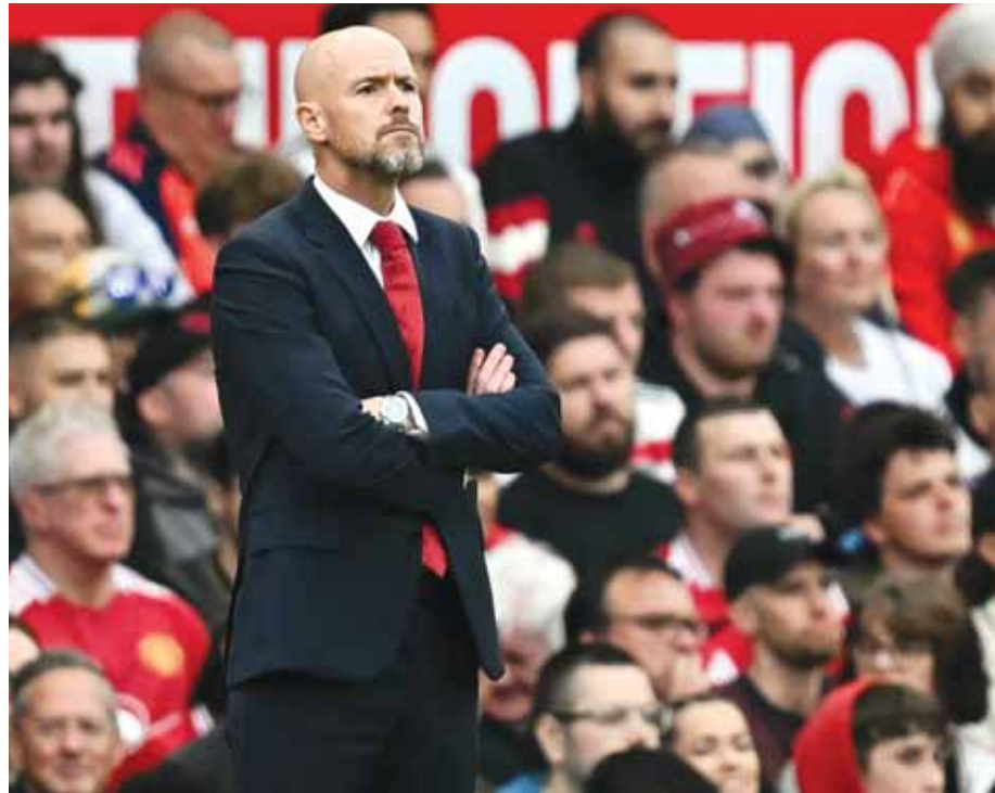
Manchester United's chastening 3-0 home defeat at the hands of Liverpool left Erik ten Hag's men languishing 14th in the Premier League table just three games into the season.

The former Ajax boss can point to mitigating circumstances – Manuel Ugarte, United's