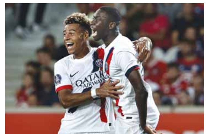
Paris Saint-Germain's Randal Kolo Muani (right) celebrates with Desire Doue after scoring against Lille during the French Ligue 1 match at the Stade Pierre-Mauroy in Villeneuve-d'Ascq, northern France.

Meanwhile, Lille coach Bruno Genesio was left to regret the decision to deny his side a late equaliser, when Tiago Santos scored but the goal was disallowed by VAR for an extremely tight offside.