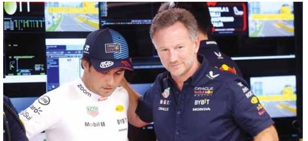
Red Bull's Sergio Perez and team principal Christian Horner (right) before practice at the Italian Grand Prix inside Autodromo Nazionale Monza on Saturday.

time. I think actually really going through the data, there were issues there at the beginning of the year in the characteristic.