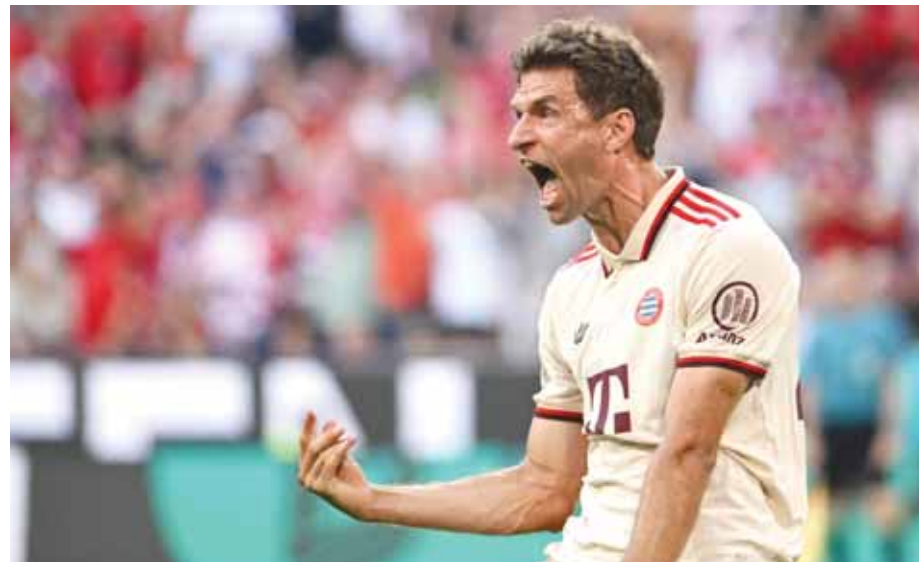
Bayern Munich's Thomas Mueller celebrates after scoring against Freiburg during the Bundesliga match in Munich yesterday.

After the match, Mueller climbed into the stands to celebrate with the club's ultras, giving away both his boots. "I told them they need to work hard this year because they'll need extra vacation days – we've got a lot ahead of us