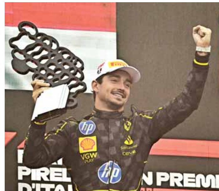
Ferrari's Monegasque driver Charles Leclerc celebrates on the podium after winning the Italian Formula One Grand Prix race at Autodromo Nazionale Monza circuit yesterday.

Trident driver Fomoro overtook Australian Christian Mansell on the final corner of the 10-race season to grab third place and snatch the title from Gabriele Mini by two points. Gabriel Bortoletto won the F2 race in dramatic fashion after starting last on the grid, cutting Isack Hadjar's lead at the top of the stands to just 10.5 points with three races remaining in the season.