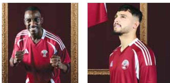
Qatar's Almoez Ali (left) and Bassem al-Rawi pose sporting team's new kit unveiled by the Qatar Football Association yesterday, ahead of the FIFA World Cup 2026 qualifier against UAE.

The Qatari fans have a culture of cheering through forming waves in the stadium stands and organised chanting, in addition to continuous support for the players to win. With great experiences gained after the FIFA World Cup Qatar 2022 and the Asian Cup Qatar 2023, the fans' support for players continue throughout the course of the matches and won't stop until the final whistle.