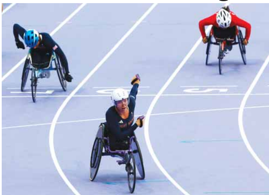
Hannah Cockcroft of Britain celebrates after winning gold in the women's 100m T34 race.

On the track, the 32-year-old Cockcroft, one of Team GB's biggest stars, pushed away at the start of the women's T34 100m to leave