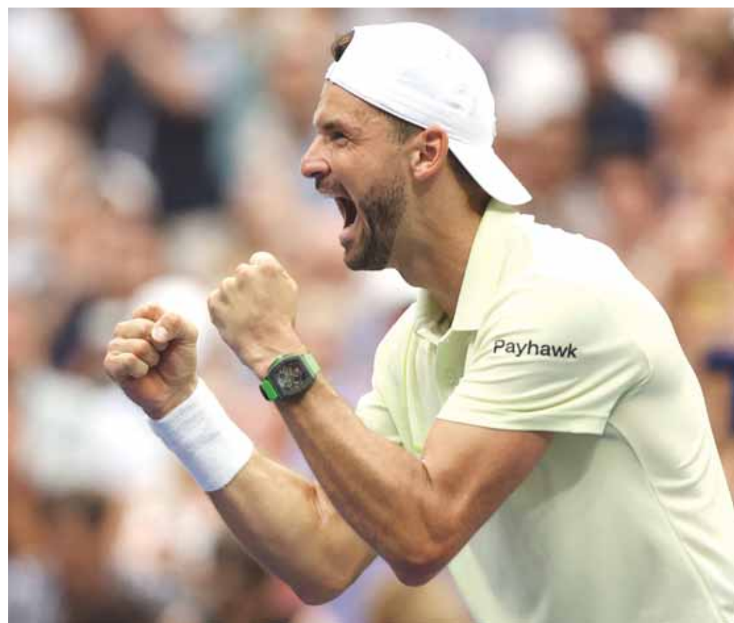
Grigor Dimitrov of Bulgaria celebrates his victory over Andrey Rublev of Russia in the US Open fourth round match yesterday.

"It was so humid I thought I was going to die," said the 26-year-old New York-born player of the humidity which hit 85 percent at noon. "I knew she was tough but