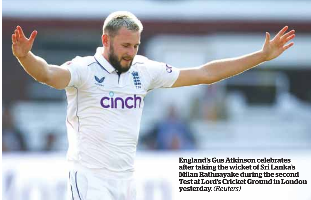
England's Gus Atkinson celebrates after taking the wicket of Sri Lanka's Milan Rathnayake during the second Test at Lord's Cricket Ground in London yesterday.

crowd. The odds were stacked against them given the highest winning fourth-innings total in any Test is the West Indies' 418-7 against Australia at St John's in 2002/03, with the equivalent Lord's record the West Indies' 344-1 against England in 1984. But early on Sunday, Root reprimed Karunaratne, who had added just two to his overnight 23, when failing to hold a fast-traveling one-handed slip chance from the opener's edged cut off Atkinson. England did strike when Prabath Jayasuriya nicked Chris Woakes to second slip as the nightwatchman's gutsy 41-ball stay came to an end. Karunaratne, 36, drove and pulled Atkinson for fours off successive deliveries on his way to a 98-ball fifty including seven boundaries. The left-hander, however, was out for 55 shortly before lunch. Chandimal counter-attacked early in the afternoon session with three fours in an over against off-