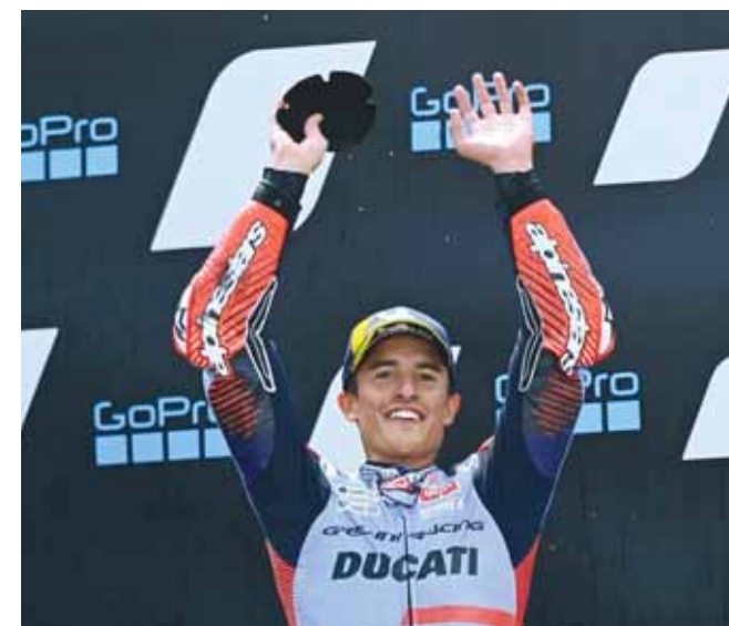
Spanish rider Marc Marquez celebrates on the podium after winning the MotoGP Aragon Grand Prix at the Motorland circuit in Alcañiz, northeastern Spain, yesterday.

As he left Aragon, hanging up his motorbike leathers was the last thing on his mind.