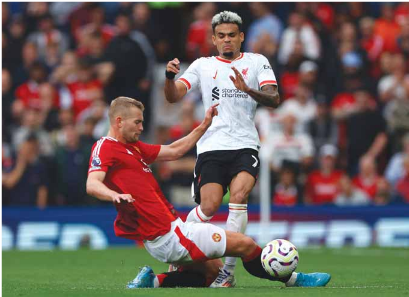
Liverpool's Luis Diaz (right) is fouled by Manchester United's Matthijs de Ligt during the Premier League match in Manchester.

United boss Ten Hag is under pressure after a woeful display that came hot on the heels of their 2-1 defeat at Brighton last weekend. Ten Hag survived a close-season