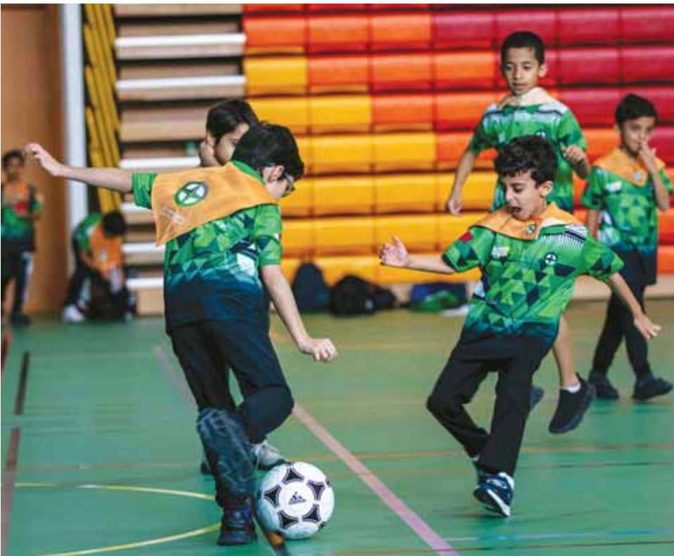
Children engaged in football during the camp.