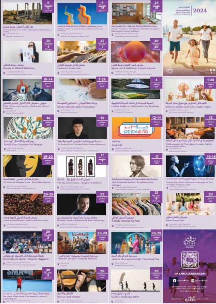
Palestine, and several other Arab countries.

ConteQ Expo 2024 will be held at the Qatar National Convention Centre (QNCC) from September 16-18. The Doha International Coffee Exhibition 2024 is set to take place from September 26-28 at the Doha Exhibition and Convention Centre (DECC). With the aim of supporting Palestinian people in the Gaza Strip, Al-Markhiya Gallery, in co-operation with Qatar Red Crescent, is organising a fine art exhibition titled 'The Sky Above Gaza... Imagine' from September 17-November 7 at The Fire Station. It will feature the works of more than 50 artists from Qatar,