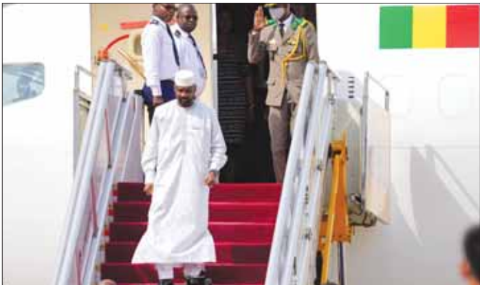
Mali’s interim president Assimi Goita arrives at Beijing Capital International Airport, yesterday. Right: Members of the Chinese honour guard walk past as Interim President of Mali, Goita, arrives ahead of the 2024 Summit of the Forum on China-Africa Co-operation (FOCAC) in Beijing.

“That’s a big ask for a continent that generally has very poor China literacy.” Africa’s biggest two-way