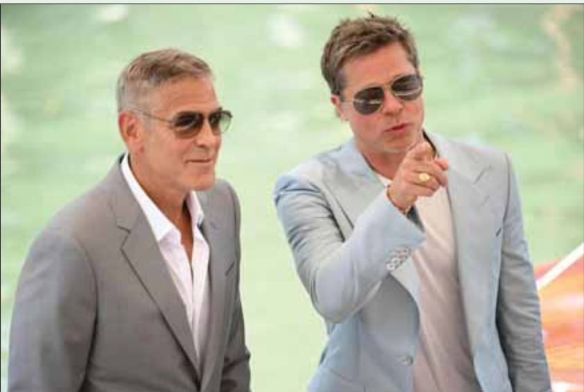
Actors Brad Pitt (right) and George Clooney arrive at the Casino pier during the 81st Venice International Film Festival at Venice Lido yesterday.

Hollywood’s two top leading men — George Clooney and Brad Pitt — are ready to set the Venice Film Festival alight with the premiere of their new film Wolfs . The action comedy, pitting one professional “lone wolf” fixer against another, is one of the highlights of the 10-day festival, where it is playing out of competition on the glamorous Lido. Fans will be sure to await the arrival of the dashing movie stars by water taxi from Venice, with a world premiere scheduled for last evening. The 81st edition of the world’s oldest film festival has been awash with stars this year, with Clooney and Pitt following on the red carpet Nicole Kidman, Cate Blanchett and Angelina Jolie — Pitt’s ex-wife. Expected today will be Julianne Moore and Tilda Swinton, starring in a new film from Spain’s Pedro Almodovar, while Lady Gaga and Joaquin Phoenix will dominate