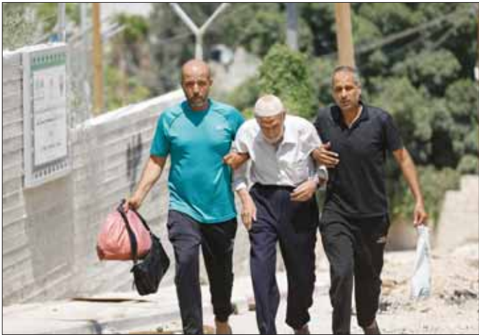
Palestinians walk, as they evacuate their home during an Israeli raid in Jenin camp, in the West Bank.

But the operation launched on Wednesday was unusually large and long, hitting multiple West