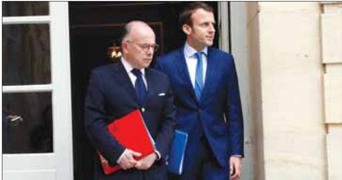
France’s then-minister of interior Bernard Cazeneuve (left) and economy minister Emmanuel Macron leave the Hotel Matignon on May 28, 2017 in Paris following a meeting with the prime minister and other members of the government and representatives of the oil sector.