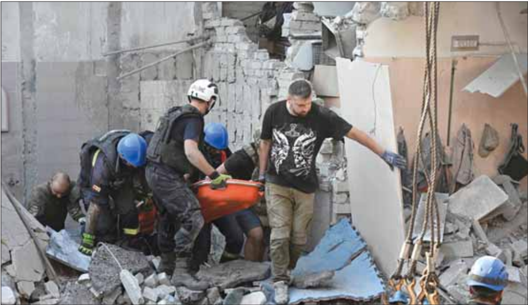
Rescuers carry a wounded person from Sport Place after Russian missiles strike in Kharkiv yesterday.

have been targeted. The barrage came just days after Russia sent over 200 drones and missiles at Ukraine’s energy infrastructure, in one of the largest such attacks. It also comes nearly a month since Ukraine went on the offensive in Russia’s Kursk region, crossing the border and capturing Russian territory as Russian troops continued their slow but steady advance in eastern Ukraine. Sobyanin said yesterday morning that a downed drone had hit a “technical building” at the Moscow oil refinery, owned by the Gazprom energy giant, in the southeast Kapotnya area of the capital. The mayor later said “the fire at the oil refinery has been localised and there is no threat to people or the plant’s operation”. In the Tver region northwest of Moscow, five drones targeted the area of Konakovo power plant and caused a fire that was swiftly extinguished, according to governor Igor Rudenya. A local official in the Moscow region, Mikhail Shuvalov, said on Telegram that three drones had also tried to hit the Kashira coal-firing power station, but that “there were no victims nor damage and it did not catch fire”. Russian military blogger Rybar, who is followed by more than 1.3