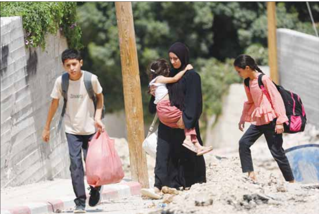
Palestinians walk, as they evacuate their home during an Israeli raid in Jenin camp, in the occupied West Bank.

cutting off access to hospitals, saying it has positioned its forces to prevent fighters from gathering in them while allowing ambulances to come and go.