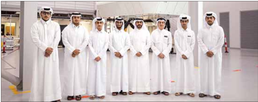
Qatar Airways' initiative is part of the strategy to ensure that quality and competent nationals are well-prepared to take on permanent and influential roles within the organisation.

As part of its ongoing commitment to nurturing a highly skilled Qatari workforce, the national airline recently hosted a pioneering hands-on learning experience for nine 'promising' students.