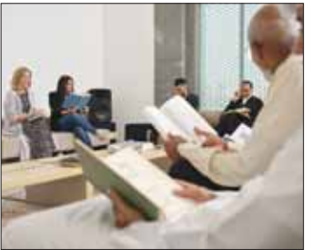
Storytime at MIA Library.

Qatar Museums (QM) unveiled its September line-up, featuring workshops, camps, and exhibitions, curated to captivate and inspire audiences of all ages, providing enriching experiences that spark creativity and nurture learning. The Museum of Islamic Art (MIA) will host storytelling sessions, Family Day activities, and various art workshops for children and adults. September 14 | 3pm-5pm: The monthly Family Day at MIA Atrium will see visitors learn more about geometric shapes. A workshop, An Artist's Adventure (for ages 5-7) is to be held on September 9-10, 4pm-5.30pm. Storytime for children at MIA Library: "I Can Do Anything That's Everything All On My Own", September 2, 11am-12noon. Mathaf: Arab Museum of Modern Art has curated a series of workshops and a special storytelling session. The workshop: Art Making in Manara will be held on September 11, 18 and 25, 4pm-6pm. Storytime for family is on September 14, 4pm-5.30pm. The workshop: Art lesson with Ismail