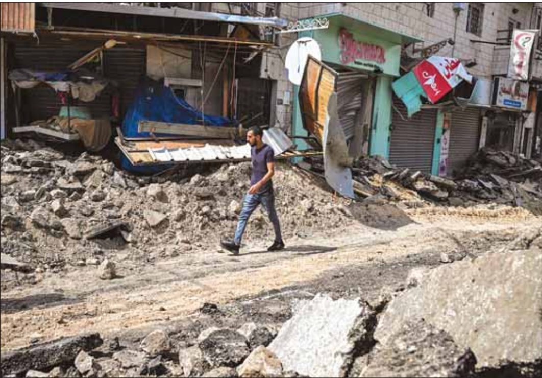
A Palestinian man walks past damaged shops on a street torn up by bulldozers during an Israeli raid in the occupied West Bank city of Jenin, yesterday.