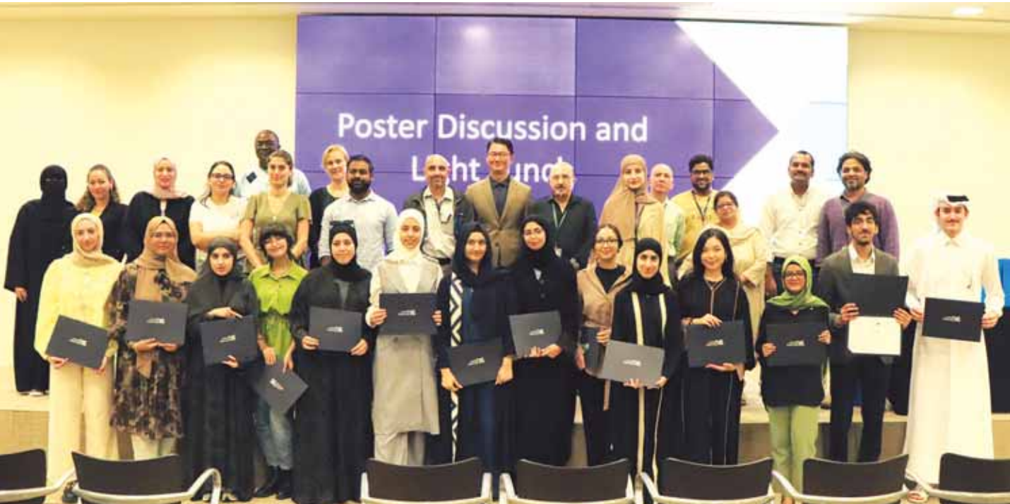
Participants with officials of the programme.