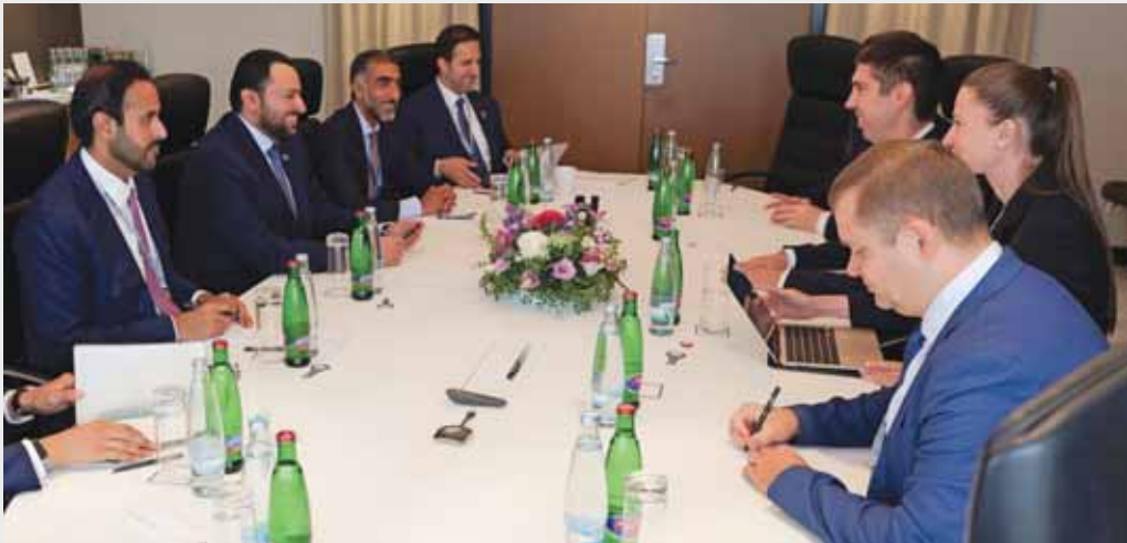
HE the Minister of State at the Ministry of Foreign Affairs, Dr Mohamed bin Abdulaziz bin Saleh al-Khulaifi met in Prague yesterday with Moldova's Deputy Prime Minister and Foreign Minister Mihail Popsoi, on the sidelines of the GLOBSEC Forum. During the meeting, the two sides discussed co-operation between the countries and ways to support and develop them, in addition to regional and international issues of mutual interest. (QNA)