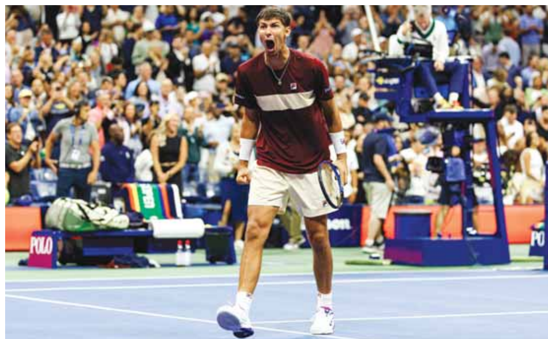
Alexei Popyrin of Australia celebrates his victory over Novak Djokovic of Serbia during the 2024 US Open at the USTA Billie Jean King National Tennis Center.

Although he won the Olympic gold he had long coveted at the Paris Games, an uneven season that included knee surgery saw Djokovic come up empty in the majors. He had beaten Popyrin in three prior encounters, including at the Australian Open and Wim-