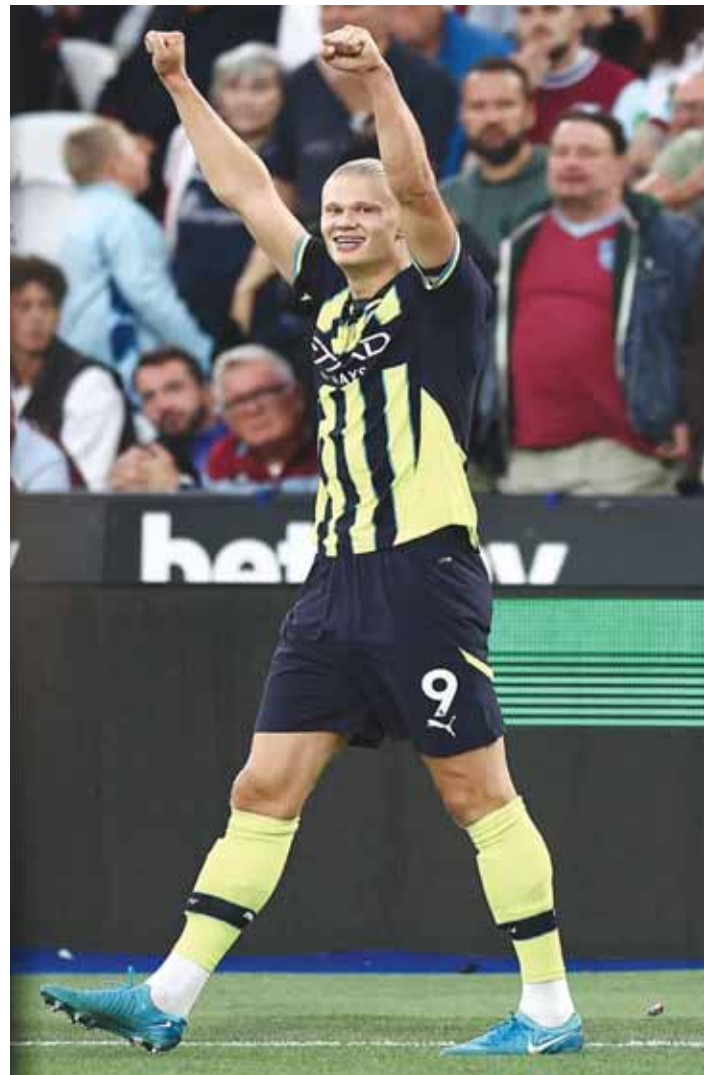
Manchester City's Erling Haaland celebrates after scoring his third goal during the English Premier League match against West Ham United at the London Stadium yesterday.

However, the game turned just seconds into the second half when Rice controversially received the first red card of his career. The England midfielder was deemed to have kicked the ball away as