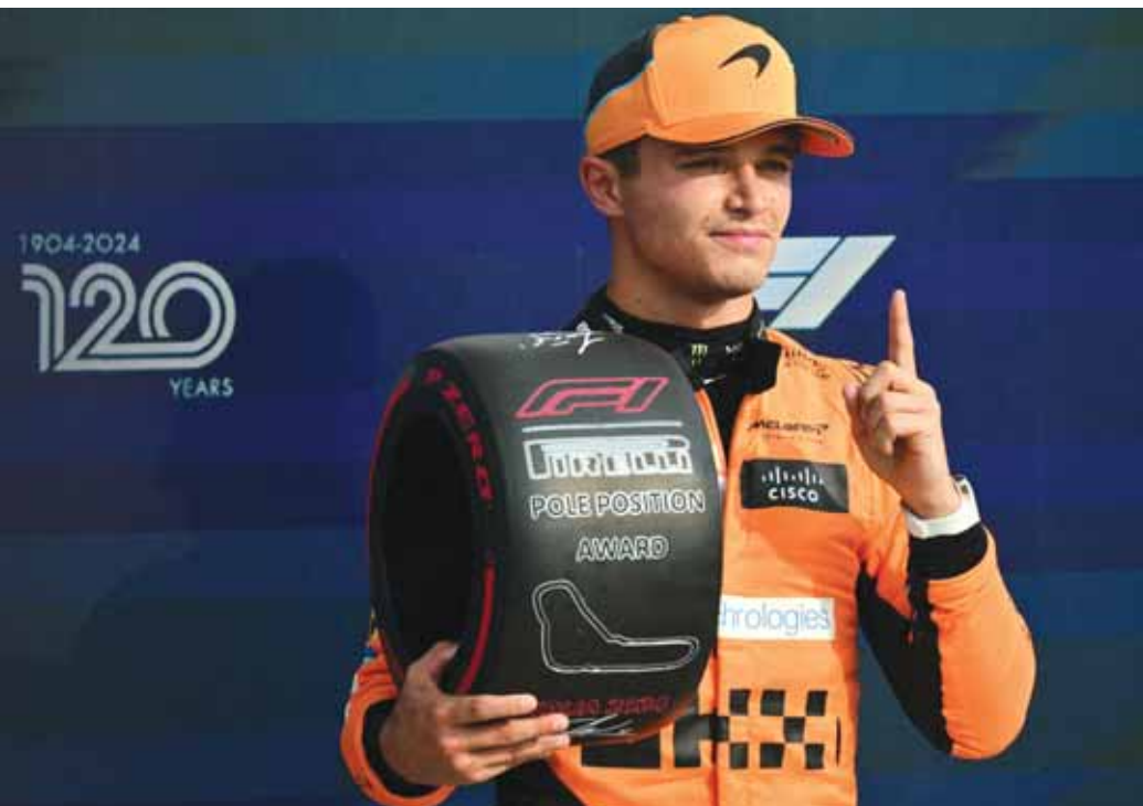
McLaren's British driver Lando Norris celebrates his pole position after the qualifying session, ahead of the Italian Grand Prix at Autodromo Nazionale Monza circuit yesterday.

"For sure it's a good opportunity (to cut Verstappen's lead). I mean I expect him to come through and probably be behind us quite quickly... I expect them to