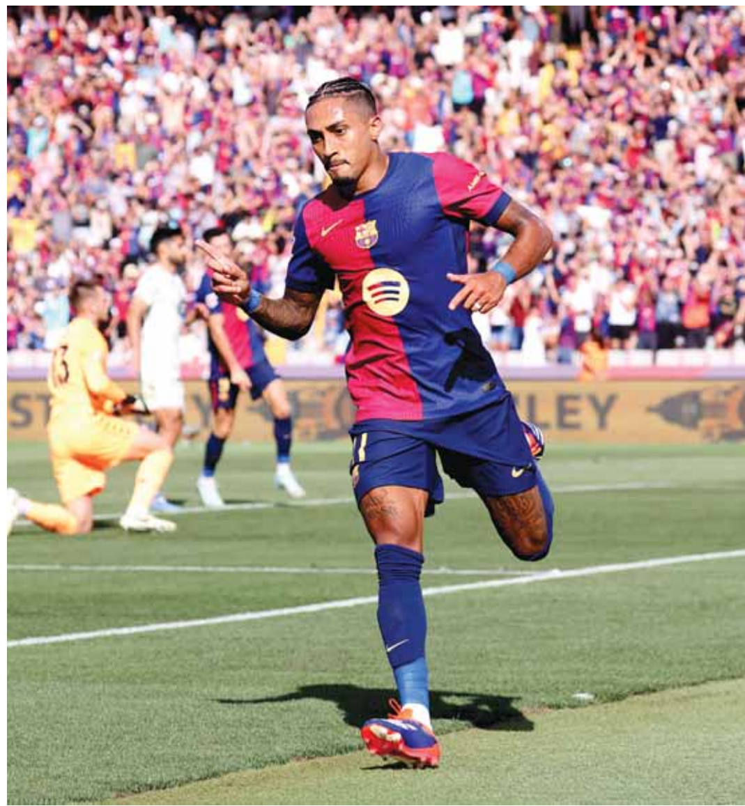
Barcelona's Raphinha celebrates scoring during the La Liga match against Real Valladolid at the Estadi Olimpik Lluís Companys in Barcelona yesterday.

He completed his treble on 72 minutes following a brilliant burst forward from Yamal, who then