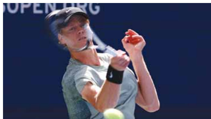
Italy's Jannik Sinner plays a return to Australia's Christopher O'Connell during their third-round match yesterday.

6-1, 6-3 in a match that ended at 2:35am - the second latest US Open finish ever.