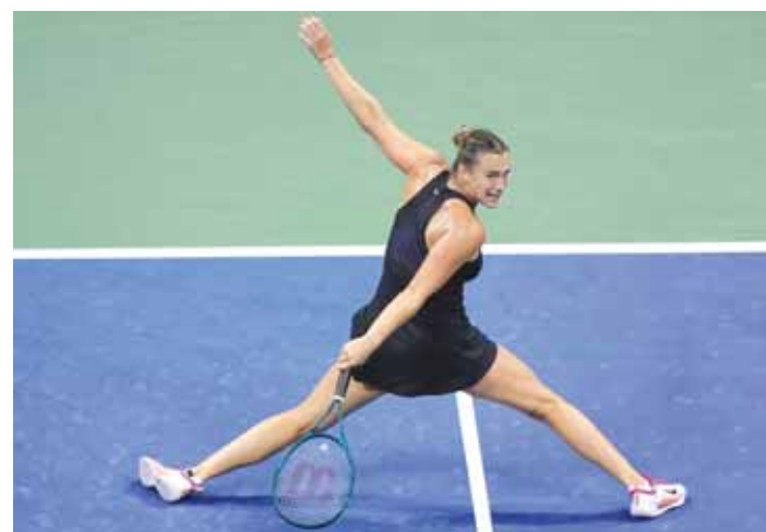
Aryna Sabalenka from Belarus in action during her match against Russia's Ekaterina Alexandrova yesterday.

Men's fourth seed Alexander Zverev started earlier but laboured later on Louis Armstrong Stadium, where he beat Argentina's Tomas Martin Etcheverry 5-7, 7-5,