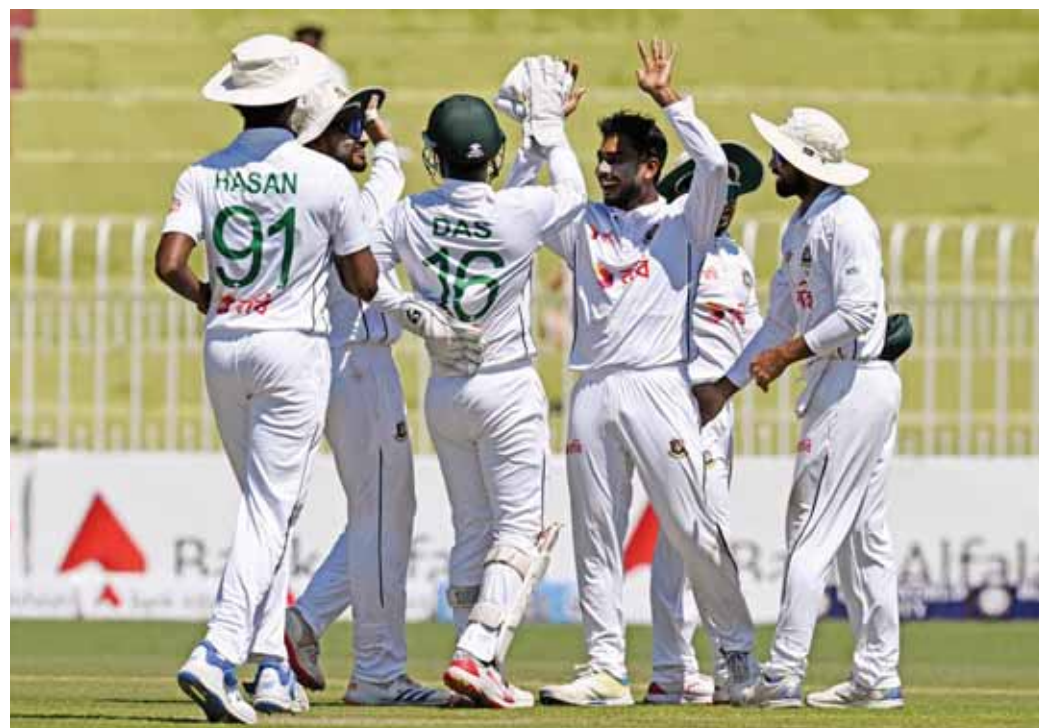
Bangladesh's Mehidy Hasan Miraz (fourth left) celebrates after the dismissal of Pakistan's Saim Ayub during the second day of second Test at the Rawalpindi Cricket Stadium yesterday.

ter than the first Test track and should provide help for the spin bowlers.