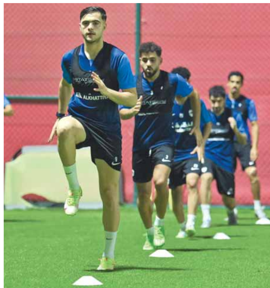
Al Rayyan players train yesterday, on the eve of their QSL Cup match against Al Shahania.

In other Group A matches today, Duhail will take on Qatar SC, while Arabi face Ahli