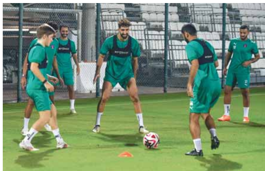
Al Shahania players at a training session yesterday.