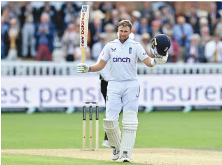
England's Joe Root celebrates his century on the opening day of the second Test against Sri Lanka at Lord's Cricket Ground in London yesterday.

Root shared stands of 48 and 62 with Har-