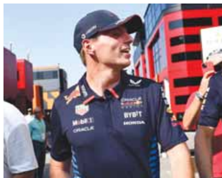
Max Verstappen of Red Bull Racing in action during the Italian Grand Prix.

"There was nothing that I could do, so once he passed, I just focused on doing my race,