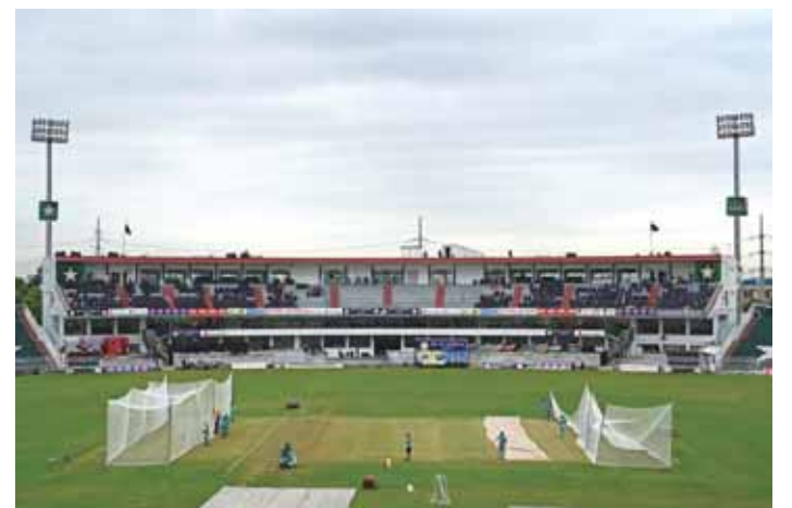
Groundmen prepare nets for training sessions of the Pakistan and Bangladesh teams at the Rawalpindi Cricket Stadium in Rawalpindi yesterday.

Intermittent rain and bad weather in Rawalpindi prevented both teams from having a practice session.