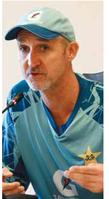
Pakistan's cricket head coach Jason Gillespie attends a press conference in Rawalpindi yesterday.

"The morale of the players is very, very good," said former Sri Lankan batsman Hathurusinghe. "Obviously beating Pakistan in