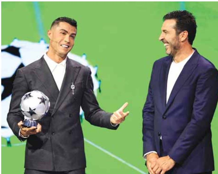
Portugal's star forward Cristiano Ronaldo (left) shares a laugh with Italy's former goalkeeper Gianluigi Buffon after he was awarded the All-Time Goalscorer trophy in the UEFA Champions League during the draw ceremony in Monaco yesterday.

The number of clubs in the Champions League has increased from 32 in the past, with the 36 participants split into four seeded pots of nine for the draw. While in the past the draw was entirely conducted by hand, this time had to be different to avoid the process lasting several hours. Each team was drawn out by former Italy goalkeeper Gianluigi Buffon on the stage in Monaco, before Cristiano Ronaldo pressed a button to activate the computer which revealed all eight of their opponents.