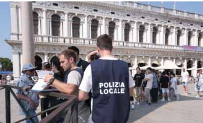
Local police fines a tour guide on the day Venice municipality introduces a limit for tourist groups to 25 people to protect the fragile lagoon city and reduce the pressure of mass tourism.

the city centre and also the islands of Murano, Burano and Torcello, got a thumbs-up from tourists.