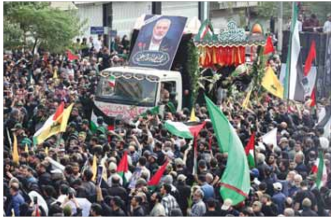
Iranians take part in a funeral ceremony for late Hamas leader Ismail Haniyeh, in Tehran, yesterday.