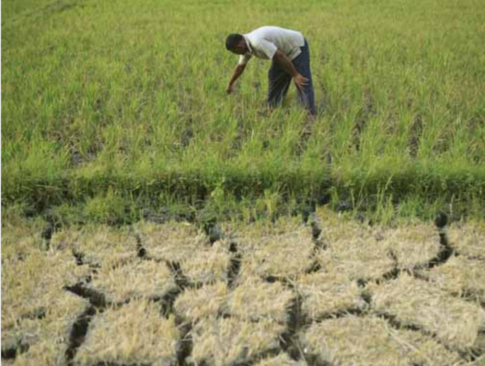
A farmer, pulls out rice that failed to be harvested due to a prolonged drought in Aceh Besar, Indonesia