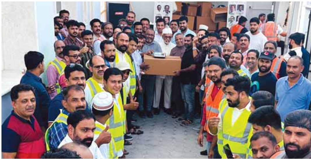
KMCC Qatar leaders, members and volunteers during the Biriya Challenge.