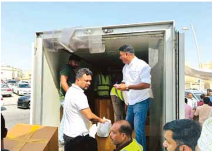
Around 400 volunteers, comprising professionals, businessmen and drivers, worked for the successful implementation of the drive, distributing biriyani orders across the country.