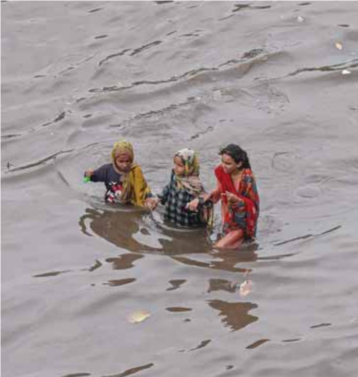
Girls wade through a flooded street in Lahore.

home to 240mn people – was hit by a succession of heatwaves and this April was the wettest since 1961.