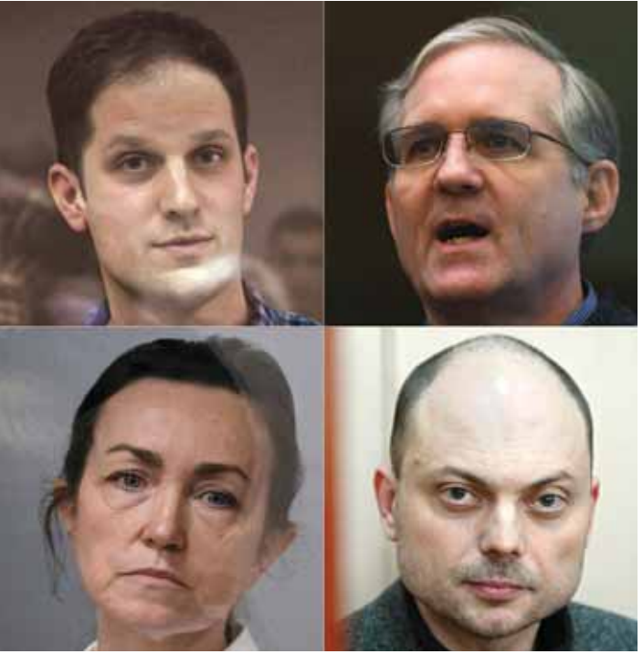
This combination of file pictures (left to right, top to bottom) US journalist Evan Gershkovich, former US Marine Paul Whelan, US-Russian journalist Alsu Kurmasheva, and Russian opposition activist Vladimir Kara-Murza.