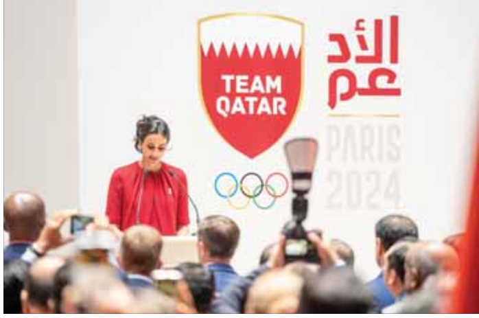
HE Sheikha Hind bint Hamad al-Thani speaking at the Paris event yesterday.

As the Olympic Games Paris 2024 unfold, a new collaboration is to be launched by Qatar Foundation, Education Above All Foundation, and the International Olympic Committee that will harness the power of sports to nurture more equitable, inclusive, and educated communities across Asia and the Middle East and North Africa region. Outlined yesterday at the Team Qatar Reception in the French capital, the three-year project – part of the International Olympic Committee's (IOC) Olympism365 strategy to strengthen the role of sports and Olympism in achieving the United Nations Sustainable Development Goals – will be focused on women and girls, people with disabilities, and people from marginalised communities, supporting the implementation of sports-for-good projects in over 10 countries, including Qatar, Sudan, and India. Through developing localised solutions – in sports, and through sports – tailored to each country's needs, challenges, and goals, the