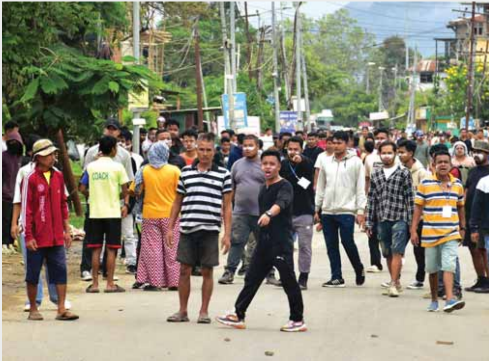
Internally displaced persons (IDPs), who are living in relief camps, hold a protest rally demanding their resettlement in their native places, in Imphal, Manipur, India, yesterday.