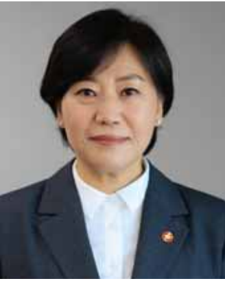
By Song Miryung Minister of Agriculture, Food and Rural Affairs Republic of Korea

The climate crisis poses another severe threat to agriculture. Climate change is making weather more extreme and less predictable. This aggravates the uncertainty of agricultural production and farm management, which in turn deters farmers from reinvesting profits back into production to become more competitive. Besides, the increasing uncertainty of running a farm feeds the perception among young people seeking stable jobs and high income that farming is not an easy choice to build a career.