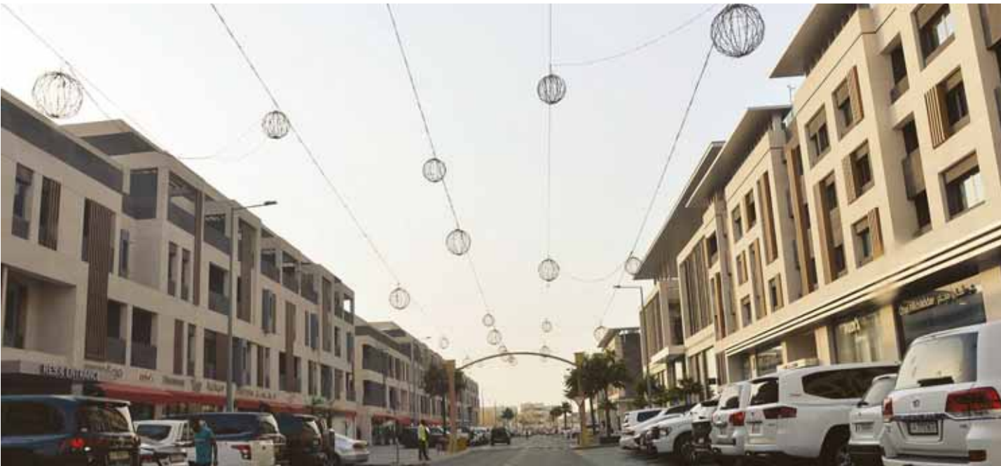
West Walk serves as one of the venues for the SkillFest exhibition.

The regional delivery of the project, through programmes to the value of $3mn, will be led by the EAA as it utilises its expertise in promoting equity and inclusion through innovation and education, and the IOC, whose global network supports, scales, and advocates for sports for development initiatives. The QF will lead the project’s delivery in Qatar, including through building on its existing efforts and plans to expand inclusive sporting opportunities for women and girls. Across three phases between 2024-2027, the ultimate goal of the collaboration is to improve the personal situations of those who participate in the project; change mindsets and social attitudes around inclusion, equity, education, and sports in the communities where it is delivered; and create impact including new policies and funding avenues in targeted countries, states, and provinces.