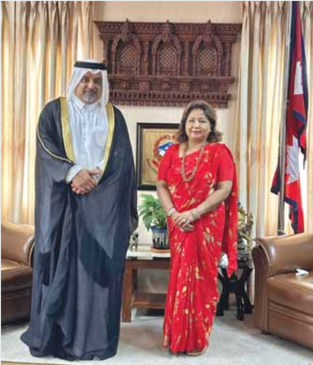
Minister for Foreign Affairs of Nepal Dr Arzu Rana Deuba met with ambassador of Qatar to Nepal Mishal bin Mohamed al-Ansari. During the meeting, the two sides discussed relations between the two countries and ways to support and develop them.