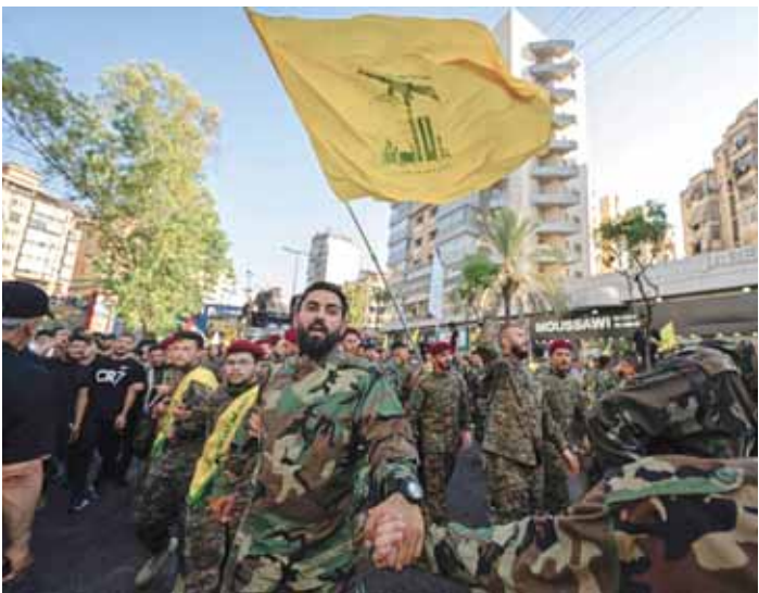
Hezbollah fighters form a human barrier during the funeral procession of slain top Hezbollah commander Fuad Shukr in Beirut's southern suburbs. Hezbollah mourned Shukr, whose body was recovered from the rubble of a July 30 Israeli strike in south Beirut that also killed five civilians, three women and two children, and injured dozens, according to Lebanon's health ministry, as fears mounted of a wider conflict in the region.