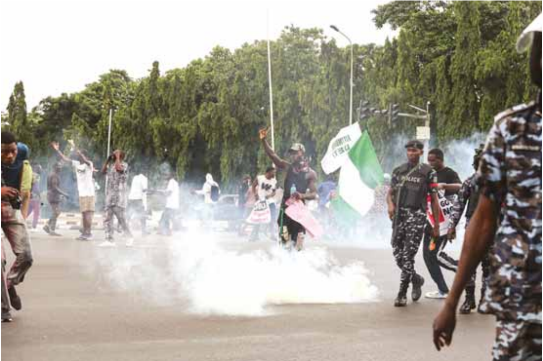
Demonstrators react as Nigerian policemen fire tear gas canisters during the End Bad Governance protest in Abuja yesterday.

Ahmed Tinubu when he came to office more than a year ago. Nigeria’s armed forces are also fighting heavily armed gangs in the country’s northwest. More than 40,000 people have been killed by the terror conflict in the northeast and another two million displaced since 2009. Hundreds of thousands of people have also been displaced in the northwest and central states of Nigeria, where gangs known locally as bandits target villages and farms for mass kidnapping for ransom.