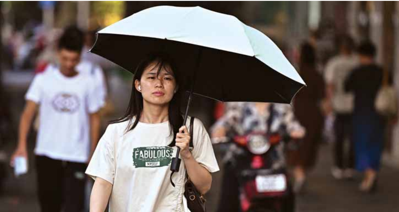
A woman walks during a hot day in Wuhan, central China’s Hubei province, yesterday.

flash floods elsewhere. There is a possibility of “significant human casualties” in North Korea, a unification ministry official said yesterday. South Korea’s TV Chosun reported more than 1,100 people and as many as 1,500 people are dead or missing, citing an unnamed government official. The North’s state media yesterday said there was work under way in the capital to prevent the flooding of the Taedong River that flows through Pyongyang. The offer of help comes as relations between the two Koreas, which remain technically at war, have been particularly strained amid a headline stance towards the North by Yoon’s government. Since late May, the two sides have been locked in tensions over North Korea’s launch of balloons carrying trash to the South and Seoul responding with propaganda broadcasts at the border, which anger the North. It was not clear if Pyongyang would respond at all to the offer or agree to hold discussions. North Korea has cut off all lines of official communication with the South. Clear assessment of damage and casualties from disasters in the North is difficult, as there are no outside humanitarian monitors present in the reclusive state. More rain was forecast for Sinuiju early today, according to South Korea’s weather agency.