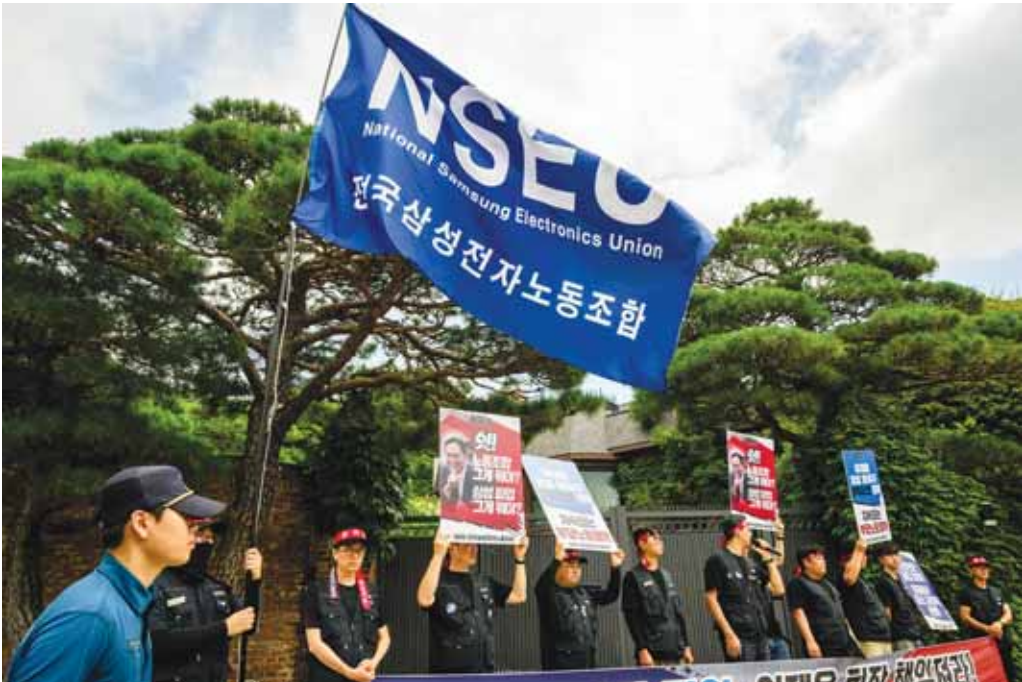
Members of the National Samsung Electronics Union (NSEU) gather during a protest outside the residence of Samsung Electronics Chairman Lee Jae-yong, while holding red placards of Lee that read “Labour union, what’s that? Samsung strike, what’s that?”, in Seoul yesterday.