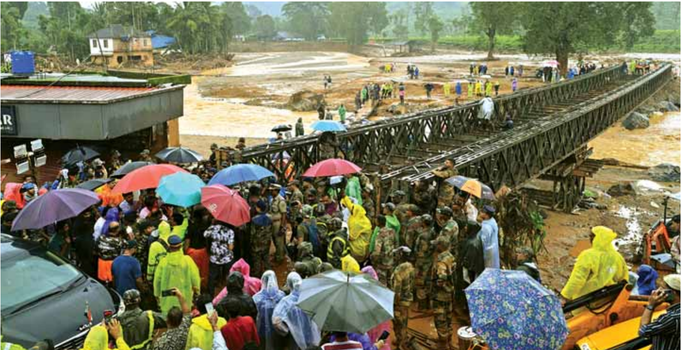
A makeshift bridge has been installed for the rescue operation after the landslides in Wayanad yesterday.

A La Nina weather pattern is likely to develop by the end of August or early September, bringing higher rainfall, said Mrutyunjay Mohapatra, director-general of the India Meteorological Department (IMD).