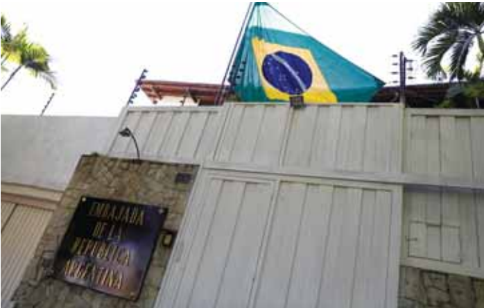
The Brazilian flag is raised at the Argentine embassy in Caracas, where Venezuelan opposition members have sought asylum since March, after Argentine diplomats were expelled from Venezuela.