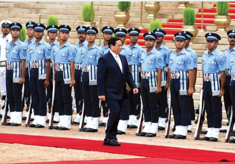
Vietnamese Prime Minister Pham Minh Chinh inspects a guard of honour during his ceremonial reception at the forecourt of India’s Presidential Palace Rashtrapati Bhavan in New Delhi, India, yesterday.