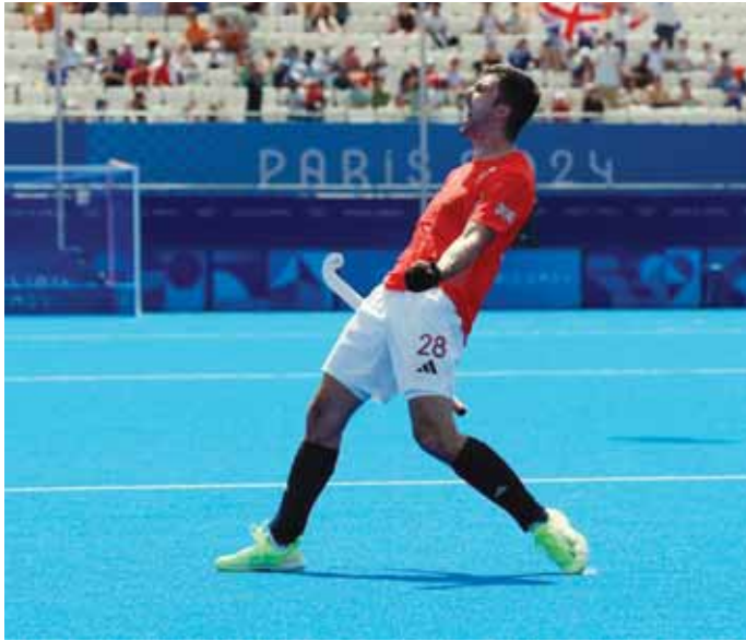
Lee Morton of Britain celebrates scoring their second hockey goal against Netherlands at Paris 2024 Olympics at Yves-du-Manoir Stadium yesterday.

Top-ranked Netherlands drew 2-2 with world number two side Britain after conceding two late goals to forward Lee Morton in men's hockey at the Paris Olympics but led Pool A yesterday. Sweat drenched the players and spectators alike as the crowds continued to turn out despite forecasts of 36C (96.8F) heat, with cheers of "Holland!" ringing out as their supporters showed up in a sea of orange. Storms are forecast for the two evening Pool B games and throughout Wednesday. "Today the heat was unbelievable... Netherlands captain Thierry Brinkman said. "It was heavy to keep running normally. And the subs are coming closer, sooner, quicker. So when you're just off, someone is calling one minute and then we switch. "The most important thing now is to recover well, get a good sleep, and