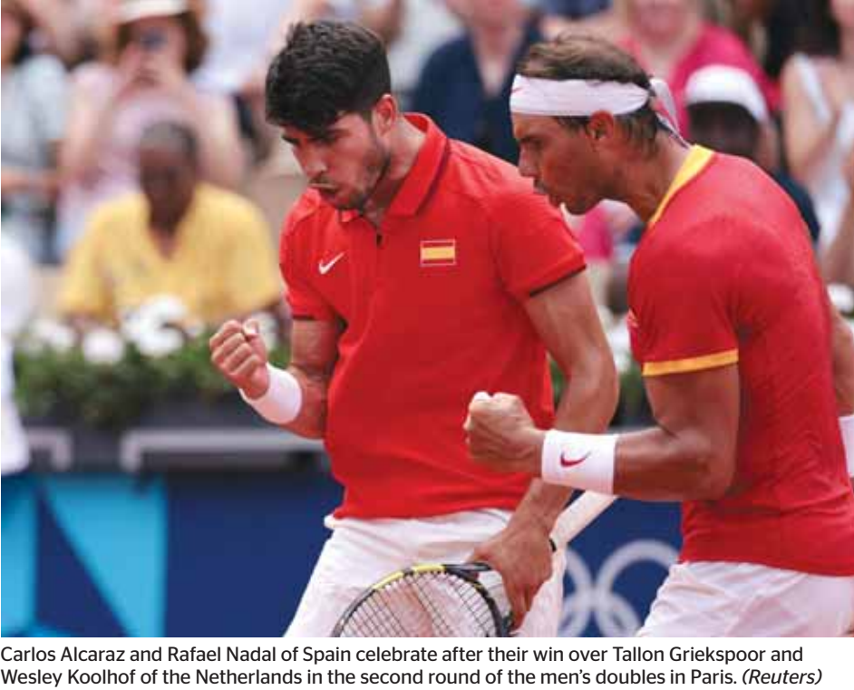
Carlos Alcaraz and Rafael Nadal of Spain celebrate after their win over Tallon Griekspoor and Wesley Koolhof of the Netherlands in the second round of the men’s doubles in Paris.

forehand, which the American mishit into the net. Vekic’s shot was called out but the call was overruled by the chair umpire and the point was awarded to the Croat, giving her the break. Gauff argued her shot was compromised by the initial call. “I have to advocate for myself all the time,” a weeping Gauff, 20, said on court. “I’m getting cheated in this game. You guys are not fair to me.” Vekic briefly lost her composure, slipping to 0-40 on her own serve before recovering to hold, and she broke again to seal victory. The world number 21, a Wimbledon semi-finalist earlier this month, said the row over the line call was a “tricky situation”. “After that, the crowd, it was not so easy,” she said. “I lost my concentration for a couple of points, but I’m happy that I managed to come back in that