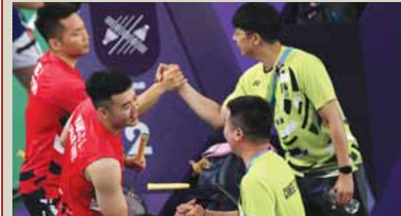
Chi-Lin Wang of Taiwan and compatriot Yang Lee shake hands with their coaching staff after winning the Group D match against Americans Joshua Yuan and Vinson Chiu at the Paris 2024 Olympics.

PARIS: Reigning champions Wang Chi-Lin and Lee Yang of Taiwan, who are in the men's doubles 'Group of Death' along with top pairs from India, Japan, China and South Korea, enjoyed a straightforward victory at the Paris Games yesterday. The Taiwanese, who are childhood friends, beat Vinson Chiu and Joshua Yuan of the United States 21-12 21-13 in Group D. "After Tokyo (Olympics), we've not played very good, so we just need to focus on every match," Wang said.