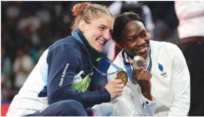
Gold medallist Slovenia's Andreja Leski and bronze medallist France's Clarisse Agbegnenou pose after the judo women's -63kg of the Paris 2024 Olympic Games at the Champ-de-Mars Arena, in Paris yesterday.

During a press conference, Agbegnenou asked Leski about her participation at the Los Angeles Games in four years. The Slovenian replied that she was not sure about it.