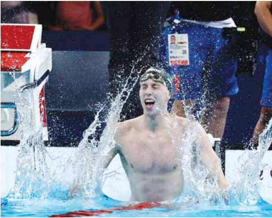
Daniel Wiffen of Ireland celebrates after breaking the Olympic record to win the men's 800m freestyle gold at the Paris La Defense Arena in Nanterre, France.