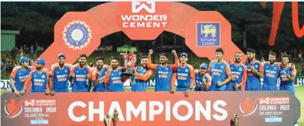
Indian players celebrate winning the three-match T20 series against hosts Sri Lanka in Pallekele yesterday. India yesterday won the third and final T20 in the Super Over after both sides were tied during regulation play. The two teams will turn their attention to a three-match ODI series. The matches will be played on August 2, 4 and 7. All matches will be played in Colombo.