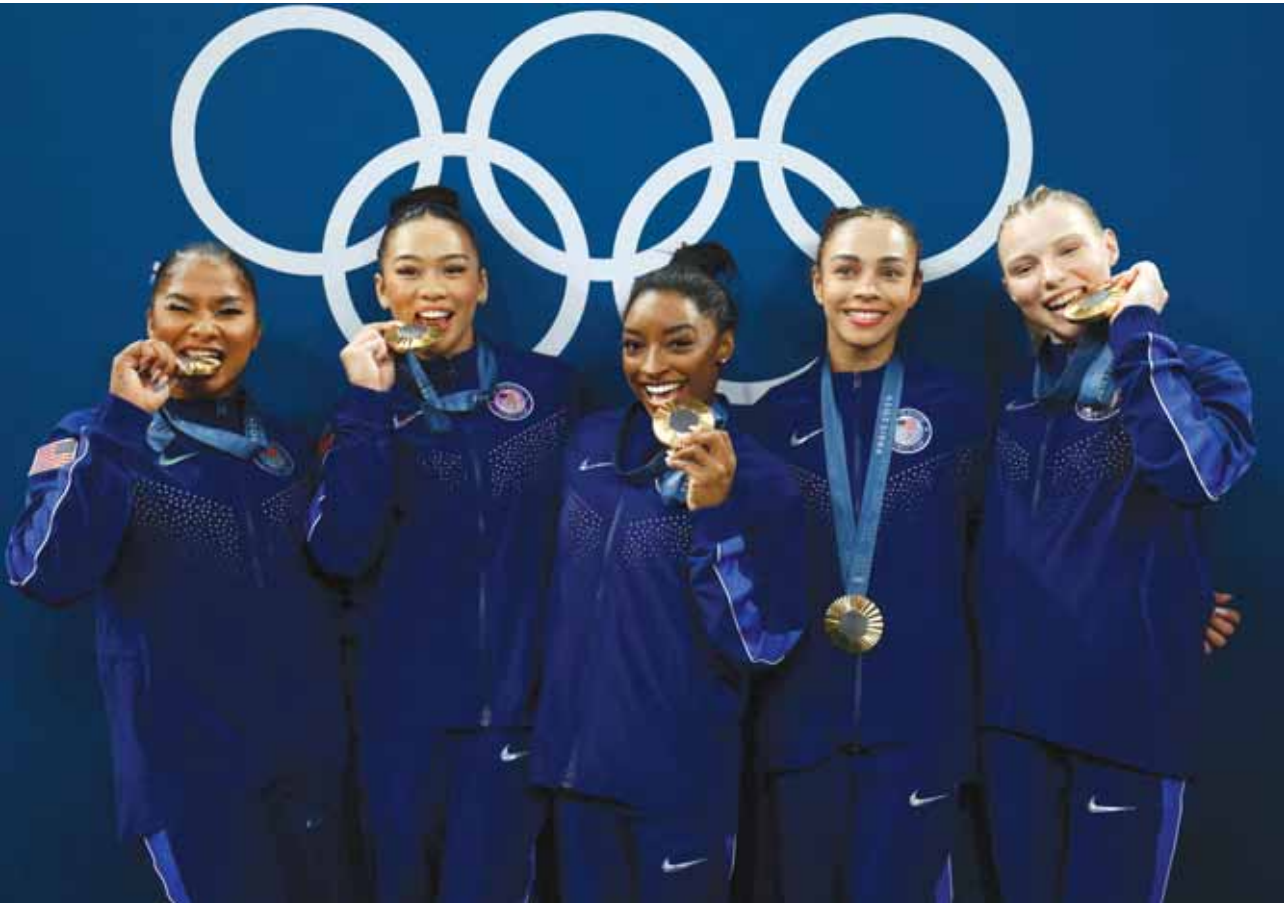
FROM LEFT: United States’ Jordan Chiles, Sunisa Lee, Simone Biles, Hezly Rivera and Jade Carey celebrate with gold medals after winning the artistic gymnastics team event at the Paris Olympic Games at Bercy Arena in Paris yesterday.

it marks a return to the Olympic summit after a two-year break as she focused on her mental health, and she said the sensation of her second team gold – eight years after her first in Rio, was different. “It was just like we were a little young