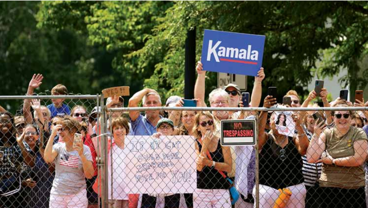
Supporters wave and holds signs as US Vice-President and Democratic presidential candidate Kamala Harris arrives to speak during a campaign fundraising event at the Colonial Theater in Pittsfield, Massachusetts, on Saturday.