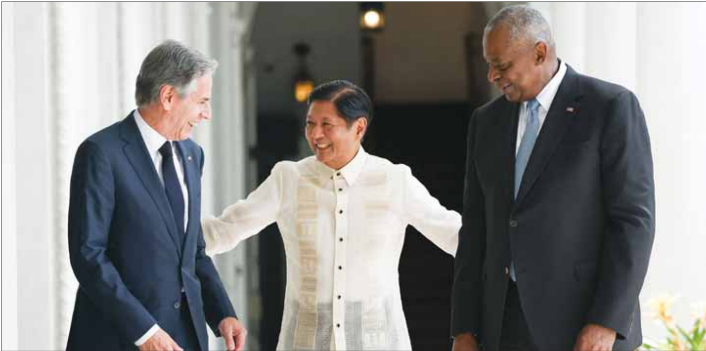
Philippines' President Ferdinand Marcos Jr (centre) greets US Secretary of State Antony Blinken (left) and US Secretary of Defence Lloyd Austin during a courtesy visit at the Malacanang Palace in Manila yesterday.