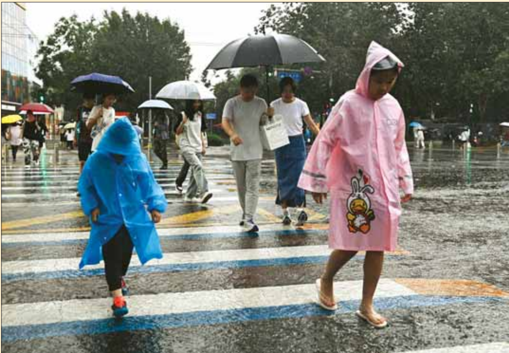
People walk through a rainstorm in Beijing yesterday.

Record rainfall and widespread flooding killed four people in China's southern province of Hunan, with roads in rural areas damaged and access to electricity and the internet disrupted, state media said yesterday. Days of heavy rains from the remnants of Typhoon Gaemi have breached major dikes and dams and flooded swathes of cropland, with state broadcaster CCTV saying the finance ministry has earmarked funds of 238mn yuan ($33mn) for disaster prevention and agricultural aid. Weather experts blamed the heavy rain on a combination of a southwest monsoon and the outer cloud system from Gaemi, which made landfall in China last week. In Zixing county, the extreme weather fuelled by the most powerful tropical cyclone to hit China this year has affected almost 90,000 people, damaging about 1,400 homes and tearing up about 1,300 roads, the People's Daily said on its website.