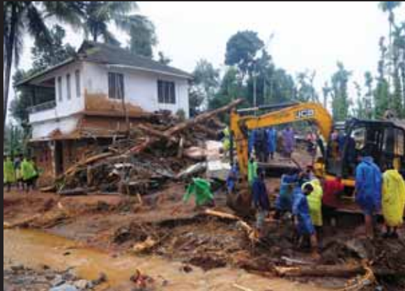
Rescuers search for survivors at a landslide site after multiple landslides in the hills in Wayanad yesterday.