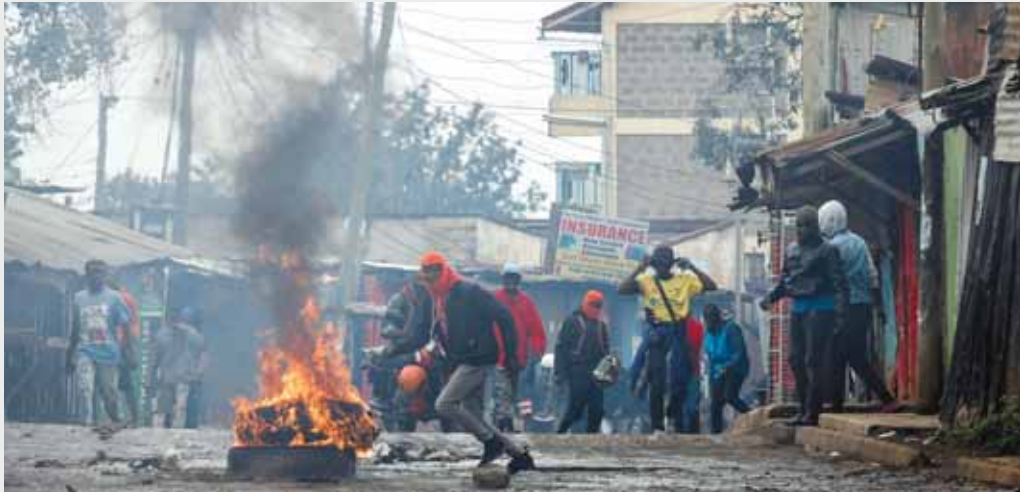
Demonstrators light a bonfire to barricade a road as they protest to advocate for the reopening of the Woodley grounds as a public amenity and better services from the Nairobi County government, in Kibera district, Kenya, yesterday.