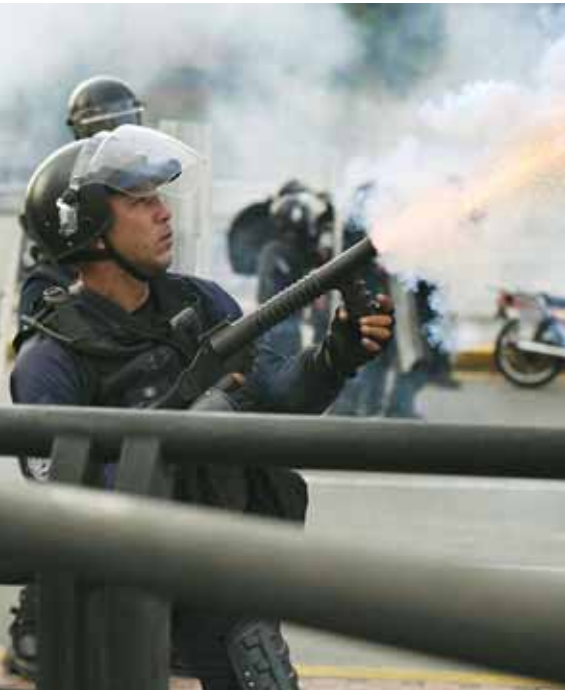
A police officer fires tear gas during a protest against Maduro's government in Caracas.