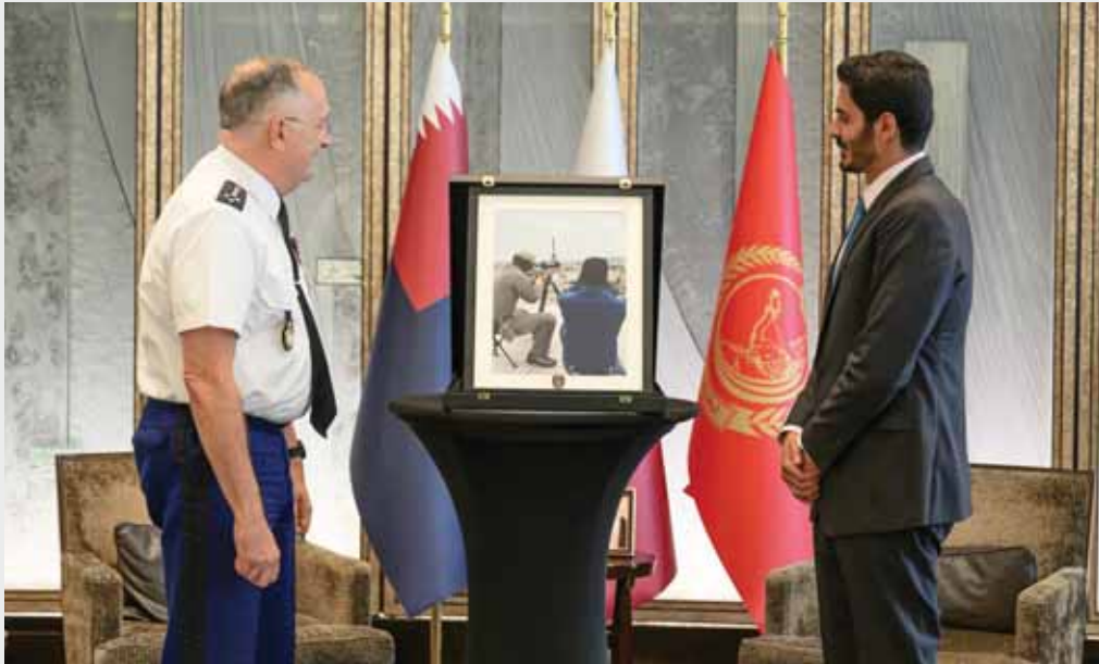
HE the Minister of Interior and Commander of the Internal Security Force (Lekhwiya) Sheikh Khalifa bin Hamad bin Khalifa al-Thani met in Paris yesterday with Director General of the French National Gendarmerie Lieutenant General Christian Rodriguez. The meeting discussed co-operation relations between Lekhwiya and the French National Gendarmerie. (QNA)