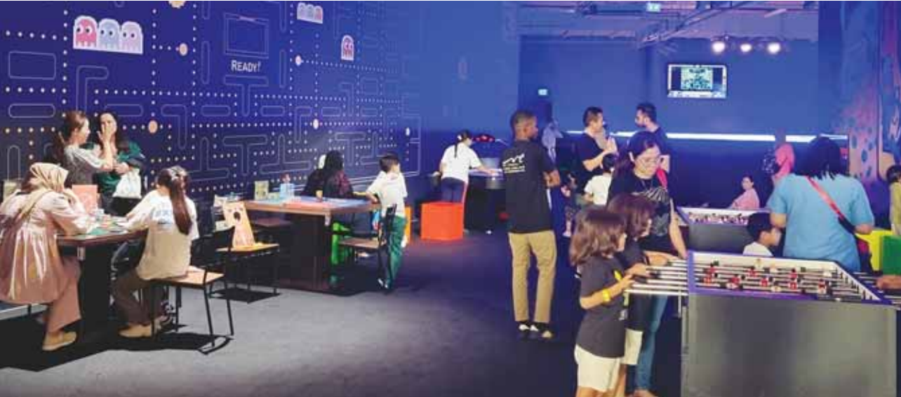
The arcade zone at Msheireb Galleria.