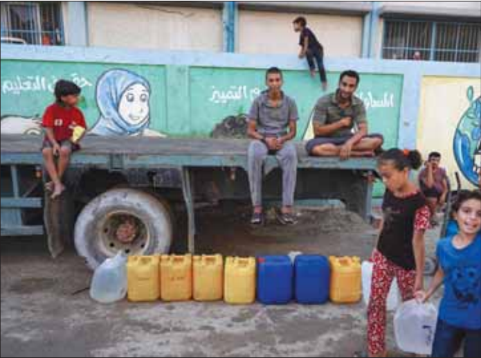
Displaced Palestinians queue for water supply in Khan Younis in the southern Gaza Strip, yesterday, amid the ongoing conflict.