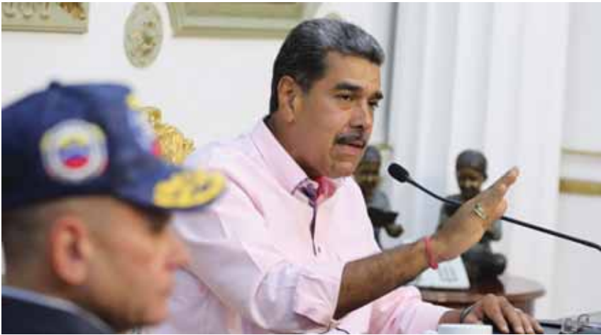
This handout picture released by Venezuelan Presidency shows President Maduro addressing the nation after the Venezuelan presidential election.