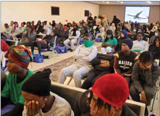
Irregular Nigerian migrants, who voluntarily agreed to be deported home, sit waiting at the anti-migration bureau, tasked with co-ordinating deportations of foreigners who are in the country illegally, before departing to Mitiga International Airport in Tripoli, yesterday.