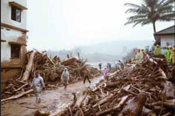
People walk past debris at a landslide site in Wayanad, yesterday.