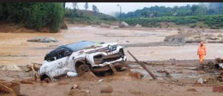
A rescuer walks past a damaged car at a landslide site after multiple landslides in the hills in Wayanad, Kerala, India, yesterday.

Several estates in the district were hit by two successive landslides before dawn when most of their inhabitants were asleep.