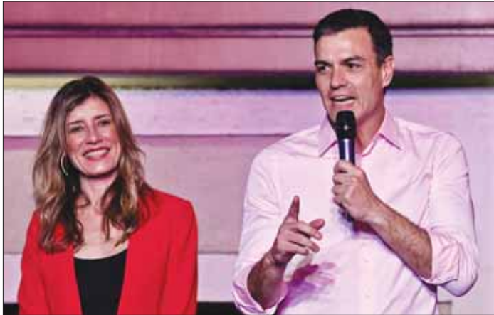
Spanish Prime Minister Pedro Sanchez next to his wife Begona Gomez during an election night rally in Madrid in 2019.