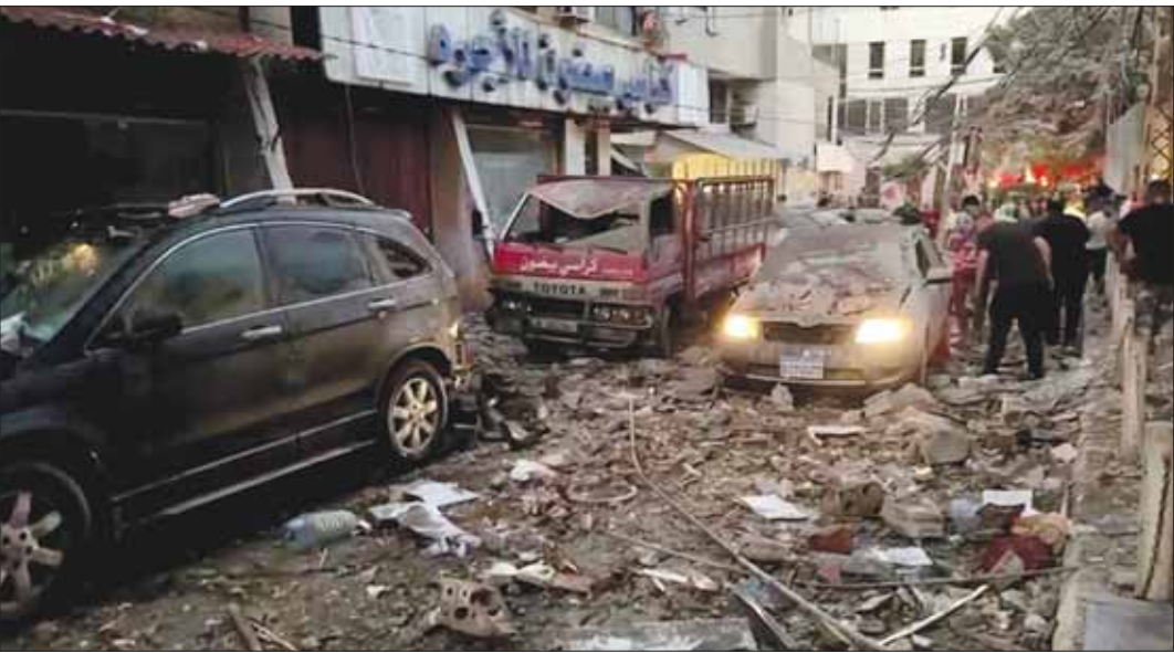
Damaged vehicles are seen after an Israeli strike on Beirut's southern suburbs, yesterday.