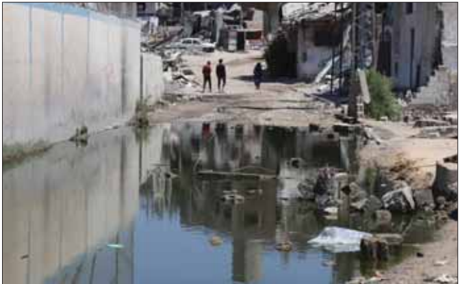
Palestinians walk near a puddle of waste water, in Khan Younis in the southern Gaza Strip, yesterday.

The World Health Organisation said it was "looking at a very problematic situation".