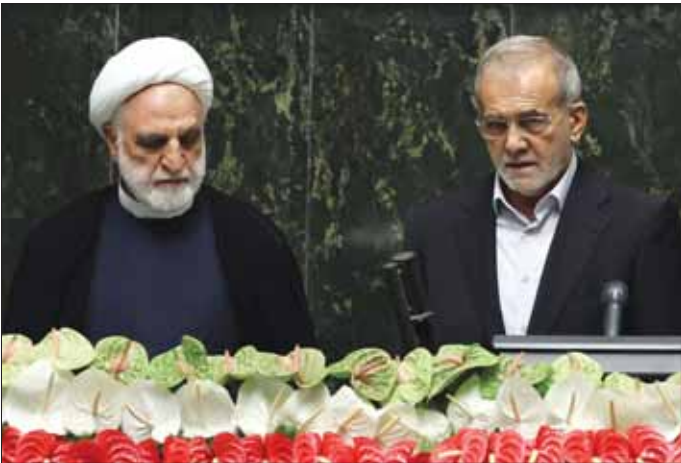
New Iranian President Masoud Pezeshkian stands next to Iranian judiciary chief Gholam Hossein Ejeie (left) during a swearing in ceremony at the parliament in Tehran, yesterday.

"Supporting the cause of the oppressed Palestinian nation will continue with strength, and no factor can disrupt our will in this direction," said Pezeshkian on Monday. Yesterday's swearing-in ceremony came amid concerns of war between Israel and Lebanon's Hezbollah following a Saturday rocket attack on the Israeli-annexed Golan Heights. Israel has accused Hezbollah of responsibility for the attack that killed 12 children but the Lebanese group has denied any involvement. During his inauguration speech, Pezeshkian slammed Israel's "crimes" in the Gaza Strip with some Iranians present in parliament chanting "Death to Israel, Death to America!" "Those who supply the weapons that kill children in Gaza cannot teach humanity and tolerance to others," he said in reference to the US. Iran has made support for the Palestinian cause a centrepiece of its foreign policy since the 1979 revolution, and hailed Hamas's October first week storming of Israel. Iran's president is not head of state, and the ultimate authority rests with the supreme leader — a post held by Khamenei for the last 35 years. On Monday, Pezeshkian