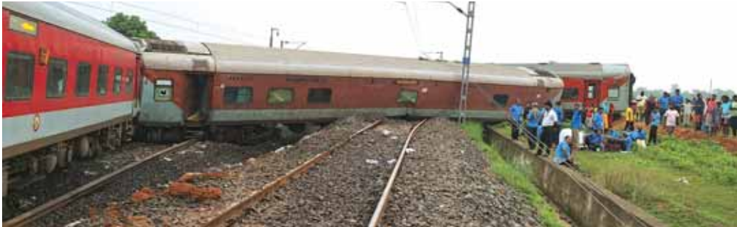
People gather near the Howrah-Mumbai Express train that derailed near Jamshepur in India's eastern state of Jharkhand yesterday.

Indian Railways, the world's fourth-largest rail network, runs some 14,000 trains daily with 8,000 locomotives over a vast system of tracks some 64,000km long. The trains carry more than 21 million people each day.