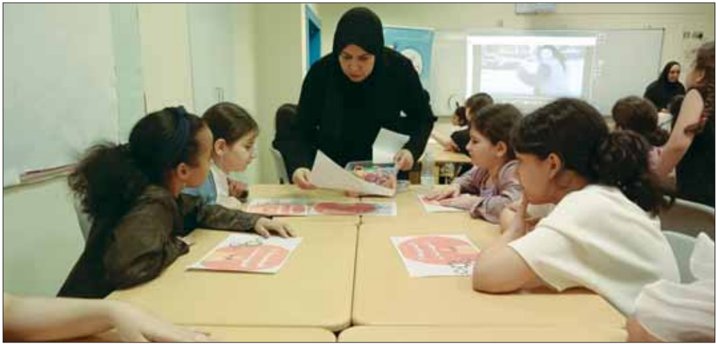
Students engaged in an activity during the programme.