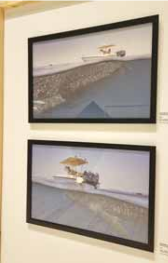
Qatari photographer Azzam al-Mannai's work on display at Skillfest at Msheireb Galleria.