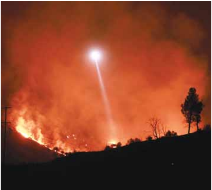
A helicopter is seen flying over the Borel Fire near Lake Isabella, California.