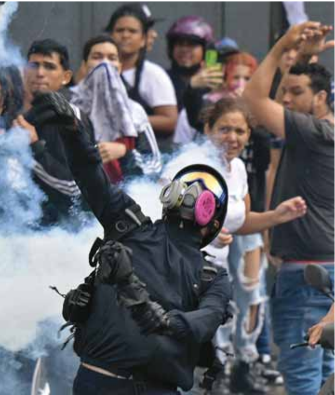
Right: Opponents of Maduro's government clash with police in Caracas neighbourhood.