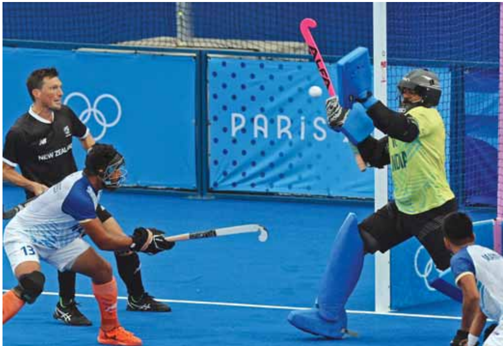
India's goalkeeper PR Sreejesh saves a shot during the men's pool B match against New Zealand during the Paris 2024 Olympic Games at the Yves-du-Manoir Stadium in Colombes yesterday.

Second-ranked Britain walloped Spain 4-0 in the early Pool A game while in Pool B reigning champions Belgium won 2-0 against an Ireland team that missed qualifying for the Tokyo Games and Australia edged Argentina 1-0 in the tightest game so far. So far 22 goals have been scored in the men’s Pool A, compared with only eight in Pool B.