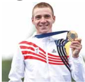
Gold medalist Belgium's Remco Evenepoel celebrates on the podium of the men's road cycling individual time trial in Paris yesterday.

British hope Josh Tarling finished fourth, two seconds behind Van Aert, after losing time on an early puncture. A day after it rained on the opening ceremony, dark skies hung low again over Paris as the first cycling event embarked from the military museum at Invalides. At the ramps where riders set off at one-minute intervals, Tarling and Ganna were pre-race favourites. Evenepoel set off at a lightning pace and was in the