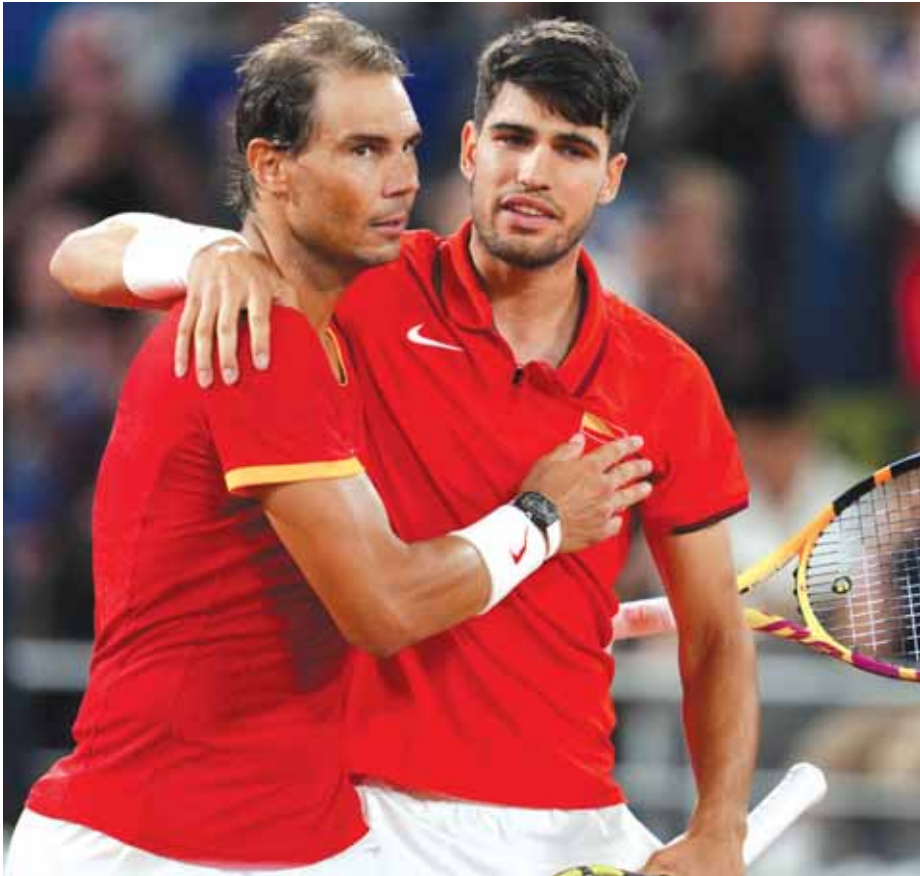
Spain's Rafael Nadal (left) and Carlos Alcaraz celebrate after winning their first round doubles match against Maximo Gonzalez and Andres Molteni of Argentina at the Paris Olympics.

to level. Nadal secured another key break with a rasping backhand return to allow him and his partner to lead 5-4 and the opportunity to serve for the match. That honour fell to the 22-time Grand Slam title champion and victory was secured when Alcaraz slapped the winning forehand crouching at the net.