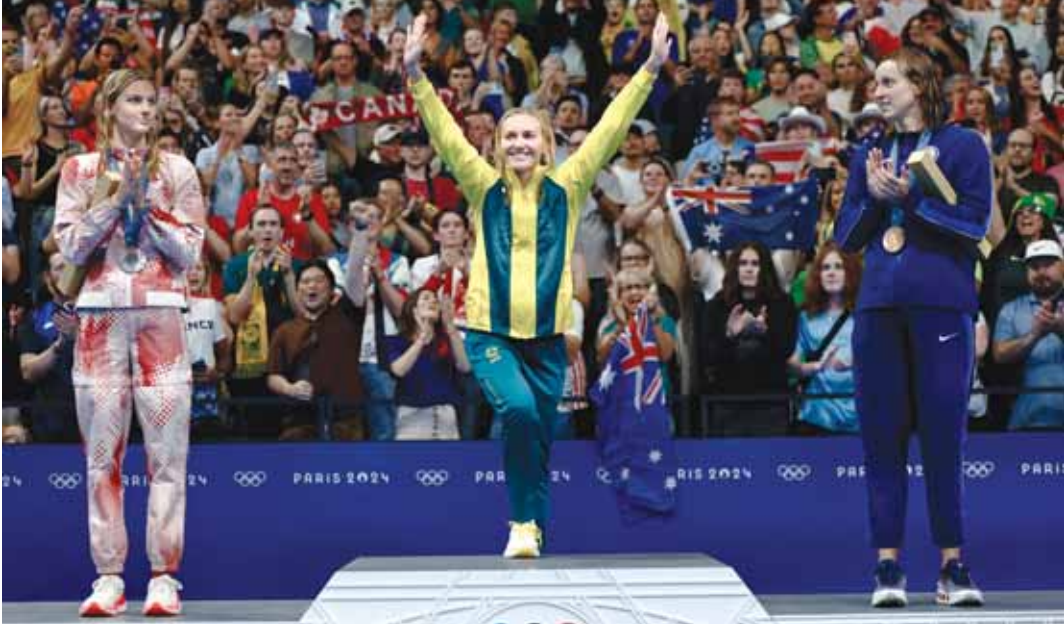
Gold medalist Ariarne Titmus (centre) of Australia, silver medalist Summer McIntosh (left) of Canada and bronze medalist Katie Ledeccky of United States celebrate at the 400m freestyle podium ceremony.

AFP Paris Ariarne Titmus dominated rivals Katie Ledeccky and Summer McIntosh to retain her Olympic 400m freestyle title yesterday as German Lukas Maertens surged to the men's gold on day one in the pool in Paris. The decorated American Ledeccky was gunning for revenge after the Australian dethroned her in Tokyo three years ago, but it was Titmus who again prevailed in an electric atmosphere at La Defense Arena. The 23-year-old world record holder led from start to finish to hit the wall in 3mins 57.49 secs and remain unbeaten over the distance since 2019. Ledeccky had to settle for bronze after fading badly over the final lap, adding to her cache of 10 Olympic medals, seven of them gold. Canadian teenager McIntosh grabbed silver after reeling in the American great to clinch her first Olympic medal, after coming fourth in Tokyo as a 14-year-old. "I know what it takes to be a champion and I know how hard it is racing in these circumstances," said Titmus, who came to Paris after swimming the second fastest time in history last month. "An Olympic Games - it's not really like anything else. I probably felt the expectation and pressure for this