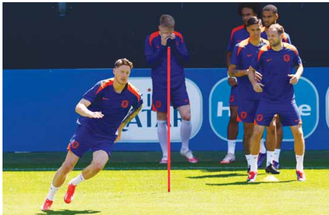
Netherlands' Wout Weghorst with his teammates during a training session in Wolfsburg yesterday.

Dutch win Nations League semi: The only competitive meeting of the teams since Euro 96 came in the semi-finals of the inaugural UEFA Nations League in 2019. Southgate was already England's manager and Koeman was in his first spell as Dutch coach as the teams clashed in Guimarães, Portugal. Marcus Rashford put England ahead from a penalty but Matthijs de Ligt levelled, taking the game to extra time. Kyle Walker's own goal gave the Dutch the lead and Quincy Promes sealed a 3-1 victory for the Netherlands, who would lose the final to hosts Portugal.