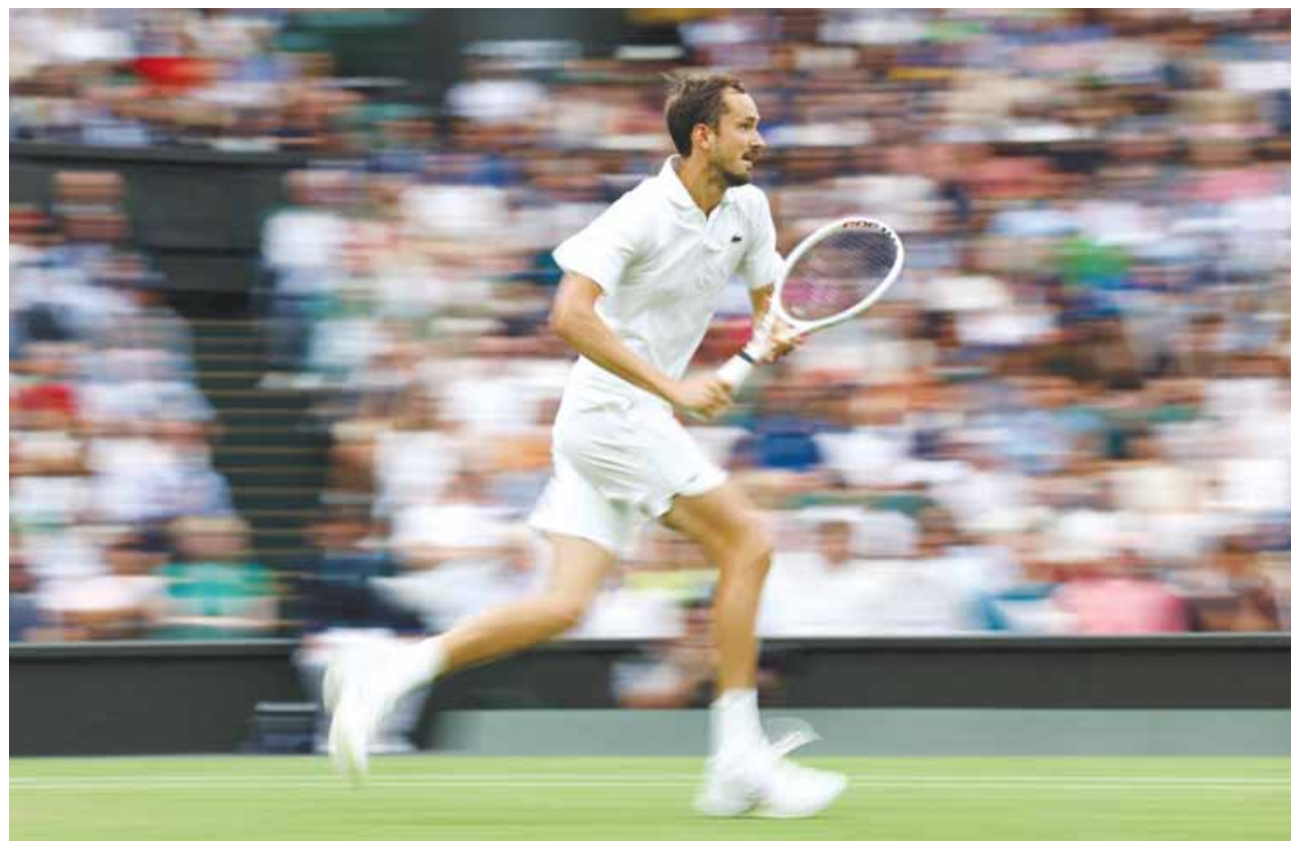
Russia's Daniil Medvedev in action during his quarter-final match against Italy's Jannik Sinner on the Centre Court at All England Lawn Tennis and Croquet Club, London, Britain, yesterday.

22-year-old resumed play and thrilled the Centre Court crowd when he bravely clawed his way back to 5-5.