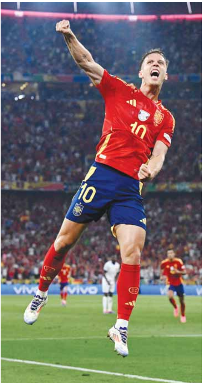
Spain's Dani Olmo celebrates their second goal yesterday.

BARCELONA WINGER, 16, BECOMES THE YOUNGEST EUROPEAN CHAMPIONSHIP GOALSCORER