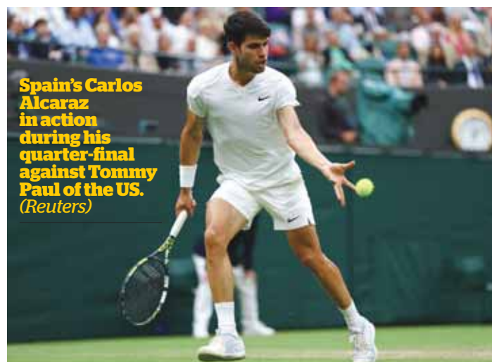
Spain's Carlos Alcaraz in action during his quarter-final against Tommy Paul of the US.

"If I'm struggling a little bit to find the solutions, if the opponent is playing great tennis and I don't get him in trouble, I believe at the