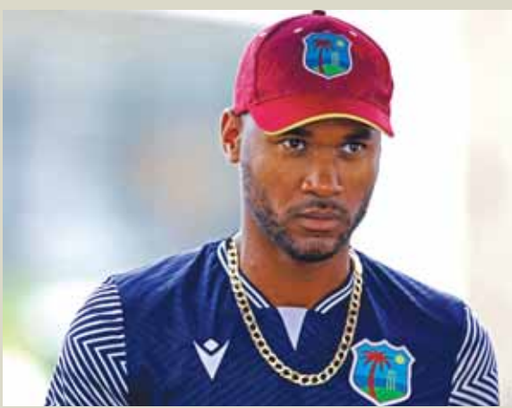
West Indies' Kraigg Brathwaite during a practice session at Lord's Cricket Ground, London, Britain, yesterday.