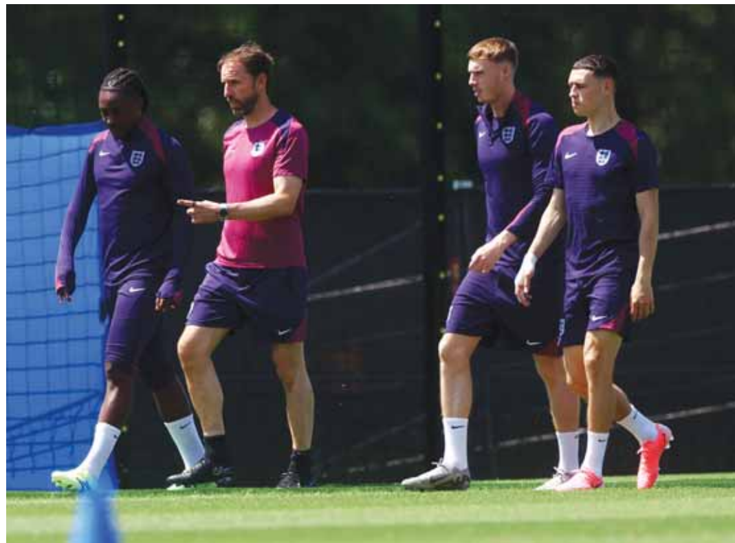
England manager Gareth Southgate, players Phil Foden, Cole Palmer and Eberechi Eze during a training session in Blankenhain, Germany, yesterday.

'We've got a lot of players who have experienced big games at international and club level'