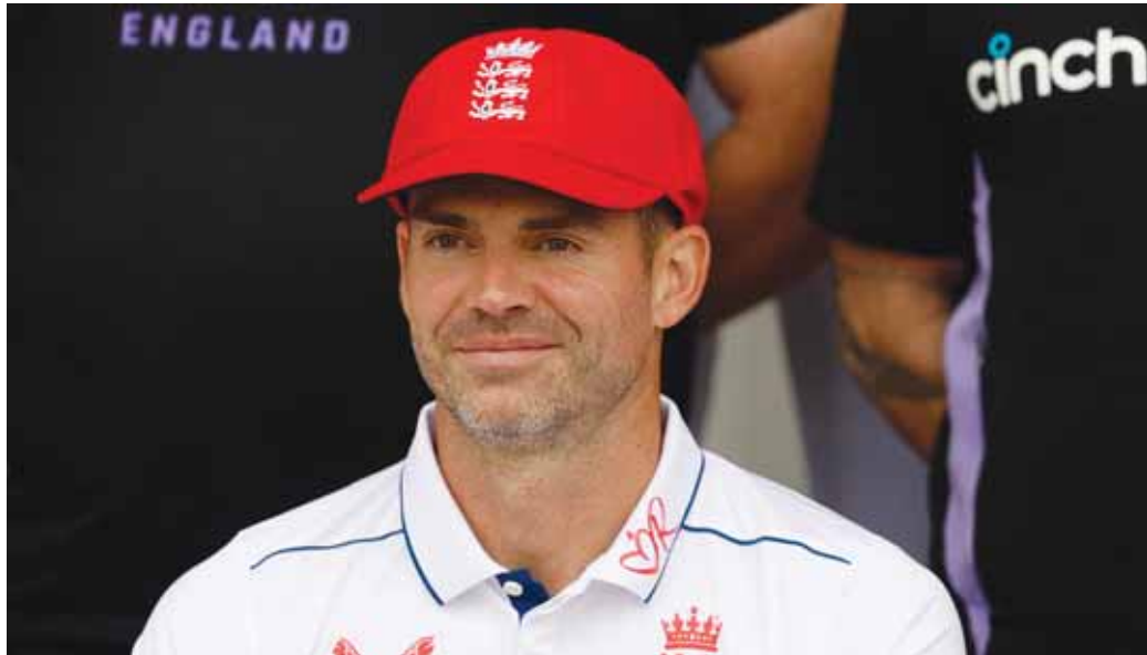
England's James Anderson is seen posing for a team group photo ahead of the Test series at Lord's Cricket Ground in London yesterday.