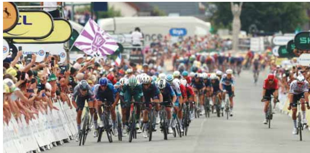
Alpein-Deceuninck's Jasper Philipsen in action with riders before crossing the finish line to win stage 10 of the 111th Tour de France from Orleans to Saint-Amand-Montrond - Orleans, France, yesterday.

"It was maybe a mental rest day," Philipsen said apologeti-