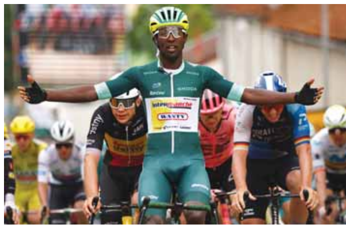
Eritrean rider Biniam Girmay wearing the sprinter's green jersey cycles to the finish line to win the 8th stage of the 111th edition of the Tour de France cycling race, 183.5km between Semur-en-Auxois and Colombey-les-deux-Eglises, yesterday.

E ritrean sprinter Biniam Girmay won stage eight of the Tour de France yesterday at a finish line in the village where former French president Charles de Gaulle lived and is buried. Girmay became the first black African to win a stage on the Tour de France on stage 8. "One win on the Tour is amazing but to win a second on a stage like this, that suits me, I feel just amazing," said the smiley Girmay. Overnight leader Tadej Pogacar retained his 33-second lead over Remco Evenepoel in the general standings while defending champion Jonas Vingegaard is third. Girmay's second stage win after his historic triumph at Turin on Monday extended his lead atop the best sprinter standings in the green jersey. The final sprint was raced up an incline that favoured the more slightly built sprinters even though Jasper Philipsen, the 2023 green jersey, came second while Belgian 22-year-old Arnaud de Lie was third. Girmay is the first rider to win