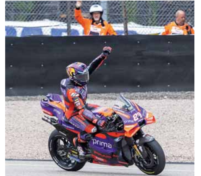
Prima Pramac Racing's Spanish rider Jorge Martin clenches his fist after winning during the sprint race of the German Motorcycle Grand Prix at the Sachsenring racetrack in Hohenstein-Ernstthal, Germany, yesterday.

Marquez, who has won a record eight German MotoGPs, managed this despite a broken left index finger and a bruised ribcage following a heavy fall on Friday.