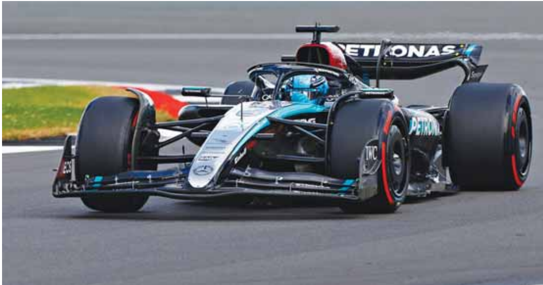
Mercedes' George Russell during qualifying for the British Grand Prix Silverstone Circuit, Silverstone, Britain, yesterday.

Hamilton went fastest of the three, Norris aborted his lap and Russell grabbed pole at the chequered flag in one minute 25.819