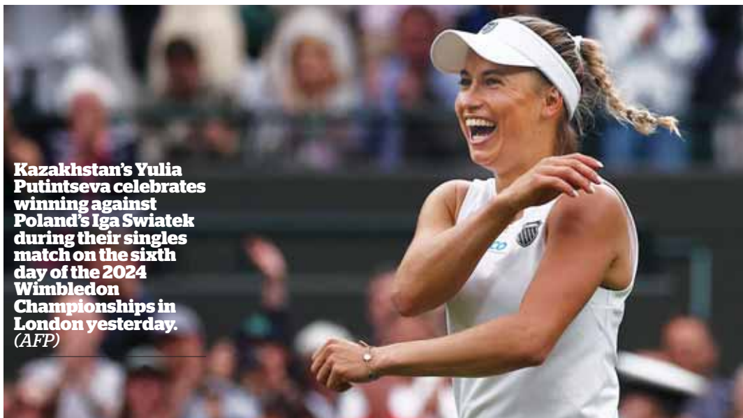
Kazakhstan's Yulia Putintseva celebrates winning against Poland's Iga Swiatek during their singles match on the sixth day of the 2024 Wimbledon Championships in London yesterday.

W orld number one Iga Swiatek was dumped out of Wimbledon by Yulia Putintseva in a thrilling game of tennis. On a dramatic, if cold and wet day at the All England Club, Andy Murray's Wimbledon career ended with a whimper when Emma Raducanu pulled the plug on their mixed doubles plans. Also yesterday, Novak Djokovic reached the Wimbledon fourth round for the 16th time with a battling 4-6, 6-3, 6-4, 7-6 (7/3) win over Australia's Alexei Popyrin. Djokovic, chasing a record-equalling eighth title at the All England Club and 25th Grand Slam, has now made the last 16 at the majors for a 65th time.