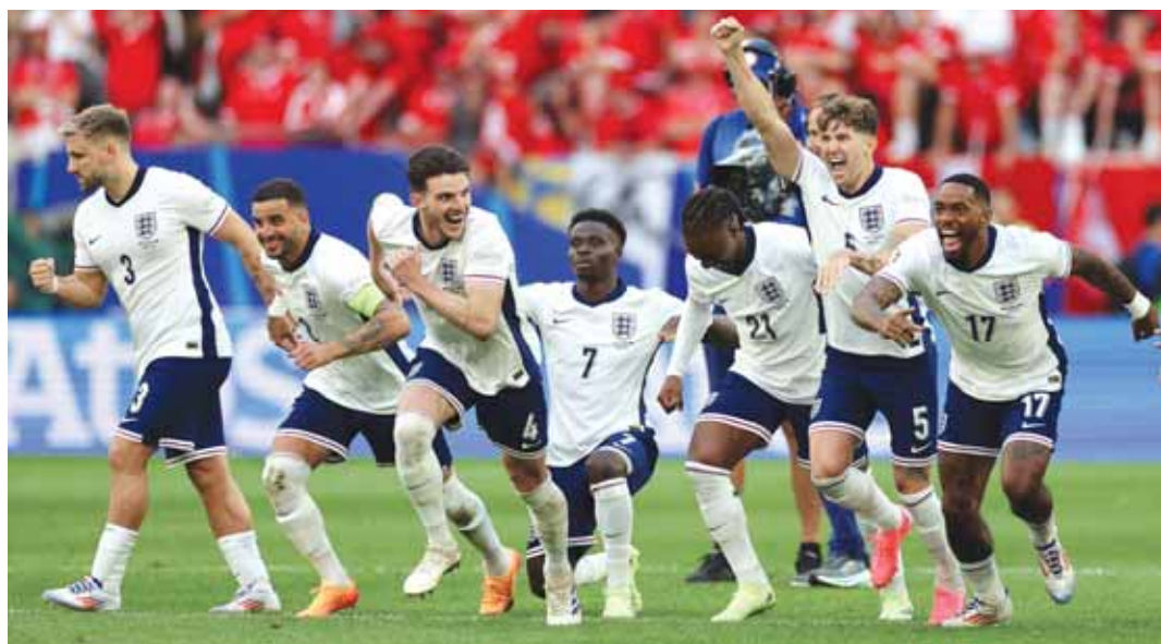
England's players celebrate at the end of the penalty shootout as they win the UEFA Euro 2024 quarter-final against Switzerland at the Duesseldorf Arena in Duesseldorf yesterday.

By contrast, England march on despite another in a string of underwhelming performances from Gareth Southgate's men. In