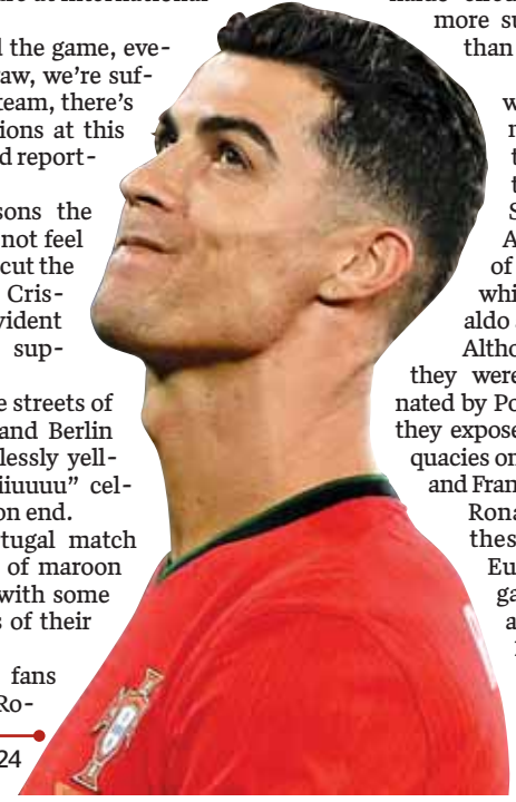
Portugal's forward Cristiano Ronaldo reacts after the UEFA Euro 2024 quarter-final match against France in Hamburg yesterday.

Ronaldo admitted these will be his last Euros, but as Portugal now turn their attention to the 2026 World Cup, their chances will surely be magnified without the preening, past-it hitman.