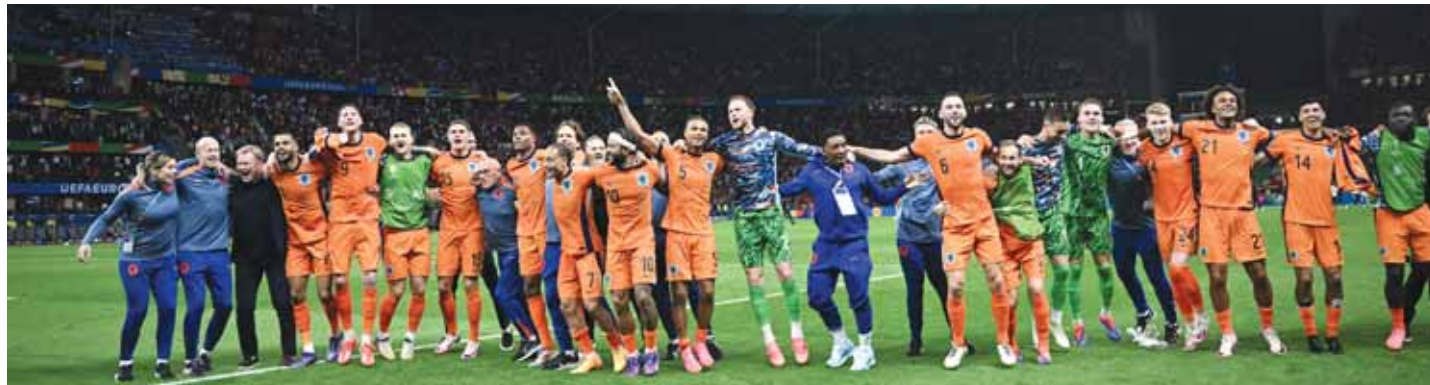
Netherlands players celebrate after their Euro 2024 quarter-final win against Turkiye in Berlin yesterday.

Netherlands overcame the pressure from the stands and Turkiye's energetic style, as well