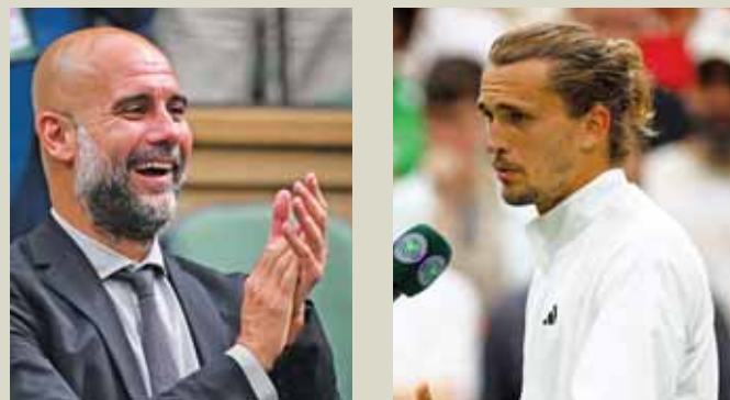
Manchester City's Spanish coach Pep Guardiola (left) reacts as Germany's Alexander Zverev gives a speech after winning his third round match against Britain's Cameron Norrie.

London: Germany's Alexander Zverev asked Manchester City coach Pep Guardiola to come back to Bayern Munich yesterday after the Spaniard watched him reach the fourth round of Wimbledon. Fourth seed Zverev was watched by a Royal Box full of sporting greats including Guardiola as he battled past Cameron Norrie, winning the first two sets 6-4 and then surviving a 32-point third-set tiebreak to triumph. Speaking on Centre Court, Zverev said the sight of the former Bayern Munich manager in the front row of the Royal Box had made him nervous, although his play was dazzling. "For me and for all tennis players it's an honour to play on this beautiful Centre Court and in front of the Royal Box, we had so many sporting legends today," Zverev said. "For me Pep Guardiola - when I saw Pep I got so nervous for a few games. Thanks a lot for coming, it's a privilege to play. Last thing - Bayern Munich needs