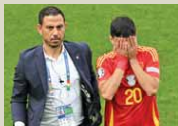
Spain's midfielder Pedri leaves the pitch after being injured during the Euro 2024 quarter-final against Germany in Stuttgart yesterday.

Spain face France in the last four in Munich on Tuesday. Dani Olmo is expected to replace Pedri in Luis de la Fuente's starting line-up after scoring the opening goal and then assisting Mikel Merino's late winner against the hosts.