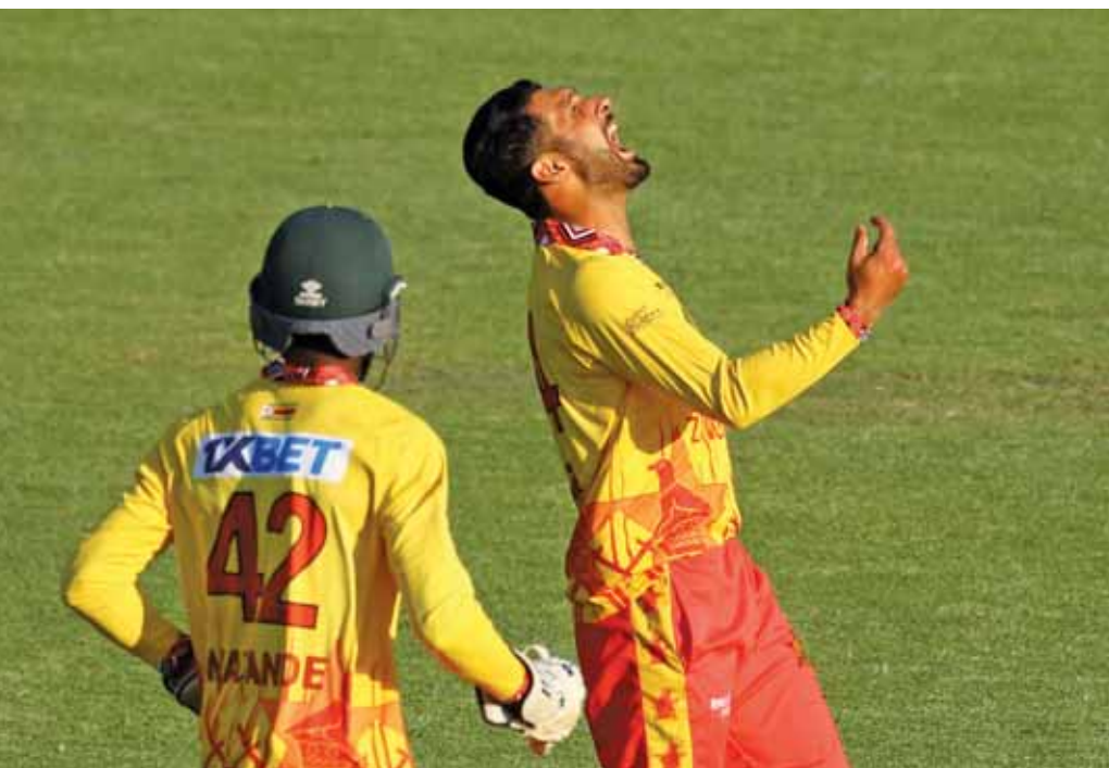
Zimbabwe's Sikandar Raza (right) celebrates after a dismissal during the first T20I against India at Harare Sports Club in Harare yesterday.

It became 43 for five when Dhruv Jarell was caught at cover and India's hopes effectively ended when Gill was sixth out, bowled by opposite number Sikandar Raza hitting across the