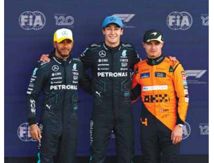
Mercedes' George Russell (centre) poses after qualifying in pole position with second-placed Mercedes' Lewis Hamilton and third-placed McLaren's Lando Norris at Silverstone Circuit yesterday.

seconds. Seven-times world champion Hamilton, a record eight-times winner at Silverstone, set a time of 1:25.990 and Norris 1:26.030.