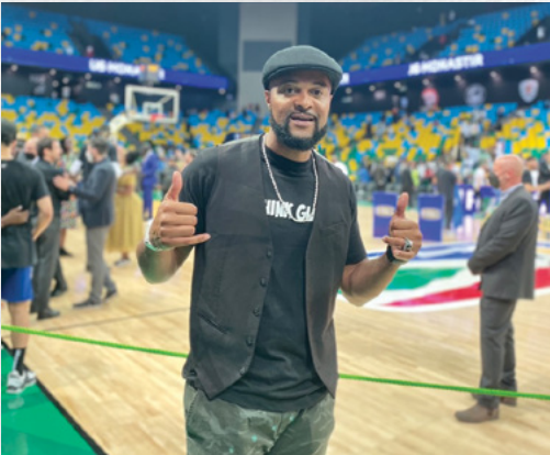
May 2022 - At the BAL Finals at BK Arena.

Embarking on my first journey to Rwanda in July 2018 was not just about exploring a new destination; it was an immersion into a country that would captivate my heart and become a recurrent chapter in my travel adventures. Hailing from Seattle, Washington, and currently residing in Doha for the past decade, living in Qatar has afforded me the opportunity to traverse more than half of the 50 countries on my travel list.