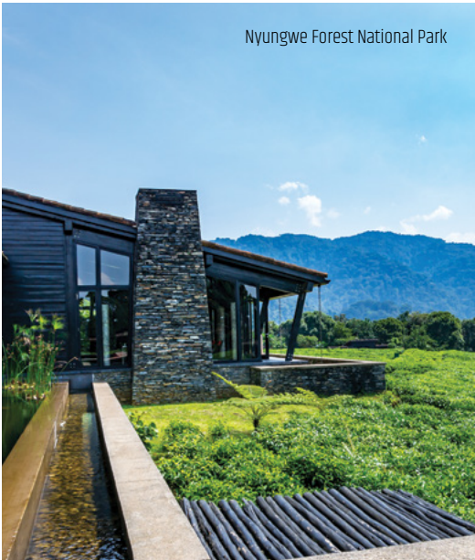
Nyungwe Forest National Park

Venture into the lush greenery of Nyungwe Forest National Park, located in the southwestern part of Rwanda. This ancient rainforest is a haven for biodiversity, housing over 1,000 plant species and a variety of primates, including chimpanzees and colobus monkeys. Canopy walks and hiking trails allow visitors to immerse themselves in the natural beauty of the forest.