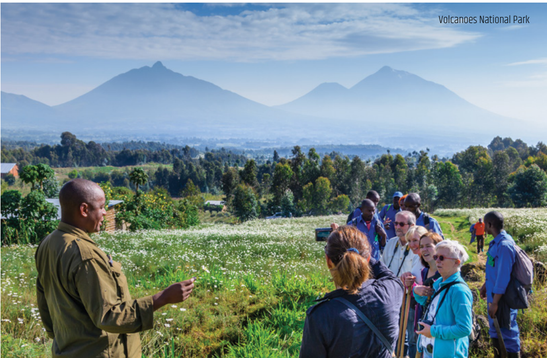
Volcanoes National Park

Embark on a safari adventure in Akagera National Park, located in eastern Rwanda. The park's diverse landscapes, including rolling hills and lakes, create a picturesque setting for game drives. Encounter