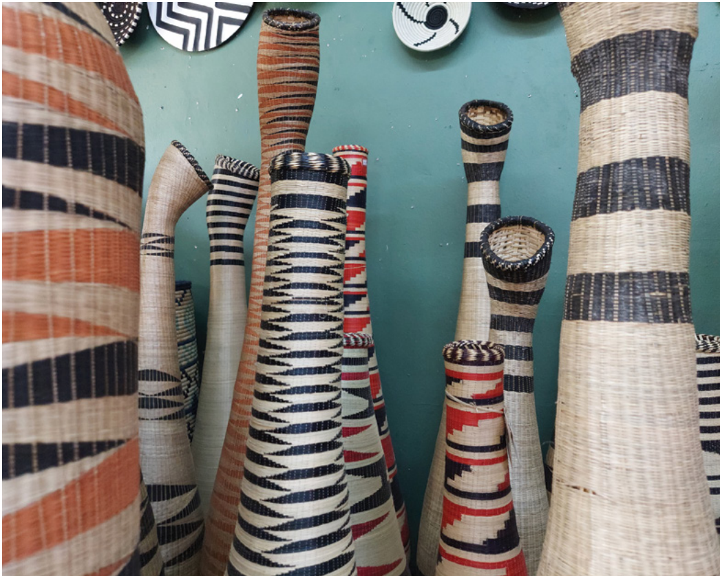
A wonderful and amazing picture of handicrafts made by Rwandan women's hands

resulting in a visually stunning piece of art. Imigongo art has gained recognition not only for its aesthetic appeal but also for its cultural significance in preserving Rwandan history and traditions.