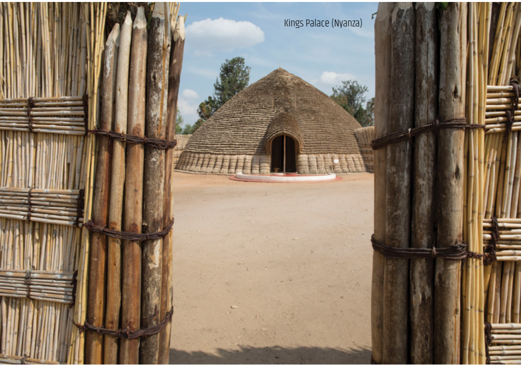
Kings Palace (Nyanza)