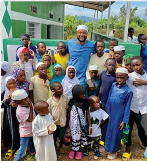
May 2022 Eid Al-Fitr - At a community Masjid in Mwendo, Kigali for Eid celebrations.

The country has not only become a sought-after destination for travellers but also a hub for hosting large-scale events. From the Tour du Rwanda to the Gorilla Naming Ceremony (Kwita Izina) and the Kigali Up Music Festival, Rwanda exudes a dynamic energy. Personally, attending the NBA Africa's Basketball African League (BAL) finals at the impressive 10,000-seat BK Arena inspired a new chapter in my life. It led to the establishment of Azomco Global, a basketball consulting agency based in Bugesera, Rwanda, currently employing five local Rwandans and a 14-player men's team who is participating in the Rwandan Basketball League. Our focus is on providing basketball development and playing opportunities for the youth.