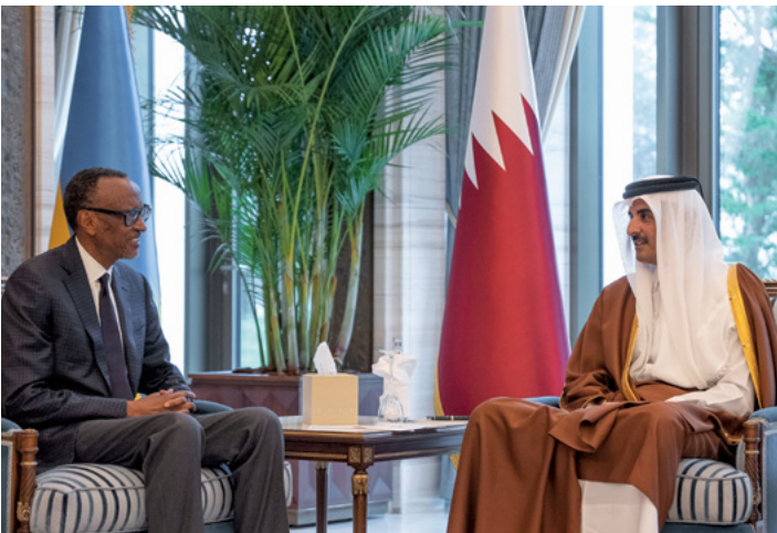
His Highness the Amir Sheikh Tamim bin Hamad Al-Thani met with the President of the Republic of Rwanda Paul Kagame at his office in Lusail Palace on 10 February 2024.

Qatar pursues the policy of openness, co-operation, and engagement with many sisterly and friendly countries and people, primarily the African nations which have close strategic ties with the state based on co-operation and solidarity towards global and continental issues. Qatar also strives to upgrade its investment programmes to serve the mutual interests with several nations.