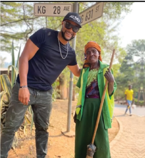
June 2023- Capturing a moment with a street cleaner in Kigali. It stands out as one of the cleanest cities I've visited.

Having had the privilege of visiting the Land of 1000 Hills ten times, each journey has been a transformative experience. As I eagerly anticipate my next trip to Rwanda, I wholeheartedly believe that others should share in the joy of discovering this enchanting country.