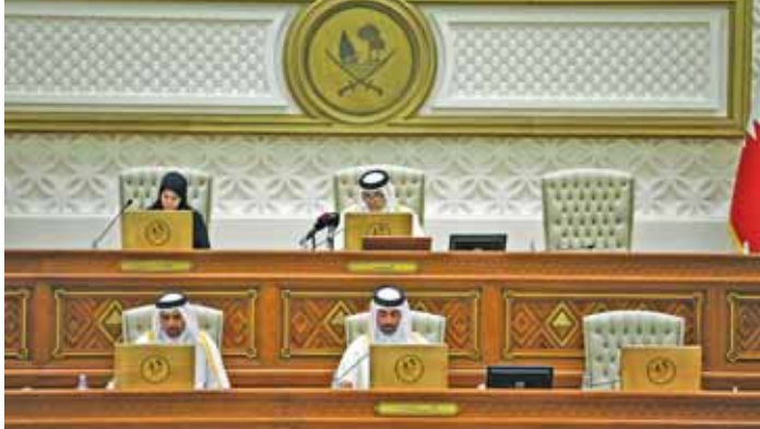
The Shura Council in session.

The proposal included a call for the necessity of co-ordination among the state competent authorities regarding the registration of escape cases for domestic workers during the validity of their employment contract with the competent authority, whereby transferring their sponsorship to other employers is prohibited.