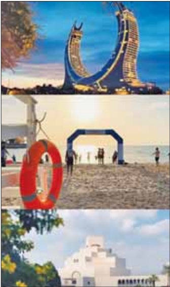
A Visit Qatar video showcases Qatar's iconic architecture and cultural offerings.

Visit Qatar is enticing travellers to make the most of their layovers in the country with a summer campaign highlighting diverse attractions. Through captivating social media posts and a new video series, Visit Qatar invites stopover passengers to discover the country's unique blend of modern architecture, cultural treasures, and warm hospitality. Among the highlighted destinations include Souq Waqif, a bustling marketplace offering a sensory feast with traditional crafts, antiques, and an array of culinary delights; Old Doha Port's Mina District, a colourful historical area filled with traditional architecture and charm; and The Pearl Island, an upscale waterfront destination boasting luxurious residences, waterfront restaurants, and shopping opportunities. Another video highlights the beauty and the various offerings of Old Souq Al Wakra, curated for those who want to spend a day trip. The Visit Qatar video also features the Katara – the Cultural Village, a cultural hub showcasing art, music, and traditional Qatari heritage; the world-class National Museum of Qatar, showcasing the country's rich history and culture; and the Museum of Islamic Art, a stunning