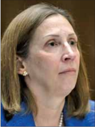
US ambassador Lynne Tracy

The Kremlin yesterday squarely blamed the United States for an attack on Crimea with US-supplied ATACMS missiles that killed at least four people and injured 151, and Moscow formally warned the US ambassador that retaliation would follow. The war in Ukraine has deepened a crisis in relations between Russia and the West, and Russian officials have said the conflict is entering the most dangerous escalation to date. But directly blaming the United States for an attack on Crimea — which Russia unilaterally annexed in 2014 although most of the world considers it part of Ukraine — is a step further. "You should ask my colleagues in Europe, and above all in Washington, the press secretaries, why their governments are killing Russian children," Kremlin spokesman Dmitry Peskov told reporters. At least two children were killed in the attack on Sevastopol on Sunday, according to Russian officials. People were shown running from a beach near Sevastopol and some of the injured being carried off on sun loungers. Kyiv did not comment on the attack. Russia said the United States had supplied the weapons, while the US military had aimed them and provided data. Russia's Foreign Ministry summoned US ambassador Lynne Tracy and told her Washington was "waging a hybrid war against Russia and has actually become a party to the conflict". "Retaliatory