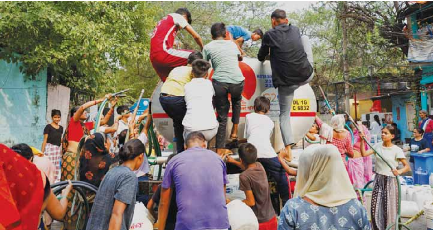
People rush to climb a water tanker as it arrives to deliver drinking water during the ongoing water crisis in New Delhi, India, yesterday.

ers thumped their desks in support, and opposition members waved the constitution in protest. He said he was "proud to serve" India. Minister of Parliamentary Affairs Kiren Rijiju yesterday called for a "peaceful and productive" session, but Indian media said they expected lively debate with a far stronger opposition. "All set to spar," one headline in the Hindustan Times read yesterday. "Resurgent opposition set to push government," said the Indian Express front page. Rahul Gandhi, 54, defied analyst expectations to help his Congress Party nearly double its parliamentary numbers, its best result since Modi was swept to power a decade ago. Parliamentary regulations require the opposition leader to come from a party that commands at least 10% of the lawmakers in the 543-seat lower house. The post has been vacant for 10 years because two dismal election results for Congress - once India's dominant party - left it short of that threshold. Newly-elected lawmakers will take their oaths over the first two days. Many will be watching if two lawmakers elected from behind bars, bitter opponents of Modi, will be allowed to join. One is the Sikh separatist Amritpal Singh, a fire-brand preacher arrested last year after a month-long police manhunt in Punjab state. The other is Sheikh Abdul Rashid, a former state legislator in Kashmir. It is unclear if either will be granted bail to attend the ceremony in person.