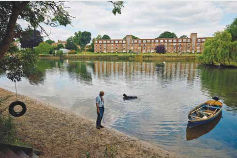
A man watches as his dog swims in the River Thames in Richmond, west London, yesterday. Three-quarters of UK rivers were found to be in poor ecological health by citizen scientists who took samples from waterways across the UK. Thousands of people measured their local water quality between June 7 and 10, collecting 1,300 datasets as part of the Great UK WaterBlitz campaign - with the picture around London and the Thames river basin described as particularly dire.