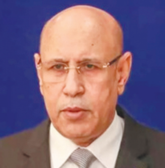
Mohamed Cheikh El Ghazouani

Vaccine sovereignty means helping countries take ownership of their own national strategies, as well as giving them the means to access the vaccines they need, especially in times of crisis and global supply-chain disruptions, such as the one we experienced during the Covid-19 pandemic. A unique strength of Gavi's model is that it is sustainable by design, pooling demand to secure affordable prices while asking