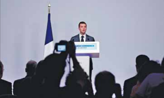
Jordan Bardella, President of the French far-right Rassemblement National (RN) party, during a press conference to present policy priorities as part of the campaign for the upcoming French parliamentary elections, in Paris, yesterday.

government has sent long-range missiles that can reach Russian territory, promised warplanes and called for European countries to send military personnel to Ukraine to train its troops. "I do not intend to call into question the commitments made by France on the international scene and harm our credibility at a time of war at Europe's door," Bardella said. But unlike Macron, who has been ambiguous on how far Paris could go in its commitment to Ukraine, Bardella said there was a line his government would not cross. "While I'm in favour of continuing to support Ukraine with logistics and defence equipment, my red line remains long-range missiles or any military equipment that could lead to escalation, by which I mean anything that could directly hit Russian cities," he said. Sending French troops to Ukraine would also be off limits, he said. While Macron would re-