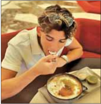
The campaign features the famous Um Ali dessert.

athlete Mutaz Barshim experiencing Qatar's curated summer offerings. Viewers are taken on a journey showcasing the country's best, from world-class shopping malls to pristine beaches and five-star dining experiences. A partnership between Visit Qatar and Qatar Airways offers stopover flight packages in Doha, designed to maximise the stopover experience. These packages include 24-hour check-in facilities and customisable add-on options like airport assistance, transfers, and curated tours. The campaign also highlights Qatar's vibrant culinary scene, featuring popular restaurants and traditional dishes such as the iconic Um Ali dessert served at Sheraton Grand Doha Resort and Convention Hotel. Even at Hamad International Airport, Visit Qatar noted that travellers could enjoy a seamless and relaxing stopover experience. The campaign features the airport's diverse retail and dining options, ensuring that even a brief transit is filled with enjoyable activities: "Who said transits have to be boring? Take a break from the hustle and bustle of travel to indulge in some retail therapy and delicious dining options." According to Visit Qatar, such tourism offerings during this period allow travellers to explore the country's hidden gems and create lasting memories.