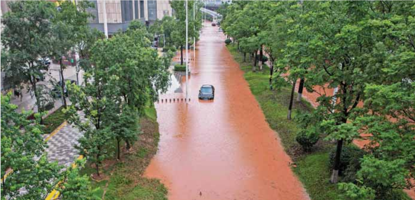
A car is stranded on a flooded street following heavy rains in Changsha, in central China’s Hunan province, yesterday. Mountain floods in central China have killed four people and left one other missing, state media reported yesterday, with torrential downpours expected to continue across much of the country in the coming days.

South Korea’s President Yoon Suk-yeol visited the scene of the accident. Interior Minister Lee Sang-min called on local authorities to take steps to prevent any hazardous chemicals from contaminating the surrounding area.