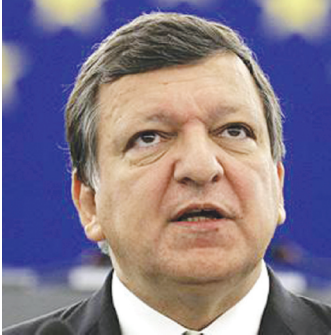
José Manuel Barroso

The Forum marked the beginning of a new era for immunisation and equity as Gavi sets out its plan to protect more children against more diseases than ever before. Now in its 25th year, Gavi has already vaccinated more than a billion children in lower-income countries — one-eighth of humanity.