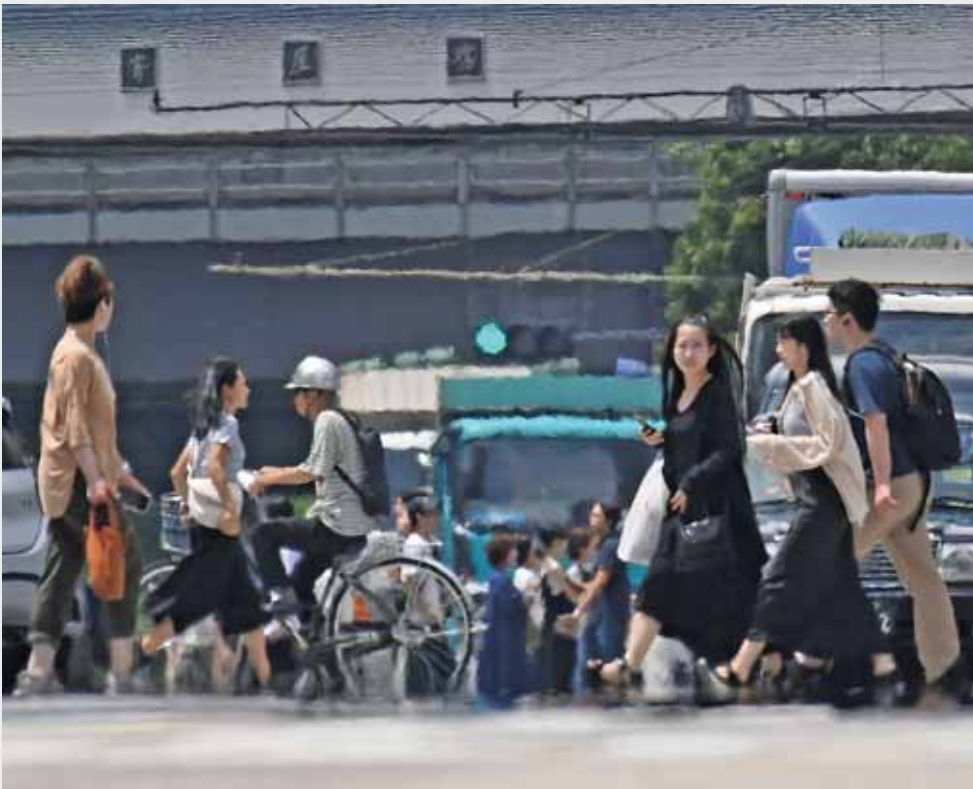
Pedestrians walk down a street during heatwave conditions in Tokyo, Japan, yesterday.