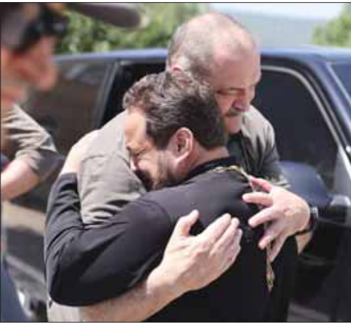
Dagestan region governor Sergei Melikov yesterday consoles a mourner during a visit to the Orthodox church, which was attacked by gunmen a day before, in Derbent.