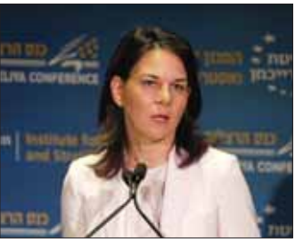
German Foreign Minister Annalena Baerbock.

rising anger at the plight of civilians in Gaza undermined Israel's security. Fears are growing that a war that has already killed tens of thousands in Gaza could spill into neighbouring countries. Prime Minister Benjamin Netanyahu signalled on Sunday that Israel could move more troops to the north, where fighting against the Hezbollah militia has escalated on the border with Lebanon. Hezbollah began trading fire with Israel on October 8, a day after its Palestinian ally