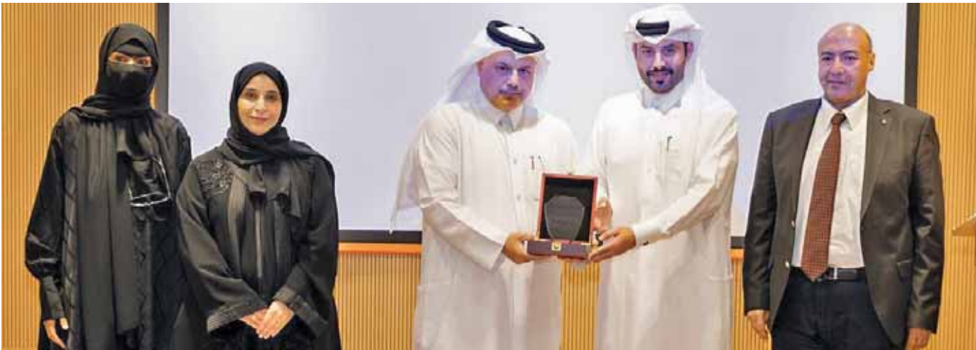
Officials at the ceremony honouring the School Wellness Programme participants.