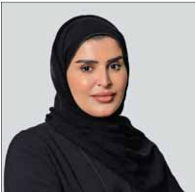
HE the Minister of Social Development and Family Maryam bint Ali bin Nasser al-Misnad

HE the Minister of Social Development and Family Maryam bint Ali bin Nasser al-Misnad said MSDF intends to build financial awareness based on Islamic values in spending, as well as relying on models for managing financial life that are closely intertwined with the variables of global economic movements, emphasising that the ministry seeks to steer youth and newly formed families away from excessive consumption and unnecessary luxuries, to build