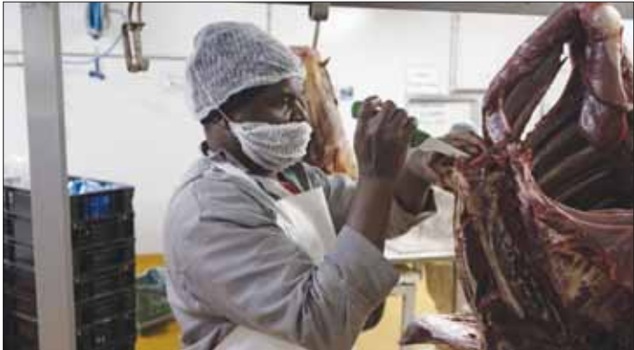
A butcher works on a piece of game meat as carcasses hang at an abattoir in Bela Bela.