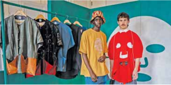
Shirotsu brand on showcase.