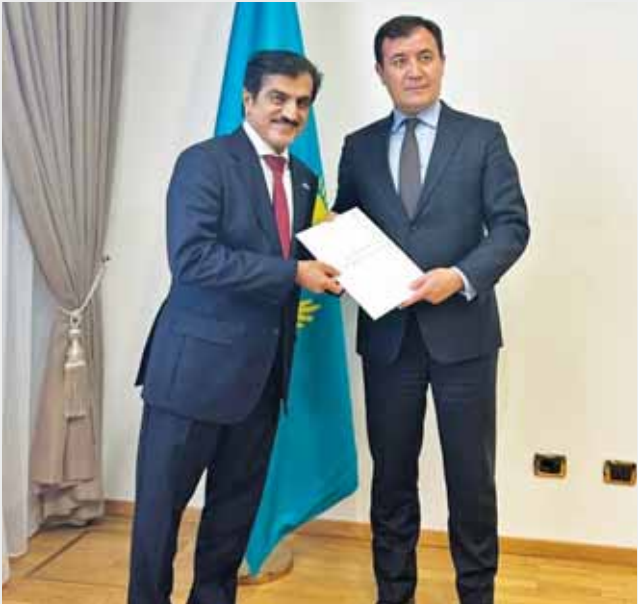
Deputy Foreign Minister of Kazakhstan Alibek Bakayev received in Astana yesterday a copy of credentials of Abdullah Hussein al-Jaber as Qatar's ambassador extraordinary and plenipotentiary to Kazakhstan.