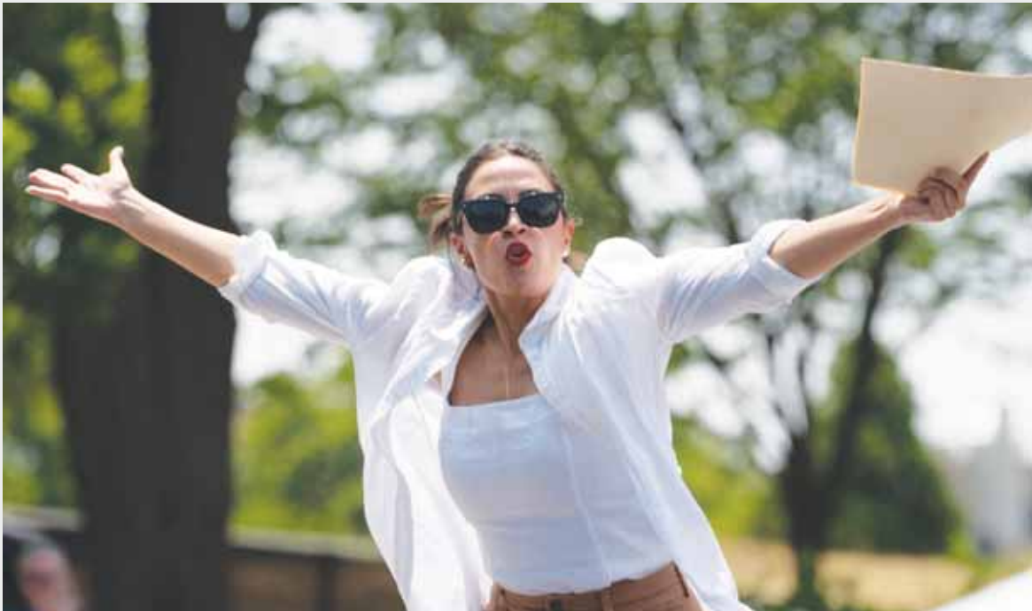
US Representative Alexandria Ocasio-Cortez (D-NY) reacts during a rally for Jamaal Bowman (D-NY) at St. Mary’s Park in the Bronx borough of New York City. Supporters gathered three days before New York’s primary elections as incumbent Bowman attempts to retain his seat in a heated primary race.