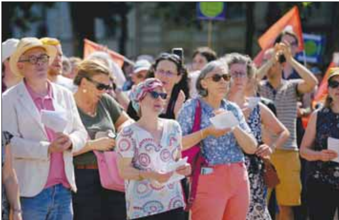
Protesters sing during a demonstration called by the ‘Justice and Hope’ Christian collective against the rise of far-right parties, in front of Hotel des Invalides, in Paris, yesterday.

edented levels of support after a decades-long “de-demonisation” push to distance its image from its roots, including a co-founder who was a member of the Nazi Waffen-SS paramilitary.