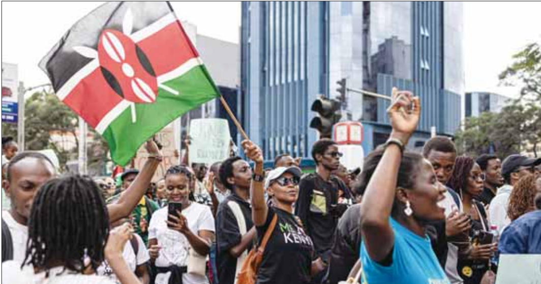
A woman waves a Kenyan flag while marching against the Finance Bill 2024 in downtown Nairobi, yesterday.