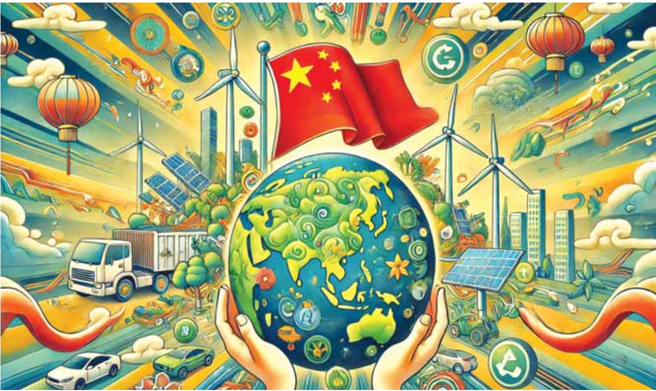
Given that a faster green transition benefits everyone, China’s high savings rate should be viewed not as a problem to be solved, but as an opportunity to be seized. Unfortunately, the US is so fixated on its geopolitical rivalry with China that it has effectively closed its market to green Chinese products.

Something similar happened in Japan in the 1990s, after its property bubble burst. As in China, construction activity had long been financed by high