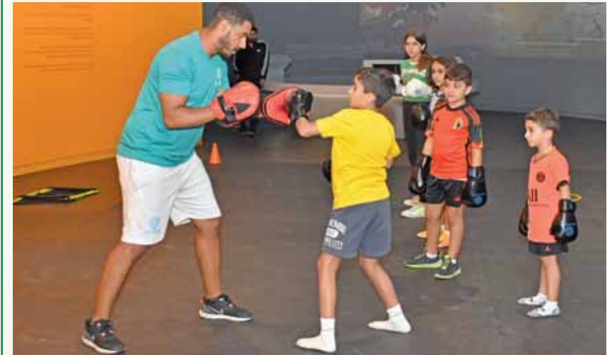
Children took part in a number of activities to mark the International Olympic Day yesterday at the 3-2-1 Qatar Olympic and Sports Museum.