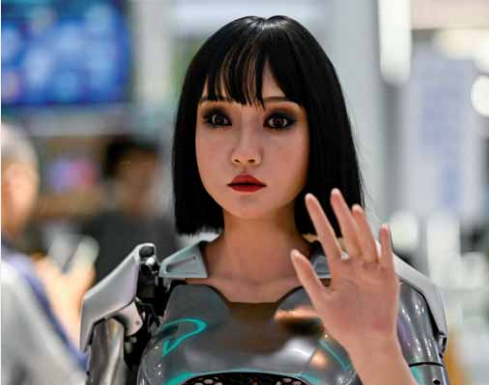
A humanoid robot gestures while on display during the World Intelligence Expo in Tianjin, China, yesterday.