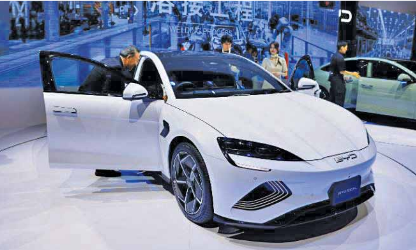
A view of the BYD Seal at the Japan Mobility Show 2023 in Tokyo last October.