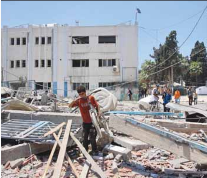
A child carries his bicycle over rubble on the grounds of the headquarters of the UN Relief and Works Agency for Palestine Refugees in Gaza City, yesterday, amid the ongoing battle between Israel and the Palestinian Hamas group.