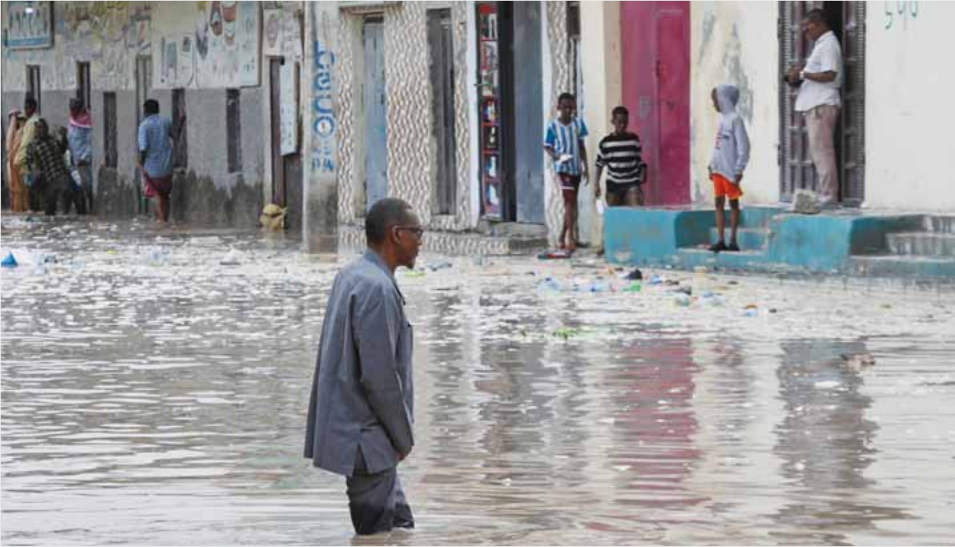
A man wades through flood waters on a street in Wadajir district of Mogadishu, Somalia, yesterday.