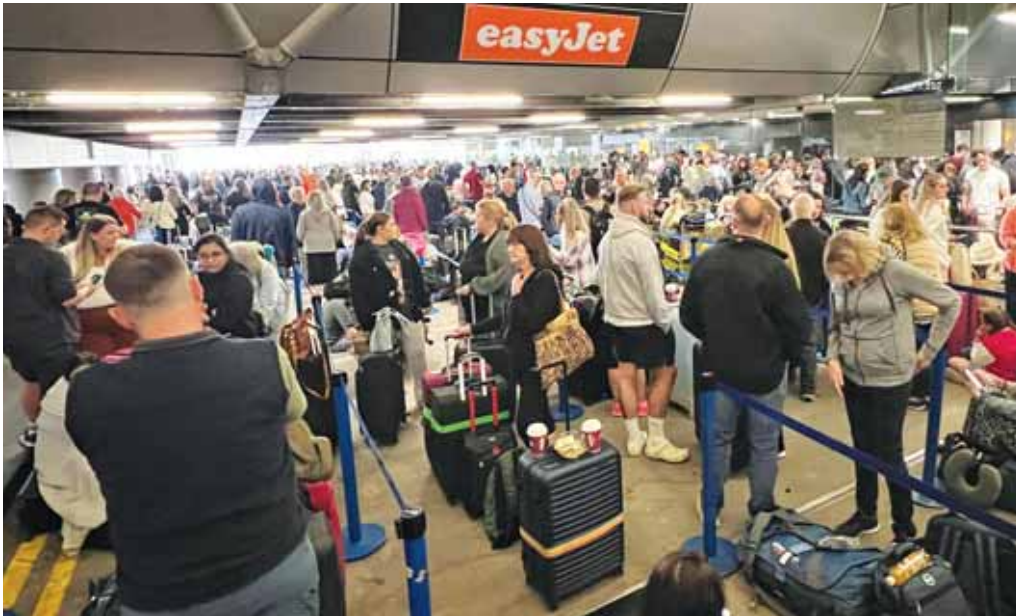
Passengers queue outside Terminal 1 after an overnight power cut led to disruptions and cancellations at Manchester Airport in Manchester, Britain, yesterday.

The latest government data puts the jobless rate at just 3.2% for the 2022-23 fiscal year, well below an already historically low unemployment rate in the US. But the Center for Monitoring Indian Economy, a private think-tank, reported 7% unemployment in May, up from around 6% before the pandemic.