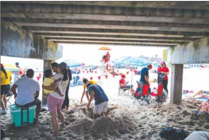
People visit the beach at Coney Island on a sweltering afternoon on the first weekend of summer in the Brooklyn borough of New York City.