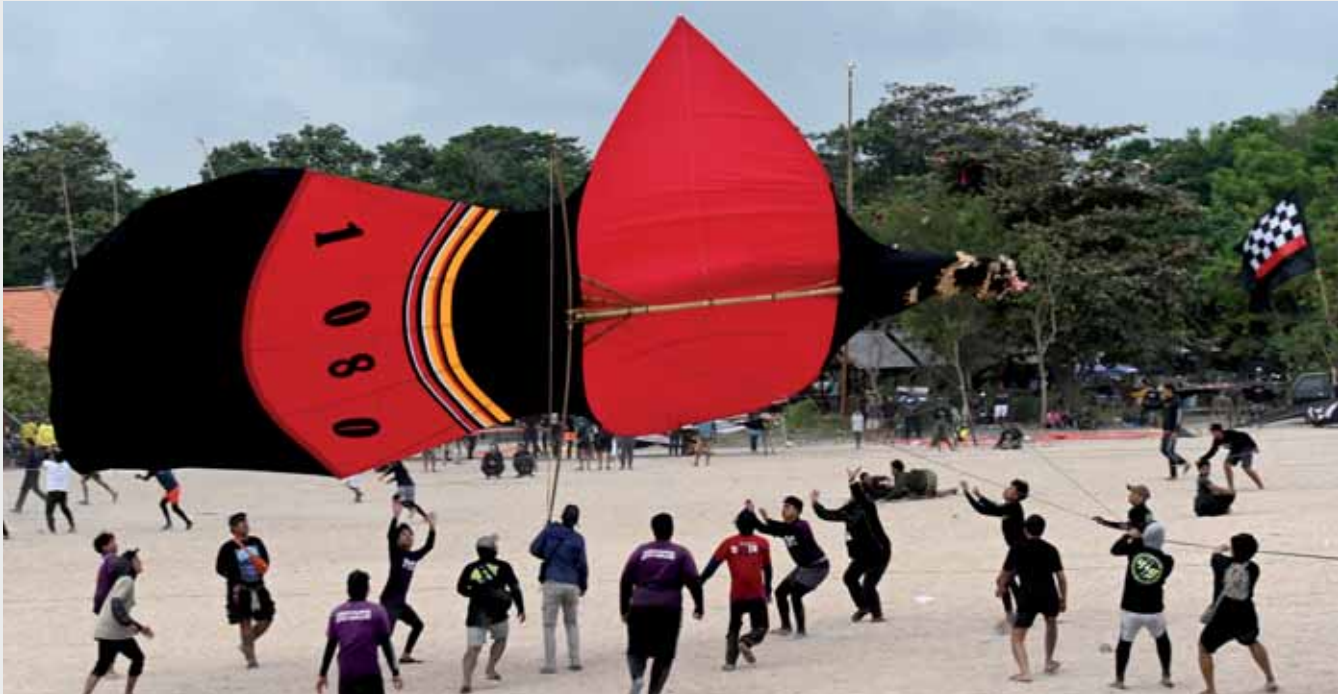
Participants launch a giant kite during the Bali Kite Festival at Mertasari beach in Sanur, Indonesia’s Bali island yesterday.

est major landmass, Hainan island. A Filipino sailor lost a thumb in the clash with Manila also accusing the Chinese coast guard sailors of wielding knives, sticks and an axe and stealing or damaging their equipment, including guns and inflatable boats. Beijing insisted its coast guard behaved in a “professional and restrained” way and blamed Manila for the clash. In previous confrontations Chinese forces have used water cannon and military-grade lasers and collided with Filipino resupply vessels and their escorts. “We have never, never in the history of the Philippines, yielded to any foreign power,” Marcos said to applause, while pledging to “continue to exercise our freedoms and rights in support of our national interest, in accordance with international law. “In defending the nation, we stay true to our Filipino nature that we would like to settle all these issues peacefully,” Marcos said. “Our calm and peaceful disposition should not be mistaken for acquiescence,” he added. The confrontation is fuelling growing concern that the dispute could drag in the US, which has a mutual defence pact with Manila. The US has condemned China’s actions and reaffirmed its ironclad defence commitments against any attack on Philippine aircraft or vessels in the South China Sea under their mutual defence treaty.