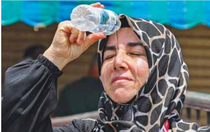
A departing Turkish pilgrim pours cold water from a bottle on her head to cool off as she waits in Saudi Arabia's holy city of Makkah.

because without official permits they could not access air-conditioned spaces provided for the 1.8mn authorised pilgrims to cool down. "People were tired after being chased by security forces before Arafat day. They were exhausted," one Arab diplomat told AFP yesterday of Saturday's day-long outdoor prayers that marked the Haj's climax. The diplomat said the main cause of death among Egyptian pilgrims was the heat, which triggered complications related to high blood pressure and other issues. Egyptian officials were visiting hospitals to obtain information and help Egyptian pilgrims get medical care, the foreign ministry said in a statement on Thursday. "However, there are large numbers of Egyptian citizens who are not registered in Haj databases, which requires double the effort and a longer time to search for missing persons and find their relatives," it said. Egyptian President Abdel Fattah al-Sisi has ordered that a "crisis cell" headed by the prime minister follow up on the deaths of the country's pilgrims. Sisi stressed "the need for immediate co-ordination with the Saudi authorities to facilitate receiving the bodies of the deceased and streamline the process," said a statement from his office. More fatalities were also con-