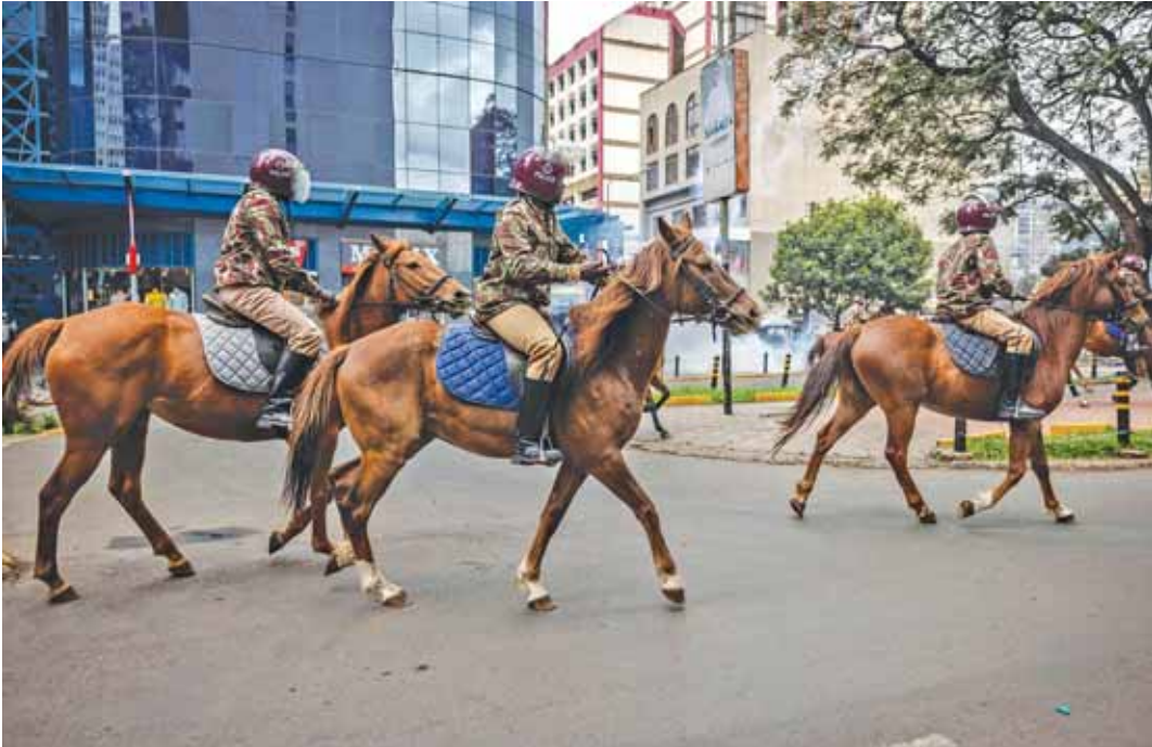
Kenya mounted police officers patrol on horses during a demonstration against tax hikes.

or being a racist. I can however see how my message was distorted in the way it was delivered by me and I take full responsibility for the actions of my younger and immature self," Gouws wrote on X, formerly known as Twitter. His suspension comes a day after President Cyril Ramaphosa was inaugurated for a second full term. He was re-elected by parliament with support from the DA, the Zulu nationalist Inkatha Freedom Party, the anti-immigration Patriotic Alliance and the small centre-left GOOD party.