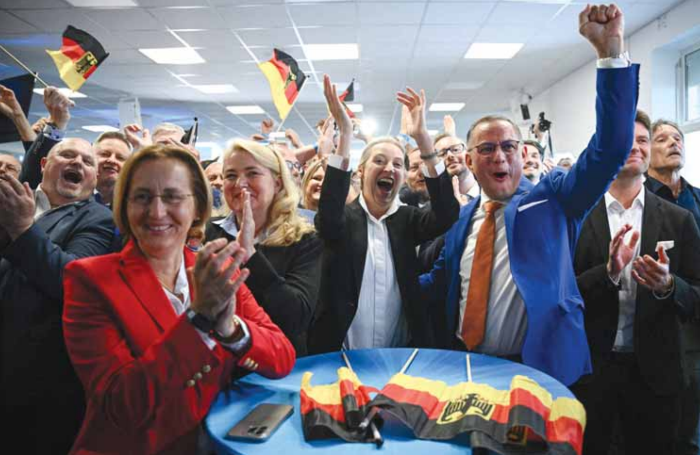
Alternative for Germany (AfD) party co-leaders Alice Weidel and Tino Chrupalla react to results after the polls closed in the European Parliament elections, in Berlin, Germany.