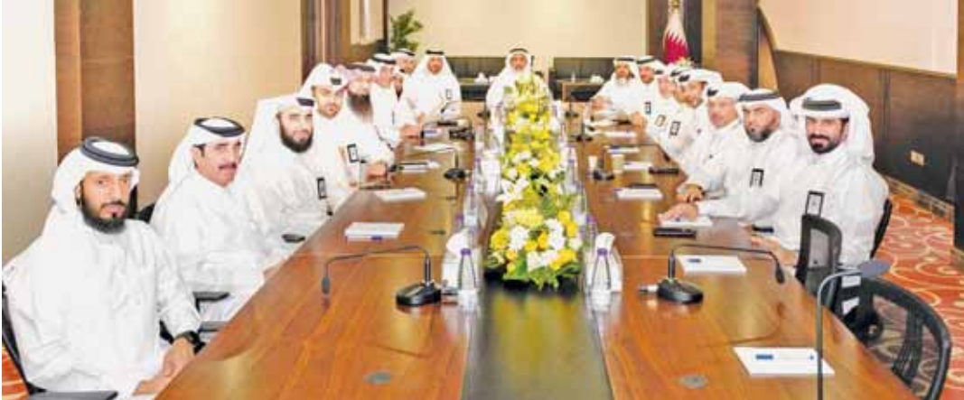
Officials of the Qatari Haj Mission.

to move forward in developing the services provided to the campaigns and the state's pilgrims in all the Holy Sites, and to maintain excellence and sophistication. He noted that this success and distinction, which was praised by the country's pilgrims, came through the solidarity of all members, mission officials and supporting units, and their dedication to providing the best services to the country's pilgrims.