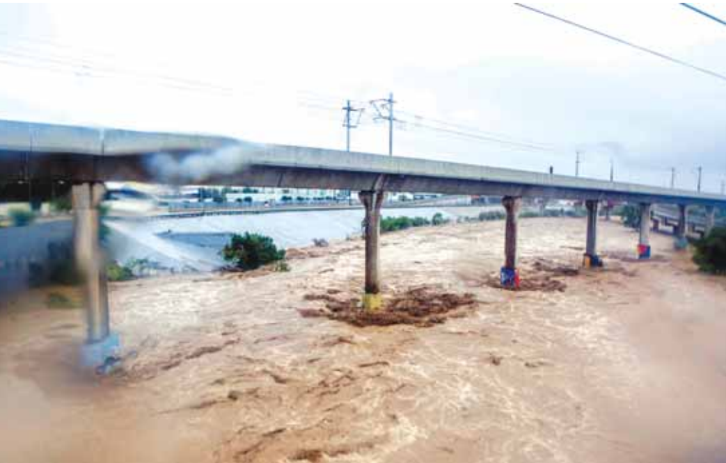
View of the rising water of the Santa Catarina River in the city of Monterrey, Mexico.