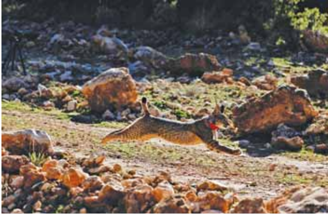
This picture taken in February shows male Iberian lynx Urki released with other four lynxes as part of the European project ‘Life LynxConnect’ to recover this species, in the Arana mountain range, in Iznalloz, near Granada, southern Spain.

Today, the population has risen to more than 2,000, counting both young and adult lynxes across a range of thousands of