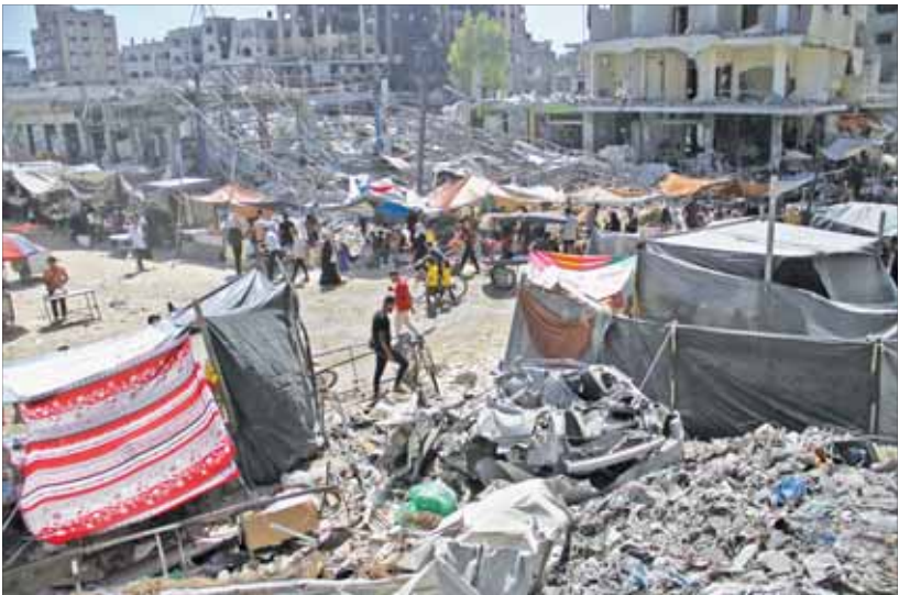
Palestinians walk near destroyed houses, in Jabalia refugee camp, in the northern Gaza Strip.

It is learnt that Doha's hotels, especially those offering beach access, have witnessed a surge in bookings from Saudi Arabian nationals during the Eid al-Adha break, a trend observed during the Eid al-Fitr holidays. This influx has also positively impacted major malls across Qatar, benefiting retail outlets and boutiques. To Page 2