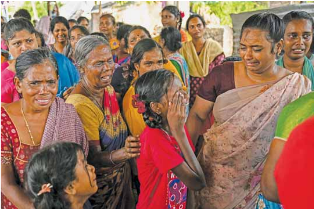
Family members weep near the bodies of victims who died after consuming illegal alcohol in Kallakurichi district of Tamil Nadu yesterday.

The UK’s highest court yesterday ruled that planners must look at the impact of emissions on global warming before granting approval for oil wells, in a landmark case that climate activists said makes it easier to block fossil fuel projects. Environmental campaigners had argued that planning permission to retain and expand an oil well site near London’s Gatwick Airport was flawed, because it had not considered the impact of greenhouse gas emissions from the use of the oil. Supreme Court judges agreed by a narrow three to two majority, quashing the planning approval, which they said was unlawful.