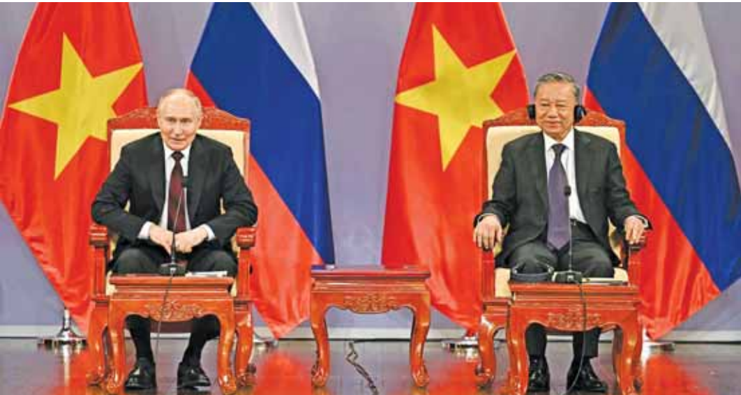
Russia’s President Vladimir Putin and Vietnam’s President To Lam take part in an event attended by the Vietnam Friendship Association and generations of Vietnamese alumni that studied in Russia at the Hanoi Opera House in Hanoi yesterday.