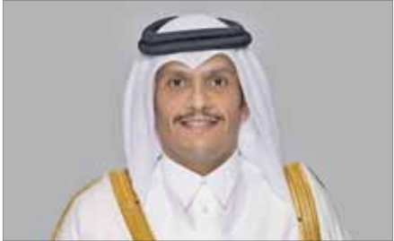
HE Sheikh Mohamed bin Abdulrahman bin Jassim al-Thani

He noted that the dialogue will also address developments in regional and international issues, especially the latest developments in the occupied Palestinian territories and the Gaza Strip, and the need to strengthen the efforts aimed at an immediate and permanent ceasefire in Gaza, as well as ensuring unhin-