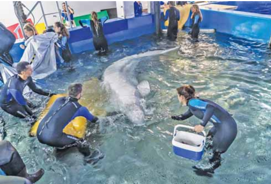
This handout picture taken and released by Valencia’s Oceanografic Oceanarium shows veterinary staff members taking care of one of the two belugas, Plombir and Miranda, from the Dolphinarium NEMO of Kharkiv, in Ukraine, after being rescued and transferred to Valencia through a risky international operation by land and by air.

Kharkiv’s NEMO dolphinarium was just 800m (2,600’) away from a site that was frequently shelled and the shockwaves caused severe stress on animals with such sensitive hearing.