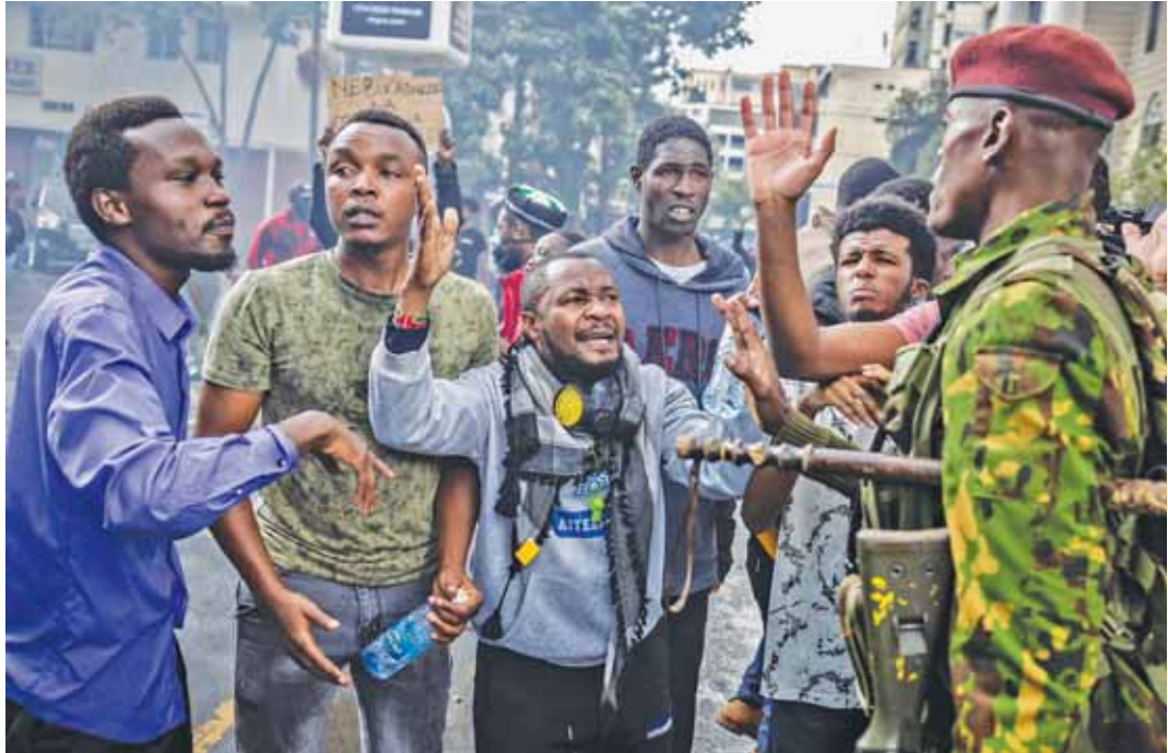
Protesters react while talking to a Kenya police officer in downtown Nairobi.