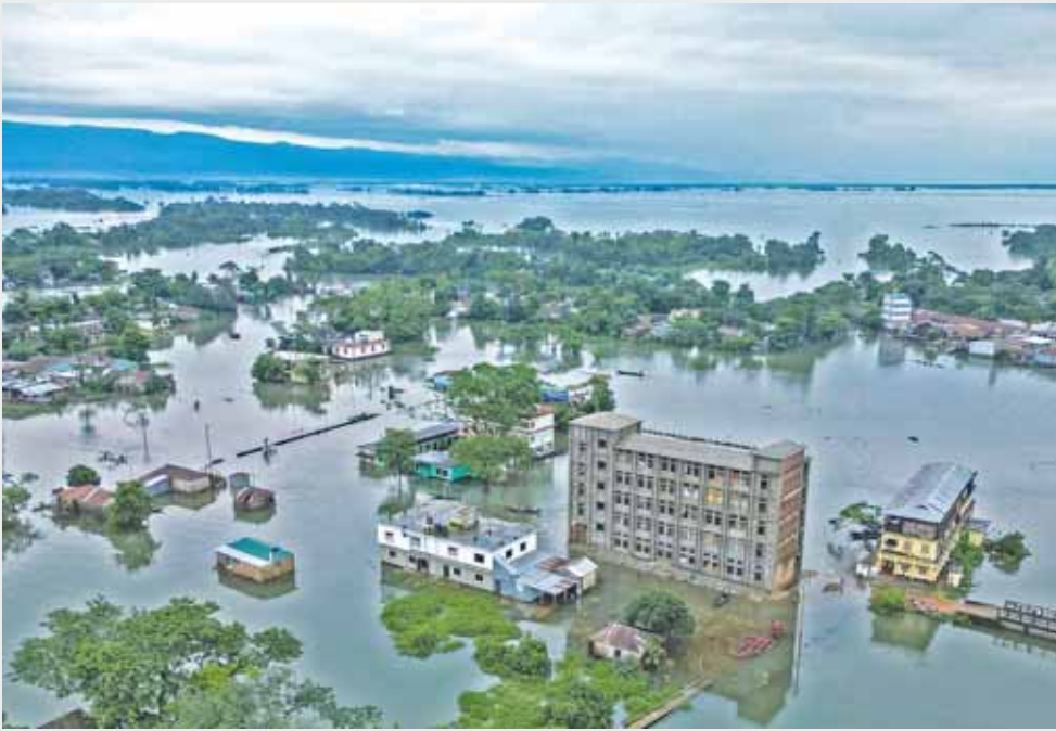
The flood situation in Companiganj area of Sylhet district in Bangladesh worsened yesterday. In Sylhet, lashing rain and rivers swollen by flooding upstream in India swamped heavily populated areas. The Met office has forecast heavy to very heavy rainfall in the Sylhet division in the next 72 hours.