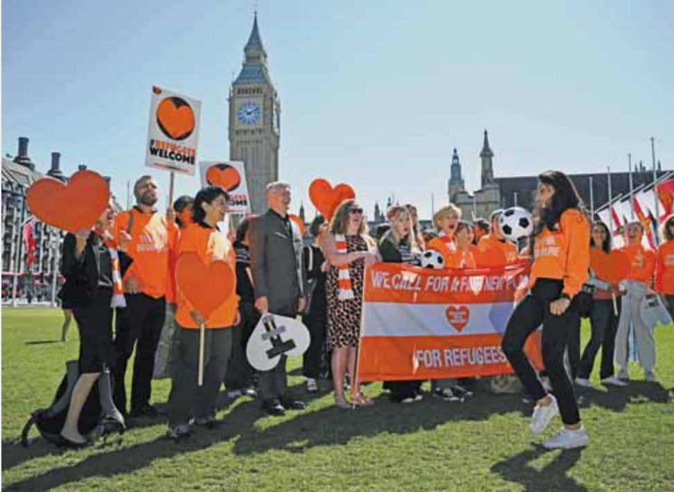
Supporters and members of refugee charities Safe Passage, Choose Love and Freedom from Torture gather to mark World Refugee Day on Parliament Square, central London, yesterday while calling on the next UK government to commit to a fair new plan for refugees, including scrapping the Rwanda scheme.