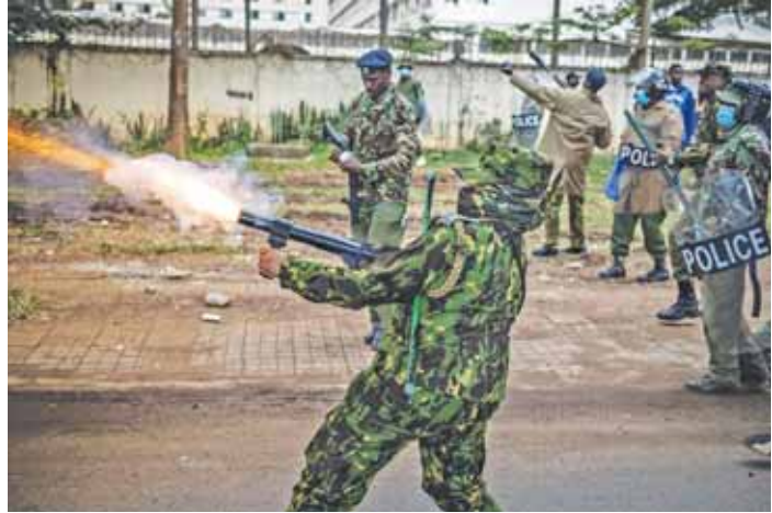
A Kenya police officer fires a tear gas canister.