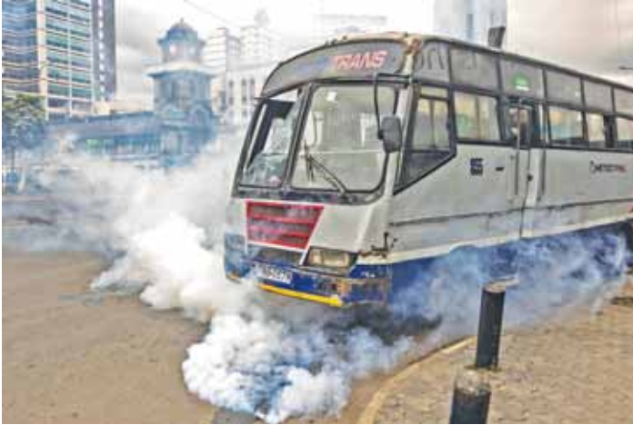
A damaged bus is seen during the riots.

Armed with smartphones and whistles, thousands of young Kenyans took to the streets across the country yesterday to protest tax hikes, livestreaming the demonstrations in a vivid show of anger by Gen-Z citizens against the government. Police in the capital Nairobi fired tear gas and water cannon against protesters near parliament, but apart from isolated scuffles earlier in the day and some groups setting fire to tyres and road signs around dusk, the demonstrations remained mostly peaceful. Led largely by young Kenyans, the demonstrations – dubbed "Occupy Parliament" – began in Nairobi on Tuesday before spreading nationwide on Thursday. They have galvanised widespread discontent over President William Ruto's economic policies in a country already grappling with a cost-of-living crisis. Protesters have turned to TikTok, Instagram and X to plan and livestream the demonstrations. Hours after Tuesday's action, which saw hundreds of youth face off against the police, the cash-