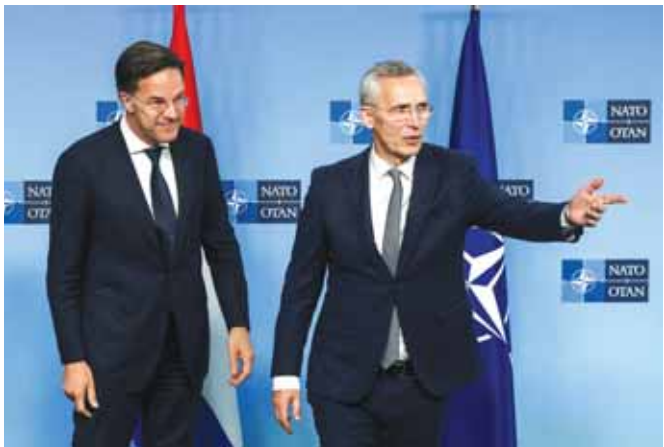
This picture taken in April shows Dutch Prime Minister Mark Rutte and Nato Secretary-General Jens Stoltenberg at the Alliance’s headquarters in Brussels.

and July 7 is held as a two-round majority vote in each district. The Harris poll, however, made rough seat projections and forecast 235-280 seats for RN and its allies, which would fall short of the 289 needed for an absolute majority but make it the largest bloc.