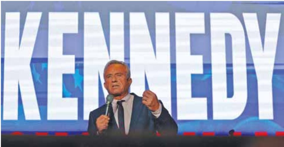
This picture take in May shows Robert F Kennedy Jr addressing the Libertarian Party's national convention.

Independent US presidential candidate Robert F Kennedy Jr is unlikely to participate in 2024's first US presidential debate after missing a deadline to meet criteria set by hosting news organisation CNN. CNN, a division of Warner Bros Discovery and host of the June 27 debate, said that only President Joe Biden and Republican rival Donald Trump had met its conditions to take part ahead of a 12am ET (0400 GMT) deadline yesterday. "Presidents Biden and Trump do not want me on the debate stage and CNN illegally agreed to their demand," Kennedy said in a statement. "My exclusion by Presidents Biden and Trump from the debate is undemocratic, un-American, and cowardly." The conditions included appearing on enough state ballots to potentially win the presidency and also garnering at least 15% voter support in four separate national polls. Kennedy had received at least 15% in only three accepted polls to date and, by CNN's tally, had qualified for the ballot in just six states. That would not be enough to win the presidency. Kennedy had argued the TV network's standards were being applied unfairly and intended to keep him off the stage with candidates who