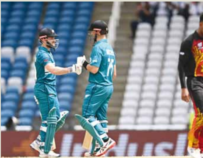
New Zealand's captain Kane Williamson (left) celebrates with Mitchell Santner during the ICC Twenty20 World Cup match against Papua New Guinea at Brian Lara Cricket Academy Stadium in Tarouba, Trinidad and Tobago, yesterday.

Stead, New Zealand won the inaugural World Test Championship (WTC) in 2021 and reached the T20 World Cup final in the United Arab Emirates a few months later. However, a long-coveted white-ball trophy has proved beyond the Black Caps, and fans have questioned whether the current leadership can ever deliver one. Stead is contracted as an all-formats coach through to the end of the current WTC cycle in 2025 but may end up relinquishing the white-ball component of his role, having previously advocated for a specialist to oversee the shorter formats. Williamson, who handed off the Test captaincy in 2022 to paceman Tim Southee, may also decide it is time for someone else to lead the Black Caps in white-ball cricket, or time for him to drop a format in order to prolong his career. "Oh, I don't know," said the 33-year-old, when asked if he would be part of New Zealand's T20 setup in 2026. "There's a bit of time between now and then, so it's about regrouping as a side. "We've got red-ball cricket over the next year basically, so it's back into some other international formats, and we'll see where things land." New Zealand may struggle to rebuild a T20 squad that can challenge the world's best in time for the 2026 World Cup. A lighter load or a lucrative career in franchise cricket may beckon for some senior players, including 35-year-old Southee, long Boult's pace partner.