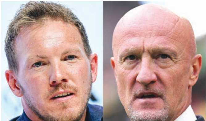
Germany’s coach Julian Nagelsmann (left) and Hungary’s coach Marco Rossi.

Germany defender Maximilian Mittelstaedt played the full 90 minutes against Scotland on Friday and will start today at the home ground of his club Stuttgart.