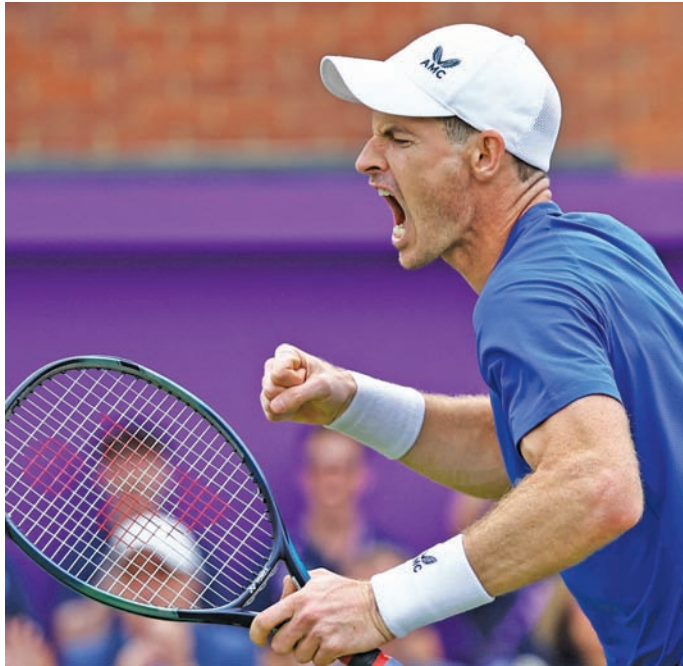
Britain's Andy Murray celebrates after winning his round of 32 match against Australia's Alexei Popyrin at Queen's Club Championships London, Britain, yesterday.