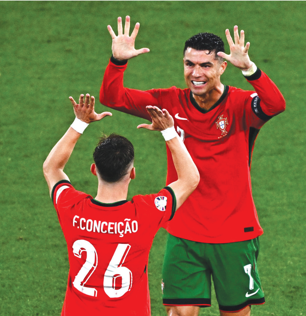
Portugal's Cristiano Ronaldo and Francisco Conceicao celebrate their victory at the end of the UEFA Euro 2024 Group F match against the Czech Republic at the Leipzig Stadium in Leipzig yesterday.

Youngster Francisco Conceicao snatched Portugal a last-gasp 2-1 win over the Czech Republic in their Euro 2024 Group F opener yesterday just minutes after coming off the bench. The 21-year-old Porto winger capitalised from close range after the Czechs were unable to clear a cross, completing his team's comeback. The Czechs went ahead against the run of play through Lukas Provod's fine strike from the edge of the box after the hour mark. Cristiano Ronaldo's Portugal did not shine but dug just deep enough to claim victory, with Robin Hranac's own goal pulling them level before Conceicao's dramatic winner. Ronaldo, 39, playing at a record-extending sixth European Championship, was denied by Stanek on three occasions as Portugal constantly looked to find the competition's all-time top goalscorer. The striker hit the post with the score tied and Diogo Jota nodded in the rebound but the goal was disallowed for offside against Ronaldo. "We showed all our coolness and resilience," said Portugal midfielder Vitinha. "We remained calm, got the draw and always believed until the end to get the win. "Luckily we managed to do it with the help of the players who came on...we are truly a team." Portugal coach Roberto Martinez selected 41-year-old defender Pepe, who became the oldest player in Euros history, beating the record set by Hungary goalkeeper Gabor Kiraly aged 40 in 2016, as part of a three centre-back defence. Portugal won that tournament in 2016 to claim the trophy for the