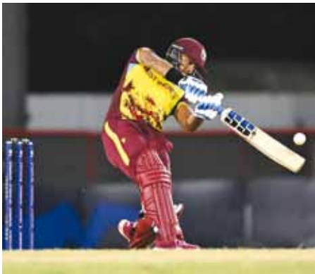
West Indies' Nicholas Pooran plays a shot during the ICC Twenty20 World Cup match against Afghanistan at Daren Sammy Cricket Ground in Gros Islet, St. Lucia.

Nicholas Pooran was run out agonisingly short of a maiden T20 World Cup hundred as a rampant West Indies humbled Afghanistan by 104 runs in a clash of unbeaten teams yesterday. With both sides already into the Super Eights, Pooran smashed 98 off 53 balls in the final group match at the Daren Sammy Stadium in St Lucia to propel the hosts to 218-5 after being put in to bat. A rattled Afghanistan never recovered from the loss of Rahmanullah Gurbaz in the first over of the reply and were bundled out for 114 off 16.2 overs, seamer Obed McCoy marking his first match of the tournament with best figures of 3-14. The next phase of the competition, the Super Eights, starts today. "When you get the good wickets you have to capitalise as batters. When it's your day you have to take it and make the most of it," said Pooran, who thumped six fours and eight sixes in a spectacular innings took him past 2,000 T20I runs. Coming to the middle in the second over after the demise of Brandon King, Pooran and hometown hero Johnson Charles (43 off 27 balls) accelerated at supersonic speed in lifting the total to 92-1 by the sixth over. It was the highest total ever in the Power-play overs of a T20 World Cup since the first