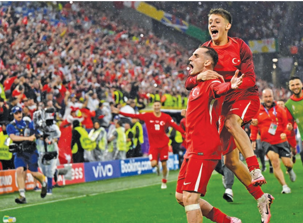
Turkiye's forward Kerem Akturkoglu (left) celebrates scoring his team's third goal with teammate Arda Guler during the UEFA Euro 2024 Group F match against Georgia in Dortmund yesterday.

And Mikautadze stunned what was effectively the home crowd in the 32nd minute by sweeping home Giorgi Kochorashvili's low cross after brilliant play down the right. The small but loud Georgian contingent had their heads in their hands shortly afterwards when Mikautadze look certain to put their team ahead but dragged a great opportunity wide. Turkiye again started in the front foot after the break but Georgia held their own and Mikautadze was in the thick of it again in the 52nd minute when Bardakci blocked his effort after Khvicha Kvaratskhelia's burst down the left. Kvaratskhelia, who was below-par throughout, then poked a good chance wide in the 62nd minute and only moments later Guler took aim from distance and arrowed in an unstoppable shot past the despairing Giorgi Mamardashvili. Georgia pushed for another equaliser and came desperately close five minutes after Guler's strike when Kochorashvili skipped past a couple of weak challenges only to see his shot rattle the crossbar.