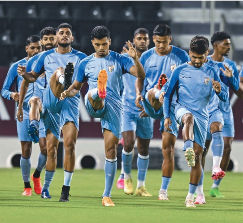
India are tied on five points with Afghanistan, with Kuwait one adrift but Igor Stimac's side have a superior goal difference.

Blue Tigers will hope for the same in the game between Kuwait and Afghanistan. The equation will be simpler for India if they defeat Qatar, however, though the task of achieving that feat is anything but elementary.