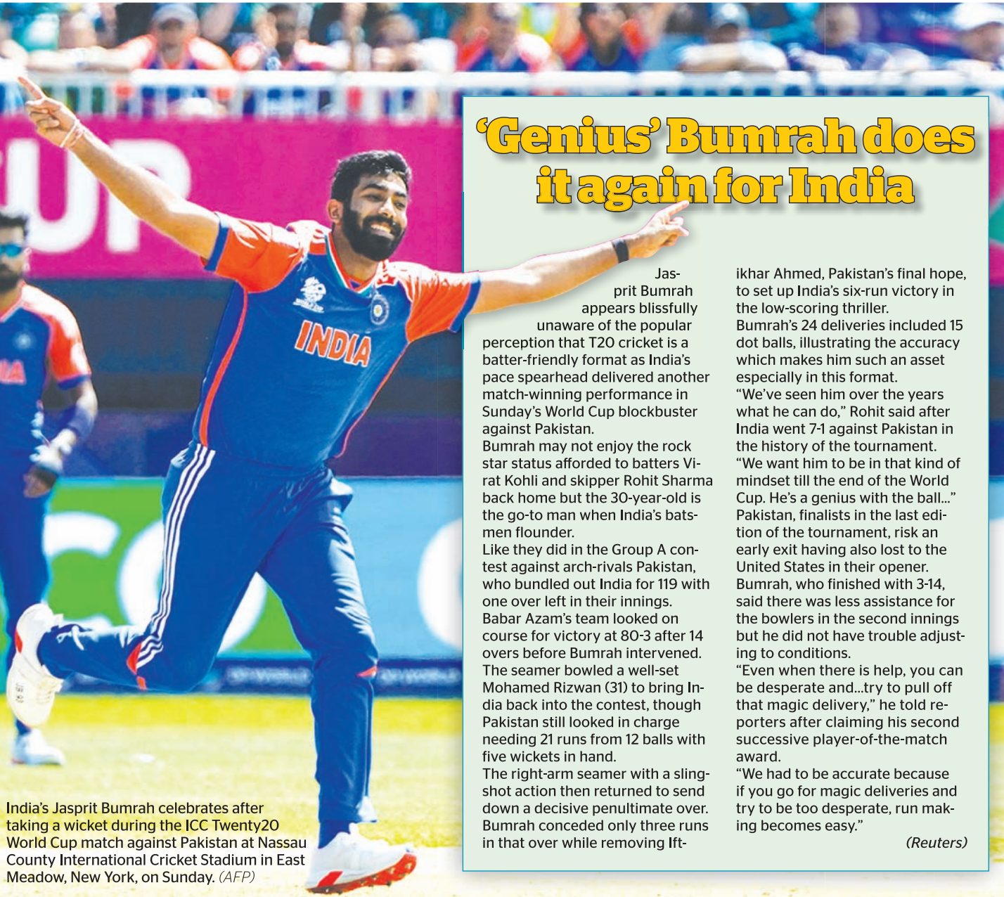
India's Jasprit Bumrah celebrates after taking a wicket during the ICC Twenty20 World Cup match against Pakistan at Nassau County International Cricket Stadium in East Meadow, New York, on Sunday.

"T20 Inc and the ICC recognise that the pitches used so far at the Nassau County International Cricket Stadium have not played as consistently as we would have all wanted," the ICC said in a statement. "The world-class grounds team have been working hard since the conclusion of yesterday's game to remedy the situation and deliver the best possible surfaces for the remaining matches," they added. Three games remain at the venue with the last coming tomorrow when India face co-hosts USA.