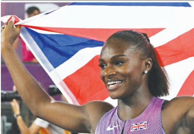
Britain's Dina Asher-Smith celebrates winning the women's 100m final during the European Athletics Championships at the Olympic stadium in Rome on Sunday.

Rome: Britain’s double Olympic bronze medalist Dina Asher-Smith said winning 100m gold at the European Athletics Championships in Rome on Sunday was a step in the right direction towards the Paris Games. Asher-Smith, who had not won a major title since taking 200m gold at the 2019 World Championships, got off to a slow start before surging past her rivals to win in 10.99 seconds. “It’s just a step towards Paris, a step in the right direction,” she told British media.