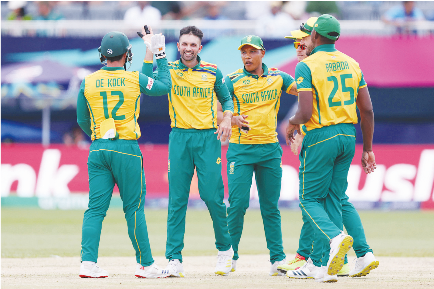
Keshav Maharaj of South Africa celebrate with teammates after dismissing Liton Das of Bangladesh during the ICC T20 World Cup match against Bangladesh at Nassau County International Cricket Stadium in New York yesterday.

Bangladesh took seven off the penultimate over but still needed