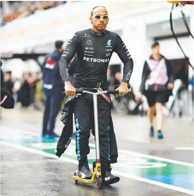
Lewis Hamilton of Great Britain and Mercedes rides his scooter in the Piltane prior to the start of the F1 Grand Prix of Canada at Circuit Gilles Villeneuve in Montreal, Quebec, on Sunday. Hamilton finished fourth behind Mercedes teammate George Russell.

“Nevertheless, it was our first podium of the year, we had a really fast car and to be back in the mix fighting for a victory, that’s