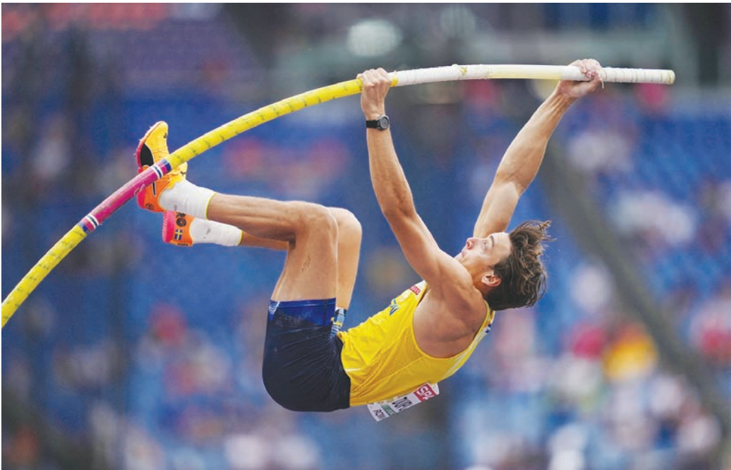
Sweden's Armand Duplantis in action during the men's pole vault qualification at the European Athletics Championships at Stadio Olimpico in Rome yesterday.

Norway’s Karsten Warholm, a three-time world 400m hurdles champion and two-time European gold medalist, coasted through his heat in 48.75sec, easing up a full 50