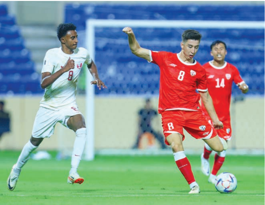
Afghanistan held Qatar to a precious 0-0 draw on Thursday.