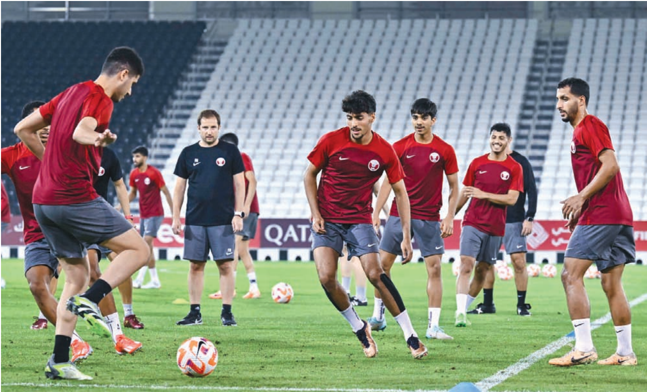
Qatar players train at the Jassim Bin Hamad Stadium yesterday, on the eve of their FIFA World Cup 2026 and AFC Asian Cup qualifying match against India.

India need to beat Qatar to be sure of booking their spot in the third round of the World Cup qualifiers