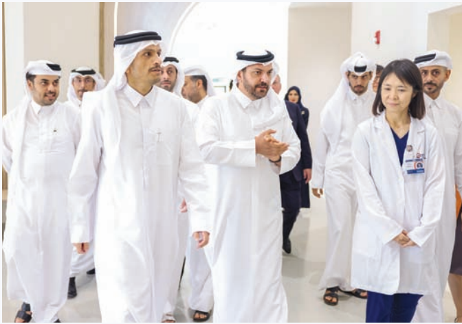
HE Sheikh Mohamed touring the facilities at the KMC.