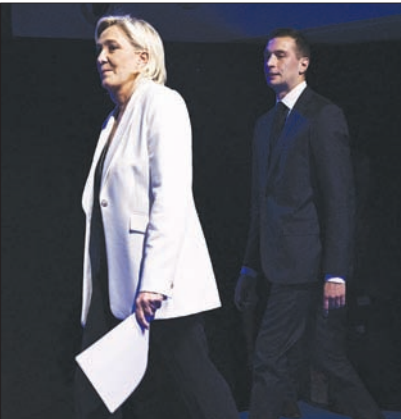
Rassemblement National party leader Marine Le Pen (left) followed by party President Jordan Bardella arrives on stage after the French president called for new general elections during an evening gathering on the final day of the European Parliament election, at the Pavillon Chesnaie du Roy in Paris.