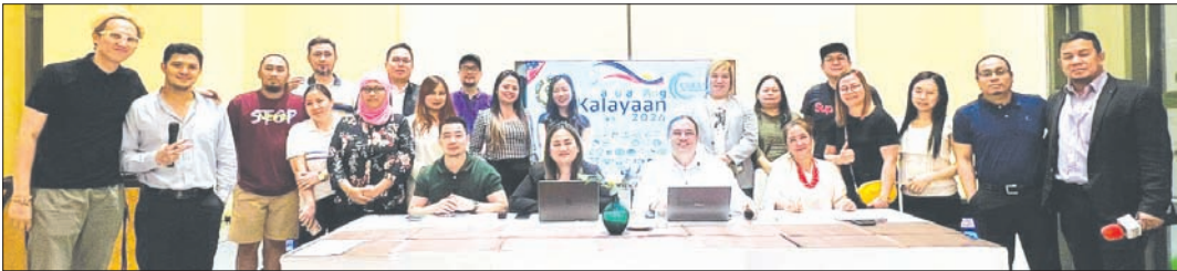
The ‘Makulay ang Kalayaan 2024’ executive committee, composed of 12 Doha-based Filipino organisations, has announced a meaningful celebration of the 126th Philippine Independence Day (PID) anniversary in Qatar slated from June 20-22.