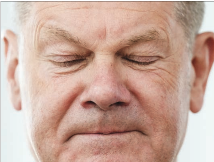
UNDER THE WEATHER: German Chancellor Olaf Scholz before a meeting with the leadership of his SPD party at the SPD headquarters in Berlin yesterday, one day after European Parliament elections.