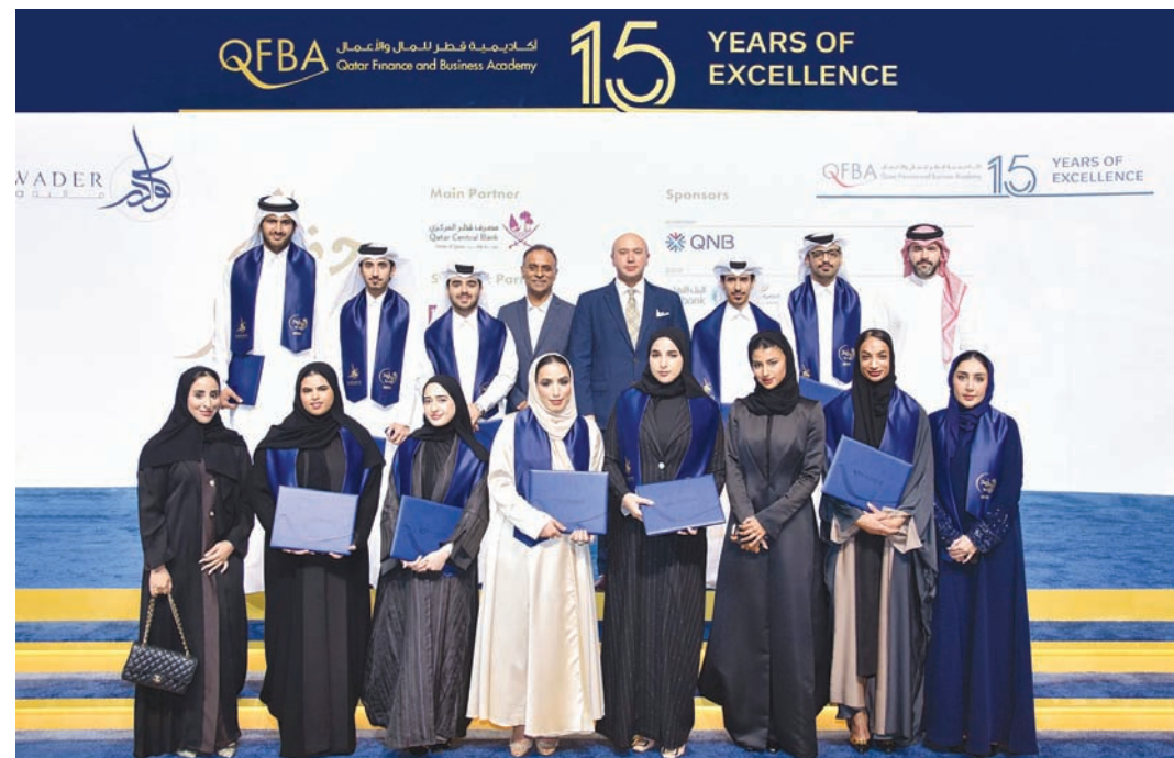
Eleven QNB staff used the programme as a major three-month-long learning and development opportunity, making it the highest number of QNB graduates since the Kawader Malia sponsorship started.

Q NB Group, a diamond sponsor for the ninth edition of the 'Kawader Malia 2024', has celebrated its graduates from the programme, launched by Qatar Finance and Business Academy, in partnership with the Qatar Central Bank, and several other strategic partners.