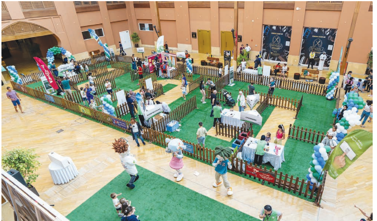
One of the highlights of the educational event was the 'Sustainability Action Maze' competition, an activity designed for the youth of The Pearl Island.

nually on June 5 and established by the UN General Assembly in 1972, has become a global platform for environmental outreach.