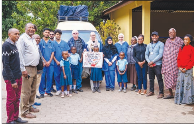
WCM-Q team in Tanzania.