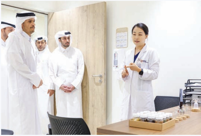
HE Sheikh Mohamed being briefed on the facilities at the KMC.