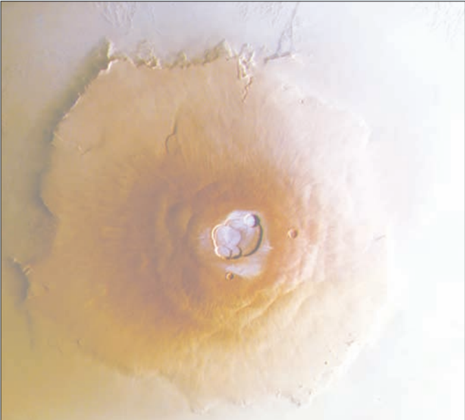
This handout photo obtained yesterday shows frost on the Olympus Mons volcano taken by the HRSC camera aboard ESA's Mars Express.

Early morning frost has been detected on the peaks of massive volcanoes on Mars, an unexpected discovery about the dispersal of water on Mars that could one day prove essential for human exploration, scientists said. The early morning frost was spotted in images taken by the European Space Agency's Trace Gas Orbiter, according to a study published in the journal Nature Geoscience yesterday. The immense volcanoes are in the Tharsis plateau, an elevated region nearly 5,000km wide near the Martian equator. The volcanoes have been extinct for millions of years. Among them is the largest volcano in the solar system, Olympus Mons, which is almost three times taller than Mount Everest. The discovery came by chance – no-one expected to find frost in this region.