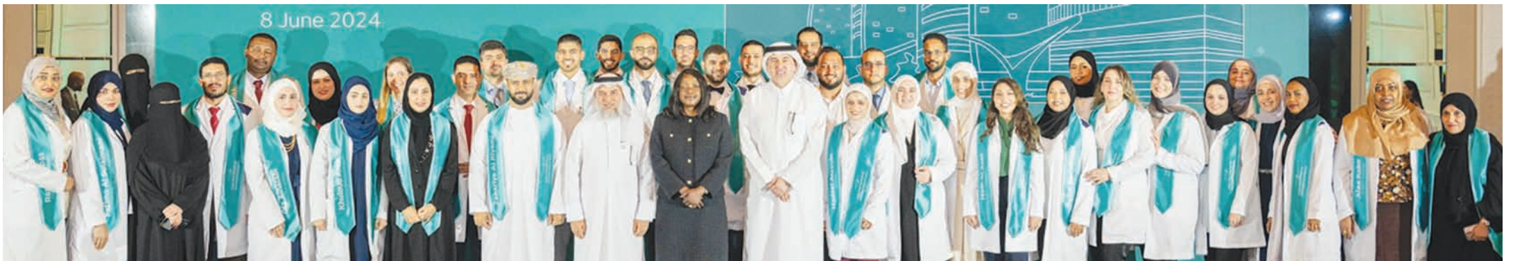
The event honoured the batch of 2023-2024 graduate residents, fellows, and medical students.