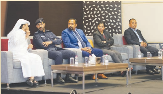
talabat’s Road Safety Week featured a series of on-ground safety initiatives.

talabat, the region’s leading platform for everyday deliveries, launched Road Safety Week initiatives to enhance riders’ awareness of traffic rules and regulations. A local event was hosted by talabat in the presence of the Ministry of Interior, Traffic Department and Federation of Indian Nurses Qatar, whereby several sessions were covered with riders to discuss safe practices on the road. talabat also took the opportunity to award the safest riders with cash prizes for their safe driving habits, which were analysed daily through talabat’s telematics in-app safety solution. talabat’s Road Safety Week also featured a series of on-ground safety initiatives, which included a safety briefing for talabat Patrollers, a session for third-party logistics supervisors on telematics and safety guidelines, distribution of safety flyers to riders and vendors, and a training session for riders at the Hero Academy. In a press statement, talabat