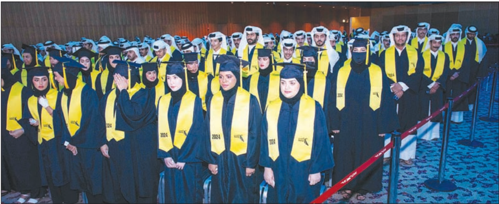
A section of the graduates.

Also, a 'Home Collector' can be requested through the app (qch.qa/appen), in addition to dialling 44920000 for this purpose. Furthermore, benefactors can donate at QC's branches, as well as at its collection points in the commercial complexes.