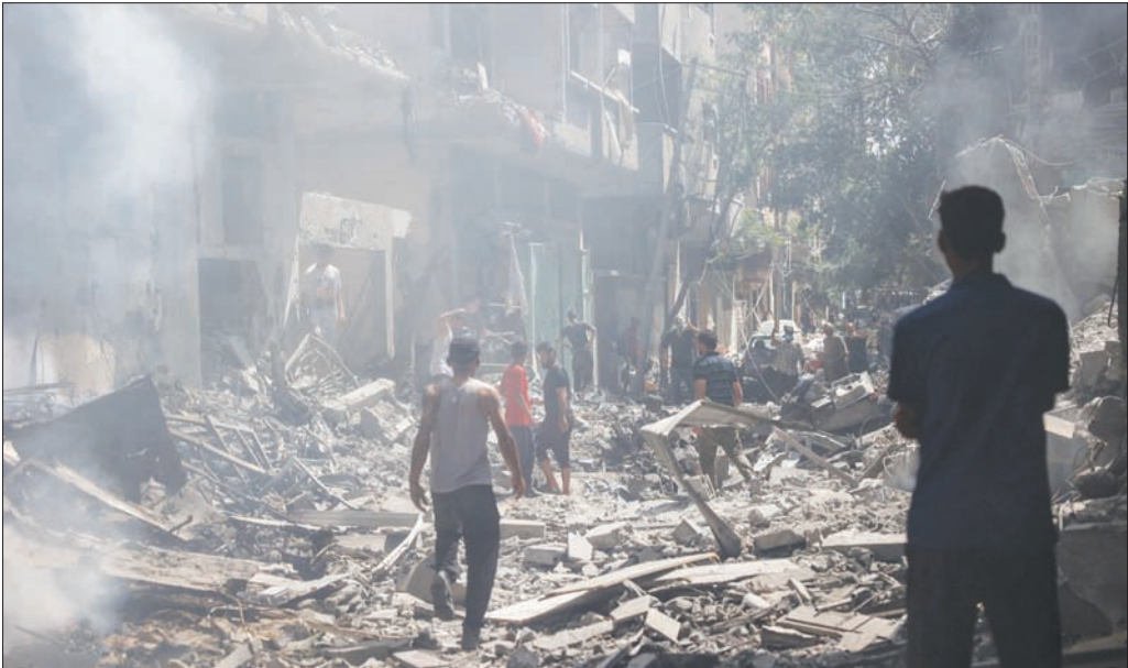
Palestinians walk on the rubble of destroyed buildings following operations by the Israeli Special Forces in the Nuseirat camp, in the central Gaza Strip, yesterday.