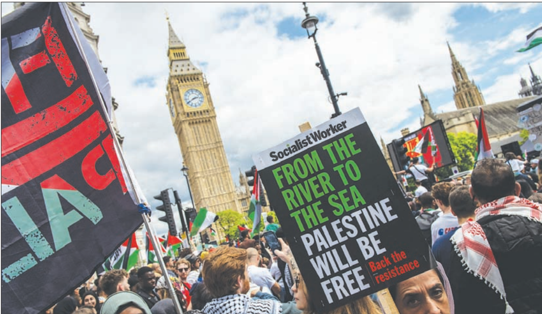
Protesters march in support of Palestinians during a demonstration in Westminster in London, yesterday.