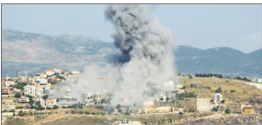
Smoke billows from the site of an Israeli airstrike on the southern Lebanese village of Khiam near the border, yesterday, amid ongoing cross-border tensions as fighting continues between Israel and Hamas fighters in the Gaza Strip.

Israel Defence Forces (IDF) “identified a Hezbollah fighter in the area of Aitaroun in southern Lebanon, and shortly afterward an IAF aircraft struck the