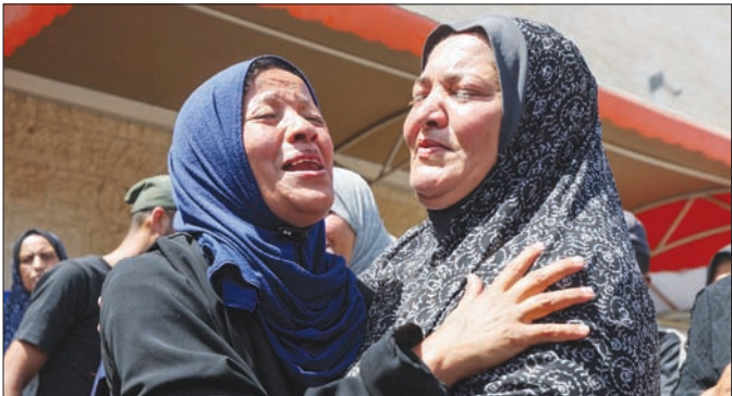
Mourners react during the funeral of Palestinians killed in Israeli strikes, amid the Israel-Hamas conflict, in Deir al-Balah, in central Gaza Strip, yesterday.

Foreign ministers from the group meeting in Istanbul called on the United States to lift its veto on full Palestinian UN membership and on all countries to “exert diplomatic, political, economic and legal pressure” on Israel. They also urged states to ensure Israel complies with the International Court of Justice's decisions, withdraws from the southern Rafah governorate and