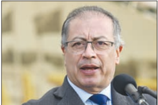
Colombian President Gustavo Petro.

its war violates the international genocide convention.