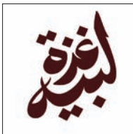
'Labbeh Gaza' logo

The campaign aims to provide aid in four main areas: food, health, shelter, and education. In the food sector, the aid includes food packages, ready-to-eat meals, and others. Shelter assistance