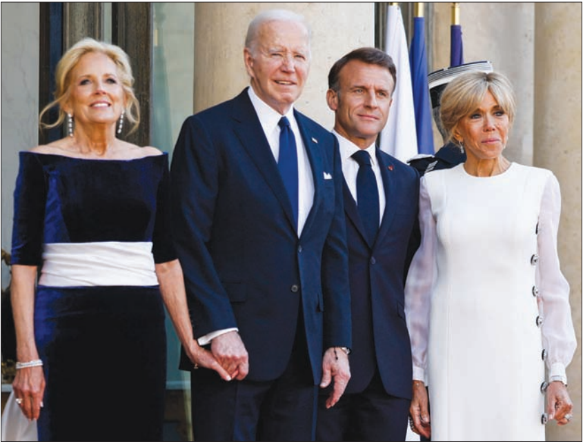
US first lady Jill Biden, US President Joe Biden, French President Emmanuel Macron and his wife Brigitte Macron arrive to attend an official state dinner at the Presidential Elysee Palace in Paris yesterday.

Biden and Macron, who spent the last few days celebrating D-Day veterans and