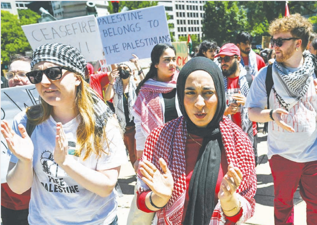
Pro-Palestinian demonstrators march in Farragut Square in Washington, DC, yesterday to protest against Israel's actions in Gaza.