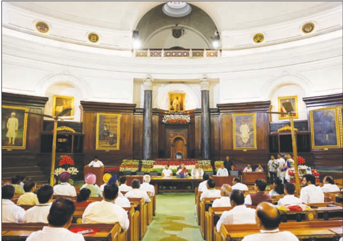
Senior Congress leaders Rahul Gandhi, Sonia Gandhi and President of the Indian National Congress Mallikarjun Kharge attend a meeting of the Congress Parliamentary Party.

Delhi chief minister Arvind Kejriwal, an ally of Gandhi’s, was jailed this year in connection with an ongoing graft investigation. Tuesday’s election results increased the party’s parliamentary representation from 52 to 99 seats. A statement from the Congress executive said that “many challenges” remained in the party’s