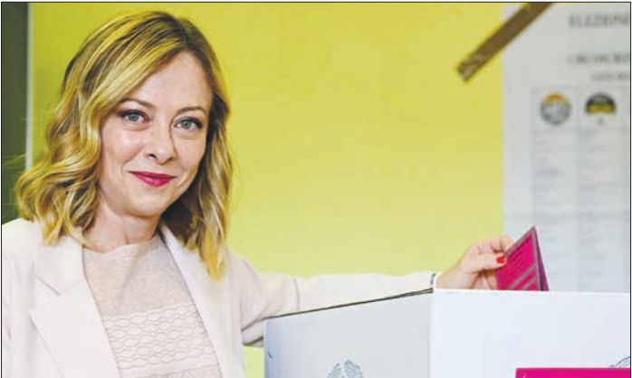
Italian Prime Minister and leader of Italian far-right party Brothers of Italy Giorgia Meloni casts her ballot to vote for the European elections yesterday in Rome.

“We really wish to move towards a re-synchronisation of our economies, between the United States of America and European economies, in terms of regulation and in terms of investment levels,” Macron said.