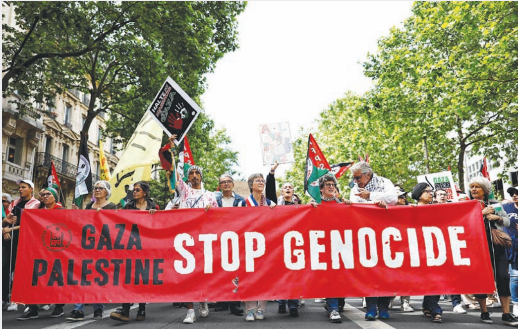
Protesters hold a banner reading “Gaza, Palestine, stop genocide” during a demonstration to support Palestinians and to demand for a ceasefire at Place de la Bastille in Paris, France, yesterday.