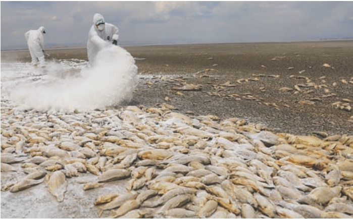
Municipal workers spread quicklime over dead fish to reduce the stench, at the dry bed of the Bustillos Lagoon in Anahuac, Chihuahua state, Mexico.