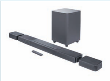
JBL Bar 1300

Jumbo Electronics has introduced the brand new JBL Bar 1300 in Qatar. More than just a great soundbar, it is a signature of people's taste in music. The theatre-quality 3D sound and four up-firing drivers in the main bar and two more in the detachable speakers, the JBL Bar 1300 delivers true Dolby Atmos and DTS:X together with Multibeam for an enhanced 3D surround sound experience. People can enjoy real surround sound without the hassle of extra wires and power connections. Thrilling, precise bass from a mighty 10" wireless subwoofer brings the excitement to the action movies and the emotion to the music along with Pure Voice technology that uses JBL's unique algorithm to optimise voice clarity ensuring not to miss a word of dialogue, even when the surround effects are at their peak. With 1170 watts of total system power, the JBL Bar 1300 transforms the movies, music and games into immersive sound experiences and pulls everyone into the middle of the action. JBL Bar 1300 works with voice assistant-enabled speakers by linking the JBL Bar 1300 with the voice assistant-enabled device and ask Alexa, Google Assistant, or Siri to stream all the favourite music to the soundbar. It also provides uncompressed Dolby Atmos surround sound through a single HDMI cable thanks to the HDMI eARC connection. The three HDMI input connections also