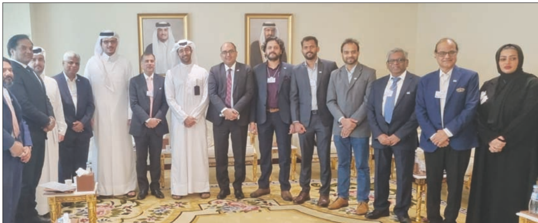
The delegation explored possibilities of co-operation and collaboration with the Qatari businesses and institutions.