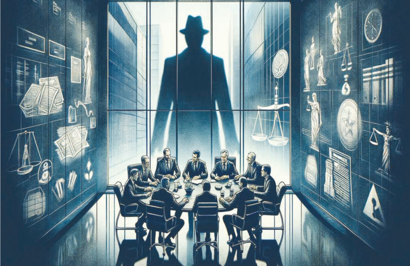
Business leaders are more comfortable cutting deals with themselves than they are with submitting to collective self-governance, but they are also deeply reliant on law and the political system that underpins it, writes the author.