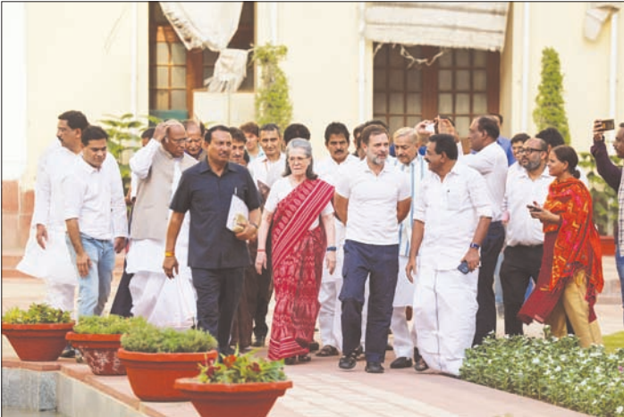
Senior Congress leaders Rahul Gandhi and Sonia Gandhi arrive to attend a meeting of the Congress Parliamentary Party comprising all newly elected Lok Sabha Members of Parliament (MP) and Rajya Sabha MPs in Central Hall of Parliament in New Delhi.

Gandhi is the scion of the dynasty that dominated Indian politics for decades and is the son, grandson and great-grandson of former prime ministers, beginning with independence leader Jawaharlal Nehru. If elected, as expected, he will be recognised as India’s official opposition leader when the