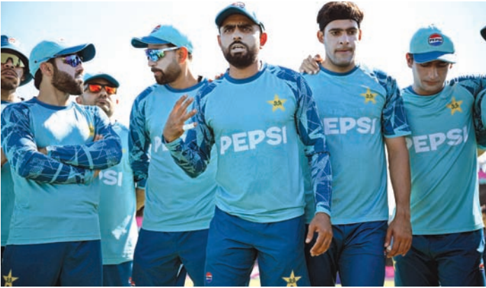
Babar Azam (centre) with his teammates prior to the start of their T20 World Cup match against the USA on Thursday.

'Black day': Pakistan reels from USA T20 World Cup stunner Cricket fans in Pakistan were hurt and angry yesterday after a stunning T20 World Cup loss to hosts the United States, describing it as a