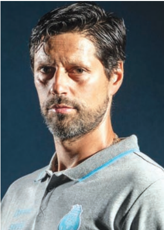
dre Villas-Boas as club president precipitated his departure.