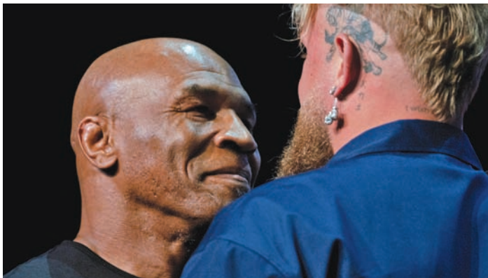
Boxers Mike Tyson and Jake Paul face off during a news conference in New York City, US, on May 13, 2024.