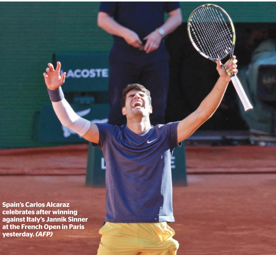
Spain's Carlos Alcaraz celebrates after winning against Italy's Jannik Sinner at the French Open in Paris yesterday.

fashion, earning another break after a loose Alcaraz service game and consolidating for a 2-0 edge on a picture-perfect day in Paris. Alcaraz belatedly spluttered into life though as Sinner struggled to maintain his sky-high standards from the opening set and presented his rival three break points with a double-fault. A brilliant cross-court winner hauled Alcaraz back on serve, with the Spaniard soon accelerating 5-2 ahead following another break as Sinner sprayed his forehand wide. Sinner temporarily slowed the Alcaraz charge, ending his five-game winning stretch, but the third seed levelled up the match the next game. The early onslaught from Sinner felt a distant memory as Alcaraz pounced to break for a 2-1 lead in the third set, flicking a sublime backhand passing shot beyond a powerless Sinner. Yet the momentum was quickly back with Sinner. He ripped a blistering one-two combination