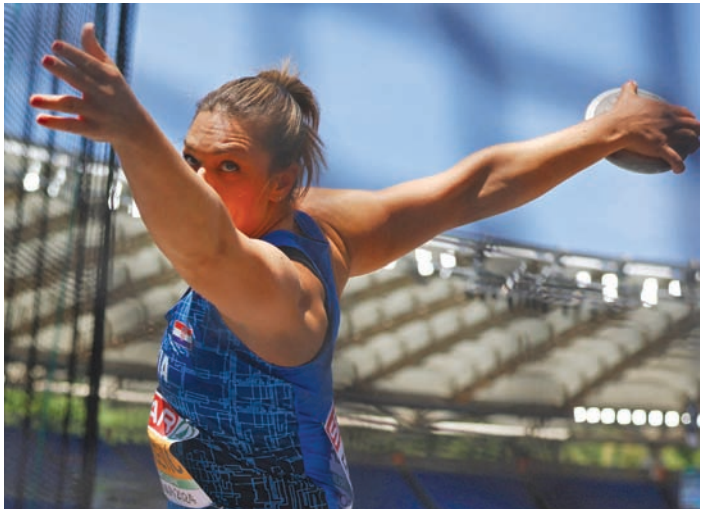
Croatia's Sandra Elkasevic in action during the women's discus throw qualification round at the European Athletics Championships in Stadio Olimpico, Rome, Italy, yesterday.