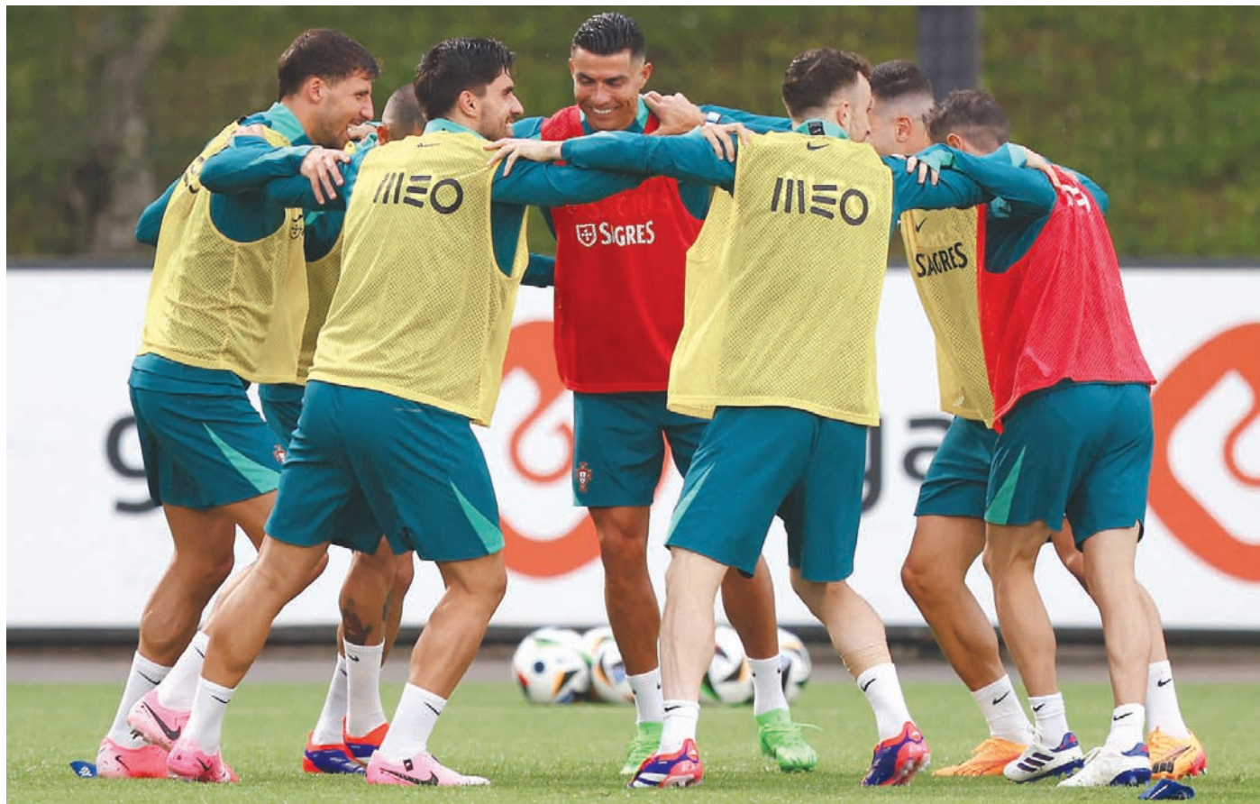
Portugal's Cristiano Ronaldo with teammates during a training session in Oeiras, Portugal, yesterday.

Forward is set to appear at a record sixth European tournament