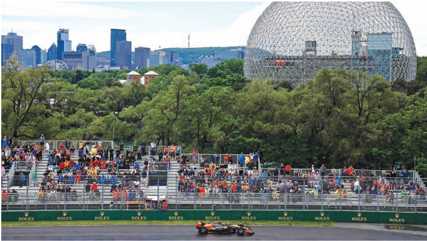
Lando Norris of Great Britain driving the McLaren MCL38 Mercedes on track during practice at the Grand Prix of Canada at Circuit Gilles Villeneuve in Montreal, Quebec, yesterday.

Vicious storms rumble across Montreal drenching the island circuit