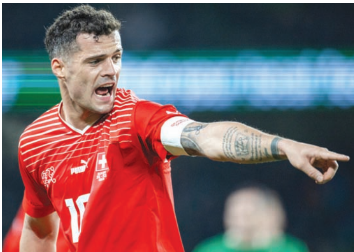
Granit Khaka will be instrumental to Switzerland's hopes when they kick off their Euro 2024 campaign against Hungary on June 15

Forwards: Alvaro Morata (Atletico Madrid), Joselu (Real Madrid), Nico Williams (Athletic Bilbao), Dani Olmo (RB Leipzig/GER), Lamine Yamal, Ferran Torres (both Barcelona), Mikel Oyarzabal (Real Sociedad), Ayoze Perez (Real Betis)