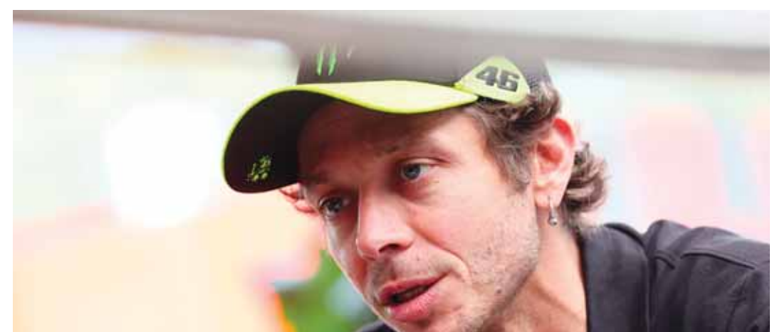
Italian driver Valentino Rossi addresses an interview before the FIA World Endurance Championship 2024 6 hour race of Spa-Francorchamps in Francorchamps, on May 10, 2024.

"There are also similarities, such as braking, finding the right line, hitting the gas at the right