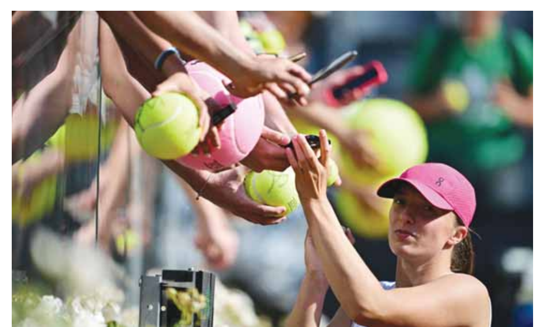
Poland's Iga Swiatek signs autographs after winning against Germany's Angelique Kerber during Italian Open at Foro Italico in Rome yesterday.

"Obviously it's not the greatest feeling when you're on court, your first reaction is kind of your own safety," said Keys. "It's obviously