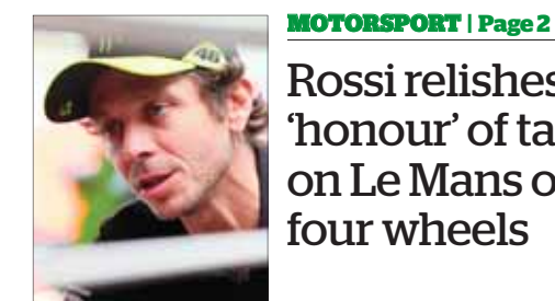
Rossi relishes 'honour' of taking on Le Mans on four wheels