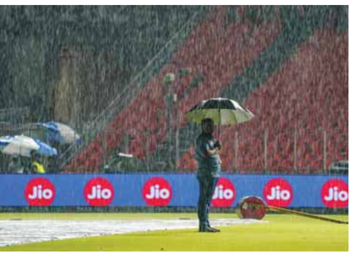
A ground staff takes shelter under an umbrella as rain delays the start of the Indian Premier League match between Guiarat Titans and Kolkata Knight Riders in Ahmedahad vesterday (AFP)

Rain was unrelenting for close to five hours as the two captains eventually shook hands without