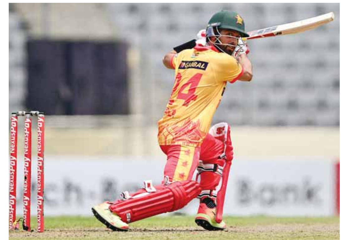
Zimbabwe's Sikandar Raza plays a shot during the fifth Twenty20 international against Bangladesh in Dhaka yesterday.

Zimbabwe 158 for 2 (Raza 72* Bennett 70 Shakih 1-9) beat Bangladesh 157 for 6 (Mahmudullah 54, Shanto 36. Bennett 2-20) by 8 wickets