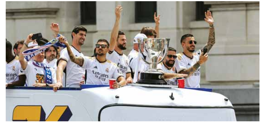
Real Madrid players parade onboard a bus as they celebrate their 36th Spanish La Liga trophy at the Cibeles square in Madrid yesterday.

"Today is the day to enjoy it, when it's something so deserved, something so big as winning the league, it's the day to go to Cibe-