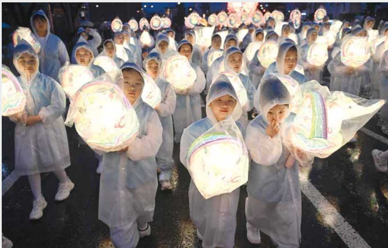
Participants march during a lantern parade as part of a 'Lotus Lantern Festival' to celebrate the upcoming Buddha's birthday, in Seoul, yesterday.