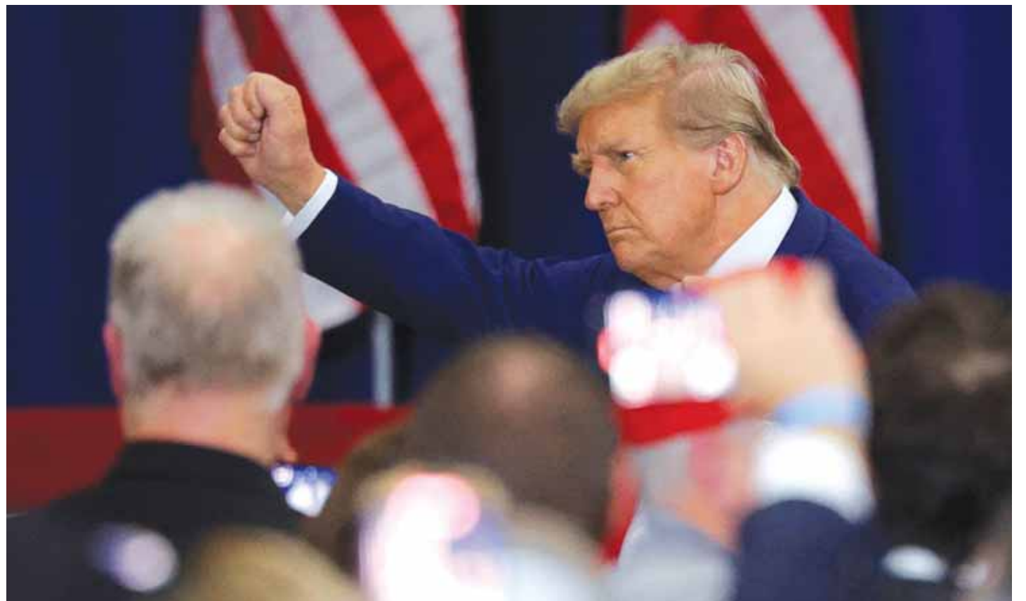
Republican presidential candidate and former US president Donald Trump gestures during a campaign rally in Green Bay, Wisconsin, last month.