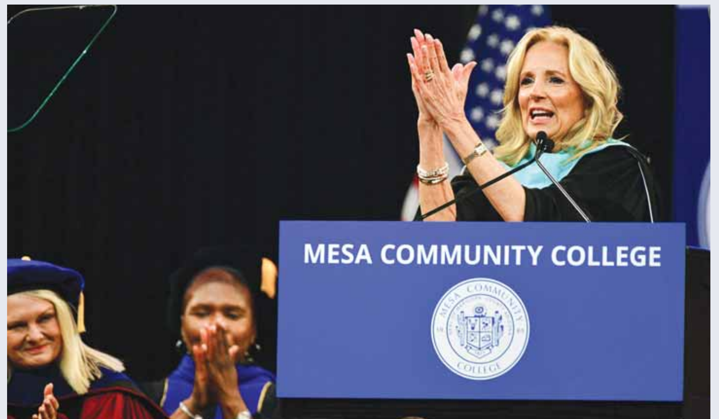
US First Lady Jill Biden delivers the commencement address for Mesa Community College at Desert Financial Arena in Tempe, Arizona, yesterday.