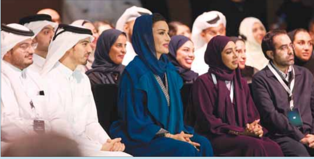
Her Highness Sheikha Moza bint Nasser attending QF's Annual Alumni Forum yesterday.