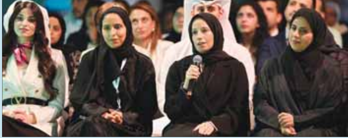
HE the Minister of Education and Higher Education Buthaina bint Ali al-Jabr al-Nuaimi addressing the event.

Her Highness Sheikha Moza bint Nasser, Chairperson of Qatar Foundation, attended yesterday (Saturday) Qatar Foundation's Annual Alumni Forum, as a new award celebrating graduates of the organisation's unique education ecosystem who drive positive change in their communities was announced. Hundreds of alumni of Qatar Foundation (QF)'s schools, international partner universities, and Hamad Bin Khalifa University came together at the Forum to reconnect, build networks of knowledge and support, share their stories and journeys, and air their views on topics related to their careers with key national stakeholders. Attended by HE Sheikha Hind bint Hamad al-Thani, Vice Chairperson and CEO of Qatar Foundation, ministers, other dignitaries, and leaders of industry and business, the 2024 edition of the Forum - which is part of the QF Alumni Programme - was held around the theme of social responsibility and moral commitment, reflecting how civic duty and Islamic values are intertwined. The criteria for the QF Alumni Award, will be linked to each year's Annual Alumni Forum theme, and in 2024-25 it will honour and celebrate alumni who have contributed to society through their dedication to social responsibility and civic engagement across four categories. Her Highness Sheikha Moza said: