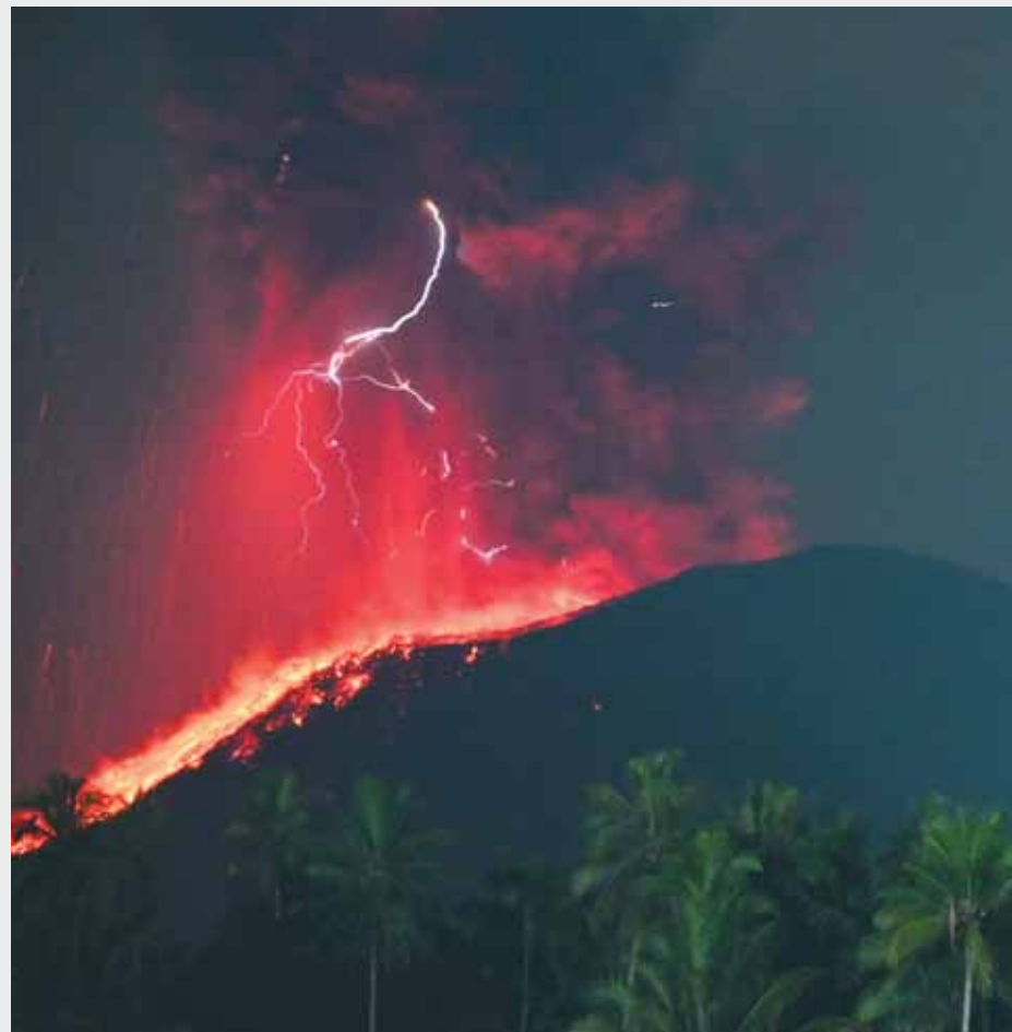
This handout photo taken yesterday and released by the Geological Agency of Indonesia shows a volcanic eruption from Mount Ibu in Indonesia's North Maluku province.