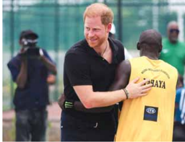
Prince Harry in a black polo shirt talking to a young boy in a yellow jersey.

point for both teams and broadly smiled and cheered when Harry's first point was notched up. The match at an officer's mess complex in Abuja saw Harry's team dressed in yellow playing off in an exhibition against a team led by Nigeria's chief of defence staff, the country's top commander. With chants of "Team Harry, Team Harry" when they scored, the prince's team took an early lead with players seated on foam mats, some missing legs. However, they lost the match to the commander's squad Team CDS.