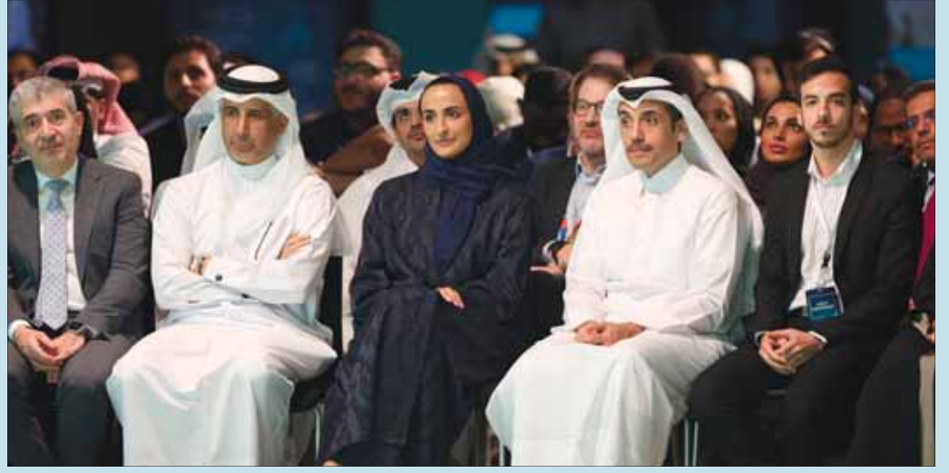
HE Sheikha Hind bint Hamad al-Thani at the event.