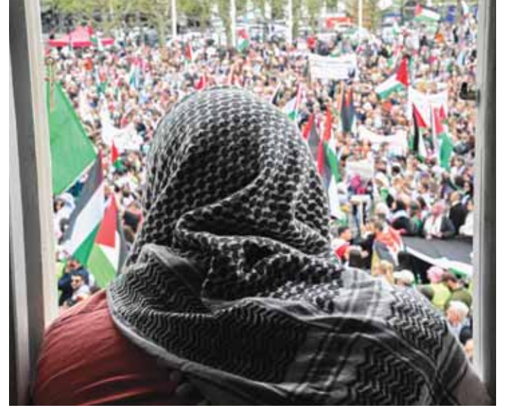
A man wearing a keffiyeh looks out of the window of a fast-food restaurant as pro-Palestinian protesters opposing Israel's participation in the 68th edition of the Eurovision Song Contest (ESC) demonstrate in Malmö, Sweden.

the Hamas-run territory's health ministry. Israel ranks with Croatia and Switzerland as one of the bookmakers' favourites in the singing extravaganza, which 162mm television viewers watched last year. Golan's song is an adaptation of an earlier version named October Rain , which she modified after organisers deemed it too political because of its apparent allusions to the Hamas attack. Israel has been taking part in Eurovision since 1973, most recently winning it for the fourth time in 2018. However, the country's participation this year has caused bitter divisions. Israel's Prime Minister Benjamin Netanyahu wished Golan good luck and said she had "already won" by enduring the protests that he called a "horrible wave of anti-Semitism". In Spain, the far-left Sumar party on Friday launched a petition calling for Israel to be excluded from the competition while "its army is exterminating the Palestinian people and razing its land". Meanwhile German Culture Minister Claudia Roth denounced as "absolutely unacceptable" calls to boycott Israeli artists. The EBU has insisted that it does