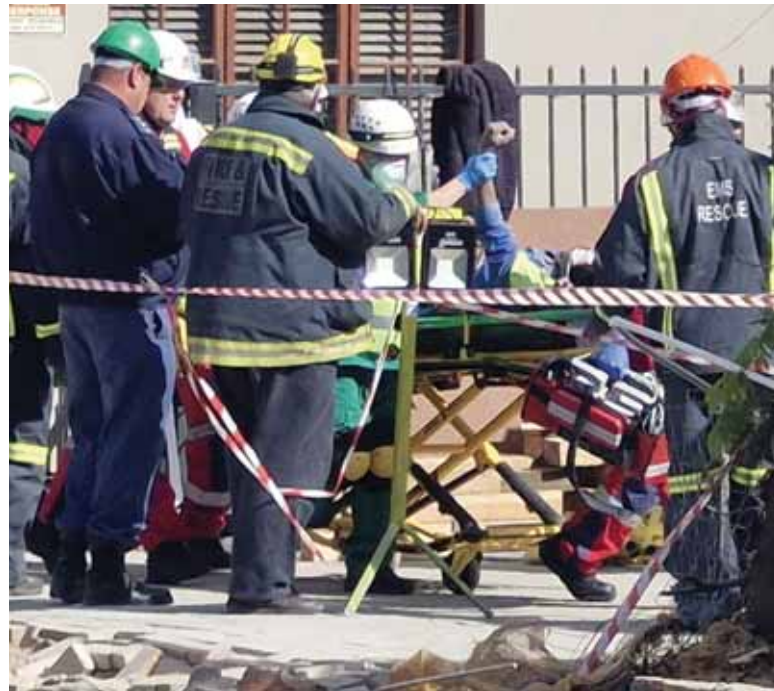
A man raises his hand as rescue workers carry him to an ambulance after being rescued, having survived 118 hours after a deadly building collapse in George, South Africa.