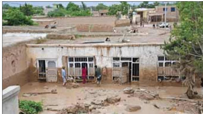
Afghan men clear mud from a house following flash floods after heavy rainfall at a village in Baghlan-e-Markazi district of Baghlan province, yesterday.

There were disparities between the death tolls provided by the government and humanitarian agencies.