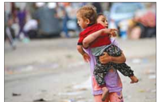
A Palestinian girl carries a toddler as people flee Rafah in the southern Gaza Strip to a safer location yesterday.

Israeli strikes yesterday hit parts of Gaza including Rafah where Israel expanded an evacuation order and the UN warned of an "epic" disaster if an outright invasion of the crowded city goes ahead. AFP journalists, medics and witnesses reported strikes across the coastal territory, where the UN says humanitarian relief is blocked after Israeli troops defied international opposition and entered eastern Rafah this week, effectively shutting a key aid crossing and suspending traffic through another. At least 21 people were killed during strikes in central Gaza and taken to Al-Aqsa Martyrs Hospital in Deir al-Balah city, a hospital statement said. Bodies covered in white lay on the ground in a courtyard of the facility. A man in a baseball cap leaned over one body bag, clasping a dust-covered hand that protruded. The feet of another corpse poked from under a blanket bearing the picture of a large teddy bear. In Rafah, witnesses reported intense air strikes near the crossing with Egypt, and AFP images showed smoke rising over the city. Other strikes occurred in north Gaza, witnesses said. Hamas yesterday accused Israel of "expanding the incursion into Rafah to include new areas in the centre and the west of the city"