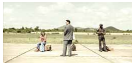
Rendez-vous avec Pol Pot

Critics' Week: The Brink of Dreams (Egypt, France, Denmark, Saudi Arabia, Qatar), by Nada Riyadh and