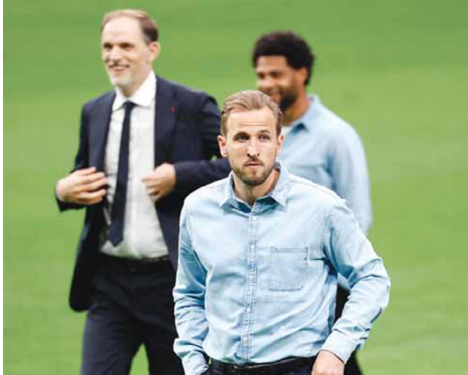
Bayern Munich coach Thomas Tuchel (left) and Harry Kane at the Santiago Bernabeu Stadium in Madrid yesterday, ahead of their Champions League semi-final against Real Madrid.

Former Borussia Dortmund midfielder Jude