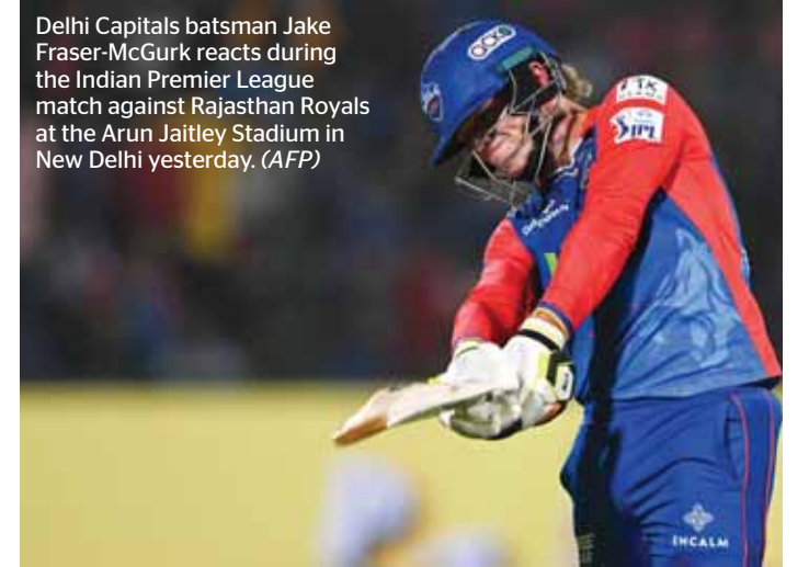
Delhi Capitals batsman Jake Fraser-McGurk reacts during the Indian Premier League match against Rajasthan Royals at the Arun Jaitley Stadium in New Delhi yesterday.