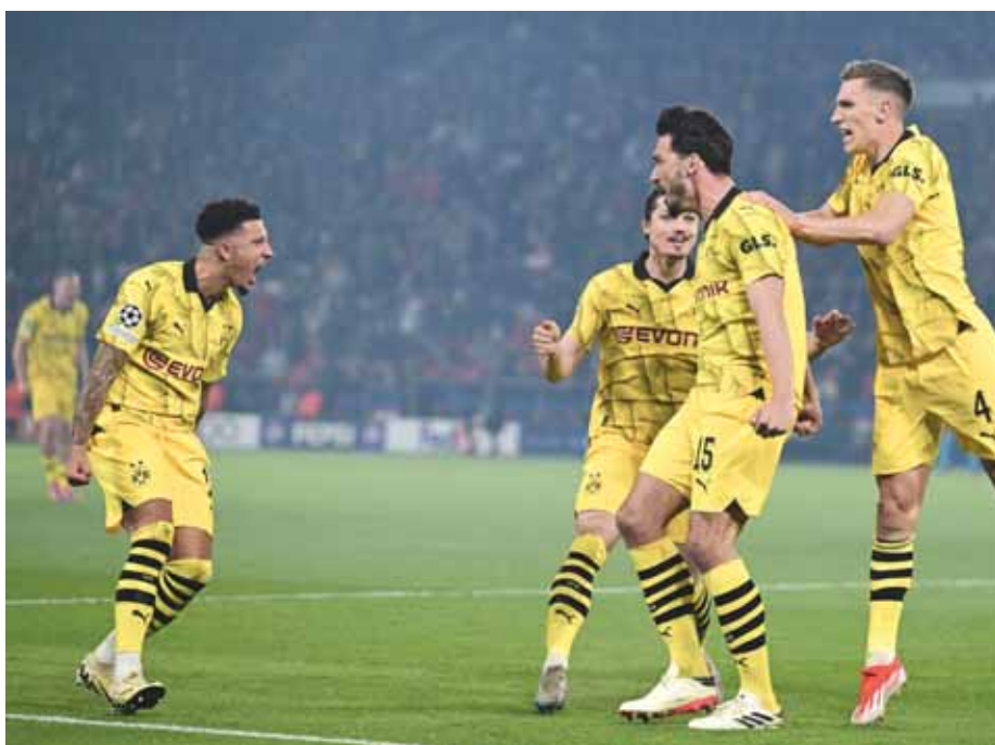
Dortmund's Mats Hummels (second right) celebrates with teammates after scoring against Paris Saint-Germain during the Champions League semi-final second leg match.

Luis Enrique's team had won 2-0 at home against the same opponents in the group stage and were safe in the knowledge that a repeat of that performance would be enough. The