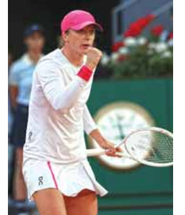
Poland's Iga Swiatek reacts to winning a point against Belarus' Aryna Sabalenka during the Madrid Open final at Caja Magica in Madrid on May 4.

The American third seed was plagued by multiple double-faults in a fourth-round defeat last week to compatriot Madison Keys in