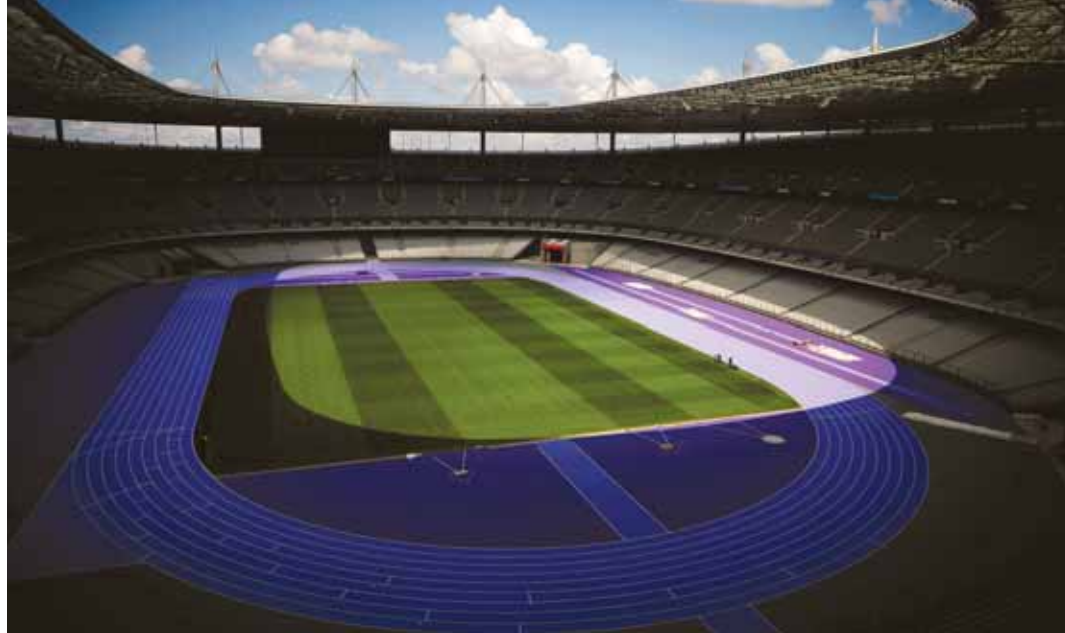
A general view shows the Paris 2024 Olympic and Paralympic Games' athletics track of two shades of purple inside the Stade de France stadium, in Saint-Denis near Paris, France, yesterday.

In the background, around 6,000 members of the security forces are expected to be on duty in a major test of the vast security plans put in place at a time when