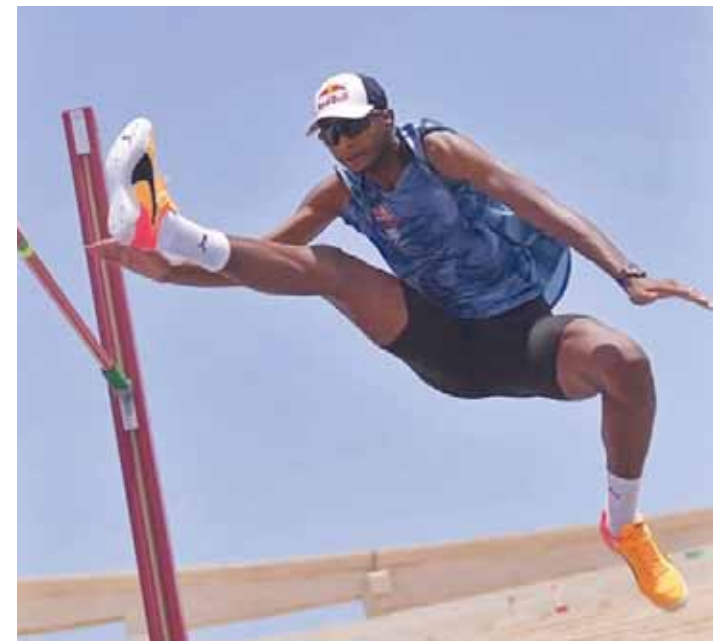
Qatar's high jump icon Mutaz Barshim trains at the Katara Amphitheatre, ahead of his brainchild event - 'What Gravity Challenge'.