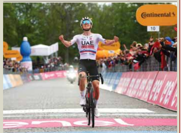
Team UAE's Slovenian rider Tadej Pogacar celebrates as he crosses the finish line to win the 2nd stage of the 107th Giro d'Italia cycling race, 161km between San Francesco al Campo and Sanctuary of Oropa (Biella), in Biella yesterday.

Turin: Race favourite Tadej Pogacar made light of a mechanical problem to blast into the lead of the Giro d'Italia with victory on the summit finish to the 161km second stage yesterday. The Slovenian suffered a puncture at the foot of the steep 11km climb to Santuario di Oropa but he was helped back into the group by his team mates before launching a devastating solo attack. No one could stay with the UAE Team Emirates rider who poured on the power to win by 27 seconds and take possession of the Maglia Rosa two days into his maiden Giro. Dani Martinez (BORA-Hansgrohe) was second just ahead of Ineos Grenadiers leader Geraint Thomas. Pogacar had already gained time on his GC rivals in Saturday's opening stage when he was out-sprinted to the line by Jhonatan Narvaez who wore the Maglia Rosa yesterday. But by the end of stage two he already has a 45-second advantage over Britain's Thomas, who is regarded as the most likely