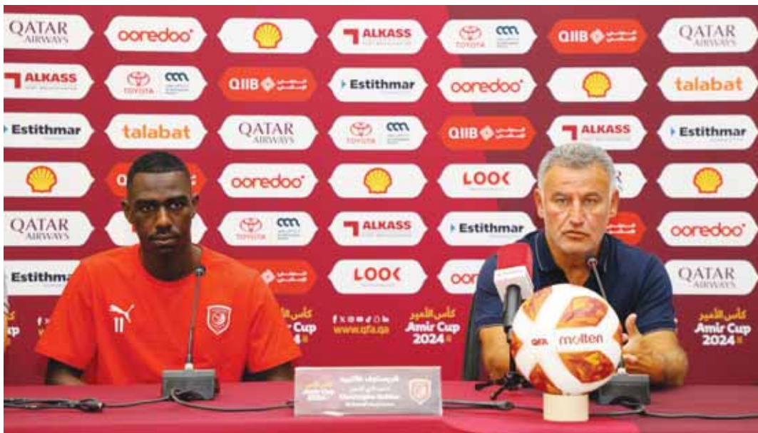
Al Duhail coach Christophe Galtier (right) and captain Almoez Ali address the media yesterday, on the eve of their Amir Cup 2024 Round of 16 match against Al Shamal.

"There is disappointment among the entire Al Duhail team members and fans but this Amir Cup is an opportunity for us to make amends. It will not be an easy match and I have told my players to focus on Al Shamal match as they are an organised team. A victory means we stay in the tournament," he added.