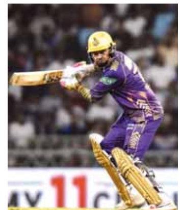
Kolkata Knight Riders' Sunil Narine plays a shot against Lucknow Super Giants yesterday.