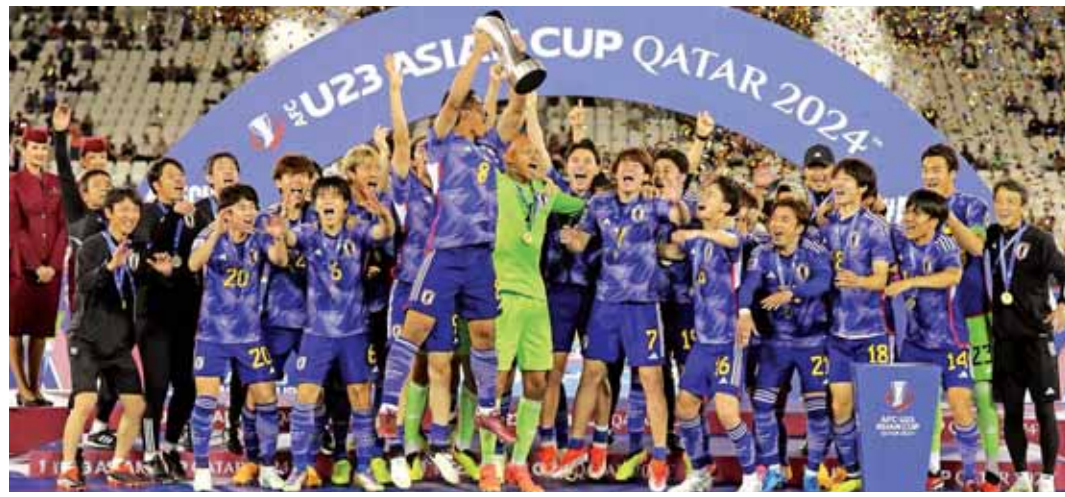
Japan players celebrate with the trophy after winning the AFC U23 Asian Cup Stadium in Doha on Friday.

national stadiums, which previously hosted matches during the FIFA World Cup Qatar 2022, were joined by Abdullah Bin Khalifa and