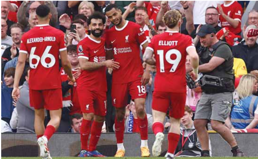
Liverpool's Cody Gakpo (centre) celebrates with teammate Mohamed Salah (second from left) after scoring a goal during the Premier League match against Tottenham Hotspur at Anfield in Liverpool yesterday.

tenham that Richarlison reduced the deficit in the 72nd minute before setting up Son Heung-min's goal five minutes later.