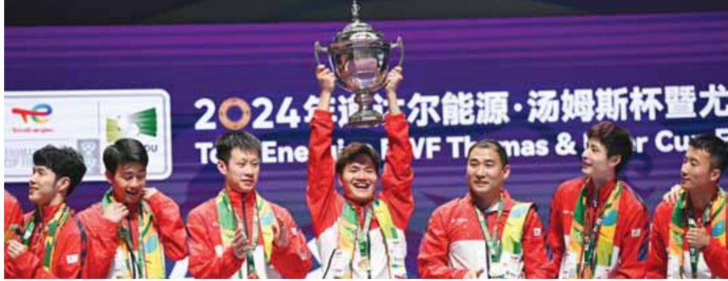
Members of Chinese men's badminton team pose with the trophy after their victory over Indonesia in the finals of the Thomas and Uber Cup badminton tournament in Chengdu, China.

The Chinese pair fought back time and again after trailing 10-4 in the opening game, 6-3 in the second and 8-4 in the third in a gutsy display. World number three Jonatan Christie gave Indonesia some hope when he beat sixth-ranked