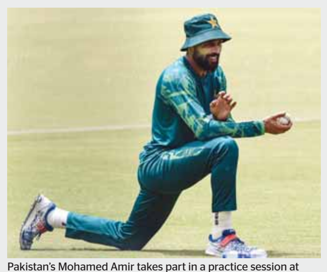
the Gaddafi Cricket Stadium in Lahore yesterday, ahead of Pakistan's Twenty20 series in Ireland and England later this