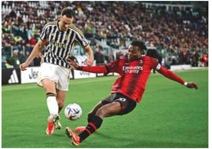
AC Milan's Rafael Leao (right) tackles Juventus' Federico Gatti during the Serie A match in Turin, Italy, yesterday.

But the celebrations were still bubbling in the stands when Lorenzo Venuti was penalised for handball and Pessina casually slotted home the leveller. Lecce should still be safe from the drop as they sit eight points above the relegation zone in 13th position.