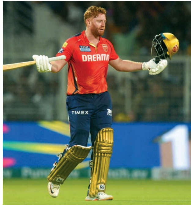
Punjab Kings' Jonny Bairstow celebrates after scoring a century during the Indian Premier League match against Kolkata Knight Riders at the Eden Gardens in Kolkata yesterday. Right: Punjab Kings' Prabhsimran Singh plays a reverse sweep yesterday.