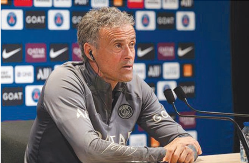
Paris Saint-Germain's coach Luis Enrique speaks at a press conference yesterday.