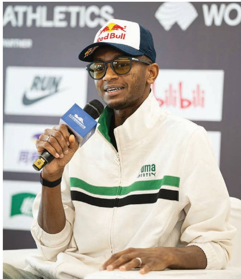
Qatar high jump legend Mutaz Barshim speaks at a press conference yesterday, on the eve of the Suzhou Diamond League in China.