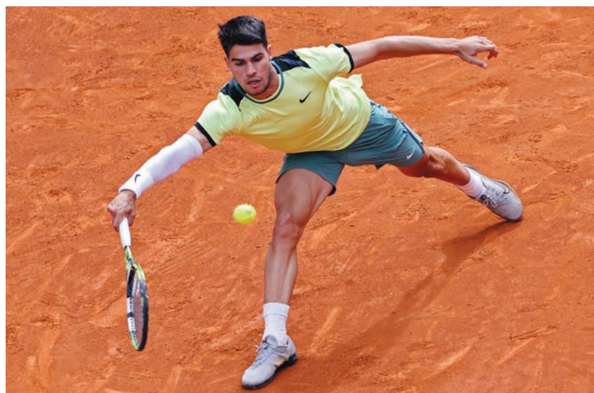
Spain's Carlos Alcaraz returns the ball to Russia's Alexander Shevchenko during the 2024 Madrid Open match yesterday. Right: Aryna Sabalenka reacts during her Madrid Open match against Poland's Magda Linette.

Wearing a protective sleeve on his right arm, two-time Grand Slam winner Alcaraz quickly dispelled any doubts after his time out by flying out of the blocks in the