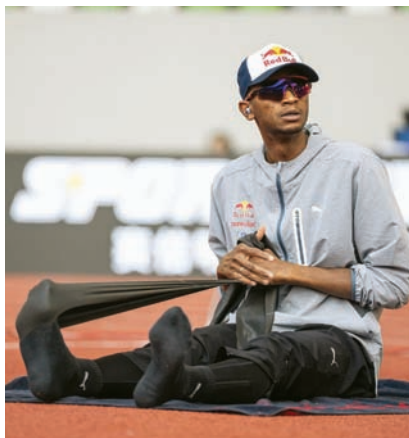
Mutaz Barshim during training in Suzhou, China, yesterday.

"As professional athletes we deal with a lot. There's one thing which is the biggest thing and that is injury. In 2018, I injured my left Achilles, broke both my ligaments and it was a very dark time for me, mentally and physically. One second you are the best and a few moments later you're on a wheelchair and they're dragging you out of the surgery room. Gianmarco, my friend, had a similar injury in 2016 just before the Rio Olympics which prevented him from