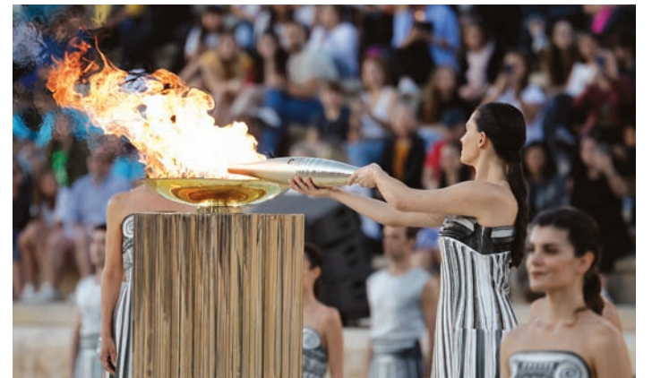
Greek actress Mary Mina, playing the role of High Priestess, holds the Olympic torch by the cauldron during the Handover Ceremony for the Paris 2024 Olympics at Panathenaic Stadium, Athens, Greece, yesterday.