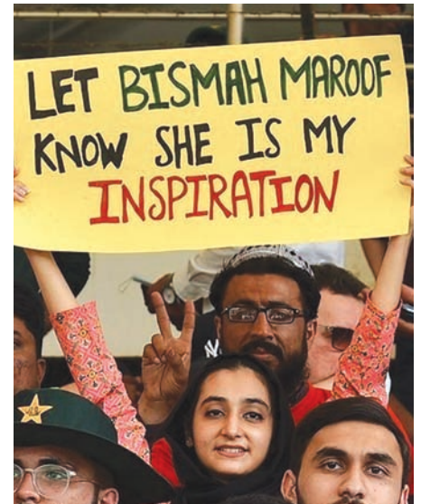
A young fan holds a placard during a cricket match involving Pakistan women's team in this 2022 file photo.

"The support from the PCB has been invaluable, particularly in implementing the first-