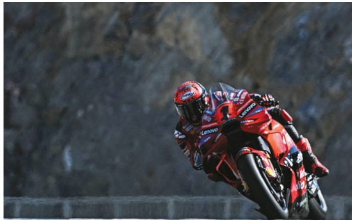
Ducati Italian rider Francesco Bagnaia rides during the first practice session of the Spanish Grand Prix at the Jerez racetrack in Jerez de la Frontera yesterday.

The six-time MotoGP world champion, who has switched stables after 10 years at Honda, is on the hunt for his first win since Oc-