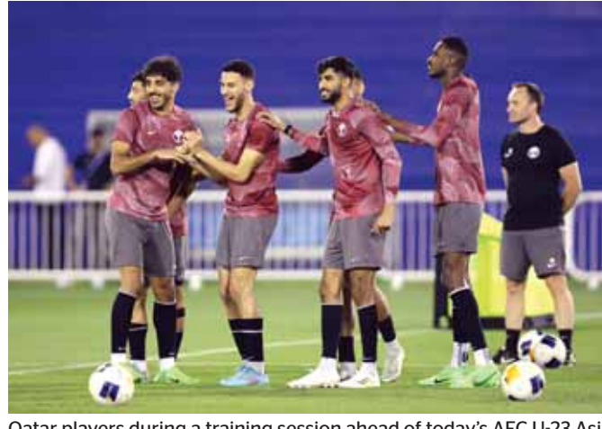
Qatar players during a training session ahead of today's AFC U-23 Asian Cup quarter-final against Japan.