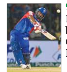
India's Pant boosts World Cup hopes with IPL batting blitz