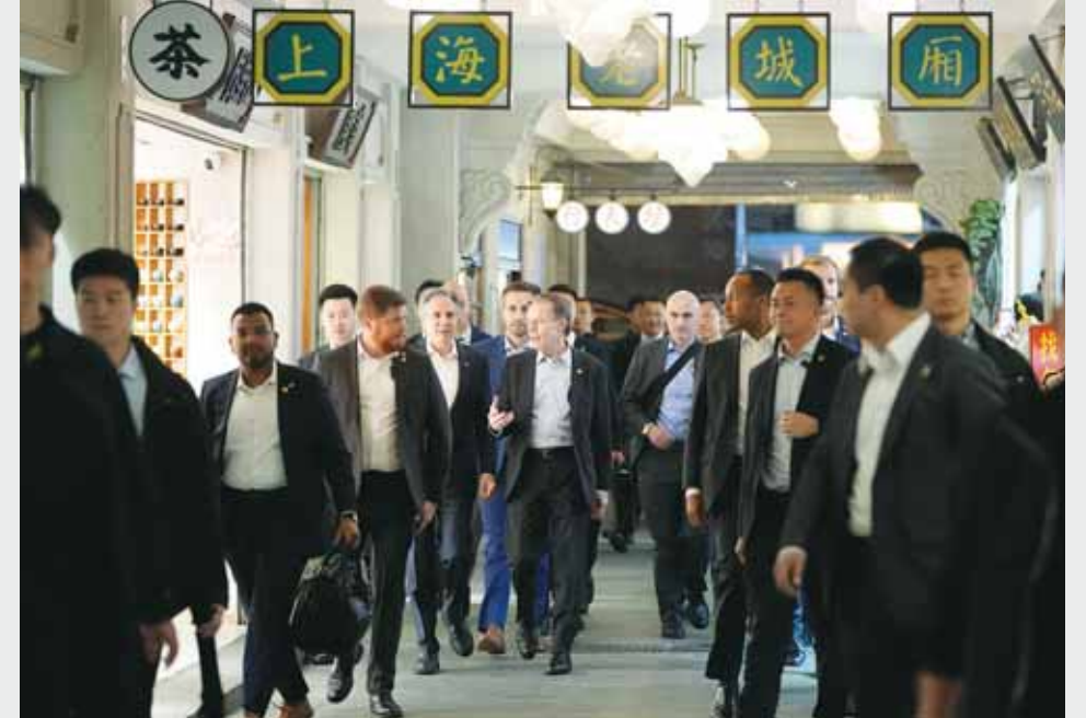
US Secretary of State Antony Blinken and US ambassador to China Nicholas Burns walk through the Yu Gardens in Shanghai, China, yesterday. Blinken is on his second visit to China, as the US ramps up pressure on its rival over its support for Russia while also seeking to manage tensions with Beijing.