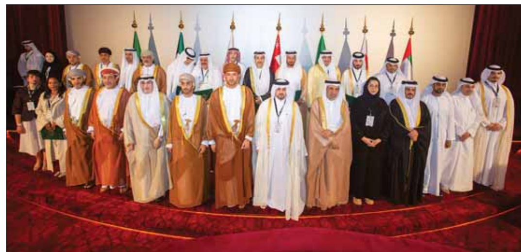
The meeting of the GCC Undersecretaries Responsible for Antiquities and Museums was held in Doha, yesterday.

Qatar Museums (QM) hosted the 22nd meeting of the GCC Undersecretaries Responsible for Antiquities and Museums yesterday, in collaboration with the GCC General Secretariat, a statement said.