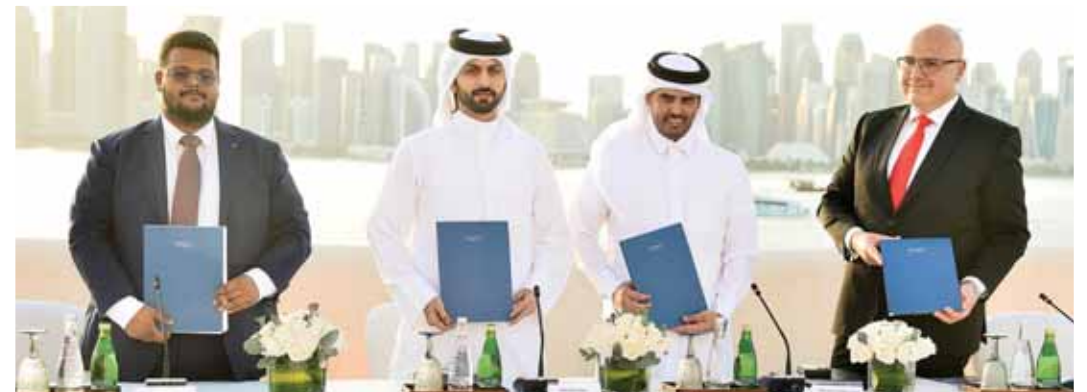
The MoU-signing between prominent marinas in Qatar held at Doha Port yesterday.

"Old Doha Port is proud to lead and play a significant role in this collaborative initiative. Through shared objectives and pooling our resources, we aim to significantly elevate Qatar's marina