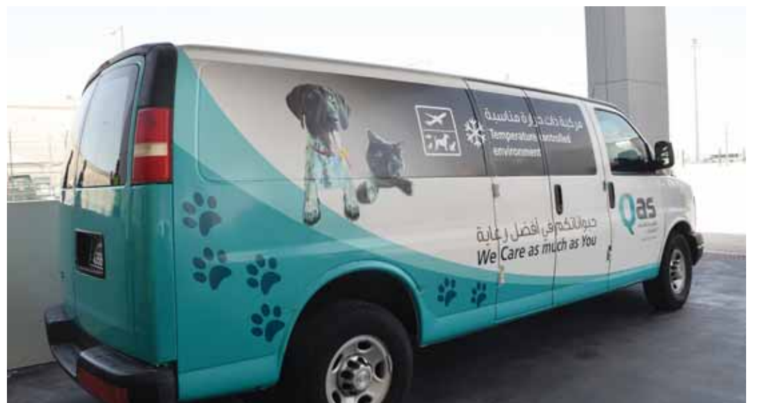
Qatar Airways Cargo uses dedicated pet vans to transport them from the aircraft to its state-of-the-art animal centre.