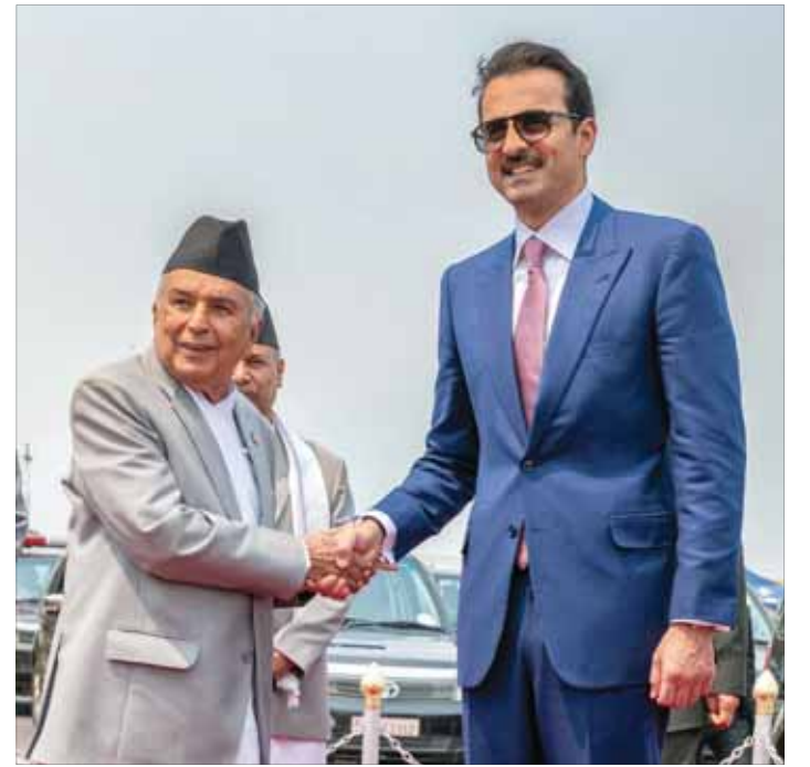
His Highness the Amir is seen off at the Tribhuvan International Airport, Kathmandu, by Nepal's President Ram Chandra Poudel.

The Nepal premier hosted a luncheon banquet in honour of His Highness the Amir and the accompanying delegation.