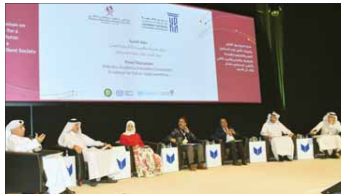
A panel discussion during the opening ceremony.

regional educational institutions, industry stakeholders and policy-makers to initiate dialogue on the role of STEM and TVET education in creating an industry-ready workforce.