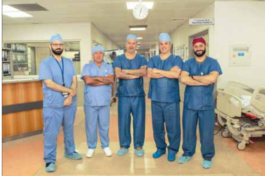
The team that conducted the surgical procedure.

"The surgical procedure was performed using the Da Vinci robot, in approximately two-and-a-half hours.