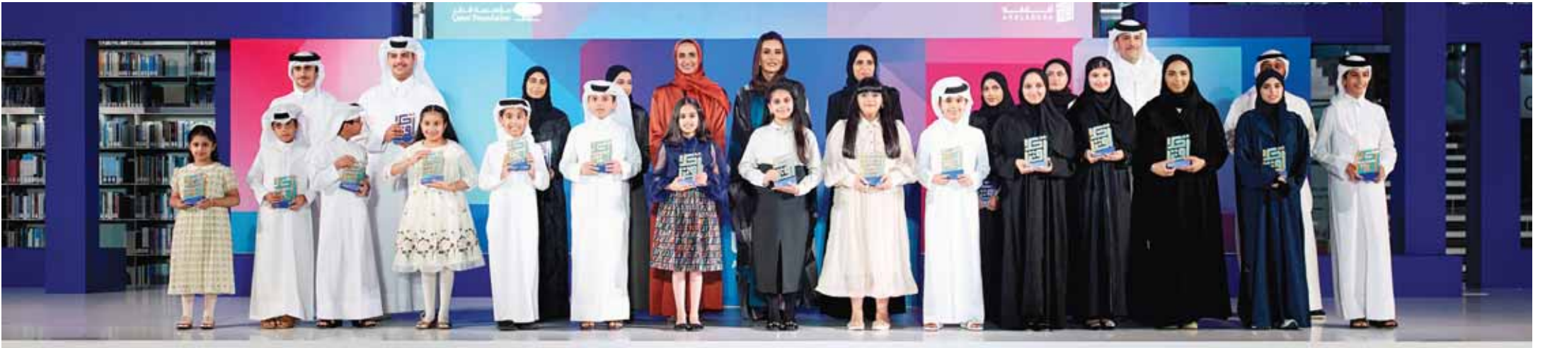
Qatar Foundation Chairperson, Her Highness Sheikha Moza bint Nasser, honoured the winners of the 2024 Akhlaquna Awards during a ceremony held at Qatar National Library in Education City yesterday. The ceremony was attended by QF Vice-Chairperson and CEO HE Sheikha Hind bint Hamad al-Thani, alongside ministers, officials, and parents of the awardees.