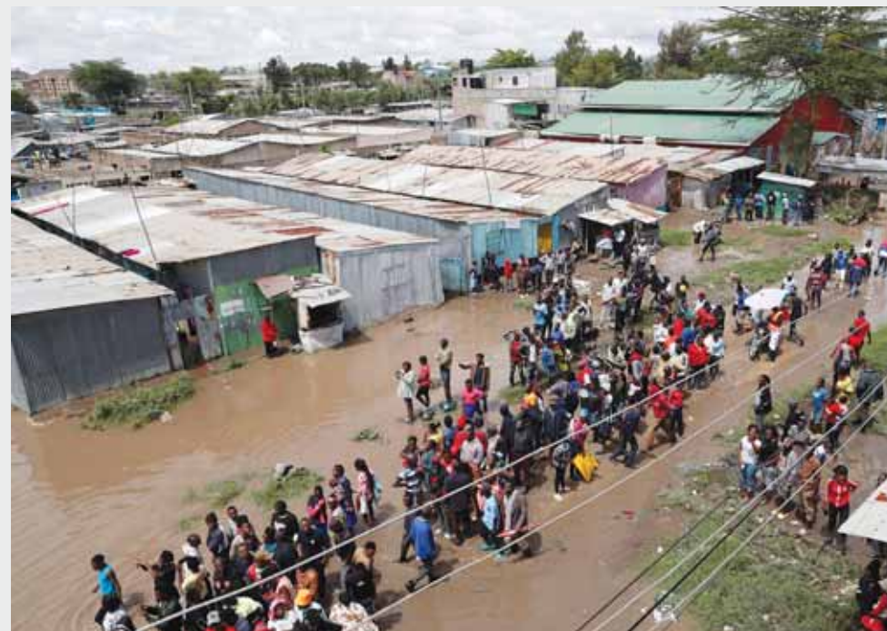
Residents gather outside their shelters after the Athi River burst its banks following heavy rainfall in the Kwa Mang'eli settlement of Machakos county near Nairobi, Kenya, yesterday. The flash floods has wreaked devastation across the Kenyan capital yesterday, claiming at least four lives.