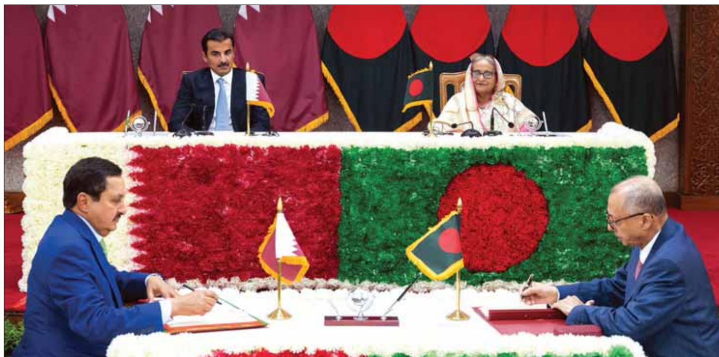
His Highness the Amir Sheikh Tamim bin Hamad al-Thani's visit to Bangladesh witnessed the signing of several agreements.

The Bangladesh Post showed keen interest in the visit of His Highness the Amir to Bangladesh, as reported in an article titled "Bangladesh Rolls Out Red Carpet for Qatar Amir". The paper said that the visit focused on various agreements concerning combating tax evasion, legal co-operation, maritime transport, as well as the development and protection of mutual investments, and the establishment of a joint business council. Several Bangladeshi TV channels provided extensive coverage of His Highness