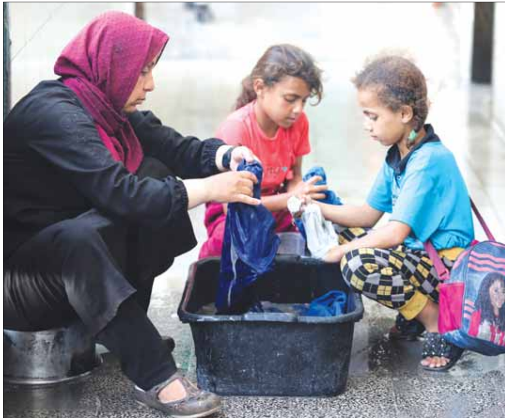
Displaced Palestinians, who fled their homes due to Israeli strikes, wash clothes as they shelter in a UNRWA-affiliated school, amid the ongoing conflict between Israel and Hamas, in Deir al-Balah, in the central Gaza Strip.

UNRWA and other UN agencies must be able to carry out their jobs of distributing aid in