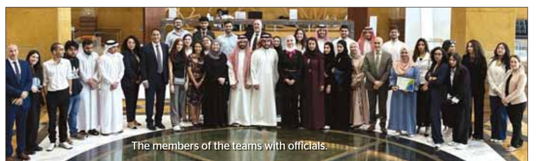
The members of the teams with officials.

The event saw the participation of 10 university teams from across the Middle East, including