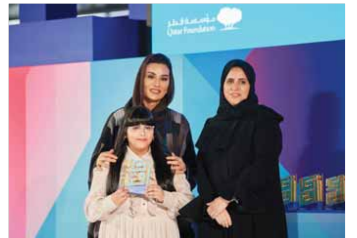
Her Highness Sheikha Moza bint Nasser honoured the winners of the 2024 Akhlaquna Awards yesterday. Page 5