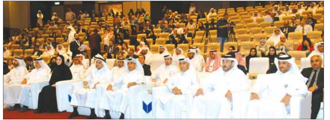
Some of the dignitaries at the opening session yesterday.