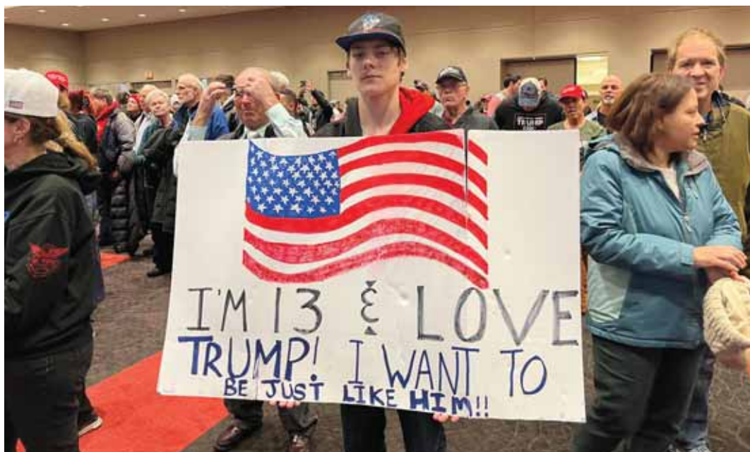
A young Donald Trump supporter holds up a sign, at a Trump rally in Green Bay, Wisconsin. (Reuters)

"Some of it is extreme," Turner said of Trump's speech. "But at the same time if it means the country is going to do phenomenally better...and it's still going to be a free country I can take my feelings getting hurt in exchange for that." — Reuters