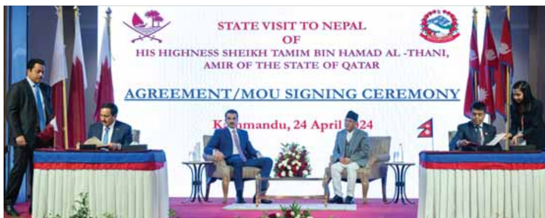
His Highness the Amir Sheikh Tamim bin Hamad al-Thani and Nepal's Prime Minister Pushpa Kamal Dahal witness the signing ceremony yesterday.