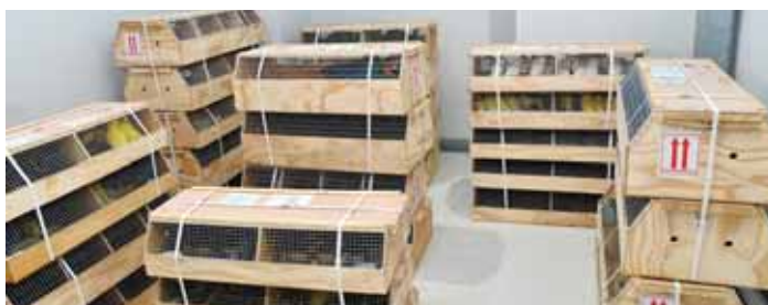
The facility has separate rooms for birds.