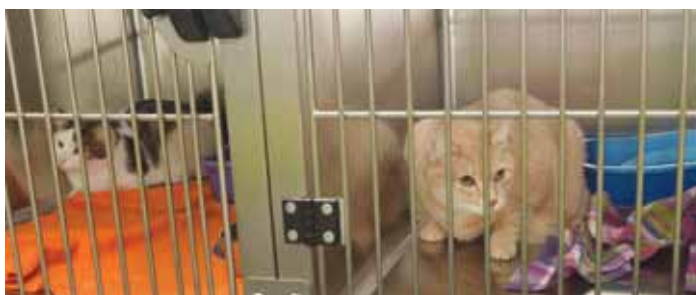
Cat kennels at Qatar Airways Cargo's Animal Centre.

"This holistic approach to animal care is a fundamental part of our ethos, driving us to innovate and lead in the industry. With our new Animal Centre and service enhancements, we are not just setting new standards for animal transport, we are actively working towards a future, where every aspect of our operations reflect a deep respect for animal welfare, embodying our commitment to making a meaningful difference in their lives."