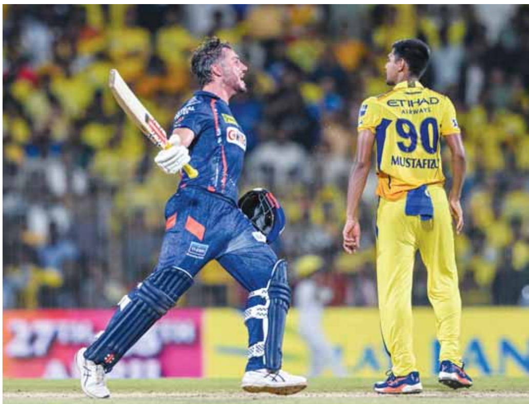
Lucknow Super Giants' Marcus Stoinis (left) celebrates after his team's win at the end of the Indian Premier League match against Chennai Super Kings in Chennai yesterday.

It was the highest score by a batsman while chasing in the IPL.