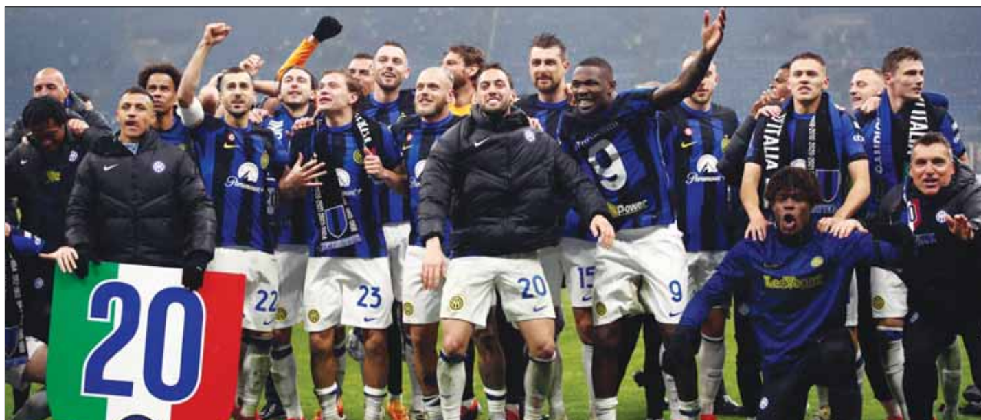
Inter Milan players celebrate after winning the Serie A title after victory over AC Milan at the San Siro on Monday.

Inzaghi's men secure crown with five matches remaining