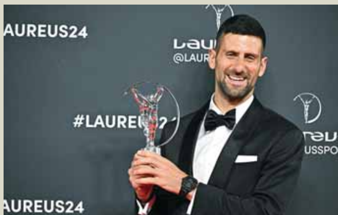
Serbian tennis player Novak Djokovic poses with the Laureus World Sportsman of the Year award during the 25th Laureus World Sports Awards gala in Madrid.