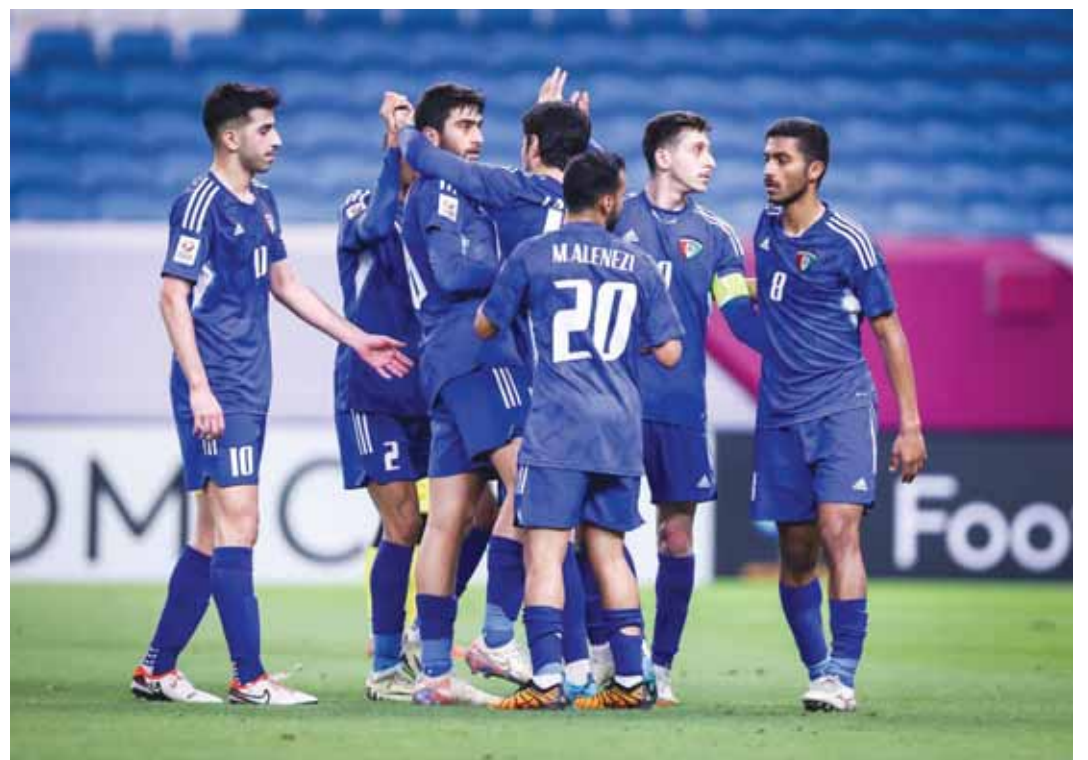
Kuwait players celebrate after their win over Malaysia in the Group D match at the Al Janoub Stadium in Al Wakra yesterday.

Both teams had already been eliminated prior to the match but the win for Kuwait allowed them to leave on a high while Malaysia go home without a point for the second successive edition.