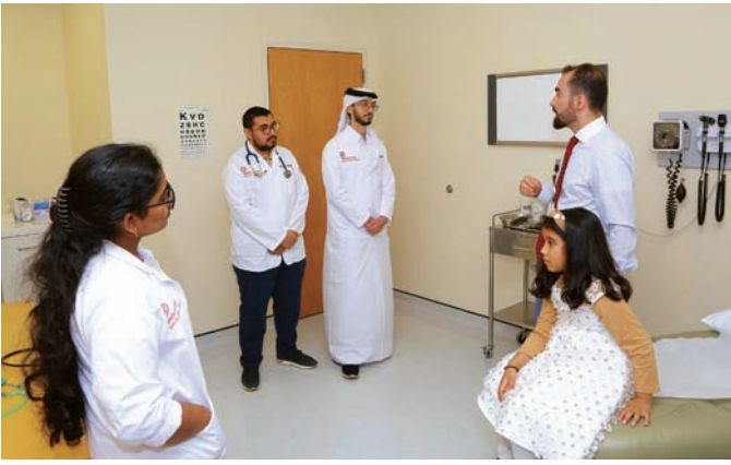
The Cornell Stars event brings together faculty, students, staff, and their children.