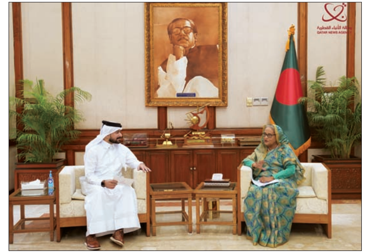
Bangladesh Prime Minister Sheikh Hasina Wazed speaks to QNA during an interview yesterday.

remain deeply committed to the UN charter and the principles of the OIC in their common pursuit of peace, development, and justice globally.