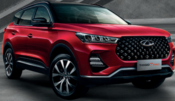
TIGGO 7 PRO