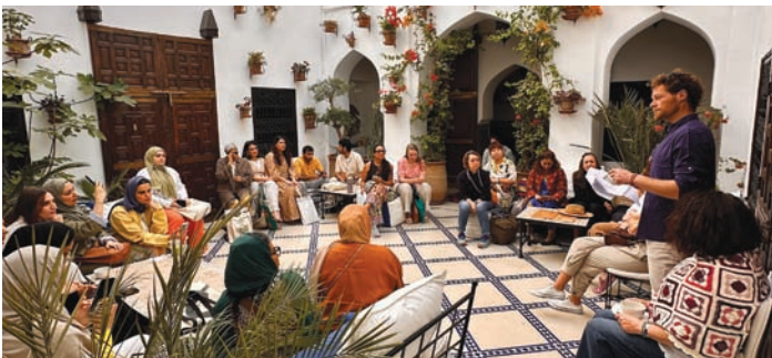
The journey will begin in Marrakesh, where the artists will explore the city and the splendour of Moroccan architecture.

"The enriching cultural journey inspires the artists to craft artworks that enrich Qatar's vibrant cultural scene," he said.