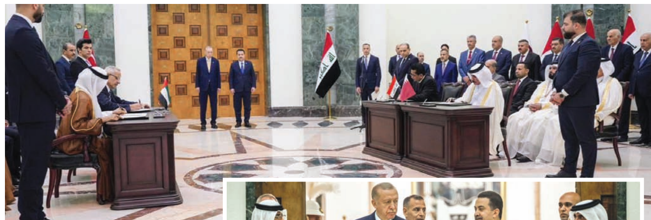
Snapshots from the signing ceremony.

The project is to create a land route and