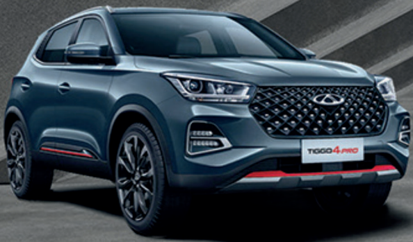
TIGGO 4 PRO