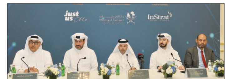
Officials announce details of the Autonomous e-Mobility Forum yesterday.

The Autonomous e-Mobility (AEMOB) Forum will host more than 40 speakers from 20 countries, at Qatar National Convention Centre from April 30-May 2. The event, under the patronage of HE the Minister of Transport Jassim Saif Ahmed al-Sulaiti, is featuring policymakers, representatives of government agencies, academics, industry experts, engineers, consultants. "The world faces a critical turning point in fulfilling the pressing need for sustainable transportation solutions. Autonomous e-vehicles are among the promising alternatives in this field," said MoT's acting assistant undersecretary of Land Transport Affairs engineer Hamad Essa Abdulla. In step with that global trend, he added, Qatar has gone a long way in implementing the strategy of the gradual transitioning to e-vehicles and expanding their use. "More than 70% of the public bus fleet has been transitioned to electric and the plan is to increase that gradually to 100% by 2030," he said. The forum will include keynote speeches, presentations and panel