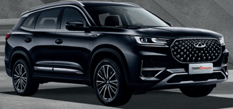
TIGGO 8 PRO MAX