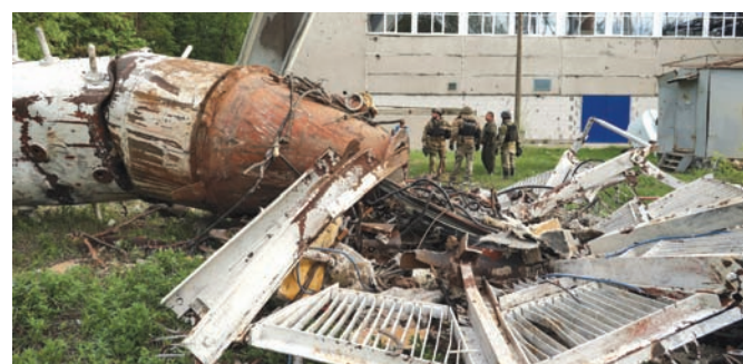
Police officers are seen near a part of a television tower partially destroyed by a Russian missile strike in Kharkiv.

The Ukrainian leader said he told US President Joe Biden about the airstrike that was carried out several minutes before they spoke by telephone.