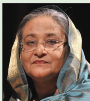
represent a landmark in the path of strengthening relations." See page 9

Bangladesh Prime Minister Sheikh Hasina Wajed has said her country warmly welcomes the visit of His Highness the Amir Sheikh Tamim bin Hamad al-Thani, describing the visit as a landmark in the path of strengthening bilateral relations and taking them to new horizons. In an interview with QNA, the PM said: "The government and people of Bangladesh are looking forward to welcome His Highness the Amir Sheikh Tamim bin Hamad al-Thani to Bangladesh. I hope the visit will