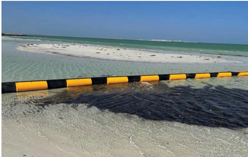
The Al Zubarah Trashboom Project, supported by Ras Laffan Industrial City Community Outreach Programme, introduces the strategic deployment of Trash Booms, a measure designed to curb the effects of ocean pollution on this archaeological site and lessen the need for frequent beach cleanups.

Their primary function is to deflect, contain, and collect various pollutants - ranging from floating debris and marine waste to plastics and seaweed - preventing them from reaching the shores or contaminating terrestrial environments.