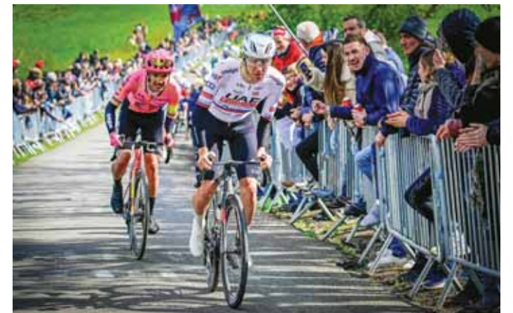
EF Education-EasyPost's Ecuadorian rider Richard Carapaz (left) and UAE Team Emirates' Slovenian cyclist Tadej Pogacar (centre) ride during Liege-Bastogne-Liege one day race, 254.5km round-trip from Liege to Liege via Bastogne, yesterday.