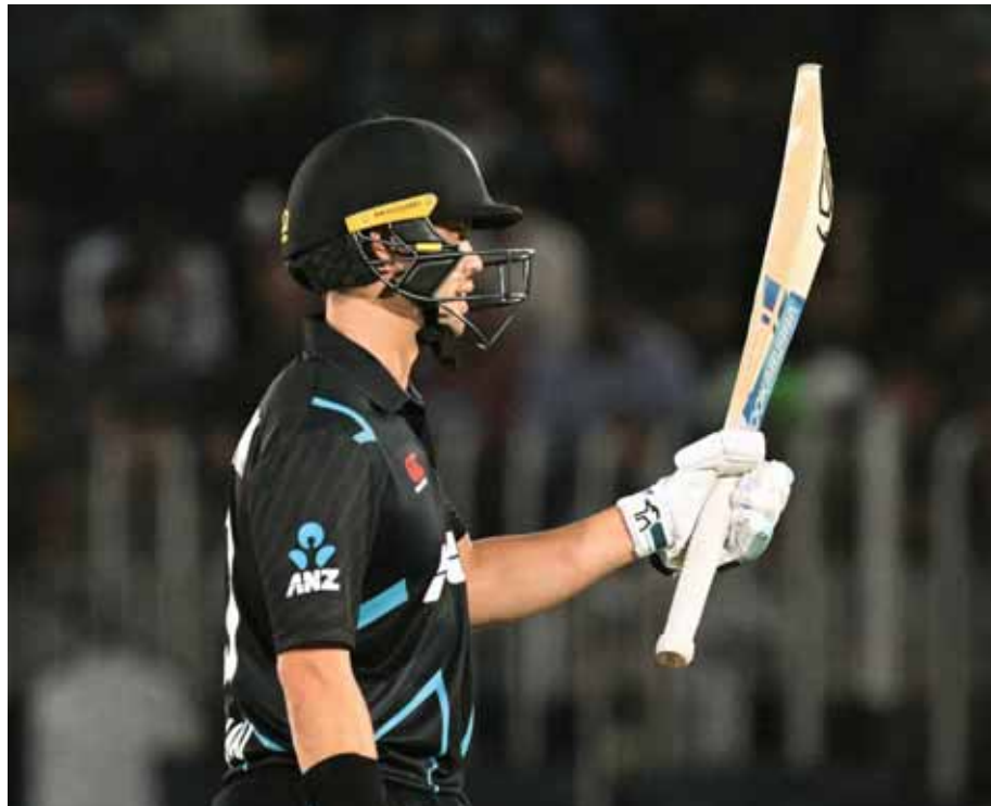
New Zealand's Mark Chapman celebrates his fifty score during the third Twenty20 against Pakistan in Rawalpindi yesterday.

Earlier Shadab hit two sixes and four fours