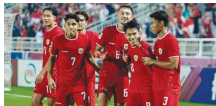
Indonesia players celebrate a goal against Jordan during their AFC U-23 Asian Cup match at the Abdullah Bin Khalifa Stadium yesterday.

Having already collected their first ever win three days ago against Australia, the tournament debutants ensured that their dream run would continue in the quarter-finals by sealing progress from Group