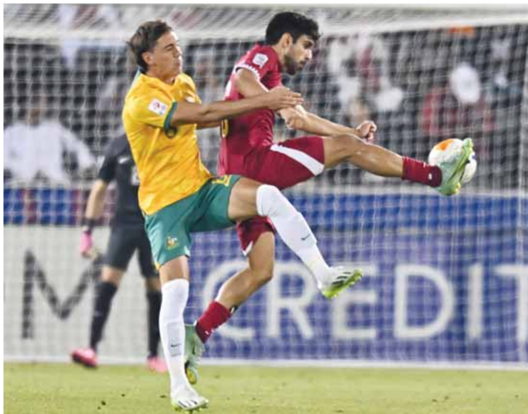
Qatar and Australia players are vying for the ball during the U-23 AFC Asian Cup Group A match at the Jassim Bin Hamad Stadium yesterday.