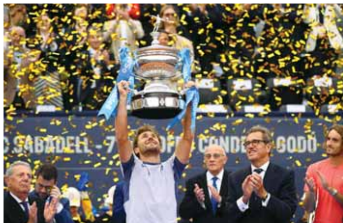
Norway's Casper Ruud holds up the trophy after beating Greece's Stefanos Tsitsipas in the Barcelona Open final yesterday. Right: Germany's Jan-Lennard Struff wears traditional "Lederhosen" (leather trousers) dress and presents his trophy after defeating Taylor Fritz from the US in the final of the ATP Tour tournament in Munich, yesterday.

Ruud's 91-minute victory ended a 10-match winning streak for Tsitsipas. "I wasn't playing my best tennis this week in Barcelona... throughout the whole week I didn't feel like my shots had the same effect as they did in Monte