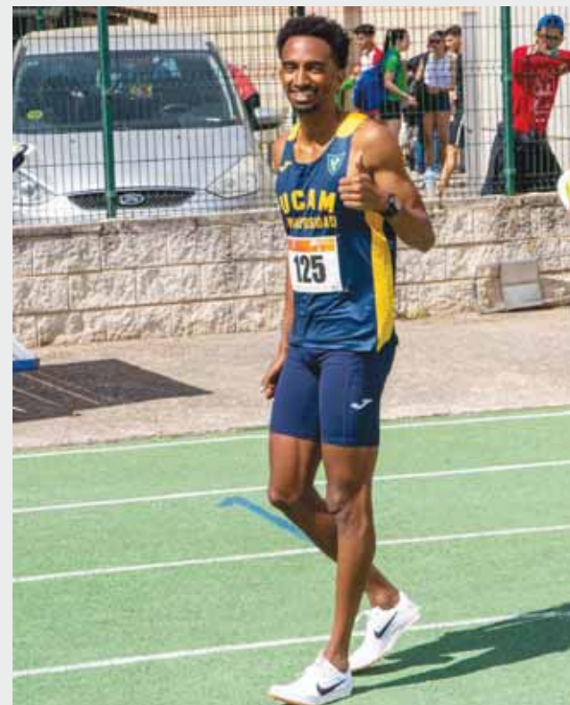
Qatar's top middle-distance runner Abdullah Abubakr qualified for this year's Paris Olympics following a brilliant show at the Athletics Championships held in Spain yesterday. Abubakr clocked 1:44.60 to win the 800m race and book his Paris ticket. The entry standard for the Olympics in the discipline is 1:44.70.