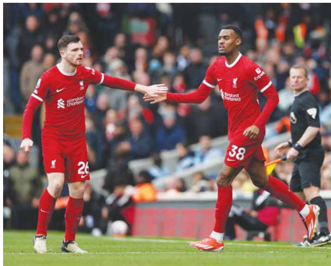
Liverpool's Ryan Gravenberch (right) celebrates with Andrew Robertson after scoring a goal during their Premier League match against Fulham in London yesterday.

Everton took a giant stride towards extending their 70-year stay in the English top-flight in a