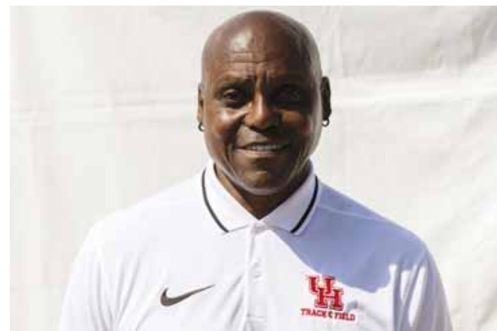
Former US athlete Carl Lewis poses during the Mt. SAC Relays at Mt. San Antonio College in Walnut, California. Lewis, an athletics legend with nine Olympic titles to his name, including four 40 years ago in Los Angeles, is expecting a "fabulous" Olympic Games in Paris.

"I'm glad to see the sprints are more global, there are more people from around the world," Lewis said. "I think it makes it better and I think it's going to be tremendous competition."