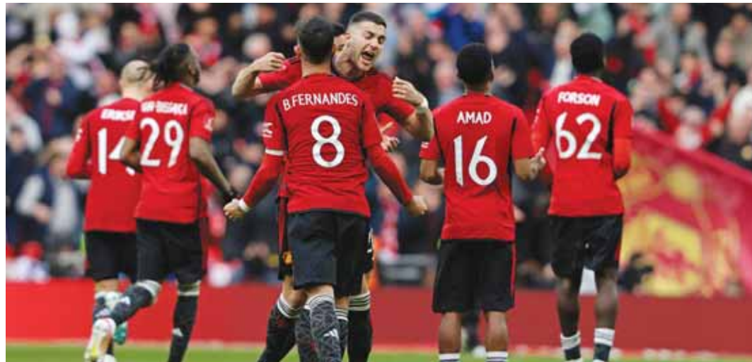
Manchester United's players celebrate after the shoot-out win against Coventry City in the FA Cup semi-final at Wembley Stadium in London yesterday. Manchester United won the penalty shoot-out 4-2 after the game finished 3-3 after extra time.

And when Torp tapped in it seemed the unthinkable had happened but Wright was adjudged to have been fractionally offside in the build-up to the goal.