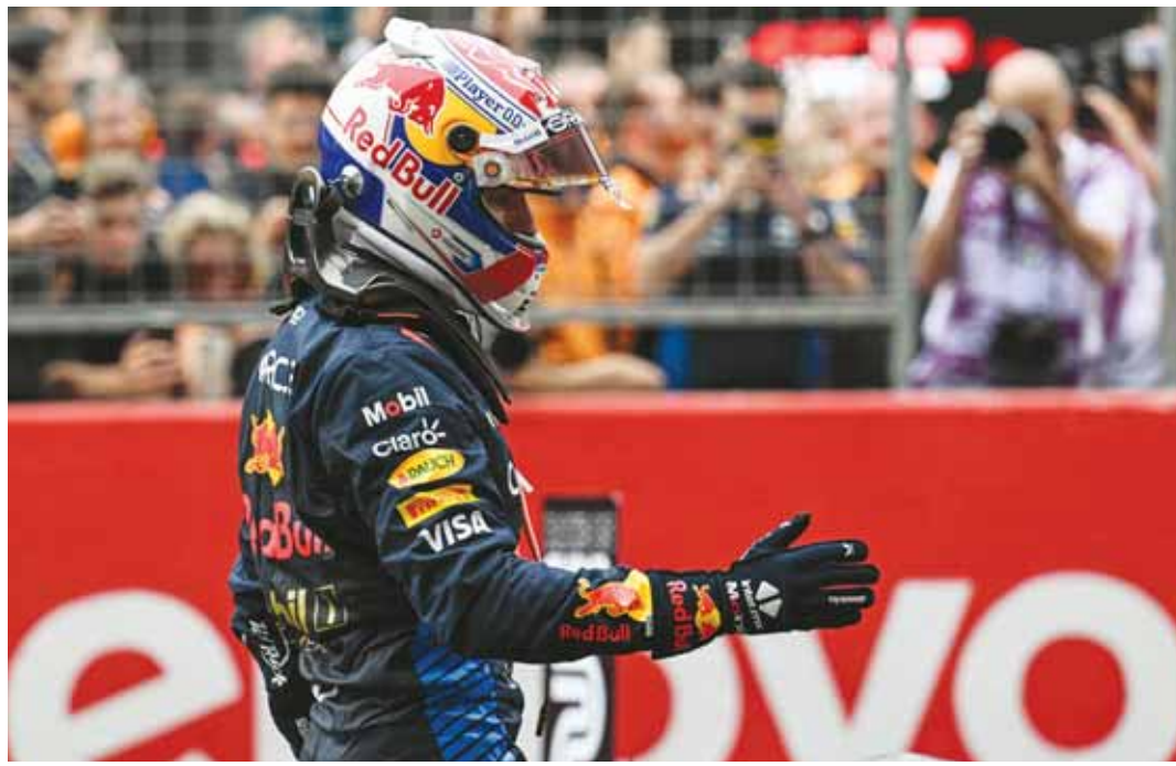
Red Bull Racing's Dutch driver Max Verstappen is seen after winning the Chinese Grand Prix at the Shanghai International Circuit yesterday.

Norris was delighted to finish second, his best result in 2024,