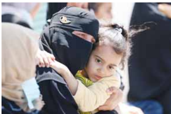
Mourners are seen as people rebury the bodies of Palestinians killed during Israel's military offensive and buried earlier at Nasser hospital, in Khan Younis in the southern Gaza Strip.

T he United States appears close to sanctioning an Israeli military unit over alleged human rights violations in the West Bank, a move the Israeli prime minister angrily denounced as "the height of absurdity". US Secretary of State Antony Blinken hinted at such steps when asked by a reporter in Italy about reports that his department had recommended cuts in military aid to an Israeli unit involved in violent incidents in the West Bank. The allegations preceded the deadly October 7 attacks by Hamas on southern Israel. Blinken, without providing details, said that his department is conducting investigations under a law that prohibits sending military aid to foreign security units that violate human rights with impunity. He then added: "I think it's fair to say that you'll see results very soon. I've made determinations; you can expect to see them in the days ahead." In late 2022 the State Department directed embassy staff in Israel to investigate alleged abuses in the West Bank by the army's ultra-Orthodox Netzah Yehuda battalion. That included a January 2022 incident which a 78-year-old Palestinian American died of a heart attack after being detained. Although the allegations precede the Hamas attacks and Israel's retaliatory war in Gaza, the suggestion of any sanctions against Israeli forces drew an angry response from Prime Minister Benjamin Netanyahu. "In recent weeks, I have been working against the imposition of sanctions on Israeli citizens, including in my con-