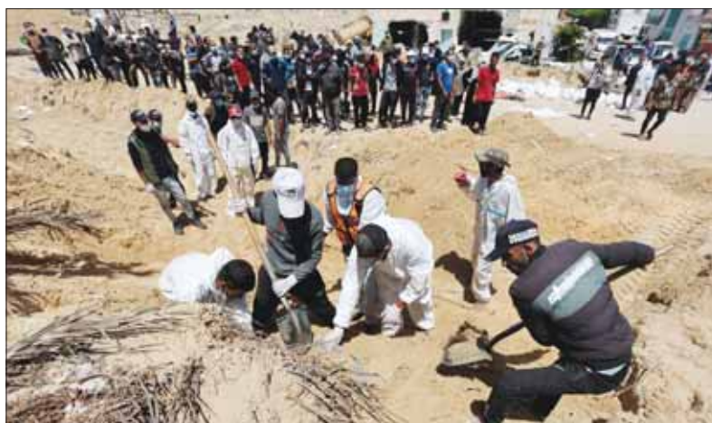
People work to move into a cemetery bodies of Palestinians found buried at Nasser hospital in Khan Yunis in the southern Gaza Strip yesterday.

Netanyahu, in a video statement on the eve of the Jewish holiday of Passover, said Israel "will deliver additional and painful blows". "In the coming