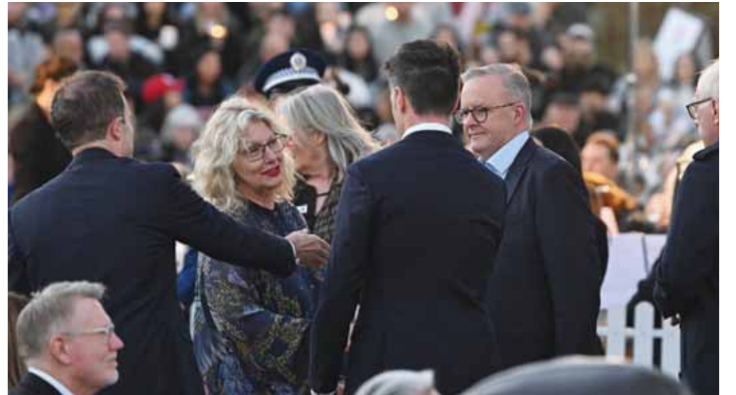
Australian Prime Minister Anthony Albanese and Waverley council mayor Paula Mussells attend the community candlelight vigil, recognising the victims of a fatal stabbing attack at Bondi Junction Westfield shopping centre, in Sydney, Australia, yesterday.

Landslides in southern China injured at least six people and trapped others, state media reported yesterday.