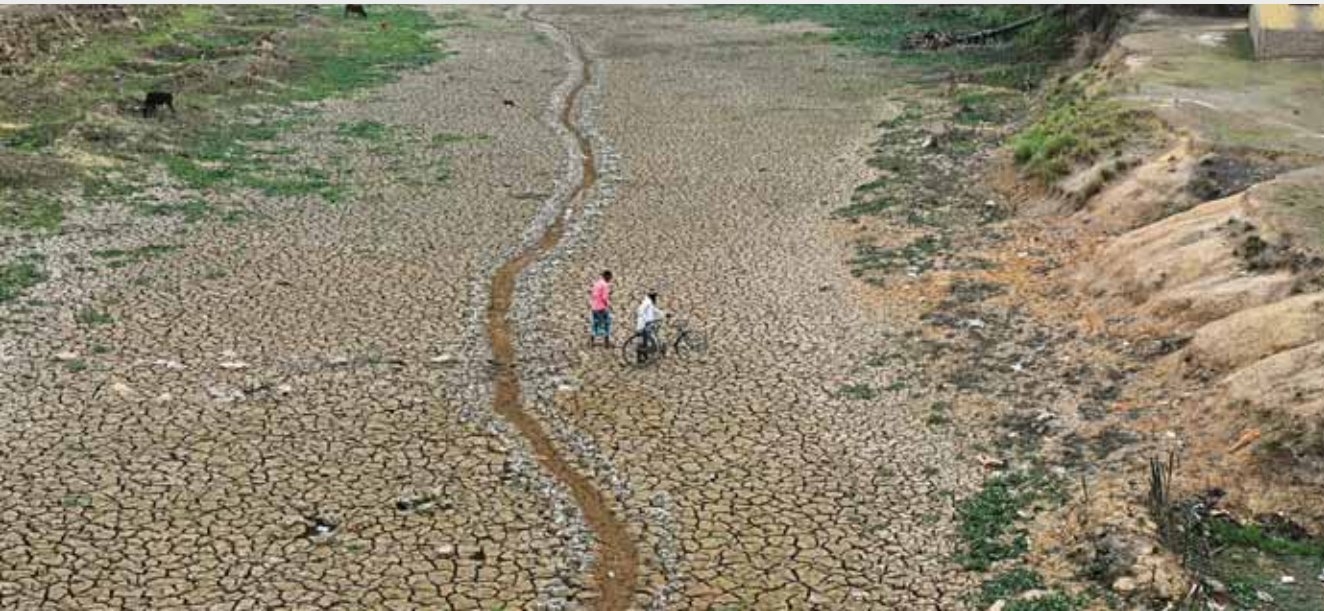
Men walk across the dry bed of a lake at Boklung village near Kathiatoli town in Nagaon district, Assam.