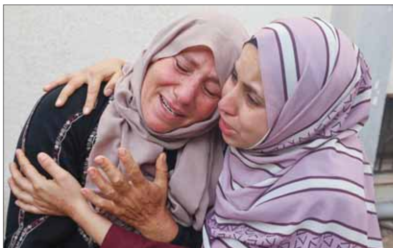
Palestinians grieving over the bodies of relatives killed in Israeli bombardment, at the Al-Najar hospital in Rafah, in the southern Gaza Strip, yesterday.

days we will increase the military and political pressure on Hamas," he said.