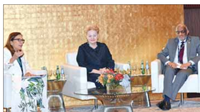
The conference engaged the diverse perspectives of distinguished women leaders with pioneering careers in politics and international diplomacy.

of no better expression of GU-Q's mission and values than today's discussion on gender in foreign policy," he said highlighting that seven in ten students in the foreign service degree programme at GU-Q are women, with the potential to bring a new gender balance to the diplomatic field. Ambassador Androulla Kaminara, inaugural Distinguished-Diplomat-in-Residence at GU-Q, said that a "business as usual" approach in foreign policy is no longer adequate. "The UN Secretary-General has stressed that, despite evidence that women's full participation makes peace-building much more effective, the number of women in decision-making roles is falling," she said. At the current rate of change, she said, achieving the Sustainable Development Goals (SDGs) will take 170 years, including SDG 5 - gender equality, integral to all SDGs. "Having this conference in a region where the rate of change