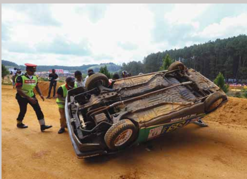
Officials look to push the car at the Fox Hill motor cross racing circuit in Diyatalawa yesterday.