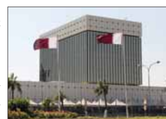
QCB aims to establish an appropriate regulatory framework for the country's financial institutions.

Qatar Central Bank has issued regulations on cloud computing in line with its Financial Sector Strategy, Fintech Strategy and QCB's "constant endeavour to regulate and develop the financial sector in the country and stimulate innovation in the field of Fintech."