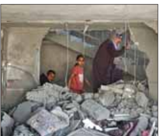
A Palestinian woman and children check the rubble of a building hit by overnight Israeli bombing in Rafah in the southern Gaza Strip yesterday.

Israeli military vehicles massed and bursts of gunfire were heard, while at least three drones were seen hovering above Nur Shams.