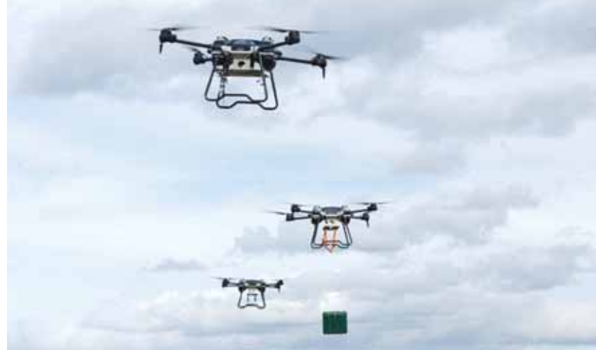
A handout picture released by the Russian defence ministry shows a demonstration flight of military drones at a training range in the Moscow military district.

A source in Ukraine's defence sector told AFP that Kyiv had targeted eight Russian regions overnight in a "large-scale" drone strike.