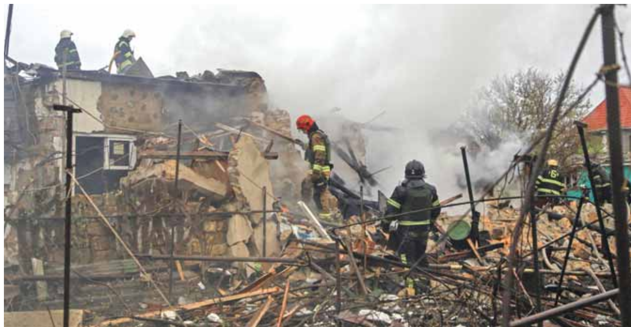
Firefighters work at the site in Odesa where residential buildings were damaged by a Russian missile strike, amid Russia's attack on Ukraine.

Ukrainian drones killed two people in Russia's Belgorod border region, its governor said early yesterday, while shelling