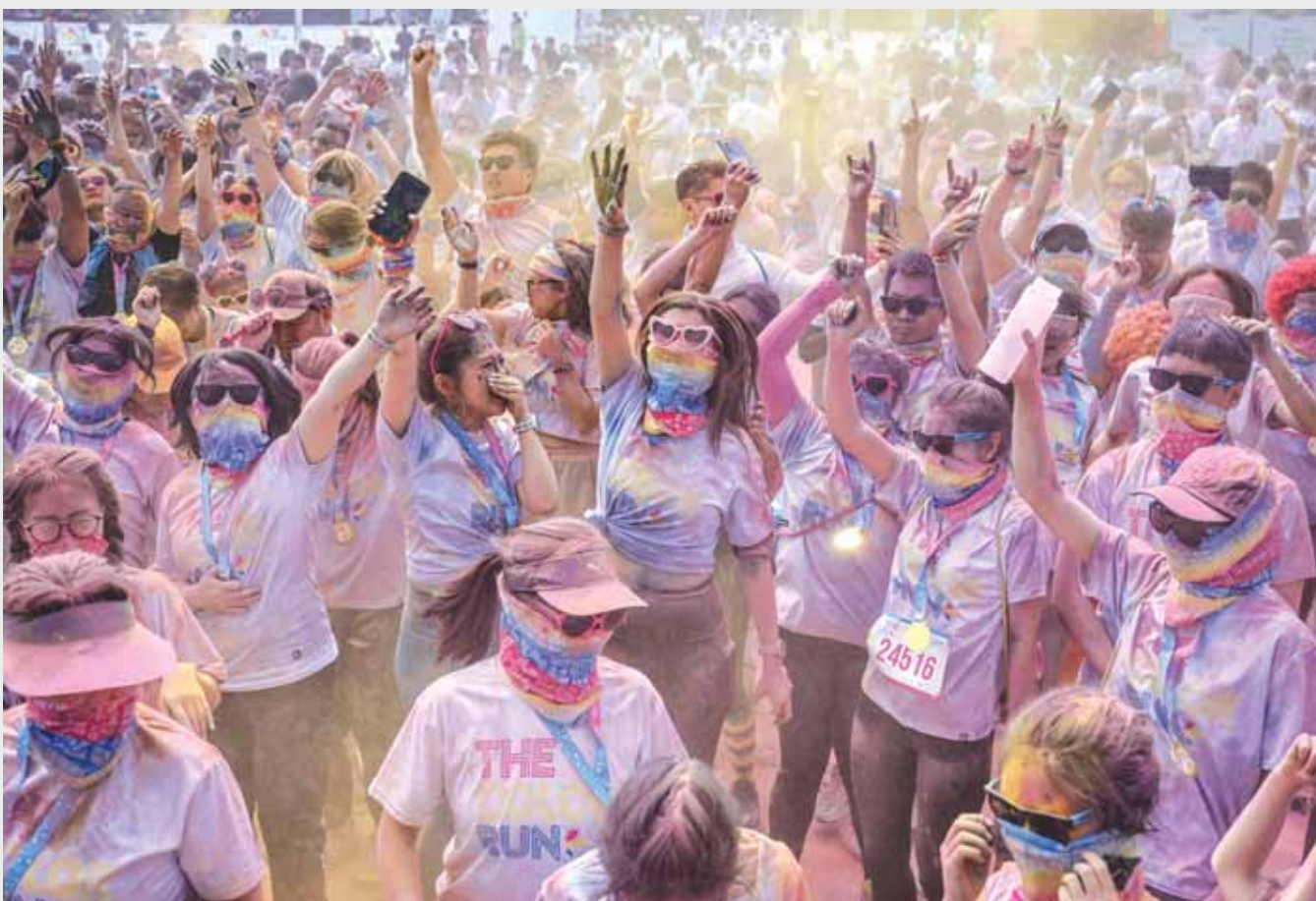
People celebrate under coloured powder after finishing the 5km Color Run in Beijing, yesterday.