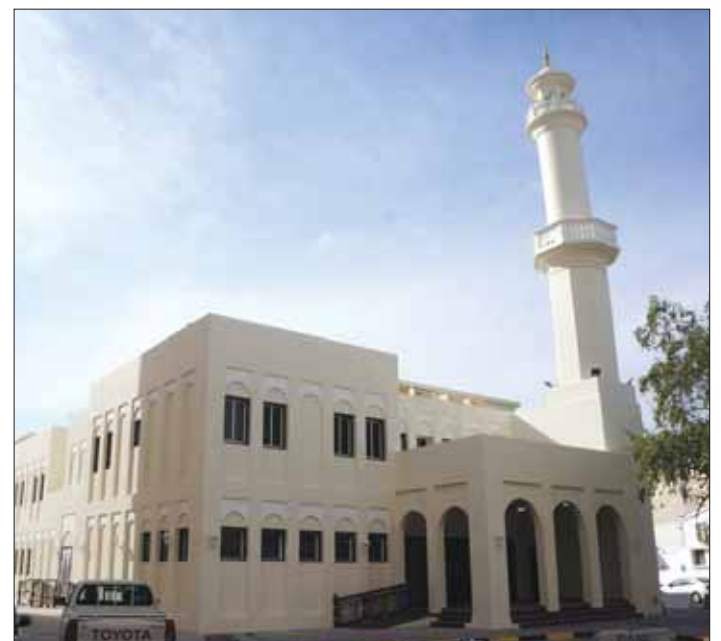
The mosque has a main prayer hall that can accommodate 504 worshippers and a prayer hall on the mezzanine floor that can accommodate 252. There is a women's hall for 100 worshippers.

In mosque designs, the department takes into account the requirements of different areas along with the guidelines for green and