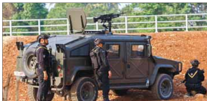
Thai soldiers take cover near the second Thailand-Myanmar Friendship Bridge during fighting on the Myanmar side between the Karen National Liberation Army and Myanmar's troops, which continues near the border, in Mae Sot, Tak Province, Thailand, yesterday.

verify the accounts of the fighting. Thai Prime Minister Srettha Thavasin said he was closely monitoring the unrest and his country was ready to provide humanitarian assistance if necessary.