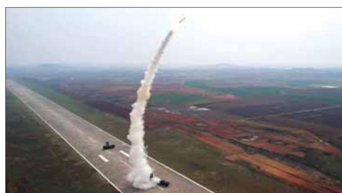
This picture released from North Korea's official Korean Central News Agency (KCNA) yesterday shows the DPRK Missile Administration conducting a test launch of "Pyoljji-1-2" new-type anti-aircraft missiles in the West Sea of Korea.

Seoul's military said yesterday it detected "several cruise missiles and surface-to-air missiles" fired toward the same body of water, also known as the Yellow Sea, at around 3:30pm (0630GMT) on