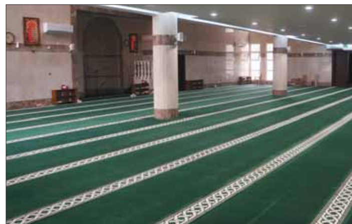
The Jassim bin Fahd bin Jassim al-Thani Mosque in Al Sadd in Doha.

The Ministry of Endowments (Awqaf) and Islamic Affairs, represented by the Department of Mosques, has opened the rebuilt Jassim bin Fahd bin Jassim al-Thani Mosque in Al Sadd in Doha. Spread over a total area of 1,557sq m, the mosque, according to an Awqaf statement, was opened in March and can accommodate 856 male and female worshippers and has houses for the imam and muezzin.