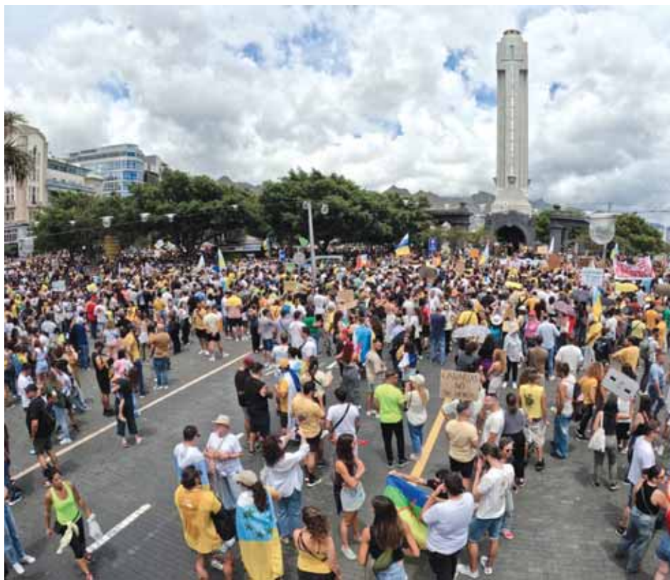
People gather during a demonstration for a change in the tourism model in the Canary Islands, in Santa Cruz de Tenerife, Spain.

"We're seeing holiday homes invading our