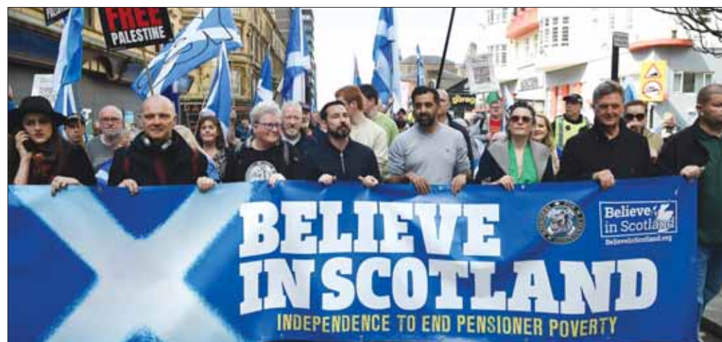
Scotland's First Minister Humza Yousaf (centre-right) and Scottish actor Martin Compston (centre-left) join a march in support of Scottish independence in Glasgow, yesterday.

Sturgeon had established herself as one of the figureheads of the independence movement alongside then Scottish first minister Alex Salmond ahead of an independence referendum in 2014. Scotland voted against in-