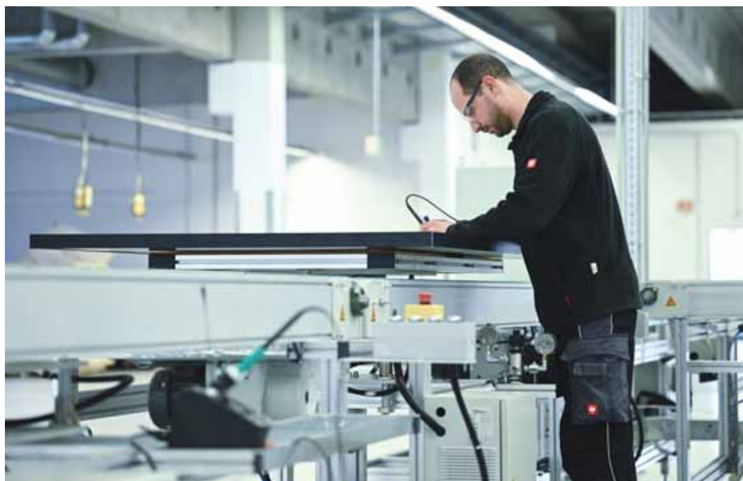
An employee works on a photovoltaic thermal energy module at the solar energy company Sunmaxx in Ottendorf-Okrilla near Dresden, Germany, last month.