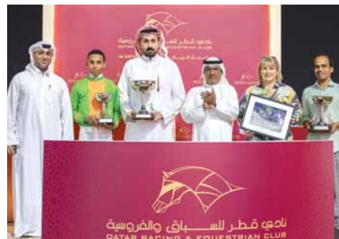
Connections of Afandem celebrate after the seven-year-old bay horse won the Al Mafiar Cup at Qatar Racing and Equestrian Club's Al Rayyan Racecourse yesterday.