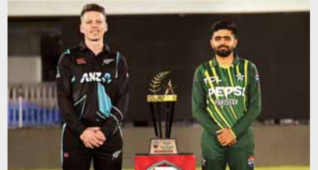
Pakistan captain Babar Azam (right) and his New Zealand's counterpart Michael Bracewell pose with the Twenty20 series trophy in Rawalpindi yesterday. Pakistan and New Zealand play the first game of the five-match series today in Rawalpindi.