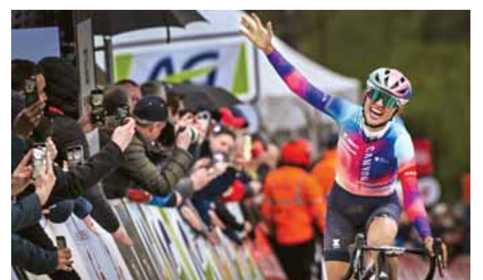
Poland's Katarzyna Niewiadoma of Canyon/Sram Racing celebrates as she crosses the finish line to win the women's race of "La Fleche Wallonne" cycling race, in Huy, Belgium, yesterday.

"I knew it was going to be my day, it's my greatest win," she said.