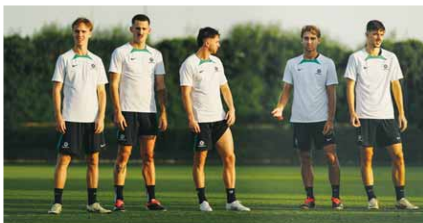
Australia players during a training session on the eve of their match against Indonesia.