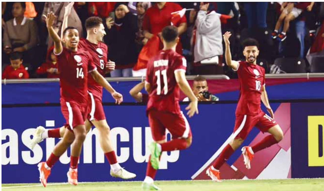
Victory today against Jordan will see Qatar become the first side to seal their place in the knockout stage of the AFC U-23 Asian Cup.