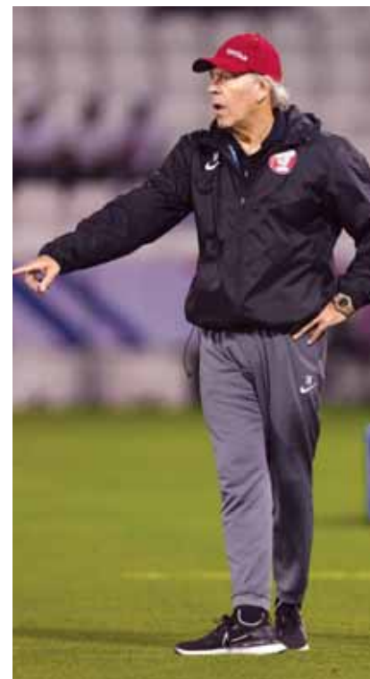
Qatar U-23 coach Ildio Vale.

going to forget that - it is done and we got the point we needed.