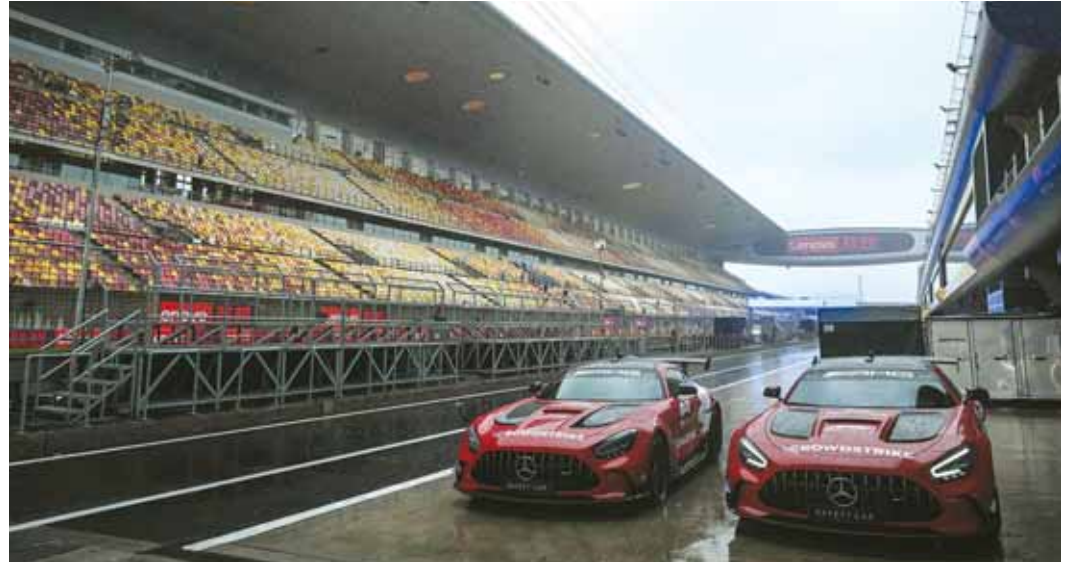
General view of the paddock at the Shanghai International Circuit ahead of the Chinese Grand Prix in Shanghai yesterday.

It would also be his first win in China, which was Lewis Hamilton territory until the Covid-19 pan-