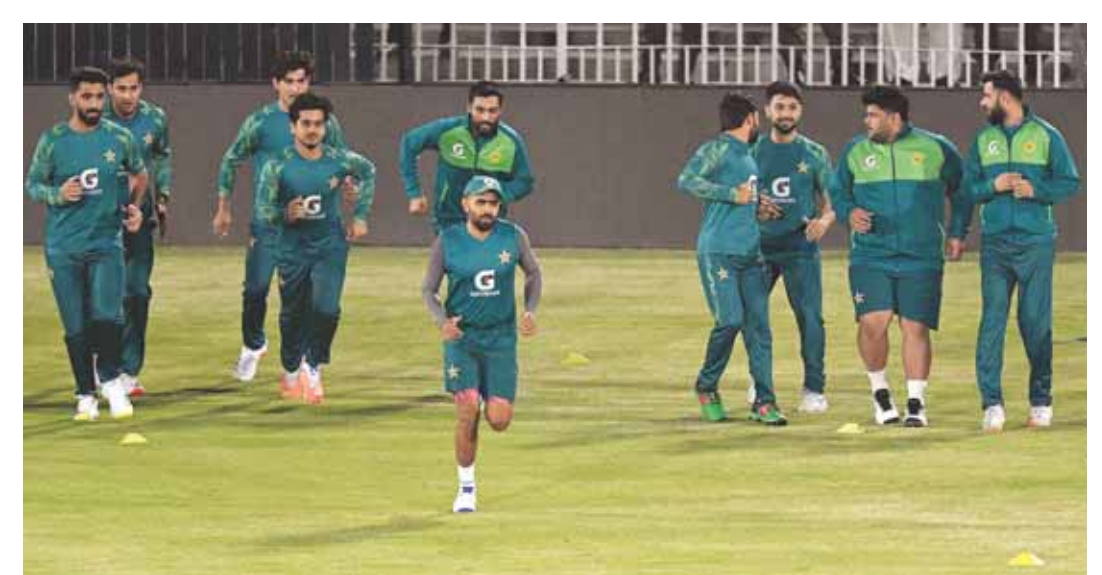
Pakistan's captain Babar Azam (centre) warms up along with teammates during a practice session in Rawalpindi yesterday. Babar makes his return as Pakistan captain in a five-match Twenty20 series starting tomorrow against an understrength New Zealand with the World Cup weeks away.

New Zealand are missing nine top players including skipper Kane Williamson because of the Indian