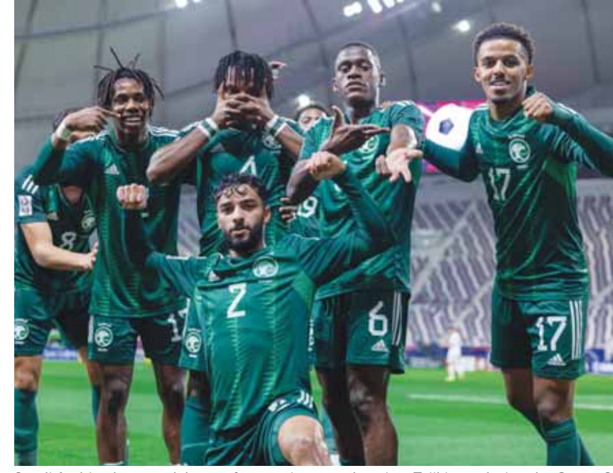
Saudi Arabia players celebrate after scoring a goal against Tajikistan during the Group C match of the AFC U-23 Asian Cup Qatar 2024 at Khalifa International Stadium yesterday.

close range. A misplaced pass from Waheed at the edge of his own goal with goalkeeper Saleem Al Absi out of position nearly set up a grandstand finish but Soirov's poor first