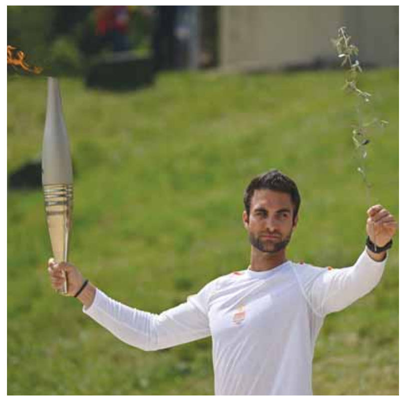
Rowing Olympic gold medalist Stephanos Ntouskos holds the Olympic torch following the flame lighting ceremony for the Paris 2024 Games at the Ancient Olympia archeological site in Greece yesterday.