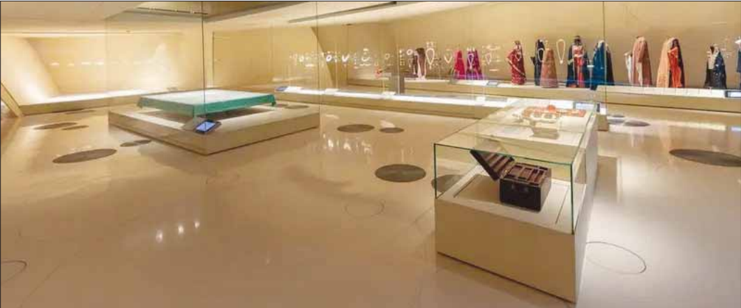
NMoQ will offer themed tours, providing participants with insights into the social practices, customs and festivities associated with Eid al-Fitr from April 15-22.