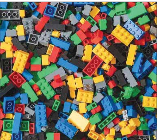
Lego Shows Qatar 2024