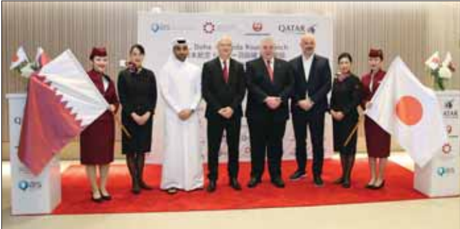
The inaugural flight, operated on March 31 by a Boeing 787-9 aircraft with a capacity of 203 seats, marks the first-ever flight to the Middle East by a Japanese airline - signifying a historic moment in the aviation industry, according to Hamad International Airport.