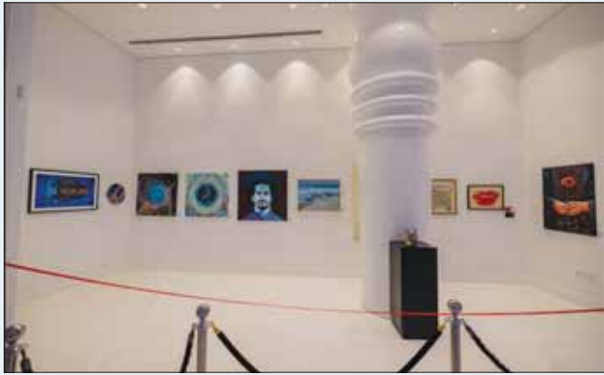
Some of the artworks on display.

The beauty of Zumra Community lies in discovering and embracing the diverse identities and experiences of others, the statement added.