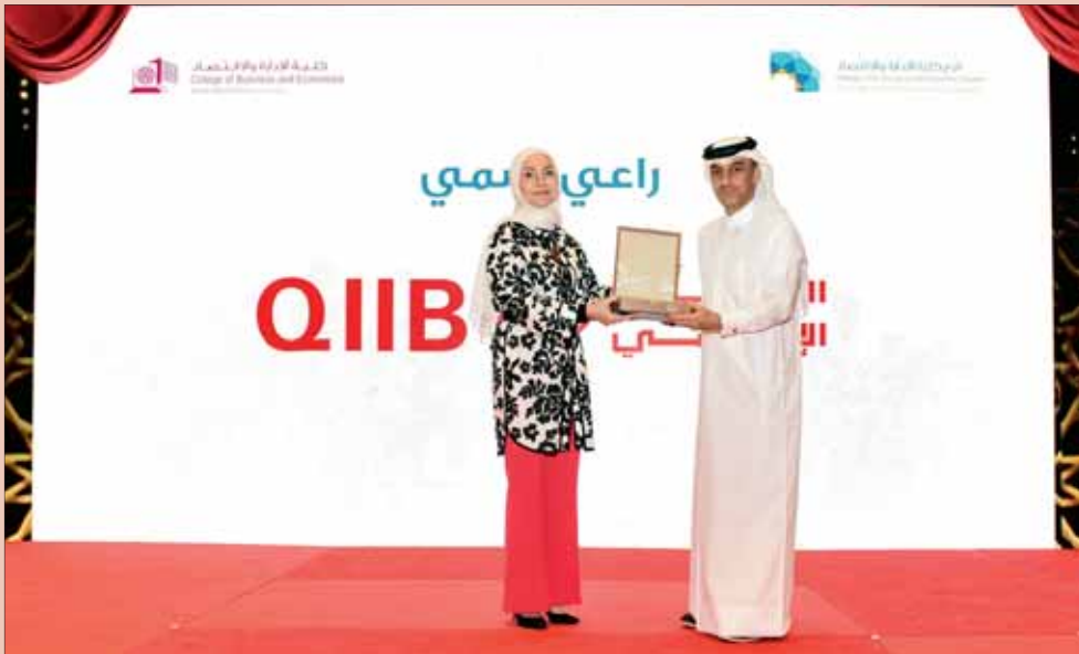
At the launch ceremony of the QU CBE alumni chapter, QIIB was recognised.

Highlighting its commitment to serving diverse sectors of the Qatari community, with a particular focus on bolstering education, QIIB sponsored the inauguration of the alumni chapter of Qatar University’s (QU) College of Business and Economics (CBE), entitled ‘Competent Graduate.’ QIIB said in a statement that its collaboration with QU has been rooted in the institution’s esteemed position as one of Qatar’s premier educational establishments. Known for providing knowledge and education to both male and female Qataris, QU plays a key