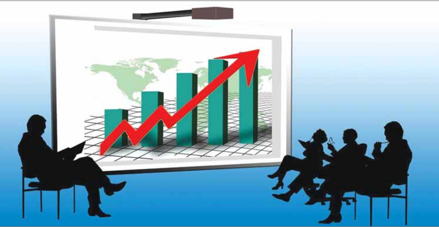
Fed Chair Jerome Powell, paraphrasing Winston Churchill, recently called forecasters "a humble lot – with much to be humble about."