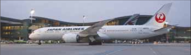
Japan Airlines has commenced daily operations to and from Qatar, linking Tokyo Haneda Airport with Doha’s Hamad International Airport.

aging executive officer and Route Marketing senior vice president.