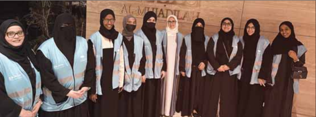
Volunteers at QF’s Al-Mujadilah Centre and Mosque for Women .

Volunteers from a wide spectrum of backgrounds are coming together at QF’s Al-Mujadilah Centre and Mosque for Women to serve the community during Ramadan.