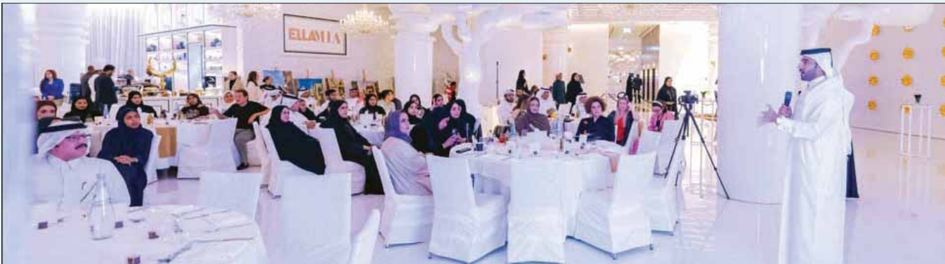
Some of the participants in the event.