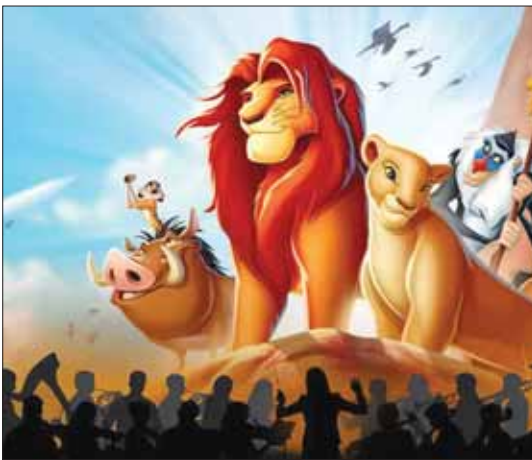
The Lion King

composers and highlight the orchestra’s international journey.