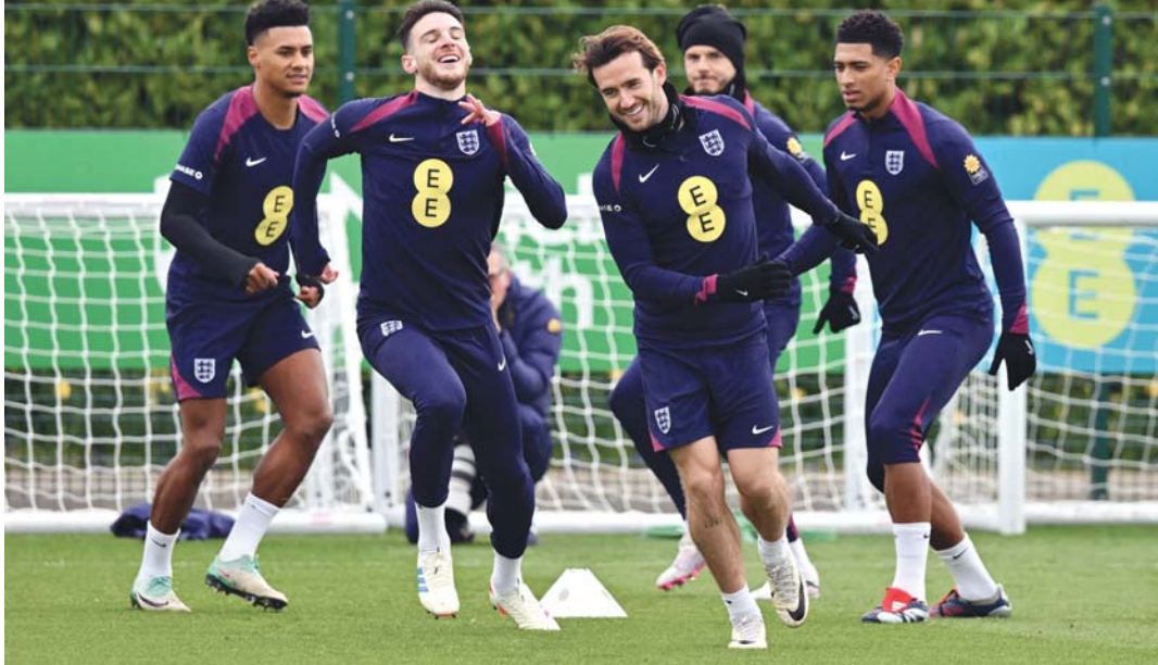
England's striker Ollie Watkins (left) midfielder Declan Rice (second from left), defender Ben Chilwell (second from right) and midfielder Jude Bellingham (right) during a team training session at the Tottenham Hotspur Training Ground in London yesterday, on the eve of their friendly against Belgium.