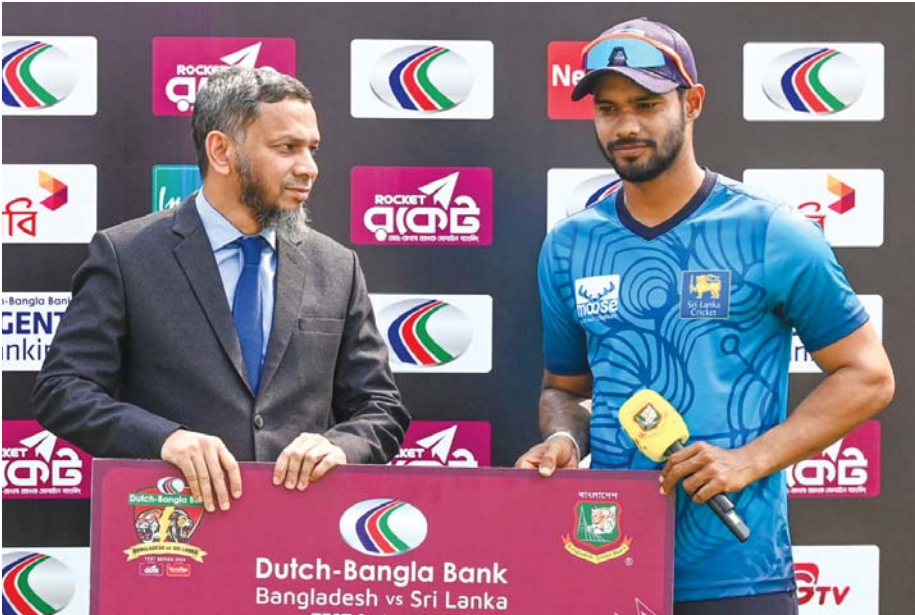
Sri Lanka's captain Dhananjaya de Silva (right) is seen receiving the Man of the Match award at the end of the first Test against Bangladesh at the Sylhet International Cricket Stadium in Sylhet yesterday.