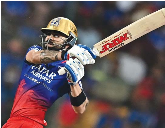
Royal Challengers Bengaluru's Virat Kohli watches the ball after playing a shot during the Indian Premier League match against Punjab Kings in Bengaluru yesterday.