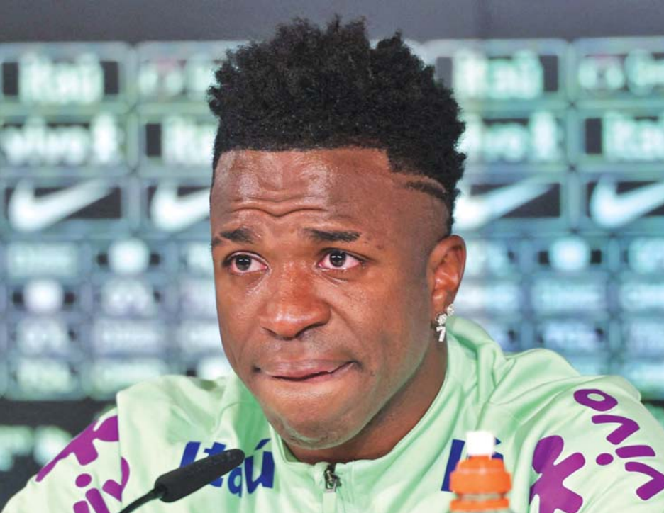
Brazil's Vinicius Junior cries during a press conference yesterday on the eve of the friendly against Spain at the Ciudad Real Madrid training ground in Madrid. Spain arranged a friendly against Brazil at the Santiago Bernabeu under the slogan "One Skin" to help combat racism.

He recently condemned Atletico Madrid fans for racist chanting aimed at him before their Champions League clash against Inter Milan