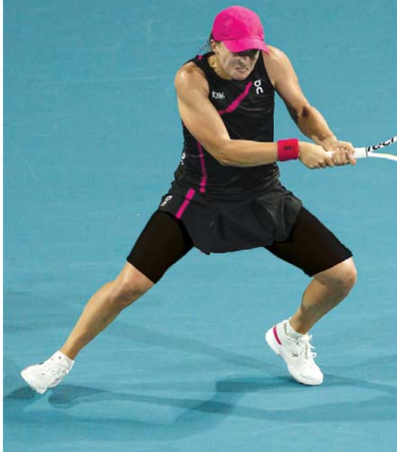
Iga Swiatek of Poland hits a shot against Linda Noskova of the Czech Republic during their match at Hard Rock Stadium in Miami Gardens, Florida.

Miami: World number one Iga Swiatek kept her nerve to beat 26th-ranked Linda Noskova of the Czech Republic 6-7 (7-9), 6-4, 6-4 at the WTA Miami Open on Sunday. A day after Swiatek's closest challenger, Aryna Sabalenka, was knocked out of the tournament, the Pole faced a real test from Noskova. The Czech had upset Swiatek in the third round of the Australian Open before the four-time Grand Slam winner gained revenge at Indian Wells. The third meeting this year between the pair was, not surprisingly, a tight affair. Having worked hard to recover from her opening set tie-break loss and taken the match into a deciding frame, Swiatek found herself facing three break points when serving for the match up 5-4. But she stepped up her game to win the next five points and celebrated with a fist-pumping gesture to her box. "It wasn't easy. There were just many ups and downs," Swiatek said. "I'm happy that after first set I had better idea on what to do, and I just tried to do that in important moments. Sometimes we have matches like that and we need to figure out how to close them anyway." Swiatek, who is looking to become just the second woman to win the "Sunshine Double" of Indian Wells