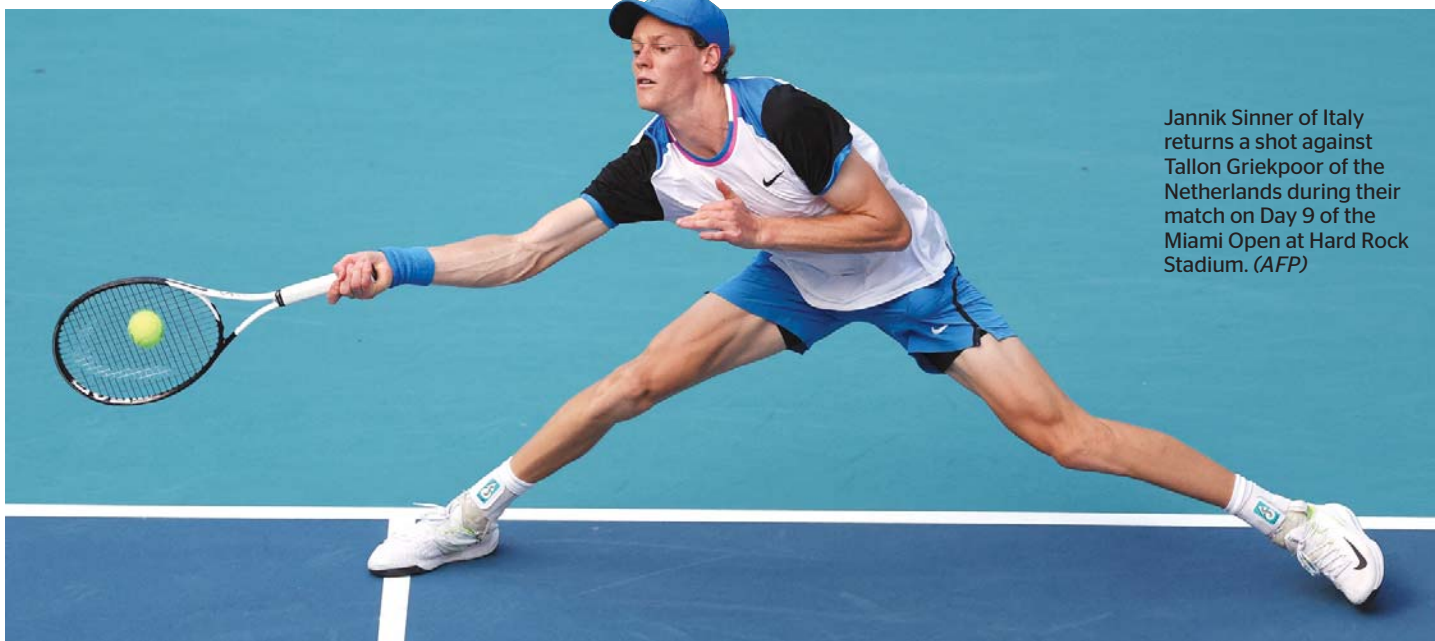
Jannik Sinner of Italy returns a shot against Tallon Griekspoor of the Netherlands during their match on Day 9 of the Miami Open at Hard Rock Stadium.

Reigning champion Daniil Medvedev beat Britain's Cameron Norrie 7-5, 6-1 and while he was happy with his performance he said that rapidly deteriorat-