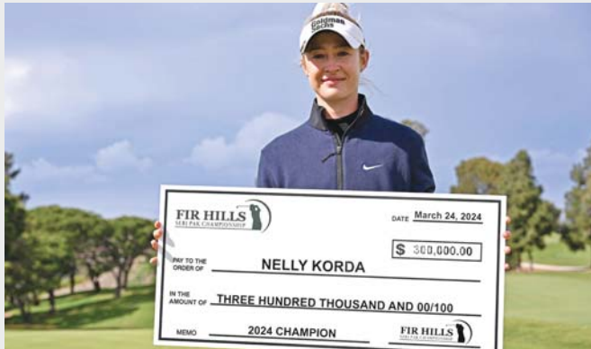
Nelly Korda of the United States celebrates after winning the Fir Hills Seri Pak Championship at Palos Verdes Golf Club in Palos Verdes Estates, California.