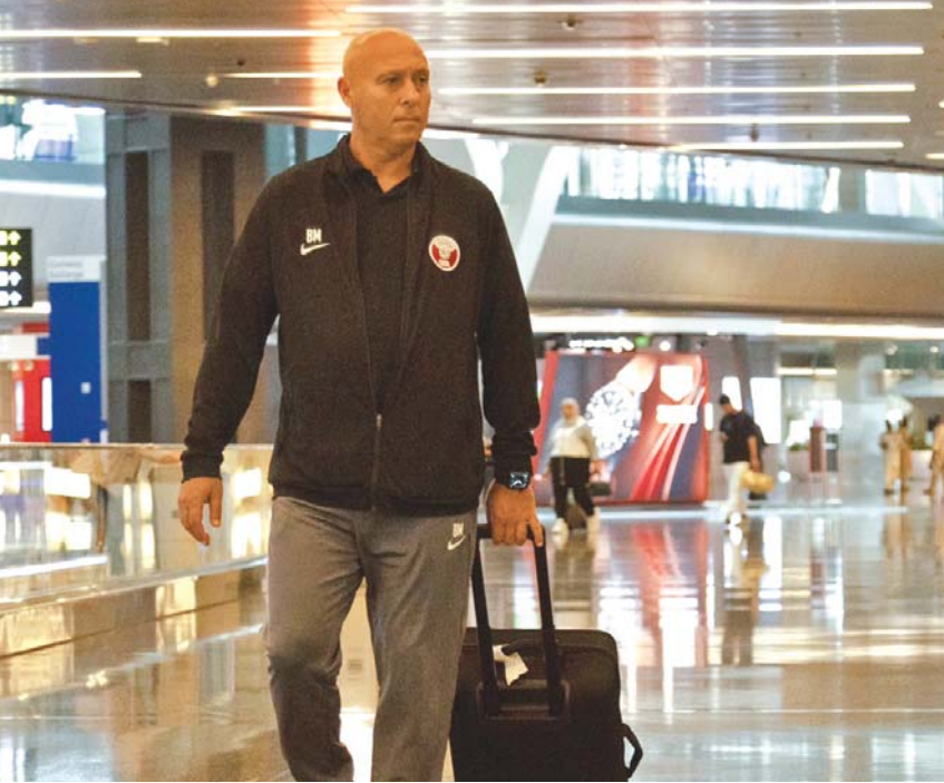
Qatar's head coach Marquez Lopez (left) and his players arrive in Kuwait City yesterday, on the eve of their match against Kuwait.

Head coach Marquez Lopez, who has yet to taste a competitive defeat since taking charge of Qatar in December, admitted he had been impressed by his team's second half performance against Kuwait on Thursday. "Kuwait played with a good defensive strategy but we showed our best in the second half and converted our chances. However, Tuesday's match will be difficult as Kuwait will try to make up for this loss," Lopez had said after Thursday's tie. The Spaniard added: "We are trying to introduce a new policy in the national team as part of our strategy towards forming a strong team that includes young tal-