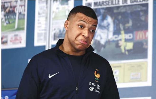
France's forward Kylian Mbappe arrives at a press conference in Marseille yesterday, on the eve of a friendly against Chile at Velodrome stadium.

He will return to Marseille with PSG for a league game this coming weekend.