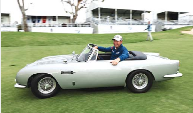
Padraig Harrington of Ireland rides in a miniature Aston Martin after winning the Hoag Classic title at Newport Beach Country Club in Newport Beach, California.