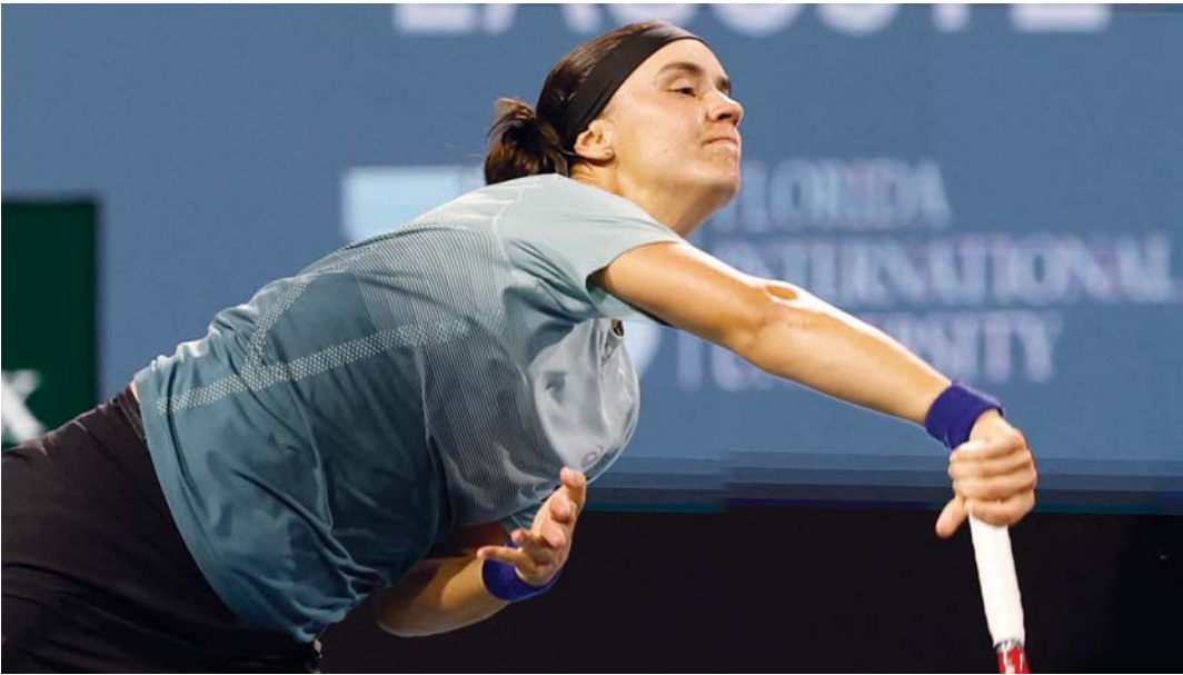
Anhelina Kalinina of Ukraine serves against Aryna Sabalenka (not pictured) on day six of the Miami Open.

“I just believe that I have abilities to play on any surface, especially here where it’s a little bit