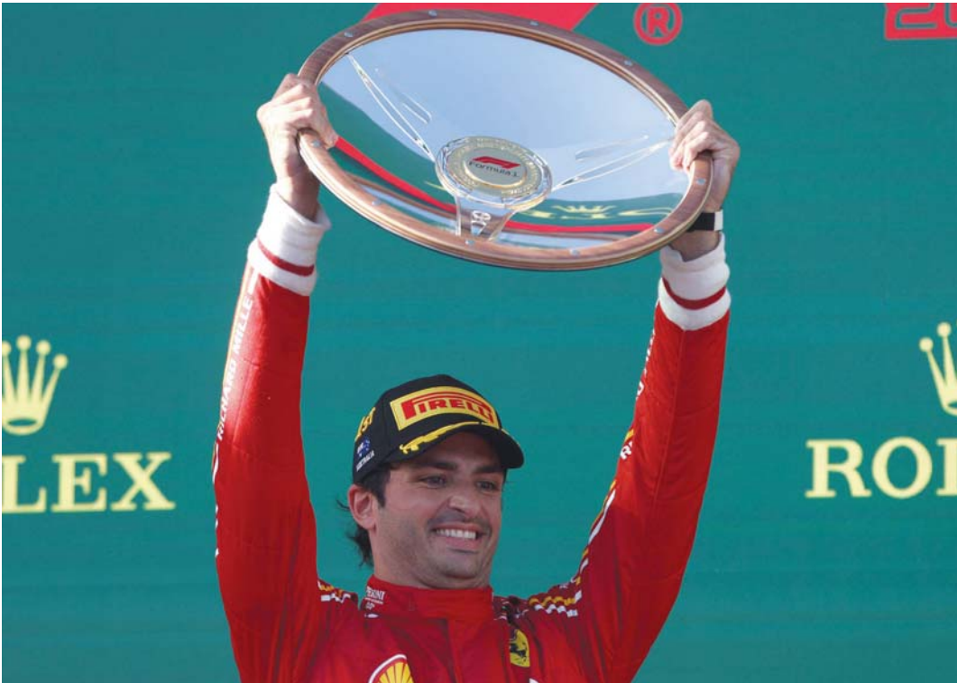
Ferrari's Spanish driver Carlos Sainz Jr celebrates with the trophy on the podium after winning the Australian Formula One Grand Prix at Albert Park Circuit in Melbourne yesterday.

with Aston Martin's Fernando Alonso faulted for "potentially dangerous" driving over the incident and slapped with a 20-second penalty. Verstappen emphatically won the opening two grands prix of the season in Bahrain and Saudi Arabia, with both a Red Bull 1-2, and was hot favourite to make it three from three.