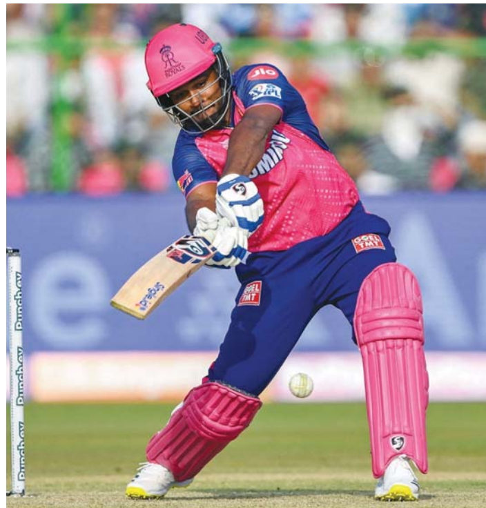
Rajasthan Royals' captain Sanju Samson plays a shot during the Indian Premier League (IPL) Twenty20 match against Lucknow Super Giants at the Savai Mansingh Stadium in Jaipur.