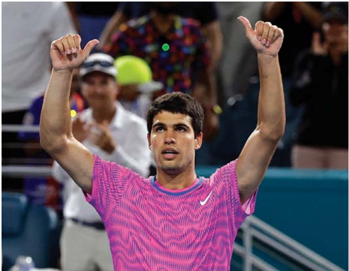
Carlos Alcaraz of Spain waves to the crowd after his match against Roberto Carballes Baena on day six of the Miami Open.

Miami: Top seed Carlos Alcaraz and number two Jannik Sinner took the first confident steps towards the mouth-watering Miami Open final tennis fans want to see by romping into the third round on Saturday with blowout wins. Tennis’s newest and hottest rivalry was dialled up a notch last week in the Indian Wells semifinals when Alcaraz put the first blemish on Sinner’s perfect season by halting the Italian’s 16 match winning streak.