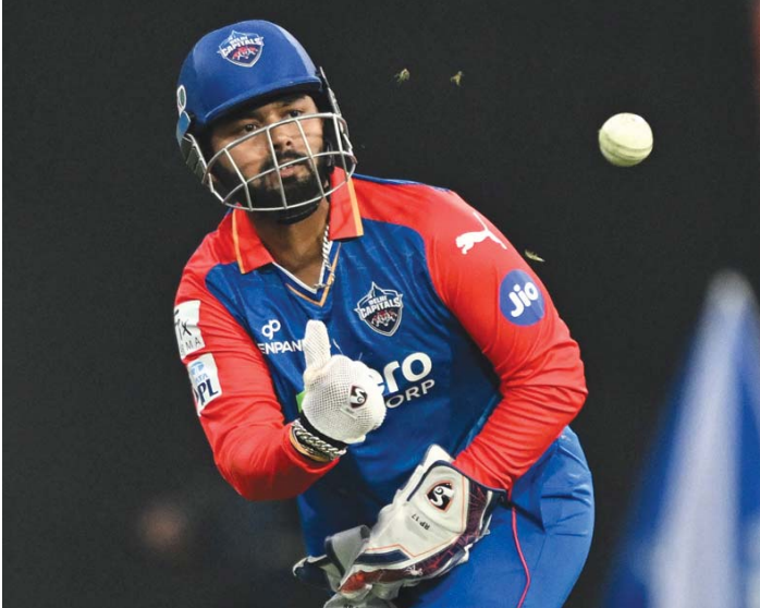
Delhi Capitals' captain Rishabh Pant in action during the IPL match against Punjab Kings at the Maharaja Yadavindra Singh Stadium in Mohali yesterday.

England's Jonny Bairstow had an unlucky dismissal when he was run out at the non-striker's end after the ball grazed bowler Ishant's finger and hit the stumps with the batsman short of his crease. But the left-handed Curran went to his half-century and