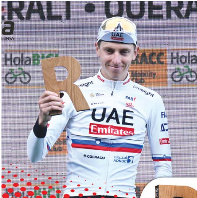
Slovenian's Tadej Pogacar celebrates after winning the third stage of Tour of Catalonia in the Pyrenees yesterday.

Today's final stage is a run around Barcelona where the top three places are unlikely to change with Pogacar leading Landa by 3min 31sec while third-placed Bernal is at 4min 53sec.