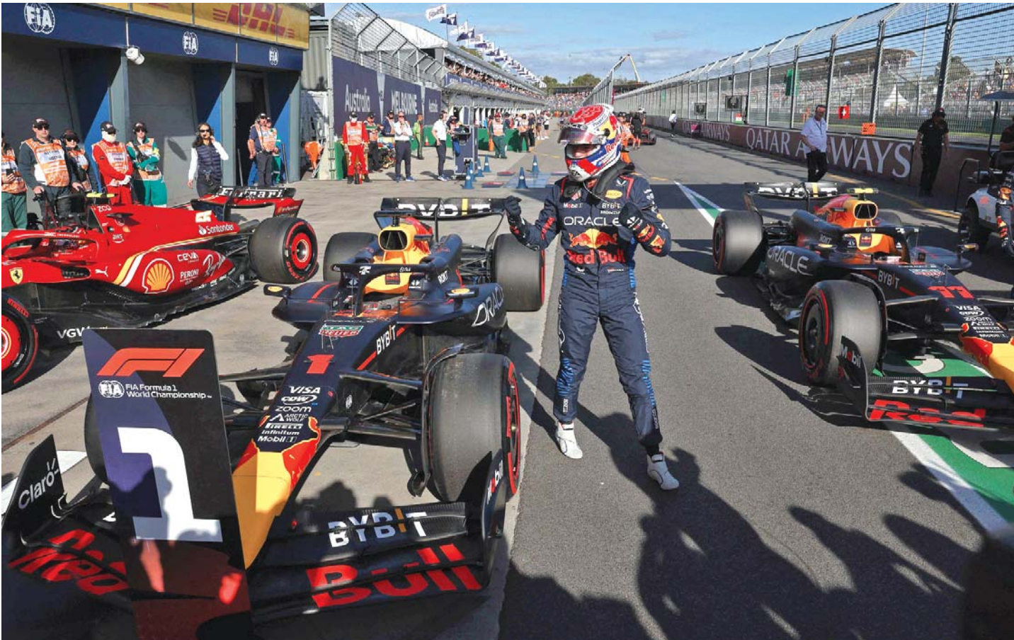
Red Bull Racing’s Dutch driver Max Verstappen celebrates after winning the pole position in the qualifying session of the Formula One Australian Grand Prix at the Albert Park Circuit in Melbourne yesterday.

A “very satisfied” three-time world champion Max Verstappen clinched a third straight pole of the season yesterday at the Australian Grand Prix as the flying Dutchman targets a record 10th consecutive win. Under hazy skies at Albert Park, Ferrari’s Carlos Sainz, back in the car barely two weeks after appendicitis surgery, came second in tense qualifying and will keep the Red Bull ace company on the front row. Sergio Perez in the other Red Bull came third but will start from sixth after being slapped with a three-place grid penalty for impeding Nico Hulkenberg, bumping up McLaren’s Lando Norris. Charles Leclerc in the second Ferrari - who won in 2022 - moves up to fourth with McLaren’s Oscar Piastri fifth. “Very happy with that because so far this weekend it has been a bit tough to find a good balance in the car,” said Verstappen, who is looking to repeat his feat from last year when he started first and won a chaotic race in Melbourne. “And even throughout qualifying in Q1 and Q2 I didn’t really feel I could be fighting for pole. But then we made some little tickles on the car and that seemed to help me in Q3 to really push it to the limit. “Obviously things can improve, but overall very satisfied with the performance.” The 26-year-old knocked out his rivals to earn a 35th career pole with a flying lap of one minute 15.915, 0.270 secs ahead of Sainz, who missed the last race in Jeddah. “I don’t feel 100 percent, it’s