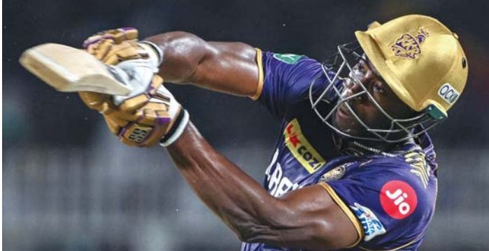
Kolkata Knight Riders' Andre Russell plays a shot against Sunrisers Hyderabad at the Eden Gardens in Kolkata yesterday.

kept calm to bring up victory. The spotlight remained on India's Pant, 26, after the wicketkeeper-batsman took the field as captain of Delhi after 14 months away from top level cricket. "Really emotional time for me," Pant said at the toss after Delhi were invited to bat first. "Just want to enjoy the moment."