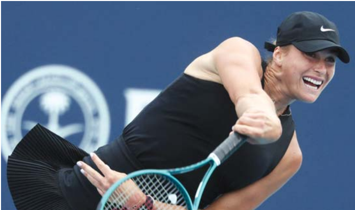
Aryna Sabalenka serves against Paula Badosa of Spain during their Miami Open match at Hard Rock Stadium in Miami.

World number two Aryna Sabalenka returned to the court for the first time since the death of her former boyfriend earlier this week and kept her emotions in check as she beat Spain’s Paula Badosa 6-4 6-3 on Friday. After six hours of rain delays, Sabalenka walked onto the court wearing an all-black outfit, a choice matched by her close friend Badosa. Two-times Australian Open winner Sabalenka on Wednesday said she was “heartbroken” by the death of former boyfriend Konstantin Koltsov in a statement on Wednesday, where she revealed they had not been a couple at the time of his death. Koltsov died on Monday with Miami police saying he had jumped from the balcony of a room at an resort in an “apparent suicide.” The former NHL ice hockey player and coach, was 42-years-old. Sabalenka made a slow start to the match but broke to go 4-3 up in the first set and never looked back from that point on. The Belarusian then broke in the third game of the second set with a superb cross court forehand winner and showed too much power for her Spanish opponent as she wrapped up the win in one hour 22 minutes. The two players embraced at the net before leaving the court