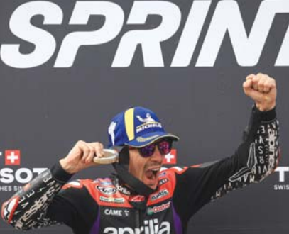
Aprilia's Maverick Vinales celebrates on the podium after winning the sprint race.

early and I crashed," Marquez added. "The team did a great job to repair the bike and in the race I was super lucky in the first lap to have a good start. This weekend we have the speed. When you have the speed you have more confidence you are able to overtake better." Bagnaia finished fourth, which allowed him to hold on to a slim lead in the championship, two points ahead of last year's title challenger and runner-up Martin. "I messed up!" said Bagnaia. "I had a really good feeling on the bike, I got off to a good start, I opened up a gap and I was manag-