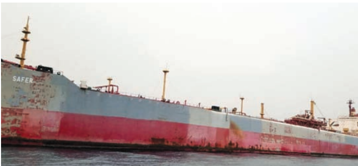
Decaying vessel FSO Safer is moored off Yemen’s coast in this undated screengrab taken from a video.

Two tankers, containing oil and toxic waste, are stuck in the Red Sea in the firing line between Western naval forces and Yemen’s Houthi militants despite repeated efforts by the United Nations to empty and move the ships to avoid a spill. The vessels, one of which has been stranded for years, are near the port of Ras Issa from where Houthis launch missiles on ships passing through the Red Sea and where US missiles land as they target the Houthis. The United Nations last year led efforts to remove a million barrels of oil from the decaying tanker, the FSO Safer, to a new tanker, the MT Yemen, in an operation that cost $121mm. The UN had hoped to move the FSO Safer, which still