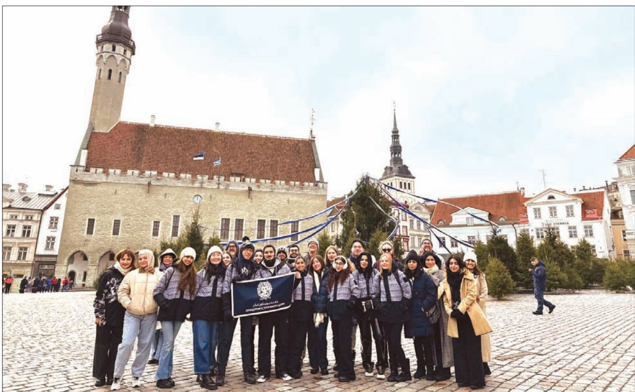
A group of students visited Finland and Estonia.