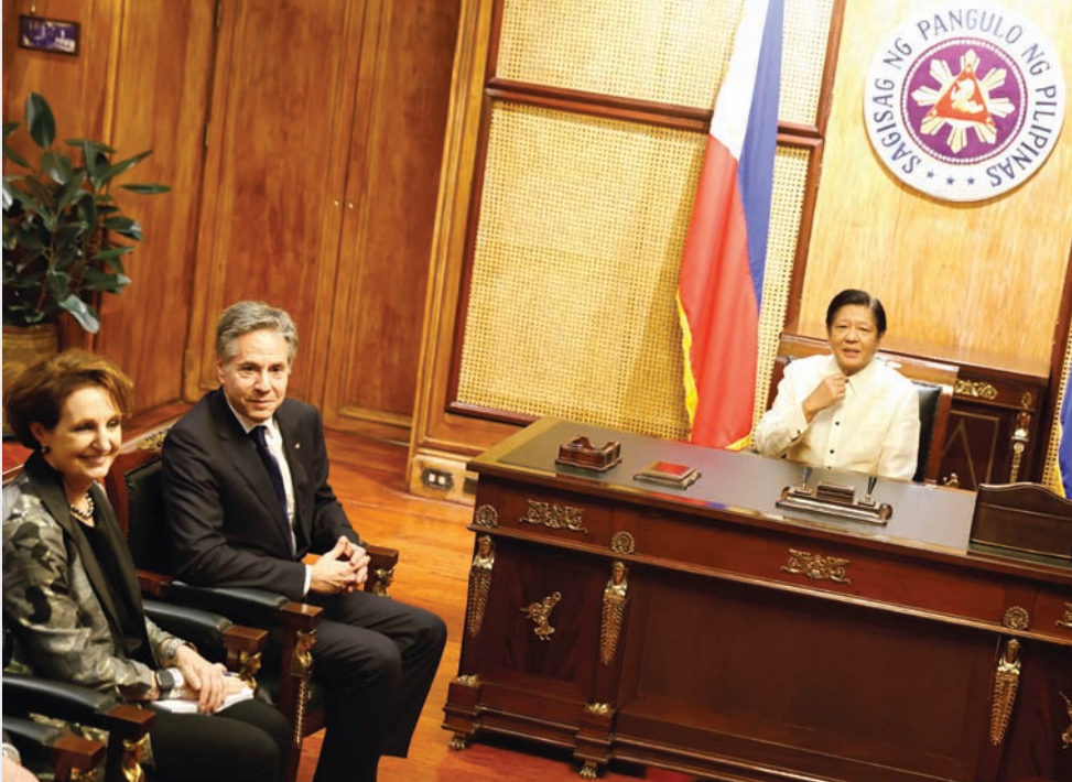
Philippine President Ferdinand 'Bongbong' Marcos Jr. and US Secretary of State Antony Blinken meet at the presidential palace in Manila, Philippines, yesterday.