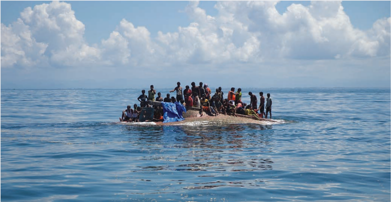
Rohingya refugees stand on a capsized boat before being rescued in the waters of West Aceh, Indonesia, yesterday.