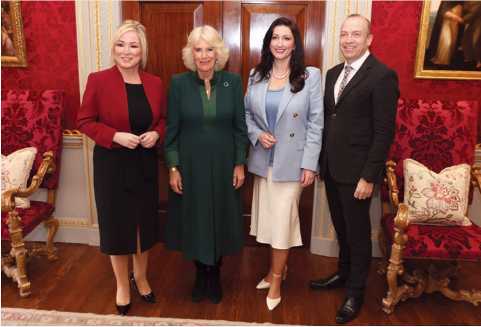
Britain's Queen Camilla poses with First Minister of Northern Ireland Michelle O'Neill, Deputy First Minister of Northern Ireland Emma Little-Pengelly and Secretary of State for Northern Ireland Chris Heaton-Harris, as she attends an event hosted by The Queen's Reading Room to mark World Poetry Day at Hillsborough Castle, during her visit to Northern Ireland, in Belfast, Northern Ireland, yesterday.