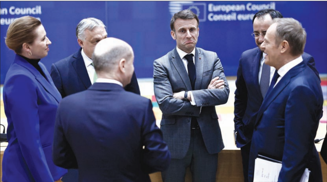
French President Emmanuel Macron (centre) reacts as he speaks with fellow EU leaders before a European Council summit at the EU headquarters in Brussels yesterday.

But the Czech Republic has spearheaded its own initiative aimed at getting hundreds of thousands of shells available around the