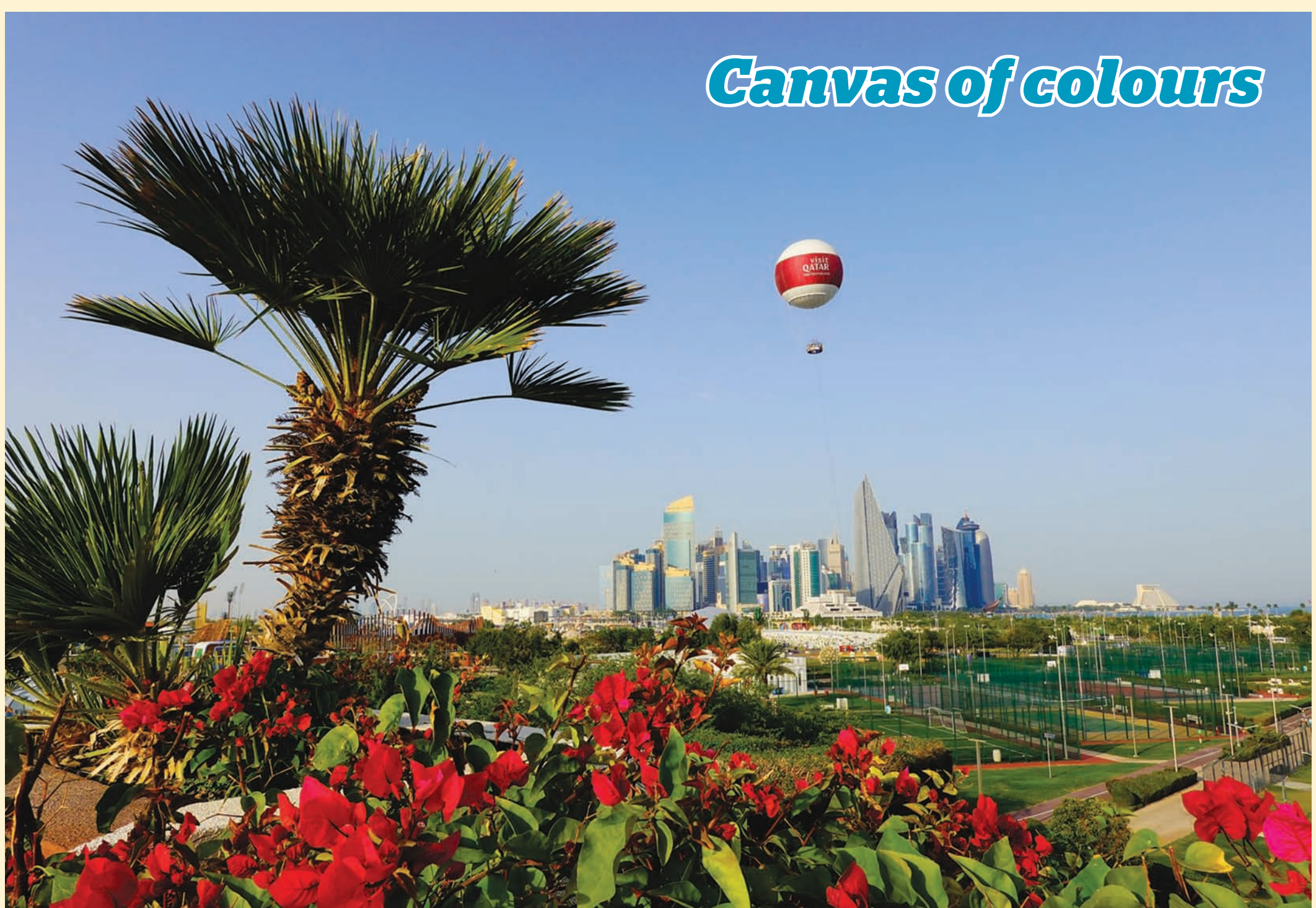
The West Bay skyline as seen from a vantage point at the venue of Expo 2023 Doha, which concludes on March 28, after 179 days of horticultural excellence and attracting as many as 3mn visitors.