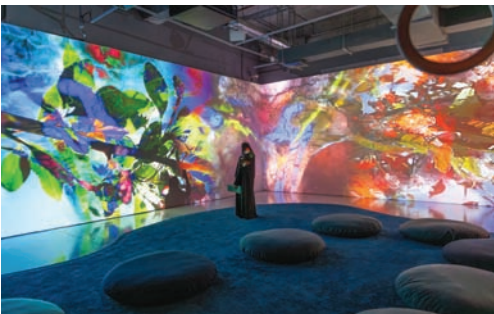
Electric Idyll exhibition by renowned contemporary Swiss artist Pipilotti Rist on view at the Fire Station: Artist in Residence.

Liwan Design Studios and Labs launched the first printed edition of Al Journal – a captivating compilation of essays, articles, and visuals that delve into contemporary design themes across the Southwest Asian and North African region and beyond. Qatar Creates opened the exhibition The Voyager is the Narrator: New York & Paris Residency Exhibition, housed in galleries 3 and 4 at Fire Station. On view to the public until April 20, the exhibition offers a captivating journey through the distinctive perspectives and creative expressions that have emerged from New York and Paris. The participating artists from Paris are Ibrahim Albaker, Voyyyd, Fatima Ahmed, Lolwa Almeghaiseb and Maryam AlTajer, and the participating artists from New York are Almaha Nasser, Said Alkhulaifi, Zainab Alshibani, and Wadha Almesallam. Fire Station: Artist in Residence partnered with Torba Market on the Good Finds Market, presenting a fresh lineup of vintage and second-hand stallholders, handmade ceramics, limited-edition art pieces, unique jewellery, craft and stationery, and food and drink.