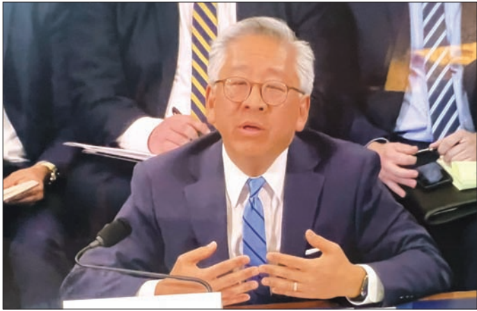
Donald Lu, the top US diplomat for South Asia, testifying before the House Foreign Affairs subcommittee.

Ahead of the election, former prime minister and cricket star Imran Khan was jailed and barred from running, with his Pakistan Tehreek-e-Insaf (PTI) party subject to a crackdown.