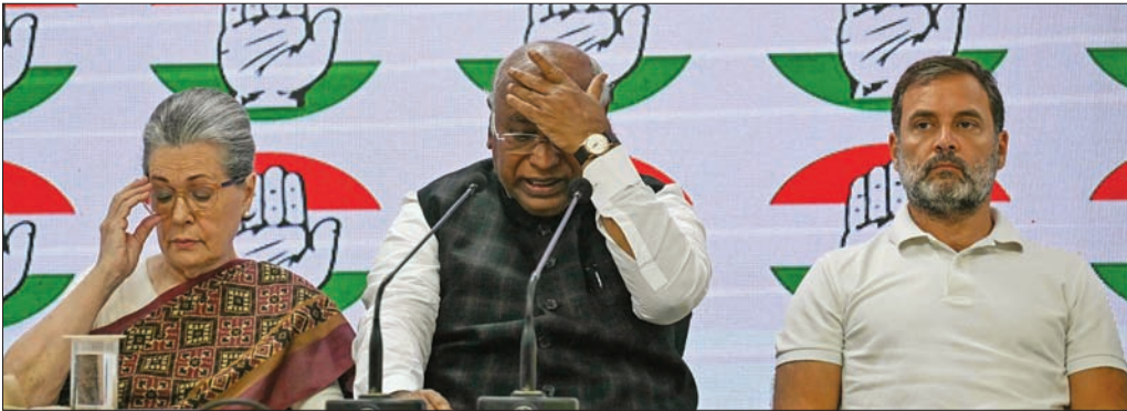
Congress party president Mallikarjun Kharge (centre) addresses a press conference along with party leaders Sonia Gandhi and Rahul Gandhi at the Congress party headquarters in New Delhi yesterday.

If asked about the laptops move, the US government's line is: "The (Indian) government has the right, and the responsibility, to design a trade policy that is responsive to the needs of the people of India," the e-mail said.