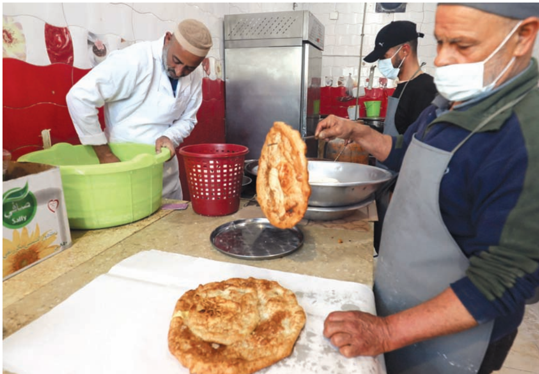
An employee wraps freshly fried sfinz, a spongy fried bread that can be served plain or with eggs, in Tripoli.

57-year-old resident of Tajura who came to help. In the capital Tripoli, around 22km away, another culinary delicacy is making a resurgence this Ramadan: sfinz, a deep-fried, soft doughnut made with leavened dough, usually filled with an egg or dipped in honey. Once an affordable street food eaten on