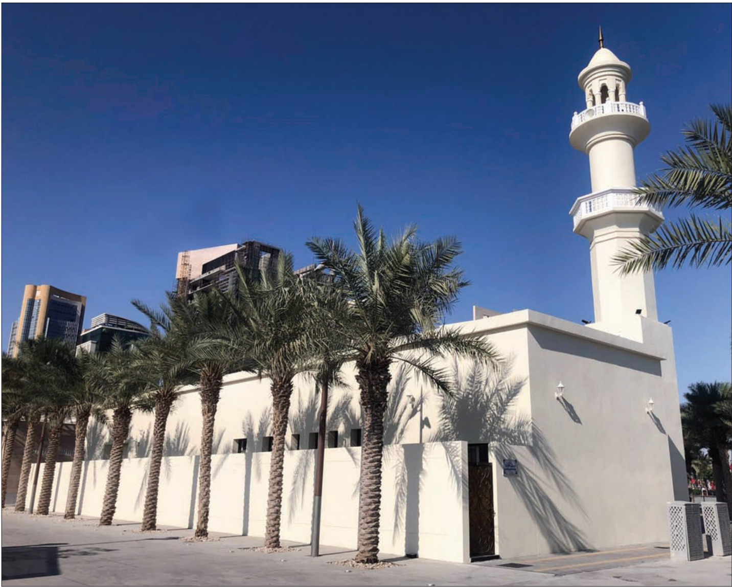
The newly-opened Ahmed Abdul Rahman Musa Al Ishaq Mosque in Lusail's Ghar The'ileb area.

Yet, many a procrastinator wastes away this blessed month