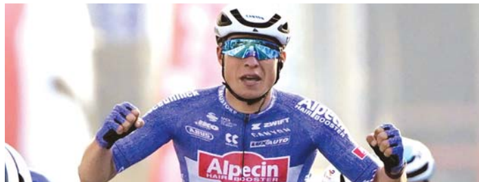
Alpecin-Deceuninck’s Belgian rider Jasper Philipsen reacts as he crosses the finish line to win the ‘Classic Brugge-De Panne’ men’s elite one-day cycling race, 198.9km from Brugge to De Panne yesterday.

He took the green sprint points jersey at last year’s Tour de France after winning four stages.