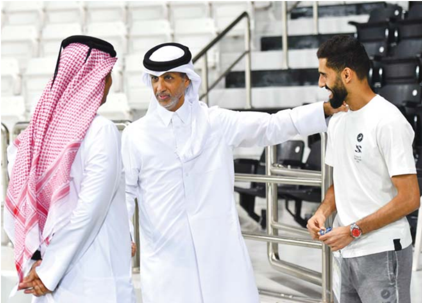
Minister of Sports and Youth HE Sheikh Hamad bin Khalifa bin Ahmed al-Thani with former Qatar captain Hassan al-Haydos, who retired from national duty recently, at Qatar team's training yesterday.