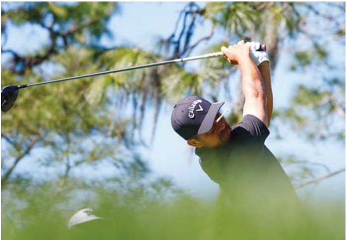
Xander Schauffele of the US hits from the sixth tee prior to the Valspar Championship at Copperhead Course at Innisbrook Resort and Golf Club in Palm Harbor, Florida.