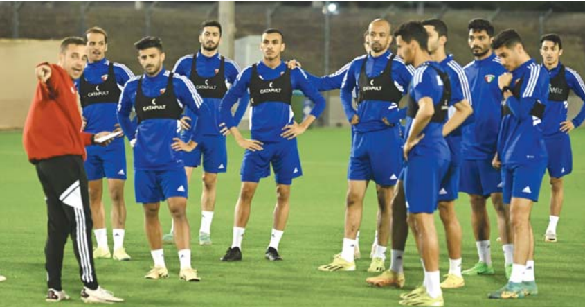
Kuwait players at a training session in Doha yesterday.

Qatar will hope to seal qualification into the next round when they take on Kuwait twice over the next week in the preliminary joint qualification – Round 2 for the FIFA World Cup 2026 and AFC Asian Cup Saudi Arabia. Fresh from successfully defending their AFC Asian Cup title on home soil last month, Marquez Lopez's side will start as favourites against Kuwait. The first match of the double header will be held today at the Jassim Bin Hamad Stadium in Doha, before Qatar travel for the reverse fixture on March 26. Already three points ahead at the top, Qatar will be expected to easily advance and wins over Kuwait could well see them booking their spot early. A win for Kuwait will take them level with Qatar, setting the stage for a thrilling battle on Thursday. Qatar had begun their quest for a first-ever World qualification under Carlos Queiroz in November as they comfortably beat India and Afghanistan. Queiroz, however, was sacked with Lopez taking charge as Qatar went on to defend their AFC Asian Cup title. Lopez was subsequently rewarded with a contract that takes him through to 2026 but the Spaniard knows there is no room for error in Qatar's qualification campaign.