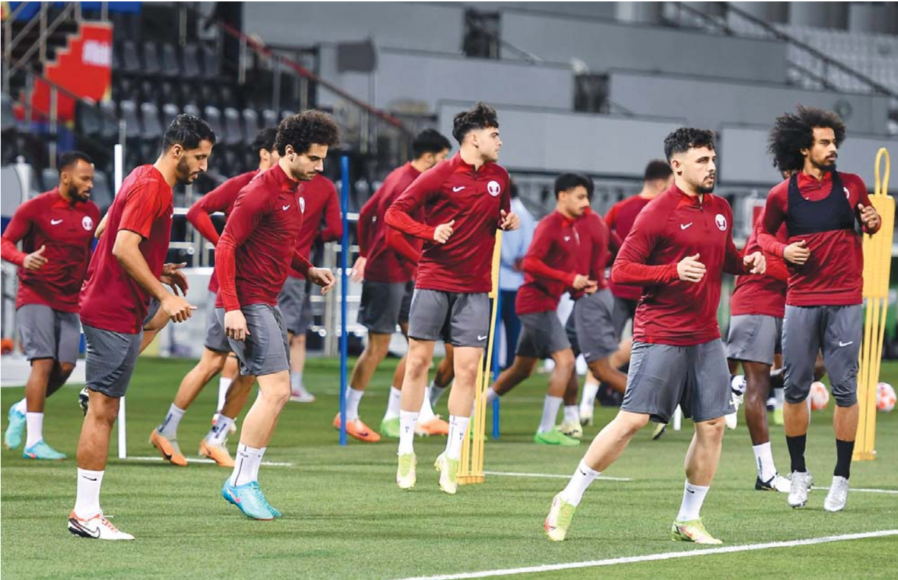
Qatar players train at the Jassim Bin Hamad Stadium yesterday, on the eve of their joint FIFA World Cup 2026 and AFC Asian Cup 2027 qualification match against Kuwait.