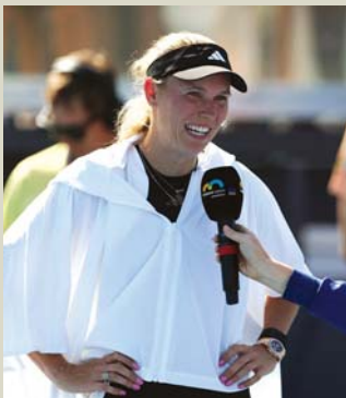
Caroline Wozniacki of Denmark

Miami: Fans gave Simona Halep a warm welcome back to tennis at the Miami Open on Tuesday in her first match back from a doping suspension but the Romanian received a frostier reception from former world number one Caroline Wozniacki. There were plenty of cheers and chants of "Si-Mon-ah. Si-Mon-Ah" from excited flag-waving fans during the wildcard's 1-6 6-4 6-3 loss to Spain's Paula Badosa, who also complimented the twice Grand Slam champion after the match. But Halep's return on a wildcard did not sit well with Wozniacki. "I've been very outspoken in the past how I feel about doping and all of that," said Wozniacki, adding that she likes Halep. "I have always