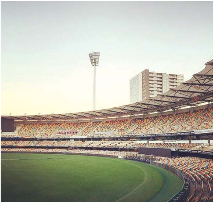
A view of the Gabba cricket stadium in Brisbane.