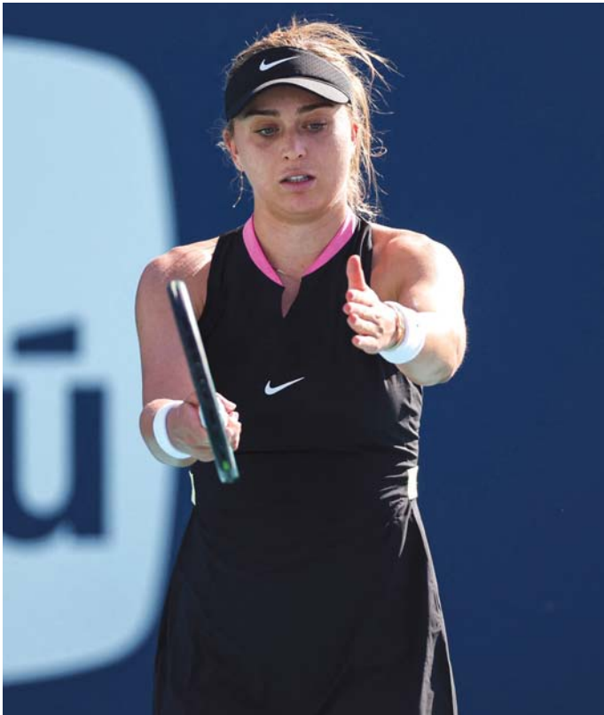
Paula Badosa of Spain reacts during her match against Simona Halep of Romania at the Miami Open.

Badosa three times as a small but excited crowd chanted "Si-Mon-ah. Si-Mon-Ah". While Halep has won many tournaments, including two grand slams she insisted Tuesday's return will stand out as a special moment in her career. "It feel really good," said Halep. "I had emotions, positive emotions to see the crowd supporting me was so nice and gave me a lot of energy and the level of tennis was pretty good, unexpected I think, for most of the people. "It is a special day. "I would say this day is going to stay very special for me. "Of course, I have many results in the past, big results but here is something more than tennis, it is something personal." The 32-year-old Romanian